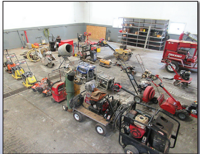
CONTRACTORS AND SHOP TOOLS

For Complete Listing Please See Our Photo Library at www.hunyady.com !