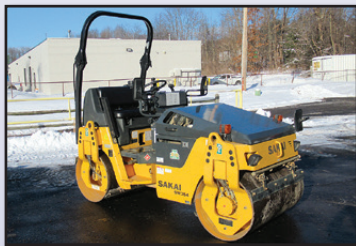
'18 SAKAI SW354

2018 SAKAI Model SW354 Tandem Vibratory Roller, s/n 45W78-30153C, powered by Kubota diesel engine, equipped with 47.5" smooth drums, drum vibrator selector, spray system, and ROPS post. In very good condition. (Meter Reads 691 Hours) (Purchased New)