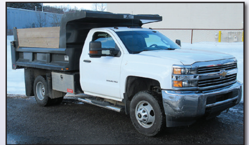
'16 CHEVY 3500 HD 4X4

powered by Vortec 6.0L gas engine and automatic transmission, equipped with Rugby 9' steel landscape dump body with wood sideboards, electric dump hoist, tow package, dual fuel tanks, dual rear wheels, under body storage box, running boards, power windows, locks, and mirrors, cruise control, air conditioning, and 235/80R17 tires. In good condition with good tires. (Odometer Reads 107,846 Miles)