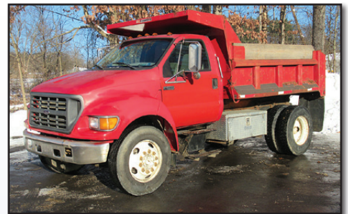
'00 FORD F-650XL

powered by Cat 7.0L diesel engine and 7 speed transmission, equipped with 10' steel dump body with chute, PTO hoist, 17,500 lb rear and 8,500 lb front axle, 26,000 lb GVWR, hydraulic brakes, tow package with electric, under body storage box, air conditioning, and 10R22.5 tires. In good condition with good tires. (Odometer Reads 113,068 Miles) (Zero Miles on New Clutch and Slave Cylinder - Installed October 2021)