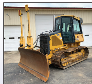
'07 JOHN DEERE 650JLT

2007 JOHN DEERE Model 650JLT Crawler Tractor, s/n 147815, powered by John Deere diesel engine and hydrostatic transmission, equipped with 6-way blade, Trimble GCS600 laser grade control system, enclosed ROPS cab with heat and air conditioning, and 19.5" SBG pads. In good condition with good undercarriage. (Meter Reads 2,976 Hours) (Purchased New)