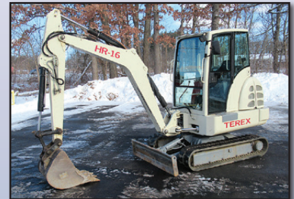
'04 TEREX HR-16

2004 TEREX Model HR-16 Mini Hydraulic Excavator, s/n 35813955, powered by Mitsubishi diesel engine, equipped with 5'3" dipper stick, dual auxiliary hydraulics, swing boom, Terex 24" digging bucket, 60" backfill blade, control pattern selector, enclosed ROPS cab with heat, and rubber tracks. In good condition with good tracks. (Meter Reads 003,740 Hours)