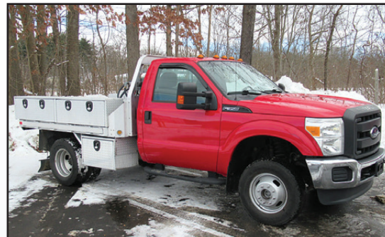
'14 FORD F-350XL 4X4

powered by 6.2L gas engine and automatic transmission, equipped with 9' aluminum flatbed with side boxes and