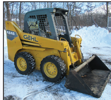
06 GEHL 4840

2006 GEHL Model 4840 Skid Steer Loader , s/n 408640, powered by Deutz diesel engine, 69" general purpose bucket, high flow auxiliary hydraulics, ROPS canopy, and 10.50x16 tires. In good condition with good tires. (Meter Reads 4,496 Hours) (Purchased New)