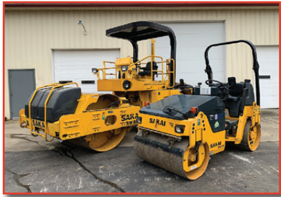
'18 SAKAI SW354 AND '10 SAKAI SW800

1440 COWPATH RD. • HATFIELD, PA 19440 215/361-9099 • Fax: 215/361-9212 www.hunyady.com