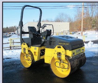
'11 BOMAG BW138AD

2011 BOMAG Model BW138AD Tandem Vibratory Roller, s/n 101650172029, powered by Deutz diesel engine, equipped with 54" smooth drums, dual frequency vibration, spray system, and ROPS post. In good condition. (Meter Reads 00,923 Hours) (Purchased New)