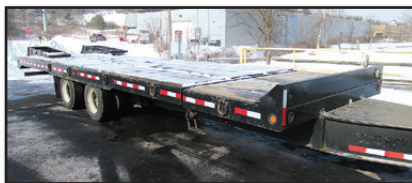
'10 INTERSTATE 20 TON TILT DECK

equipped with 4' front stationary deck, 24' tilt rear deck, 6'6" ramps, 102" overall width, spring suspension, chain dogs, and 215/75R17.5 tires. In good condition with good tires.