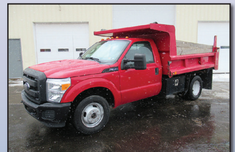
'11 FORD F-350XL

powered by V-8 gas engine and automatic transmission, equipped with 9' steel landscape dump body with wood sideboards, electric dump hoist, tow package, cruise control, air conditioning, and 245/75R17 tires. In good condition with good tires. (Odometer Reads 246,117 Miles) (Purchased New)