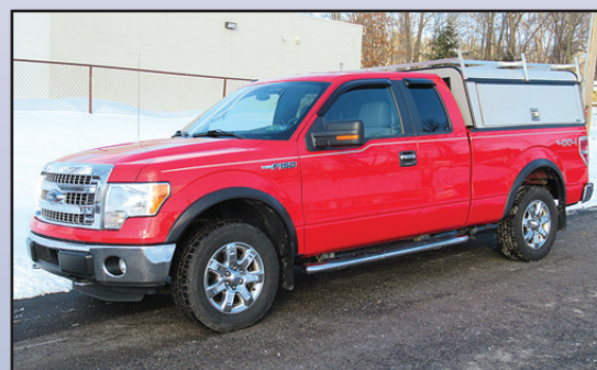
'14 FORD F-150XLT 4X4

powered by 5.0L gas engine and automatic transmission, equipped with 6'5" bed with aluminum cap with side boxes,