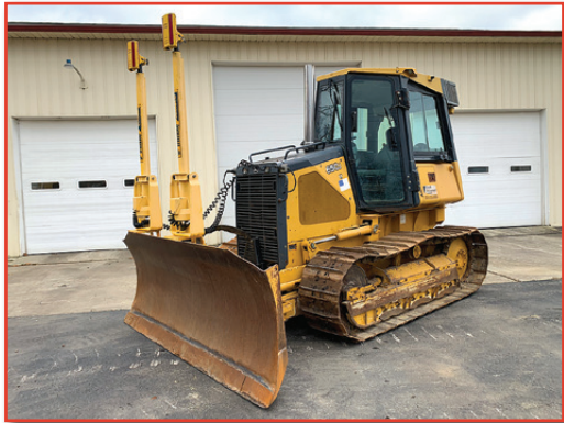
'07 JOHN DEERE 650JLT

PRE-SORTED FIRST CLASS MAIL US POSTAGE PAID UPPER DARBY, PA PERMIT #45