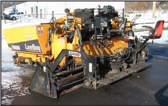
'14 LEEBOY 7000B

2014 LEEBOY Model 7000B Crawler Paver, s/n 109750, powered by Kubota diesel engine, equipped with Legend 8' to 13' propane heated vibratory screed, slope and grade and crown controls, and spray system. In good condition with good undercarriage. (Meter Reads 1,685 Hours) (Purchased New)