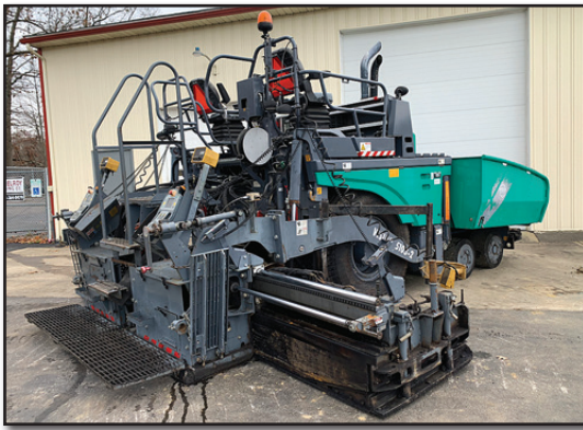
'15 VOGELE VISION 5103-2

2015 VOGELE Model Vision 5103-2 Rubber Tired Paver, s/n 09830121, powered by Cummins QSB6.7, 170HP diesel engine, equipped with Carlson EZIV08, 8'6" – 14'6" electric heated vibratory screed, VogelegoErgoPlus screed controls with umbilical remote, Topcon System Four sonic grade controls, Topcon laser grade control ready, power assist drive bogie, spray down system, and 16.00-24 tires. In good condition with good tires. (Meter Reads 2,127 Hours) (Additional 1' Screed Extension and 24" Wedge Curb Attachment) (Purchased New)