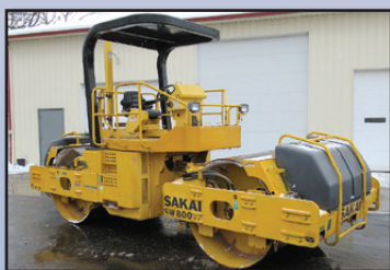
'10 SAKAI SW800

2010 SAKAI Model SW800 Tandem Vibratory Roller, s/n VSW19-10109, powered by Isuzu diesel engine and hydrostatic transmission, equipped with 67" smooth drums, dual frequency vibration, drum vibration selector, spray system, and ROPS canopy. In good condition. (Meter Reads 4,294 Hours) (Purchased New)