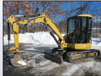
'05 CAT 304CR

2005 CATERPILLAR Model 304CR Mini Hydraulic Excavator, s/n NAD04011, powered by Cat diesel engine, equipped with 4'6" dipper stick, auxiliary hydraulics, swing boom, Cat 24" digging bucket, 78" backfill blade, control pattern selector, enclosed ROPS cab with heat and air conditioning, and rubber tracks. In good condition with good tracks. (Meter Reads 04,534 Hours)