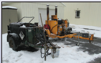
LEEBOY 150 TACK DISTRIBUTOR AND REEVES TAR POT

LEEBOY Model 150 Tack Distributor/ Crack Sealer, s/n 150T-46872, powered by Honda gas engine, equipped with dual propane burners and 205/75R14 tires. In good condition with good tires. (Purchased New)