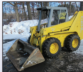
99 GEHL 6635DXT

1999 GEHL Model 6635DXT Skid Steer Loader , s/n 12015, powered by Deutz diesel engine, equipped with 72" general purpose loader bucket, high flow auxiliary hydraulics, ROPS canopy, and 12x16.5 tires. In good condition with good tires. (Meter Reads 5,744 Hours) (Purchased New)