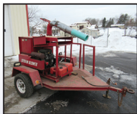
TGMI STRAW BLOWER

CHICAGO PNEUMATIC 175CFM Portable Air Compressor, s/n CE14667, powered by John Deere diesel engine. In good condition with good tires.