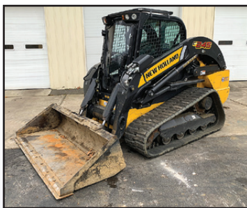
19 NEW HOLLAND C245

2019 NEW HOLLAND Model C245 Crawler Skid Steer Loader , s/n NKM460013, powered by CNH 90HP diesel engine, equipped with 78" general purpose loader bucket with bolt-on cutting edge, hydraulic coupler, high flow auxiliary hydraulics, 10-pin electric connector, enclosed ROPS cab with heat and air conditioning, and 18" rubber tracks. In very good condition with good tracks. (Meter Reads 0,556 Hours) (Purchased New)