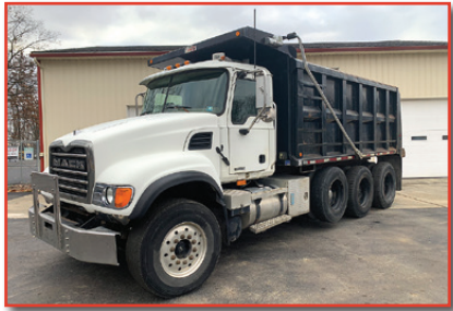
'07 MACK CV713 GRANITE