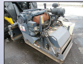
14 ROADHOG RH2460-W

16" Cold Planer Attachment , with umbilical remote. (Purchased New) • SANDVIC BR623 Hydraulic Demolition Hammer , mounted on skid steer plate • WOODS CPR720ST, 72" Hydraulic Angle Ground Preparator • LOWE Model 1650E Hydraulic Post Hole Digger w/10" auger • MCMILLEN 2030 5'6" Trencher Attachment , with rock teeth • 66" Hydraulic Rock Hound • BRADCO PowR Sweep 84" Manual Angle Hydraulic Broom Attachment • SWEEPSTER BDC74M, 74" Hopper Broom • (2) SWEEPSTER 21572M-0022, 72" Hopper Brooms • SWEEPSTER 20572P-0022 Hopper Broom (Parts) • 65" Hydraulic Broom Attachment • 46" Skid Steer Forks (Reserved For Use During Loadout Until Tuesday, March 8th at 12:00 Noon) • 72" General Purpose Bucket , with teeth • 78" General Purpose Bucket , with cutting edge • 70" Bolt-On Tooth Edge • 10' Fabric Roll Spear (Fork Pockets) • BROYHILL 68" 3 Point Hitch Aerator • RAHN Model PHGL650G 3-Point Hitch Groomer • OHIO 3 Gang 24"x52" Tow Behind Rollers