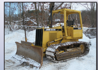
'94 JOHN DEERE 650G

1994 JOHN DEERE Model 650G Crawler Tractor, s/n 798282, powered by John Deere diesel engine and powershift transmission, equipped with 6-way blade, Topcon System Five laser grade control system, ROPS canopy, and 24" SBG pads. In good condition with good undercarriage. (Meter Reads 09,449 Hours) (Purchased New)