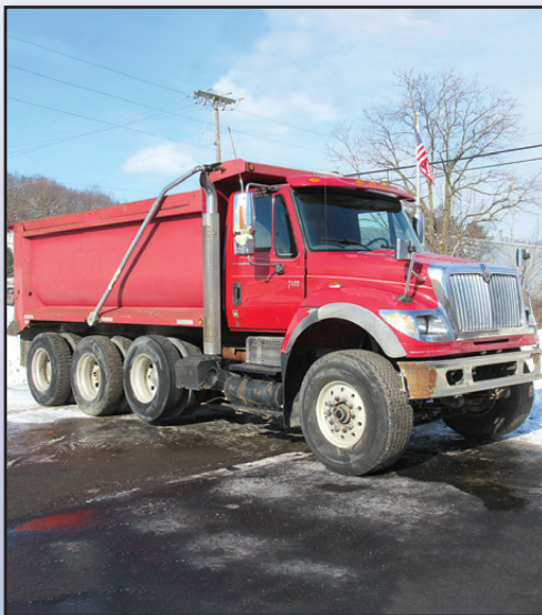
'05 INTERNATIONAL 7600

powered by Cat C-13 Acert diesel engine and Fuller 8LL, 10 speed transmission, equipped with Ox 16' tub style steel dump body with asphalt apron and electric tarp, 46,000 lb rears and 20,000 lb front and lift axles, 66,000 lb GVWR, block/beam suspension, 3-stage engine brake, aluminum wheels, heated mirrors, cruise control, air conditioning, 425/65R22.5 front, 11R24.5 rear, and 11R22.5 lift tires. In good condition with fair to good tires. (Odometer Reads 262,558 Miles) (Purchased New)