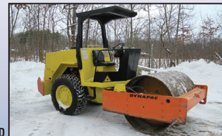
89 DYNAPAC CA15II D

1989 DYNAPAC Model CA15II D Vibratory Compactor , s/n 598203, powered by Cummins diesel engine and hydrostatic transmission, equipped with 66" smooth drum, drum drive, dual frequency vibration, ROPS canopy, and 14.9x24 tires. In good condition with good tires. (Meter Reads 03,867 Hours)