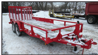
'90 INTERNATIONAL U-18

equipped with 18' x 80" wood deck, 4'6" ramp gate, 13" side rails, spring suspension, and 225/75R15 tires. In good condition with very good tires.