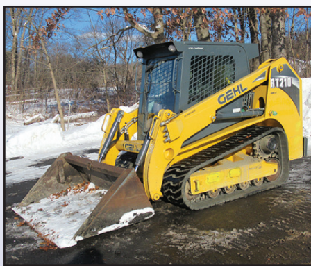
17 GEHL RT210 GEN3

2017 GEHL Model RT210 Gen3 Crawler Skid Steer Loader , s/n 921854, powered by Yanmar Tier IV, 72HP diesel engine and 2 speed transmission, equipped with 78" general purpose loader bucket, hydraulic coupler, high flow auxiliary hydraulics, 9-pin electric connector, enclosed ROPS cab with heat and air conditioning, and 18" rubber tracks. In very good condition with good tracks. (Meter Reads 1,519 Hours) (Purchased New)