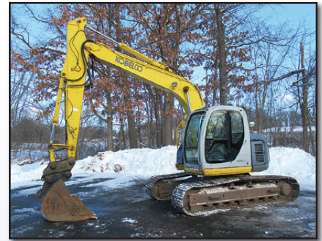
'05 KOBELCO SK135 SRLC-1E

2005 KOBELCO Model SK135 SRLC-1E Hydraulic Excavator, s/n YH03-02521, powered by Isuzu diesel engine, equipped with 9'10" dipper stick, Geith hydraulic coupler, auxiliary hydraulics, CP 42" digging bucket, enclosed ROPS cab with heat and air conditioning, and 24" TBG pads. In good condition with good undercarriage. (Meter Reads 07,368 Hours) (Purchased New)