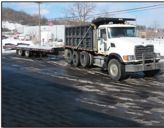
'07 MACK CV713 WITH 20 TON TILT DECK

40,000 lb rears and 18,000 lb front axle, camelback suspension, pintle hitch with air and electric, cruise control, air conditioning, 385/65R22.5 front, 11R24.5 rear, and 11R22.5 lift tires. In good condition with good tires. (Odometer Reads 263,406 Miles)