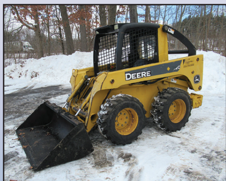
08 JOHN DEERE 320

2008 JOHN DEERE Model 320 Skid Steer Loader , s/n 152118, powered by John Deere diesel engine, equipped with general purpose loader bucket, standard auxiliary hydraulics, (8) rear pocketbook counterweights, ROPS canopy, and 12x16.5 tires. In good condition with good tires. (Meter Reads 3,305 Hours) (Purchased New) (Reserved For Use During Loadout Until Tuesday, March 8th at 12:00 Noon)