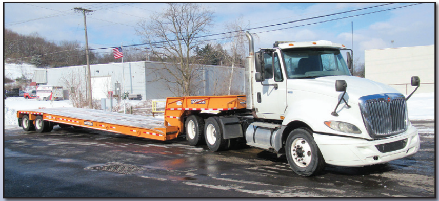
'12 INTERNATIONAL PROSTAR + 122 AND ROGERS 25 TON

1973 ROGERS Model THPG25-SSF22-40-15, 25 Ton Tandem Axle Paver Special Lowboy Trailer , equipped with hydraulic detachable ground bearing gooseneck, 64,900 lb GVWR, 22' wood sloped deck, 7'9" steel rear deck, 96" width, beam suspension, and 235/75R17.5 tires. In good condition with good tires.