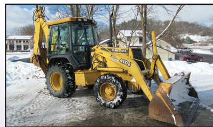
99 JOHN DEERE 410E 4X4 E-HOE

1999 JOHN DEERE Model 410E, 4x4 Tractor Loader Extend-A-Hoe , s/n 871842, powered by John Deere diesel engine and shuttle transmission, equipped with general purpose loader bucket, 24" digging bucket, rear manual coupler, rear auxiliary hydraulics, enclosed ROPS cab with heat, 12.5/80-16 front and 19.5Lx24 rear tires. In good condition with good tires.