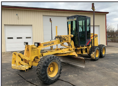
01 NEW HOLLAND RG80

2001 NEW HOLLAND Model RG80 Articulated Motor Grader , s/n 85506086, powered by New Holland 5.0L diesel engine and powershift transmission, equipped with 10' moldboard, Topcon System Five laser grade control and Topcon sonic grade control systems, front scarifier, enclosed ROPS cab with heat, and 15x19.5 tires. In good condition with good tires. (Meter Reads 2,825 Hours)