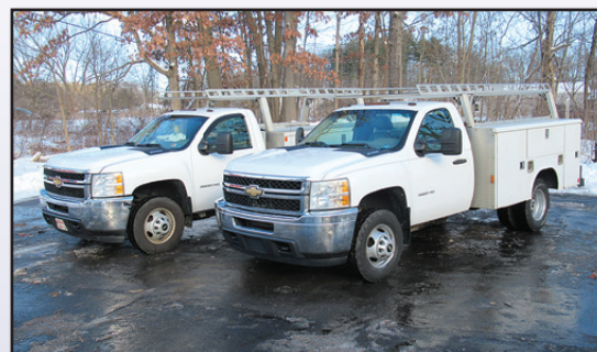
'14 CHEVY 3500HD AND '11 CHEVY 3500 HD 4X4

powered by Vortec 6.0L gas engine and automatic transmission, equipped with 8' open utility body,