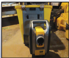
TRIMBLE TOTAL STATION

TRIMBLE RTS873 Total Station • TRIMBLE Total Station Layout Manager • NIKON DTM330 Total Station • LEICA Bugby 820 Rotating Laser • SPECTRA Precision LL300S Rotating Laser • (2) NIKON AC-2S Auto Levels (1 UNUSED) • NIKON AZ-15 Auto Level • CST/BERGER 24X Level • NIKON NE-20S Transit