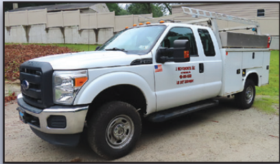
'15 FORD F-250 4X4

2015 FORD Model F-250XL Super Duty 4x4 Quad Cab Utility Truck , powered by 5.0L gas engine and automatic transmission, equipped with Knapheide 8' open utility body with spray-on liner, side boxes, aluminum material rack with ratchet tie downs, tow package, running boards, power windows, locks, and mirrors, cruise control, air conditioning, and 245/75R17 tires. In good condition with good tires. (Odometer Reads 120,120 Miles) (Purchased New)