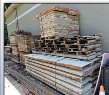
SYMONS AND CURB FORMS

(971 SF+/-) SYMONS Concrete Forms Consisting of: (3) 2' x 8' • (37) 2' x 5' • (43) 2' x 4' • (28) 2' x 3' • (2) 20" x 6' • (1) 20" x 4' Filler Panels: (2) 18" x 6' • (2) 10" x 4' • (4) 4" x 4' • (1) 8" x 3' • (6) 4" x 3' (1 Pallet) SYMONS Form Aligners • Assorted SYMONS Form Accessories • (46) 18" x 10' Curb Forms • (18) 18" x 10' Radius Curb Forms • Form Lumber • (10) Decorative Stone Concrete Stamp Forms