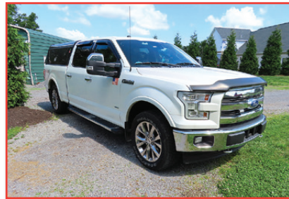
'17 FORD F-150 4X4