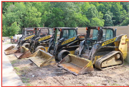
NEW HOLLAND SKID LOADERS

1440 COWPATH RD. • HATFIELD, PA 19440 215/361-9099 • Fax: 215/361-9212 www.hunyady.com