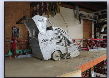
SOFF-CUT AND ALLEN SCREED