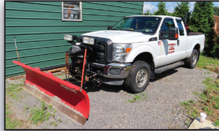
'12 FORD F-250 4X4

and mirrors, cruise control, air conditioning, and 265/70R17 tires. In good condition with good tires. (Odometer Reads 151,063 Miles)