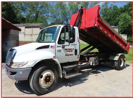
'07 IHC HOOK LIFT

PRE-SORTED FIRST CLASS MAIL US POSTAGE PAID UPPER DARBY, PA PERMIT #45