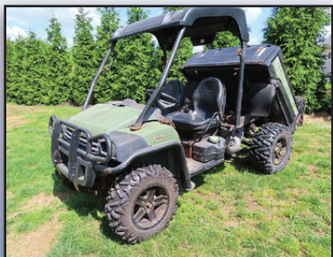
'17 JOHN DEERE GATOR

2017 JOHN DEERE Model 855D Gator ATV , powered by JD 3 cylinder diesel engine and shuttle transmission, equipped with front brush guard, hitch receiver, rollbar, electric hydraulic dump body, and 27x11.00R14 tires. In fair to good condition with good tires. (Meter Reads 782 Hours) (Two Spare Tires)