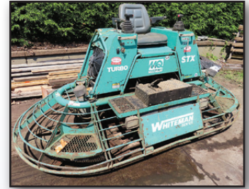
'04 WHITEMAN RIDE-ON

• Rattle Stick Cordless Bull Float Vibrator • Small Quantity Decorative Concrete Stamps • (5) 4' and (1) 10' Bull Floats and Bull Float Handles • 4' Fresno Trowel