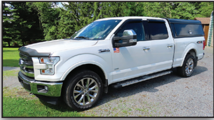
'17 FORD F-150 4X4

2017 FORD Model F-150 Lariat 4x4 Crew Cab Pickup Truck , powered by 3.5L, Eco Boost gas engine and automatic transmission, equipped with 7' bed with Leer bed topper with side boxes, tow package, running boards, alloy wheels, power windows, locks, and seats, power heated mirrors, sunroof, cruise control, air conditioning, and 275/55R20 tires. In good to very good condition with good to very good tires. (Odometer Reads 074,783 Miles) (Purchased New)