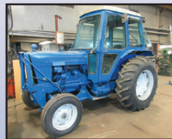
'80 FORD 5600

1991 KUBOTA Model L2650GST, 4x4 Utility Tractor , s/n 80458, powered by Kubota 29HP diesel engine and Glide Shift transmission, equipped with 3-point hitch, rear PTO, mid PTO, turf tires, rollbar, 27-8.50-15 front and 355/80D20 rear tires. In good condition with fair to good tires. (New Clutch Package)