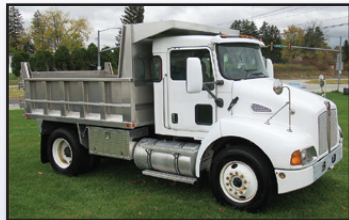
'05 KENWORTH T300

brakes, cruise control, air conditioning, and 275/80R22.5 tires. In good condition with good tires. (New/Unused Dump Body and Hoist, PTO, and Hydraulic Pump)