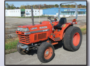
'91 KUBOTA L2650GST 4X4

AGRATOR 48" Tiller, PTO powered • 72" York Rake