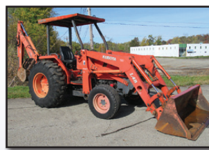
'06 KUBOTA L48 4X4

1991 KUBOTA Model L2650GST, 4x4 Utility Tractor , s/n 80458, powered by Kubota 29HP diesel engine and Glide Shift transmission, equipped with 3-point hitch, rear PTO, mid PTO, turf tires, rollbar, 27-8.50-15 front and 355/80D20 rear tires. In good condition with fair to good tires. (New Clutch Package)