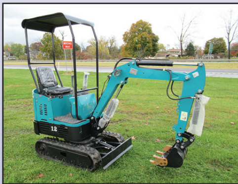
'21 AGROTK YM12

UNUSED 2021 AGROTK Model YM12 Mini Excavator , s/n UM1221122101, powered by CMXX 420cc gas engine and hydraulic drive, equipped with 32" dipper stick with stiff arm bracket, 16" digging bucket, auxiliary hydraulics, 36" backfill blade, 36" overall width, canopy, and 7" rubber tracks. In very good condition with very good tracks.