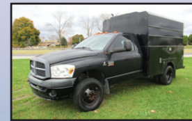
'09 RAM 3500 HD

2009 RAM Model 3500 HD Utility Truck , powered by Cummins 6.7L diesel engine and 6 speed transmission, equipped with Stahl 9' enclosed walk-in utility body, tow package with electric, dual rear wheels, air conditioning, and 235/80R17 tires. In good condition with good tires.