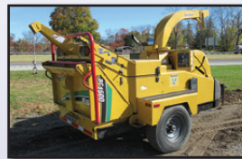
'13 VERMEER BC1500