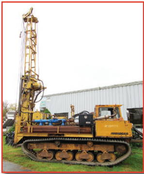
96 ACKER SOIL MAX

PRE-SORTED FIRST CLASS MAIL US POSTAGE PAID UPPER DARBY, PA PERMIT #45