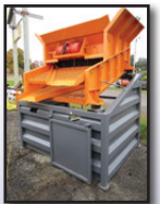
2-DECK STATIONARY VIBRATORY SCREEN

2-Deck Stationary Vibratory Screen, 6' x 52" screen with 1" opening, 5' x 52" screen with 2" opening, electronic vibrator • TIMCO Skid Mounted Straw Blower, Briggs & Stratton Vanguard 31HP, V-Twin gas engine, electric start, and 32" x 64" skid • (22) UNUSED SCOUTMAT 4' x 8' Landscape Ground Cover Panels • SWENSON Stainless Steel, 8' Hydraulic V-Box Spreader • SWENSON Stainless Steel, 8' Hydraulic Tailgate Spreader • HTC Stainless Steel, 8' Hydraulic Tailgate Spreader • 11' Snow Plow and Frame, power angle • (3) 10' Snow Plows and Frames, power angle • AIRFLOW 76" Snow Plow, with quick hitch frame • 6' Plow and Frame, power angle • (4) MEYER Electric/Hydraulic Snow Plow Pumps, (3) E47 and (1) E60