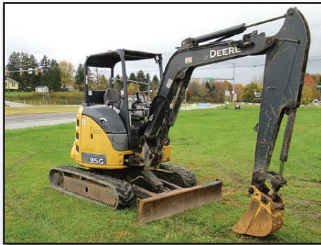
'15 JOHN DEERE 35G

2015 JOHN DEERE Model 35G Mini Excavator , s/n 273563, powered by JD diesel engine and hydraulic drive, equipped with 68" dipper stick, 12" digging bucket, swing boom, manual coupler, auxiliary hydraulics, 68" backfill blade, ROPS canopy, and 12" rubber tracks. In good condition with good tracks.