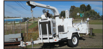
'98 BANDIT 250XP

2003 RAYCO Model RG1635D Portable Stump Grinder , s/n 1R91513173W210009, powered by Deutz diesel engine, equipped with hydraulic angle, hydraulic travel, and pintle tow. In good condition with good tires.