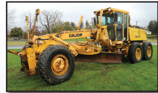
'99 GALION 850B

1985 ARROW Model HJ1250R Mobile Drop Hammer , s/n 3149, powered by JD diesel engine and direct drive manual transmission, equipped with side shift hammer, cable operated hammer, and 8.75-16.5 tires. In good condition with good tires.