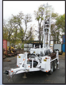
'91 CME 45C