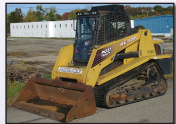
'05 ASV RC100