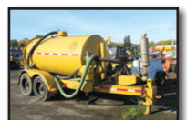
OIRON CLAD VACUUM TRAILER

6 lug • 56 Gallon Fuel Tank • BUYERS Gang Box • UNUSED 3/8" and 5/16" Chain and Ratchet Binders • Silt Fence