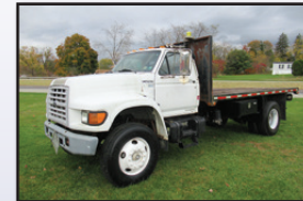
'99 FORD F-800

1999 FORD Model F-800 Single Axle Flatbed Truck , powered by Cummins ISB215, 5.9L, 215HP diesel engine and 6 speed transmission, equipped with 16" flatbed with stake pockets, (2) under body toolboxes, 21,000 lb rear axle, 12,000 lb front axle, 33,000 lb GVWR, spring suspension, air brakes, and 11R22.5 tires. In good condition with good tires.