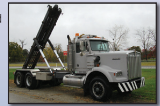
'94 KENWORTH W900