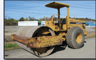
'95 GALION D784