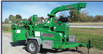
'05 BANDIT 1590XP