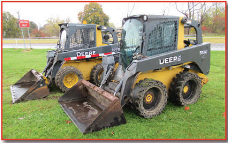
13 JD 320D AND 12 JD 318D

1440 COWPATH RD. • HATFIELD, PA 19440 215/361-9099 • Fax: 215/361-9212 www.hunyady.com