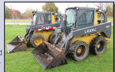
JD 320D AND 318D