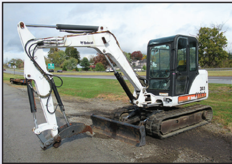
'02 BOBCAT 341D

2002 BOBCAT Model 341D Mini Excavator , s/n 233211972, powered by Kubota diesel engine and hydraulic drive, equipped with 70" dipper stick, 24" digging bucket, swing boom, auxiliary hydraulics, 76" backfill blade, enclosed ROPS cab, and 15.5" rubber tracks. In good condition with fair to good tracks.