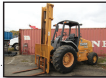
'12 CASE 586H 6,000 LB

2014 JLG Model 1930ES Electric Scissors Lift , s/n 200229954, powered by 24V DC battery and hydraulic drive, equipped with 18'8" platform height, 500 lb platform capacity, 6' - 10' extendable platform, and 30" overall width. In good condition.