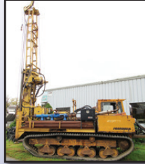
'96 ACKER SOIL MAX