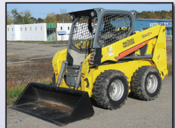
'14 WACKER NEUSON SW24