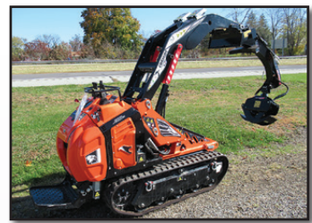
'21 CORMIDI C1200 (LOG LOADER ATTACHMENT SOLD SEPARATELY)

UNUSED 2021 TOPCAT 6' Landscape Rake , with wireless remote • (2) UNUSED 2021 TROJAN SD1160 Hydraulic Augers , with 18" and 9" pins • UNUSED WOLVERINE 72" Hydraulic Tiller • UNUSED TMG 8' Dozer Blade , with steel cutting edge • UNUSED MEYER Lot Pro LD, 7.5' Snow Plow Blade and Frame , with power angle • UNUSED 76" Snow Pusher • UNUSED DANUSER SM40 Drop Hammer/Post Pounder • BTI TB285 Hydraulic Hammer • UNUSED 6' Skeletal Bucket , with hydraulic thumbs • WOLVERINE 72" Grapple Bucket , with hydraulic thumb • MB TKH 9' Sweeper Broom , with hydraulic angle • 78" and 67" Tooth Buckets • UNUSED 48" Fork Attachment • (2) 70" and 40" Fork Attachments • 44" Fork Attachment • Bagger Attachment , with hopper and screw auger