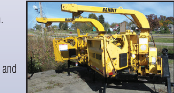
(2) '09 BANDIT 90XP (PTO)