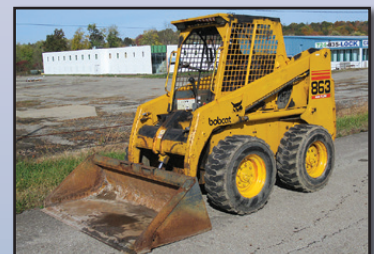
'99 BOBCAT 863