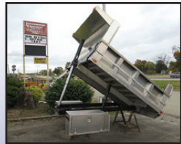
UNUSED ALUMINUM DUMP BODY

UNUSED 8'6" Aluminum Dump Body , equipped with subframe and front mount hoist, 12V pump, and storage bins. (Fits 60" Cab to Axle Dimension) 9' Aluminum Utility Body (Fits Single Wheel Pickup) (2) UNUSED 9' x 17" Flatbed Bodies , equipped with wooden deck, headache rack, and tiedowns.