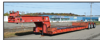
ROGERS 40 TON EXTENDABLE TRI-AXLE

with ground bearing detachable gooseneck, 22' - 34'6" extendable load deck, 8' width, 9' deck over wheels, flip up 3rd axle, Honda gas pony motor, aluminum wheels, outriggers, chain dogs, and 255/70R22.5 tires. In good condition with good tires. (New 28,000 lb Axles, Bearings, and Brakes)