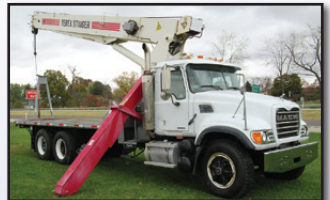
'02 MACK CV713 WITH 23.5 TON BOOM