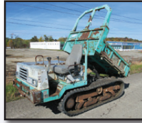
'99 IHI IC30

1991 CME Model 45C Portable Soil Test Drill , s/n 233-014, powered by Wisconsin V-4 gas engine, equipped with 6" and 4" augers, pintle tow, mounted on tandem axle carrier with 8.75R16.5 tires. In fair condition with fair tires.