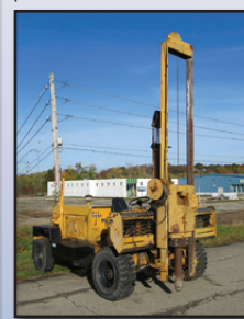
'85 ARROW HJ1250R

WACKER NEUSON RTSC2 Articulated Trench Compactor , s/n unknown, Kohler diesel engine, 32" padfoot drums, wireless remote.