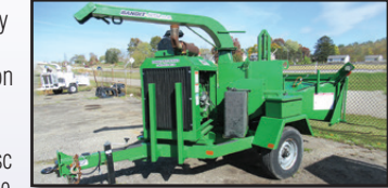
'97 BANDIT 250XP