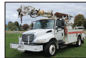
'04 INTERNATIONAL 4400

2004 INTERNATIONAL Model 4400 SBA Single Axle Digger Derrick , powered by Int'l DT466 diesel engine and Allison automatic transmission, equipped with Altec DM45T digger derrick, s/n 0304DY0384, 4-section boom 26,790 lb, pole grabs, rear hydraulic outlet, Reading 14'6" line body, front bumper winch, engine brake, differential lock, air brakes, and 11R22.5 tires. In good condition with good tires.