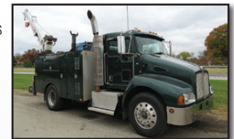
'08 KENWORTH T300 SERVICE

(12) 20 Cubic Yard Dumpster Containers • (5) 30 Cubic Yard Dumpster Containers