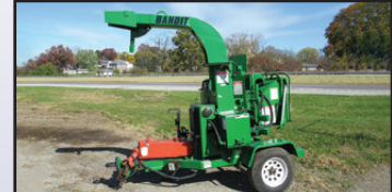
'08 BANDIT 90XP (PTO)