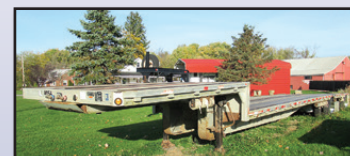
'00 REITNOUER SPREAD AXLE

2000 REITNOUER Aluminum Spread Axle Step Deck Trailer , equipped with 37' x 8' lower deck, 10' upper deck, 122" spread axle, air ride suspension, 100,000 lb GVWR, ratchet straps, aluminum wheels, and 255/70R22.5 tires. In good condition with good tires.