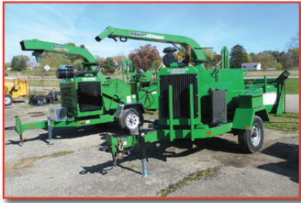
BANDIT 1590XP AND 250XP