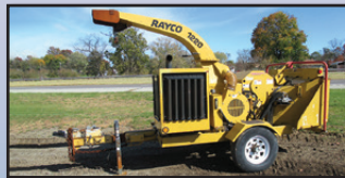
'12 RAYCO 1220

1998 BANDIT Model 250XP Portable Disc Chipper , s/n 13281, powered by JD 100HP diesel engine and live hydraulics, equipped with 12" capacity disc chipper, rotating discharge chute, and 2235/85R16 tires. In good condition with very good tires.