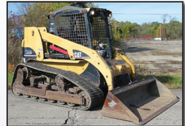
'05 CAT 267B