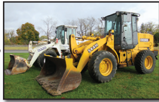
JD 544H AND 544G

1968 CATERPILLAR Model 977K Crawler Loader , s/n 11R513, powered by Cat diesel engine, equipped with ROPS canopy and 18" TBG pads. In fair condition. (Not Running; No Torque Converter; Will Sell With Used Torque Converter But Not Installed)