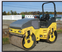
'12 BOMAG BW138AD-5