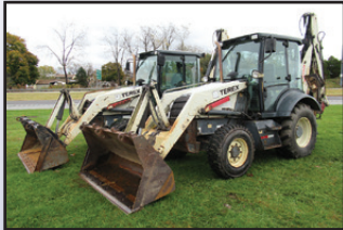
TEREX 760B 4X4 EXTEND-A-HOES