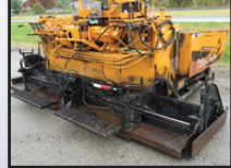
'96 LEEBOY L700R

1997 FORD Model F-800 Single Axle Asphalt Distributor Truck , powered by Cummins 5.9L diesel engine and 5 speed transmission with 2 speed rear, equipped with Rosco Maximizer II 2,000 gallon asphalt tank, 11'9" folding rear spray bar, 33,000 lb GVWR, air brakes, and 11R22.5 tires. In good condition with fair to good tires.