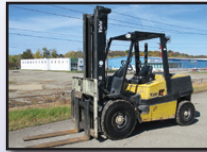
'07 YALE GDP100M 9,600 LB