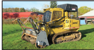
'14 RAYCO C100LGP

2012 RAYCO Model 1220 Portable Drum Chipper , s/n 1R9871318CW210013, powered by Kubota 100HP diesel engine, equipped with 12" capacity drum chipper, auto feed, rotating discharge chute, and 235/80R16 tires. In good condition with good tires.