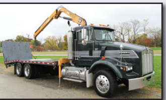
'94 KENWORTH WITH 7,700 LB KNUCKLEBOOM