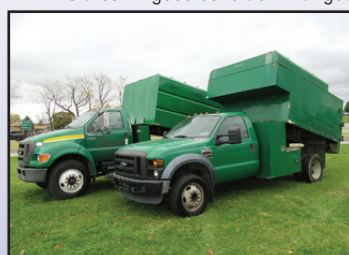
'07 FORD F-650XL AND '09 FORD F-550XL

2009 FORD Model F-550XL Super Duty Chipper Dump Truck , powered by Powerstroke 6.4L diesel engine and automatic transmission, equipped with 11' chip dump body, 17,950 lb GVWR, behind cab cross tool compartment, tow package, and 225/70R19.5 tires. In good condition with fair tires.