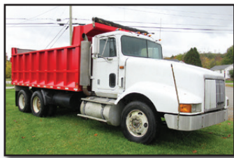
'93 INTERNATIONAL 9400

1993 INTERNATIONAL Model 9400 Tandem Axle Dump Truck , powered by Cummins N14-350E, 350HP diesel engine and Eaton Fuller 9 speed transmission, equipped with 16" steel dump body, air gate, air ride suspension, power divider, Jacobs engine brake, and 295/75R22.5 tires. In good condition with good tires. (New Dump Hoist)