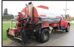
ROSCO MAXIMIZER II 2,000 GALLON

2012 BOMAG Model BW138AD-5 Tandem Double Drum Vibratory Roller , s/n C1232, powered by Honda GX390 gas engine with electric start and hydrostatic transmission, equipped with 25.5 smooth drum and water spray system. In excellent condition.