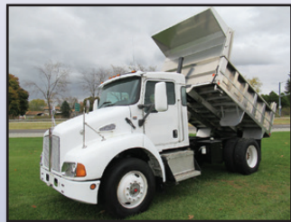
'05 KENWORTH T300

2005 KENWORTH Model T300 Single Axle Dump Truck , powered by Cummins ISC300, 300HP diesel engine and Eaton Fuller RT8709B, 9 speed transmission, equipped with 10' aluminum dump body with 2-way gate, 21,000 lb rear axle, 12,000 lb front axle, 33,000 lb GVWR, air/spring suspension, tow package with air, air