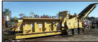
'00 BANDIT 3680 BEAST