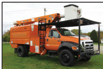
'10 FORD F-750XL WITH ALTEC 55'

2010 FORD Model F-750XL Super Duty Single Axle Forestry Bucket Truck , powered by Cummins ISB240, 240HP diesel engine and 6 speed transmission, equipped with Altec LRV55, 55' aerial lift, s/n 1210CB1319, 400 lb basket with hydraulic tool outlets, Altec 11' chipper dump body, 33,000 lb GVWR, spring suspension, tow package, hydraulic brakes, cruise control, and 11R22.5 tires. In good condition with good to very good tires.