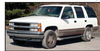
'98 CHEVY TAHOE 4X4

1998 CHEVROLET Model Tahoe 4x4 Sport Utility Vehicle , powered by V-8 gas engine and automatic transmission, equipped with leather interior, full power package, air conditioning, AM/FM CD, tow package, and 245/75R16 tires. In good condition with good tires. (Purchased New)