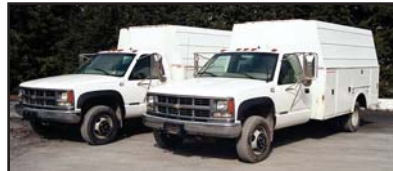
'99 CHEVY 4X4'S

1999 CHEVROLET Model 3500, 4x4 Utility Truck , powered by V-8 gas engine and 5 speed transmission, equipped with Stahl 11' walk-in utility body, side boxes, rear work lights, dual rear wheels, AM/FM stereo, pintle hitch, and LT225/75R16 tires. In good condition with fair tires. (Purchased New)