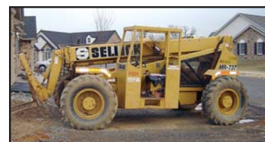
'88 SELLICK MR-737

1988 SELLICK Model MR-737, 7,000#, 4x4 Telescopic Rough Terrain Forklift , s/n 165058737, powered by Perkins diesel engine and powershift transmission, equipped with 37" maximum lift, 48" forks, 3-stage telescopic boom, 4-wheel steer, chassis tilt, 22,510# operating weight, and 13.00x24 tires. In fair to good condition with fair to good tires. 1996 JCB Model Robot 185 Skid Steer Loader , s/n SLP185SATE0746093, powered by Perkins 4 cylinder diesel engine and hydrostatic transmission, equipped with 66" general purpose loader bucket with bolt-on cutting edge, quick disconnect, auxiliary hydraulics, light package, and 12x16.5 tires. In good condition with good tires. (Purchased New)