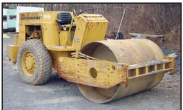
'87 DYNAPAC CA15D

VIBRO-PLUS Model CF43 Tow Behind Vibratory Sheepfoot Compactor , s/n 43CF437, powered by Deutz 3 cylinder diesel engine, equipped with 75" padfoot drum. In good condition.