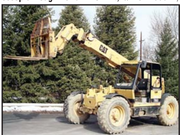
'97 CAT TH63

Backhoe Attachments: Digging Buckets: 36" • 24" • 18" • (2) 12" • Bucket Forks TELESCOPIC ROUGH TERRAIN FORKLIFTS AND SKID STEER LOADER 1997 CATERPILLAR Model TH63, 6,000#, 4x4 Telescopic Rough Terrain Forklift , s/n 3NN00674, powered by Cat 3054 diesel engine and powershift transmission, equipped with 41" max lift height, 48" forks, 3-stage telescopic boom, hydraulic quick disconnect with manual pin, 4-wheel steer, chassis tilt, light package, and 13.00x24 tires. In good condition with good tires. (Purchased New)