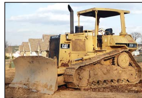
96 CAT D5HXL