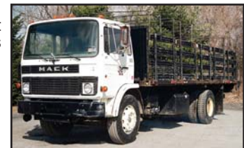
'86 MACK MS200P

1986 MACK/RENAULT Model MS200P Single Axle Cab Over Stake Body Truck , powered by Renault diesel engine and 5 speed transmission, equipped with 24' flatbed, stake sides, lift gate, spring suspension, ratchet tie-downs, and 11R22.5 tires. In good condition with good tires