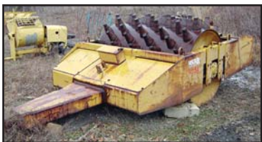
VIBRO PLUS CF43

VIBRO-PLUS Model CF43 Tow Behind Vibratory Sheepfoot Compactor , s/n 43CF437, powered by Deutz 3 cylinder diesel engine, equipped with 75" padfoot drum. In good condition.