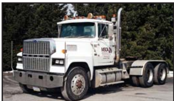
'86 FORD LTL9000

1986 FORD Model LTL9000 Tandem Axle Truck Tractor , powered by Cat 3406, 425HP diesel engine and Fuller Roadranger 15 speed transmission, equipped with double frame, wetline, 2-position Jake brake, spring suspension, air slide 5th wheel, aluminum front Budd wheels, (2) 105 gallon aluminum fuel tanks, aluminum headache rack with work lights, and 11R24.5 tires. In good condition with fair to good tires.