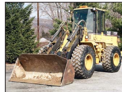
96 CAT IT28F