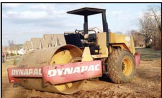
'96 DYNAPAC CA251D

1996 DYNAPAC Model CA251D Vibratory Compactor , s/n 58312923, powered by Cummins 5.9B diesel engine and hydrostatic transmission, equipped with 84" smooth drum, drum drive, ROPS canopy, and 23.1x26 tires. In good condition with good tires. (Purchased New) 1987 DYNAPAC Model CA15D Vibratory Compactor , s/n 2130S17, powered by John Deere 4239DF, 4 cylinder diesel engine and hydrostatic transmission, equipped with 66" smooth drum, drum drive, and 14.9x24 tires. In good condition with good tires.