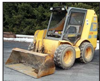
'96 JCB ROBOT 185

1988 SELLICK Model MR-737, 7,000#, 4x4 Telescopic Rough Terrain Forklift , s/n 165058737, powered by Perkins diesel engine and powershift transmission, equipped with 37" maximum lift, 48" forks, 3-stage telescopic boom, 4-wheel steer, chassis tilt, 22,510# operating weight, and 13.00x24 tires. In fair to good condition with fair to good tires. 1996 JCB Model Robot 185 Skid Steer Loader , s/n SLP185SATE0746093, powered by Perkins 4 cylinder diesel engine and hydrostatic transmission, equipped with 66" general purpose loader bucket with bolt-on cutting edge, quick disconnect, auxiliary hydraulics, light package, and 12x16.5 tires. In good condition with good tires. (Purchased New)