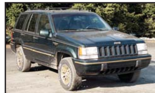
'94 JEEP 4X4

1994 JEEP Model Grand Cherokee Limited 4x4 Sport Utility Vehicle , powered by 4.0 liter, 6 cylinder gas engine and automatic transmission, loaded, 225/75R16 tires. In good condition with fair tires. (Purchased New)