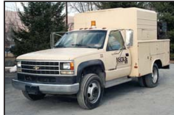
'91 CHEVY 3500HD

1991 CHEVROLET Model 3500HD Mechanics/Lube Truck , powered by V-8 gas engine and automatic transmission, equipped with Reading 9" mechanics lube body with enclosed lube body, gas powered air compressor, Miller Bluestar model 180K, 180 amp welder/5,000 watt generator, powered by Kohler 12.5HP gas engine, (3) product tanks with pneumatic pumps and hose reels, oxygen/acetylene torch set, dual rear wheels, AM/FM stereo, and 225/70R19.5 tires. In good condition with good tires. (Purchased New)