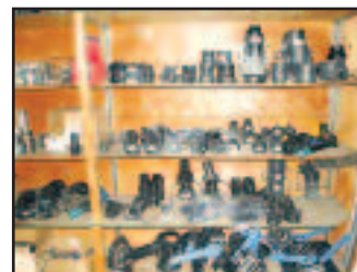
BANJO COUPLERS AND VALVES