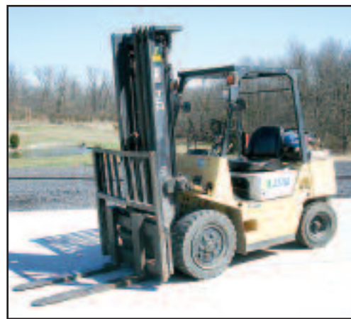
'89 TCM 6,000#

1989 TCM Model FG30N78, 6,000# Pneumatic Tired Forklift , s/n 21R50257, powered by Nissan 4 cylinder gas engine and shuttle transmission, equipped with 212" 3-stage mast, 42" forks, FOPS canopy, and 28x9-15 front and 6.50x10 rear tires. In good condition with good tires.