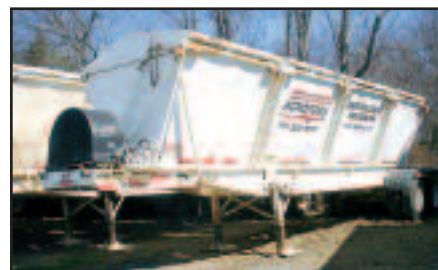
(1) OF (10) SIDE DUMP FERTILIZER TRAILERS

(4) 1998 through 1995 GALYEAN Hydraulic Side Dump Fertilizer Trailers , equipped (4) 200 cubic foot hydraulic side dumping hoppers, Wisconsin gas engine with electric start, 66,000# GVWR, 15,100# tare, and 10R22.5 tires. In good condition with good tires.