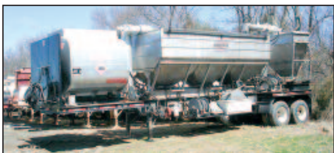
'01 NEVILLE COMBINATION TRAILER

2001 NEVILLE Tandem Axle Combination Refueling/Bulk Trailer , consisting of: 1997 ALMAC INTERNATIONAL 1,500 Gallon Aluminum Fuel Tank, DOT-406 spec, with hydraulic pump and hose reel, Ray-Man model 16CH2FB, 3-bin aluminum product hopper, s/n 0008918, with electric tarp, hydraulic screw load and unload conveyors, aluminum weigh batch hopper, with hydraulic gate, mounted on 2001 Neville Built 34' Tandem Axle Trailer, equipped with 68,000# GVWR, air ride suspension, and 11R22.5 tires. In good condition with good tires.