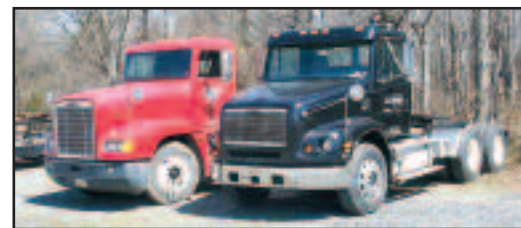
(2) '00 FREIGHTLINER FL112

2000 FREIGHTLINER Model FL112 Tandem Axle Truck Tractor , powered by Cat C-12, 410-425HP diesel engine and Fuller 10 speed transmission, equipped with 40,000# rears, 12,000# front axle, air ride suspension, air ride cab, airslide 5th wheel, single frame, 2-stage engine brake, twin 90 gallon aluminum fuel tanks, air conditioning, cruise control, heated power mirrors, and 11R22.5 tires. In good condition with very good tires.