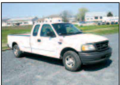
'03 FORD F-150XL