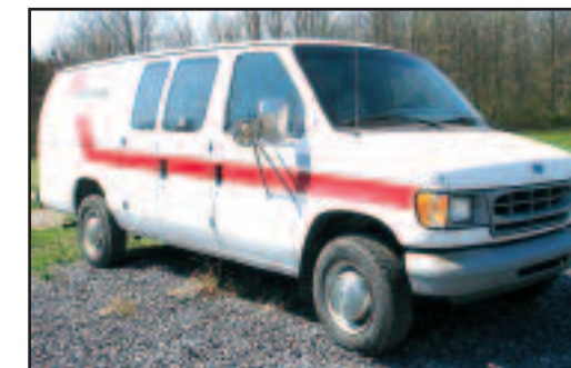
'97 FORD E-250 SUPER ECONOLINE

1997 FORD Model E-250 Super Econoline Cargo Van , powered by 4.2 liter, V-6 gas engine and automatic transmission, equipped with tool bins, air conditioning, AM/FM stereo, and LT225/75R16 tires. In good condition with good tires.