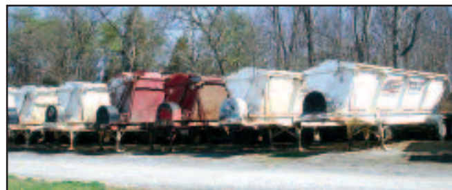
SIDE DUMP FERTILIZER TRAILERS