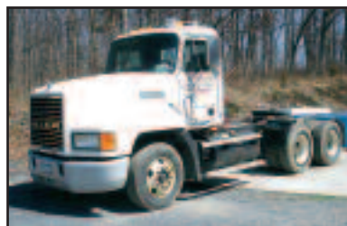
'99 MACK CH613

2000 FREIGHTLINER Model FL112 Tandem Axle Truck Tractor , powered by Cat C-12, 410-425HP diesel engine and Fuller 10 speed transmission, equipped with 40,000# rears, 12,000# front axle, air ride suspension, air ride cab, airslide 5th wheel, power divider, single frame, twin 100 gallon aluminum fuel tanks, air conditioning, cruise control, power windows, aluminum front Budd wheels, and 295/75R22.5 tires. In good condition with good tires.