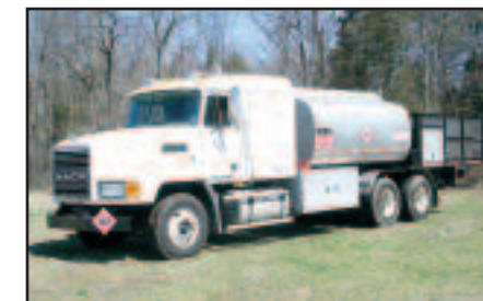
'02 MACK CH613 FUEL TRUCK