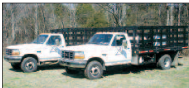
(2) OF (3) '96 FORD F-450 STAKE BODIES