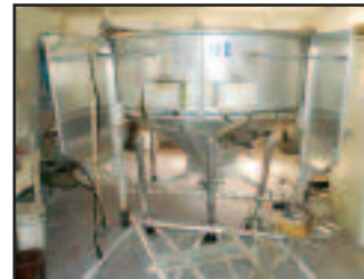
(1) OF (2) ALUMINUM FERTILIZER BUCKETS

Hook Assemblies And Cargo Nets: (4) Remote Hook Assemblies (206) • (1) Remote Hook Assembly (UH-1) • (5) Hook Assemblies (206) • (2) Under-Frames (206) • (3) Individual Hooks • (4) 206 & (2) UH-1 Cargo Nets • (4) Cargo Nets With Small Netting And (4) With Large Netting • (2) Air Rescue Nets • (4) UH-1 Hook Cage W/O Hooks • (4) 50 Ft & (1) 100 Ft Long Lines (206) • (3) 100 Ft & (3) 50 Ft & (1) 25 Ft Long Lines (UH-1) • Various Shackles, Chokers And Long Lines