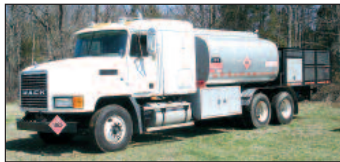
'02 MACK CH613 FUEL TRUCK

2002 MACK Model CH613 Tandem Axle Fuel Truck , powered by Mack E7-427 diesel engine and Fuller 13 speed transmission, equipped with Quaker City model MC-306A2, 2,600 gallon aluminum fuel tank, with pump, meter and hose, 225 gallon poly tank with hydraulic pump, 10' flatbed with 42" steel sides, double frame, 36" integral sleeper, 40,000# rears, 12,000# front axle, 2-stage engine brake, power divider, air ride suspension, air ride cab, air conditioning, cruise control, heated mirrors, and 11R22.5 tires. In good to very good condition with good tires. (60,183 Original Miles)