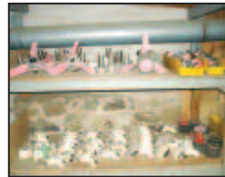
BOOM HANGERS AND ATOMIZERS

Rotary Atomizers And Spray Nozzles: (40+/-) Micronair Model AU5000 & Beecomist Model E-360AL Rotary Atomizers, Some With Mosquito Sleeves • (100+/-) .028 Nozzles • (500+/-) Single, Double And Triple Row Microfoil Comb Nozzles, Sizes .013-.025 • Assorted 8002, 8003 & 8004 Brass, Stainless And Stainless Insert Nozzles • Nozzle Bodies And Various Parts