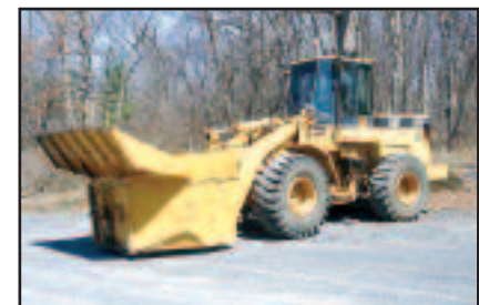
'94 CAT 938F