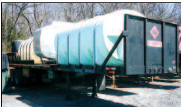
'76 FRUEHAUF 40' FUEL-MIXING TRAILER

2001 NEVILLE Tandem Axle Combination Refueling/Bulk Trailer , consisting of: 1997 ALMAC INTERNATIONAL 1,500 Gallon Aluminum Fuel Tank, DOT-406 spec, with hydraulic pump and hose reel, Ray-Man model 16CH2FB, 3-bin aluminum product hopper, s/n 0008918, with electric tarp, hydraulic screw load and unload conveyors, aluminum weigh batch hopper, with hydraulic gate, mounted on 2001 Neville Built 34' Tandem Axle Trailer, equipped with 68,000# GVWR, air ride suspension, and 11R22.5 tires. In good condition with good tires.