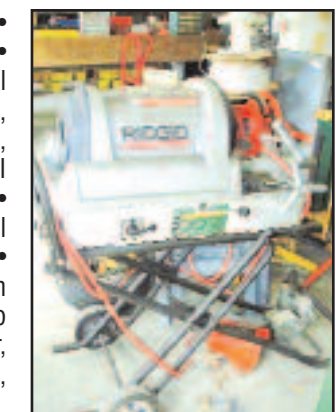
RIDGID 1822 POWER THREADER