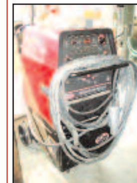
LINCOLN 275 AMP TIG WELDER