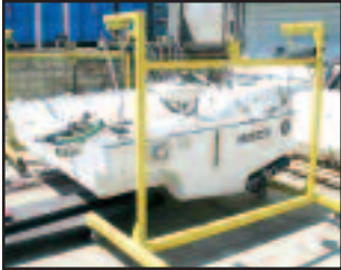
UH-1 BELLY TANK

Belly And Saddle Tanks: (3) Simplex 400 Gallon Belly Tanks With Plumbing (UH-1) • (3) Simplex 170 Gallon Belly Tanks, 2-W/ Plumbing, 1-W/O Plumbing (Hughes 500) • (6) Simplex 140 Gallon Belly Tanks With Plumbing (206) • (2-Sets) Isolair 140 Gallon Saddle Tanks With Plumbing And Undercarriage (OH-58) • (1-Set) Isolair 140 Gallon Saddle Tanks With Plumbing (Hughes 500)