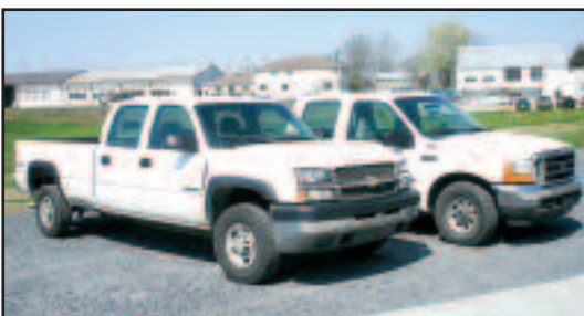
'04 CHEVY 2500HD 4X4 AND '01 FORD F-350XL SUPER DUTY

1996 FORD Model F-450 Super Duty Stake Body Truck , powered by Powerstroke 7.3L Turbo diesel engine and 5 speed transmission, equipped with Reading 12'6" stake body, dual rear wheels, and LT235/85R16 tires. In good condition with good tires.