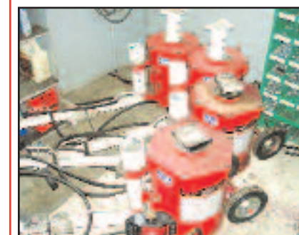
NORCO 10 TON JACKS