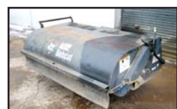
BOBCAT SWEEPER 72