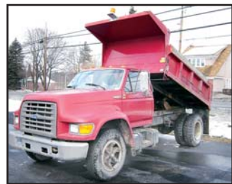
96 FORD F800

1996 FORD Model F-800 Single Axle Dump Truck , powered by Ford 5.9L diesel engine and 5 speed transmission, equipped with 10' steel dump body with chute and 9.00-20 tires. In good condition with good tires.