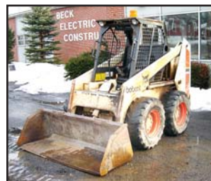
'86 BOBCAT 843

1986 BOBCAT Model 843 Skid Steer Loader , s/n 5026-M-22642, powered by 4 cylinder diesel engine and hydrostatic transmission, equipped with 66" loader bucket, hydraulic outlets, light package, and 12x16.5 tires. In fair condition with poor to fair tires. BOBCAT Model Sweeper 72 Hydraulic Broom Attachment , s/n 783707826. In good condition. 18" Digging Bucket (Fits Bobcat 331E) • 24" Digging Bucket (Fits Case 580) • NPK H-390 Hydraulic Demolition Hammer