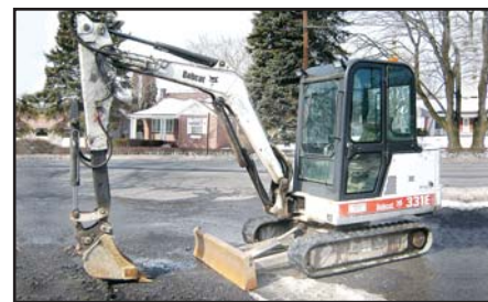
'00 BOBCAT 331E