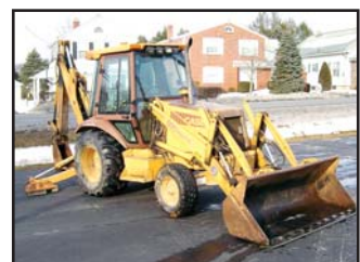
'92 CASE 580 SUPER K

1992 CASE Model 580 Super K Tractor Loader Extend-A-Hoe , s/n JG0165831, powered by Case diesel engine and shuttle transmission, equipped with general purpose loader bucket with bolt-on cutting edge, 12" digging bucket, front counterweight, enclosed ROPS cab, light package, and 11Lx16SL front and 19.5Lx24 rear tires. In good condition with fair to good tires.