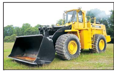
'89 MICHIGAN L320