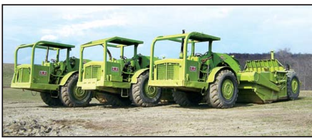
(3) TEREX TS24