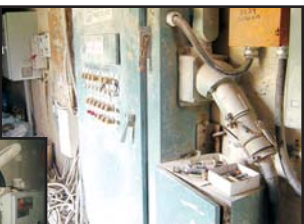
ELECTRICAL CONTROL TRAILER