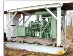
DELCO 800KW GENERATOR

DELCO Model E-6696M2, 800KW Skid Mounted Gen Set , s/n 4-J-75, powered by Detroit 12V-149 diesel engine, equipped with 1000 KVA, 4160 volt, 60 cycle, 3-phase, (5) Westinghouse over voltage relays, Hubbell Ensign ground fault, with skid mounted superstructure and roof. In good condition. FRUEHUF Model FB8-F2-42-ST, 42' Tandem Axle Plant Electrical Trailer , VIN# HPYS92708, equipped with Safronics 250HP starter, Safronics 150HP starter, 10-push button starter panel, Eriez magnet control, 460-120 power reducer, Hartman-Fabco 15-push button starter panel, (6) switch boxes, conveyor wiring, tandem axle tow dolly, and 11R24.5 tires. In fair condition with fair tires. 8'x8' Control House , equipped with 6" insulated and sound suppressed walls, window air conditioner, and push button control panel. In fair to good condition.