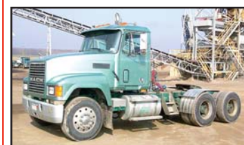
'90 MACK CH613

1990 MACK Model CH613 Tandem Axle Truck Tractor , powered by Mack E6, 350HP diesel engine and Mack 12 speed transmission, equipped with 46,000# rears, 12,000# front axle, wetline, air leaf suspension, 120 gallon aluminum fuel tank, 75 gallon aluminum hydraulic tank, 5th wheel, 182" wheelbase, stainless steel half fenders, deck plated, heated mirrors, air conditioning, aluminum Budd wheels, and 11R22.5 tires. In good condition with good tires. (Gernatt) 1989 FORD Model F-350 Super Duty Service Truck , powered by 8 cylinder diesel engine and 5 speed transmission, equipped with AutoCrane 5,000# 16' 2-section hydraulic service boom, Lincoln Weldenpower gas welder, single stage air compressor, (2) manual outriggers, dual fuel tanks, and 235/85R16 tires. In fair to poor condition with good tires. (Welder Engine Missing Parts) (Air Compressor Missing Engine)