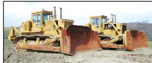
(2) FIAT ALLIS FD50

1988 FIAT ALLIS Model FD50 Crawler Tractor , s/n 42S04060, powered by Cummins VT1710 diesel engine and powershift transmission, equipped with U blade with tilt, 4-barrel single shank ripper, enclosed cab with air conditioning, light package, and 32" SBG pads. In good condition with fair to good undercarriage. 1985 FIAT ALLIS Model FD50 Crawler Tractor , s/n 42S04011, powered by Cummins VT1710 diesel engine and powershift transmission, equipped with U blade with tilt, model 41R, 2-barrel single shank ripper, s/n 18S00337, enclosed cab with air conditioning, light package, and 32" SBG pads. In good condition with good undercarriage. (Approx. 1,100 Hours On Engine) (Approx. 2,000 Hours On Transmission & Finals)