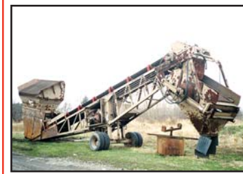
SCREEN MACHINE 45D46-3

THE SCREEN MACHINE Model 45D46-3 Portable Shredder & Screening Plant , s/n 39JL65, powered by Lister 3 cylinder diesel engine, equipped with 9'x5' feed hopper with grizzly and 26" belt feeder, 24"x38'6" screen feed conveyor, powered by hydraulic motor with Dodge gear reducer, top mounted hydraulic top soil shredder, 4'x6' hydraulic vibrating double deck screen with harp screen and sod deck, hydraulic raise, and 9.50x16.5 tires. In good condition with good tires. (C&W Materials)