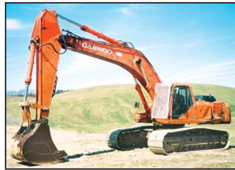
'99 DAEWOO SOLAR SL400LC-V

1999 DAEWOO Model Solar SL400LC-V Hydraulic Excavator , s/n 1056, powered by Daewoo DE12T1 diesel engine and hydraulic drive, equipped with 10'8" dipper stick, Dart 52" digging bucket, hydraulic beyond, front windshield screen, air conditioning, 17'1" crawlers, and 31.5" TBG pads. In good condition with good undercarriage. (CoActiv Capital)