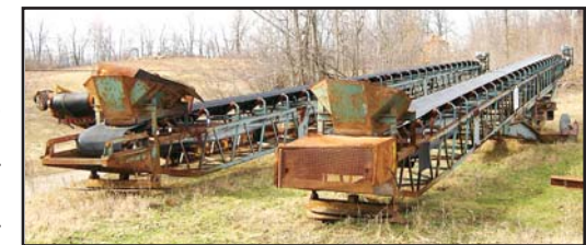
(2) HARTMAN FABCO 100FT STACKERS