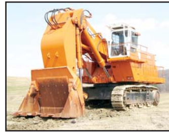
'86 HITACHI UH801

1986 HITACHI Model UH-801 Hydraulic Front Shovel , s/n 180-0174, powered by (2) Cummins KT19 diesel engines and hydraulic drive, equipped with model 801, 12 cubic yard bottom dump bucket, s/n 017, ROPS over enclosed cab with heat and air conditioning, light package, 22'10" crawlers, and 32" pads. In good condition with good undercarriage. (10 Rebuilt Hydraulic Pumps - Both Pump Drive Units Completely Rebuilt - 1 Crowd Cylinder and 1 Dump Cylinder Rebuilt - Equalizer Cylinder Replaced With New One - Both Engines Rebuilt - Less Than 2,500 Hours - All Work Done By Rudd)