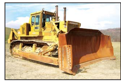
'85 FIAT ALLIS FD50