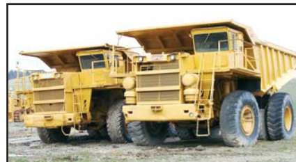
(2) WABCO 75 TON

WABCO Model BFA-6 Haulpak 75, 75 Ton End Dump , s/n CF21319BFA6-D, powered by Cummins VT1710 diesel engine and 6 speed powershift transmission, equipped with heated body with liner, supplemental steering, brake retarder, rock ejectors, air conditioning, light package, and 24.00-35 tires. In good condition with poor to fair tires. WABCO Model BFA-6 Haulpak 75, 75 Ton End Dump , s/n CF21067BFA6-CW, powered by Detroit 16V-71 diesel engine and 6 speed powershift transmission, equipped with heated body with liner, supplemental steering, brake retarder, rock ejectors, air conditioning, light package, and 24.00-35 tires. In good condition with fair tires.