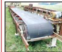
30"x43' CHANNEL INCLINE CONVEYOR

(2) HARTMAN-FABCO 30"x105'x30" Truss Radial Stacking Conveyors , powered by 25HP, 3-phase electric motor and Dodge TDT6 gear reducers, equipped with hydraulic raise, powered by 5HP, 3-phase electric motor, manual angle wheels, and 5th wheel pin. In good condition with good tires. 36"x125'x34" Truss Conveyor , powered by 20HP, 3-phase electric motor and Dodge TDT6 gear reducer, equipped with catwalk, handrail, and gravity take-up. In fair condition. 36"x95'x36" Truss Conveyor , powered by 15HP, 3-phase electric motor and Dodge TXT6 gear reducer, equipped with catwalk and handrail. In fair to good condition. CHAMPION 30"x50'x24" Truss Conveyor , s/n C30-10-343, powered by 10HP, 3-phase electric motor with Dodge TDT3 gear reducer. In fair condition. 30"x40'x24" Truss Conveyor , with Dodge TD4 gear reducer. In fair condition. 36"x43'x8" Channel Conveyor , powered by 10HP, 3-phase electric motor and Dodge TXT4 gear reducer. In fair to good condition. 36"x32'x8" Channel Conveyor , powered by 7.5HP, 3-phase electric motor with Dodge TXT3A gear reducer. In good condition. 30"x43' Channel Incline Conveyor , powered by 10HP 3-phase electric motor with Dodge TDT4 gear reducer. In poor condition. 30"x43' Channel Incline Conveyor , powered by 10HP 3-phase electric motor with Dodge TDT4 gear reducer. In good condition. 30"x21'x6" Channel Conveyor , powered by 5HP, 3-phase electric motor and Dodge TXT3 gear reducer. In fair to good condition.