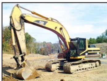
'99 Cat 330BL

1997 CATERPILLAR Model 330BL Hydraulic Excavator, s/n 6DR01193, powered by Cat 3306B diesel engine and hydraulic drive, equipped with 11' dipper stick, 48" digging bucket with ripper pocket, air conditioning, 16'6" crawlers, and 33.5" TBG pads. In good condition with fair undercarriage. (Out Of Frame Complete Engine Rebuild - In-House) (Final Drives Rebuilt) (Main Hydraulic Pump Rebuilt)