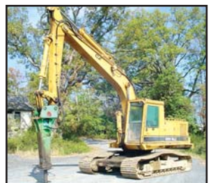
'88 Cat 225B-LC and '98 Tramac BRV32

1988 CATERPILLAR Model 225B-LC Hydraulic Excavator, s/n 2ZD01032, powered by Cat 3208 (remfg.) diesel engine and hydraulic drive, equipped with 10' dipper stick, hydraulic beyond, stiff arm bracket, 48" digging bucket, vandalism kit, 14'6" crawlers, and 30" TBG pads. In fair to good condition with fair to good undercarriage.