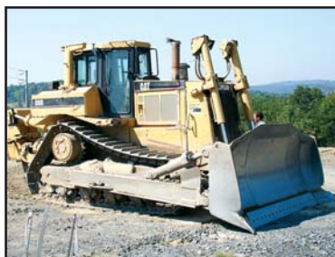
'97 Cat D8R