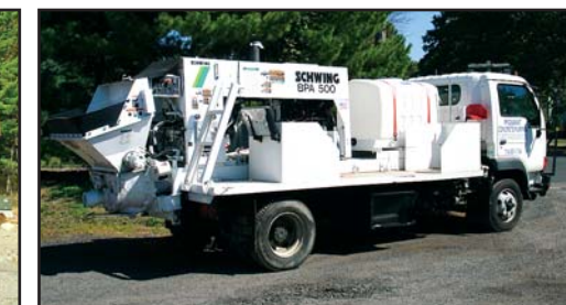
'07 SCHWING BPA500