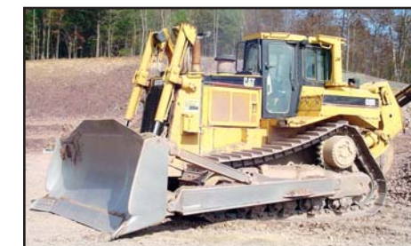
'97 Cat D8R