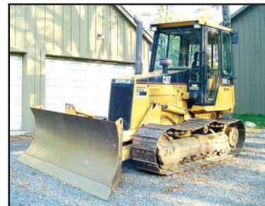
'99 Cat D5CXL III

1999 CATERPILLAR Model D5CXL Series III Hystat Crawler Tractor, s/n 7PS00894, powered by Cat 3046 diesel engine and hydrostatic transmission, equipped with 6-way straight blade, tow hitch, enclosed ROPS cab with air conditioning, and 20" SBG pads. In good condition with fair to good undercarriage. (Purchased New)