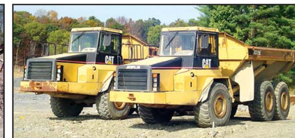
(2) OF (3) CAT D300E