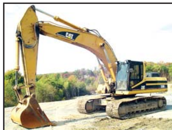
'97 Cat 330BL

1997 CATERPILLAR Model 330BL Hydraulic Excavator, s/n 6DR01193, powered by Cat 3306B diesel engine and hydraulic drive, equipped with 11' dipper stick, 48" digging bucket with ripper pocket, air conditioning, 16'6" crawlers, and 33.5" TBG pads. In good condition with fair undercarriage. (Out Of Frame Complete Engine Rebuild - In-House) (Final Drives Rebuilt) (Main Hydraulic Pump Rebuilt)