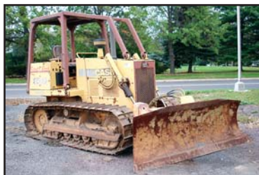
'90 Case 850D

1997 CATERPILLAR Model D8R Crawler Tractor, s/n 7XM01460, powered by Cat 3406C diesel engine and powershift transmission, equipped with semi U blade with single tilt, Cat 8SS 4-barrel ripper, s/n 1HF03696, with pin pull, differential steering, enclosed ROPS cab with air conditioning, and 24" extreme service SBG pads. In good condition with good undercarriage. (Undercarriage Replaced Approx. 2,000 Hours Ago) (In-Frame Rebuilt Engine Approx. 1,000 Hours Ago)