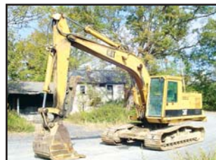
'91 Cat 225D-LC

1991 CATERPILLAR Model 225D-LC Hydraulic Excavator, s/n 2SJ00897, powered by Cat 3208T Turbo diesel engine and hydraulic drive, equipped with 10' dipper stick, 40" digging bucket with H&H thumb attachment, 14'6" crawlers, and 30" TBG pads. In fair to good condition with fair undercarriage.