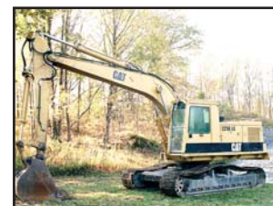
'90 Cat 225D-LC

1990 CATERPILLAR Model 225D-LC Hydraulic Excavator, s/n 2SJ00467, powered by Cat 3208 Turbo diesel engine and hydraulic drive, equipped with 10' dipper stick, 30" digging bucket with side cutters, hydraulic beyond, 14'6" crawlers with rock guards, and 30" TBG pads. In good condition with good undercarriage.