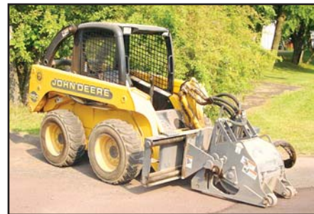
01 JD 250 and 01 Alitec CX18ATD