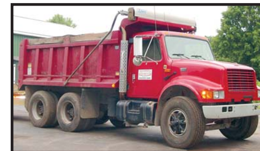
'00 INT'L 4900