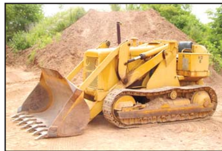
Allis Chalmers HD6G

ALLIS CHALMERS Model HD6G Crawler Loader , s/n 37A24546, powered by 4 cylinder 85HP diesel engine and direct drive transmission, equipped with general purpose loader bucket with teeth and 13" TBG pads. In good condition with fair undercarriage. (Purchased New)