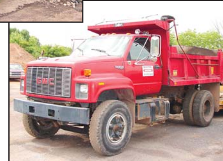
94 GMC Topkick

2000 INTERNATIONAL Model 4900 Tandem Axle Dump Truck , powered by International CH275, 275HP diesel engine and Eaton Fuller 8LL, 10 speed transmission, equipped with 14' steel dump body with electric tarp and manual chute, 40,000# rears, 16,000# front axle, 170" wheelbase, air brakes, tow package with air, and 315/80R22.5 front and 11R22.5 rear tires. In good condition with fair to good tires. (049,734 Original Miles) (Purchased New)