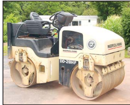
00 IR DD-28HF

1993 INGERSOLL-RAND Model DD-22 Vibratory Roller , s/n 6159SFC, powered by Deutz 3 cylinder diesel engine and hydrostatic transmission, equipped with 39" smooth drums, drum cleaners, and water system. In good condition. (1,668 Original Hours) (Purchased New)