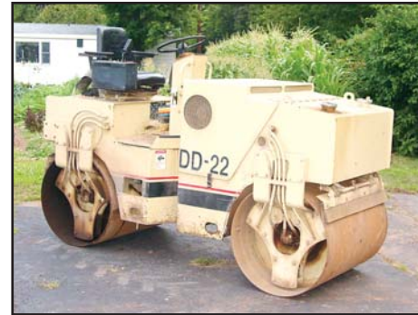
93 IR DD-22