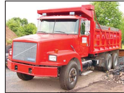
93 Volvo WG64