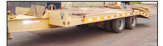
88 Eager Beaver 20 Ton

1988 EAGER BEAVER Model 20HA, 20 Ton Tandem Axle Tag-A-Long Trailer , equipped with 8'x17' level deck, 5' beavertail, 4'6" ramps, 47,050# GVWR, air brakes, chain dogs, and 215/75R17.5 tires. In good condition with good tires. (Purchased New)