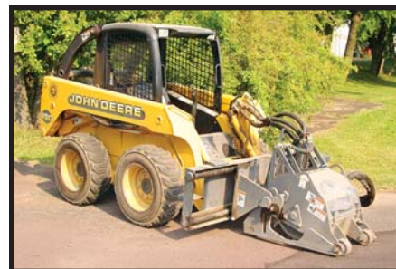
'01 JD 250 AND '01 ALITEC CX18ATD

WALTER'S PAVING COMPANY Souderton, Pennsylvania • (Philadelphia/Allentown Area)