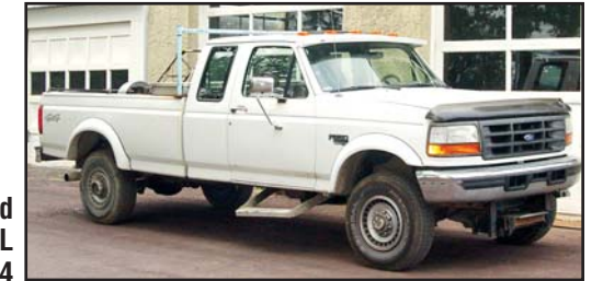
95 Ford F-250XL 4x4

1995 CHEVROLET Model 2500 Extended Cab Pickup Truck , powered by V-8 gas engine and automatic transmission, equipped with 8' bed, Tommy Gate electric lift gate, power windows and locks, air conditioning, cruise control, and 245/75R16 tires. In fair to good condition with good tires.