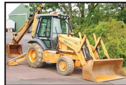
'96 CASE 580SL 4X4