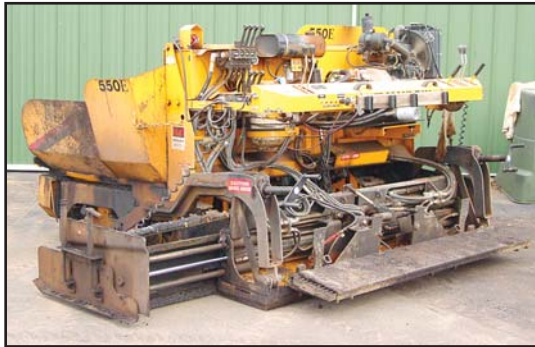
05 Mauldin 550E

2005 MAULDIN Model 550E Crawler Asphalt Paver , s/n 457-E-55TKK4Y1-01457, powered by Kubota 3 cylinder diesel engine and hydrostatic transmission, equipped with 8'-13' heated vibratory screed and hydraulic folding hopper. In good condition with good undercarriage. (0,346 Original Hours) (Purchased New)