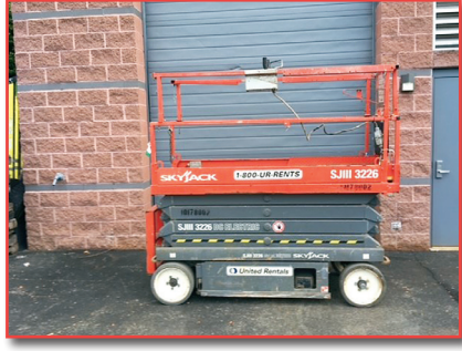
13 SKYJACK SJ3326

PRE-SORTED FIRST CLASS MAIL US POSTAGE PAID