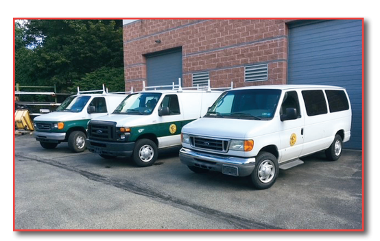
`07-`11 FORD VANS