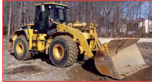
'02 CAT 950G II (2,239 ORIGINAL HOURS)