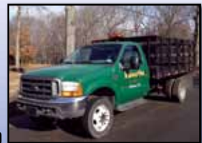
'99 FORD F-450

1986 FORD F-350 , 5.9L V-8 gas and 4 spd trans, 8' steel dump body, tow package, and 7.50x16LT tires.