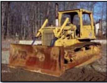
'85 CAT D6D

1985 CAT D6D , s/n 04X10589, Cat 3306 dsl and powershift trans, straight blade with tilt, ROPS canopy, and 24" SBG pads. In good condition with good undercarriage.