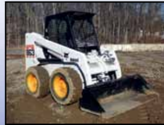
'99 BOBCAT 863F

1987 JOHN DEERE 410C 4x4 Extend-A-Hoe , s/n 739230, JD dsl and shuttle trans, general purpose loader bucket with bolt-on cutting edge, 24" digging bucket, 12-16.5 front and 21x24 rear tires. In good condition with fair to good tires. (Purchased New)