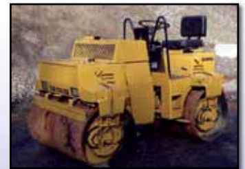
'88 BOMAG BW130AD

1994 BOMAG BW120AD-2 , s/n 101170500980, Deutz dsl and hydrostatic trans, 47" smooth drums. In good condition. (Purchased New) • 1988 BOMAG BW130AD , s/n 101650000493, Deutz dsl and hydrostatic trans, 50.5" smooth drums. In good condition • 1988 IR DD35 , s/n 8161-S, Deutz dsl and hydrostatic trans, 40" smooth drums. In good condition • HYSTER B14 , s/n B146C2145E, dsl and hydrostatic trans, 49" smooth drums. In fair condition.