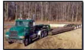
'00 MACK CH613 AND '99 ROGERS 50 TON

1959 ROGERS TUHPG75D4, 75 Ton Tandem Axle , ground bearing detachable gooseneck, wetline, 10'x25' drop side deck, 10' deck over axles, beam suspension, chain dogs, and 14.00x24 tires. In fair condition with fair tires.