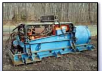
'87 AMERICAN AUGER 42-500GHDS

1987 AMERICAN AUGER 42-500GHDS Horizontal Boring Machine , s/n 42-5006HDS068734, Deutz dsl and direct drive trans, 4" hex and 30' track. In good condition. (Purchased New) RICHMOND Horizontal Boring Machine , Wisconsin gas and 3 spd trans, 2-1/4" hex and 30' track. In fair condition.