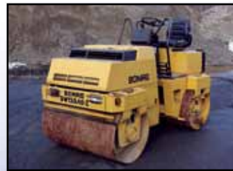
'94 BOMAG BW120AD-2

1994 BOMAG BW120AD-2 , s/n 101170500980, Deutz dsl and hydrostatic trans, 47" smooth drums. In good condition. (Purchased New) • 1988 BOMAG BW130AD , s/n 101650000493, Deutz dsl and hydrostatic trans, 50.5" smooth drums. In good condition • 1988 IR DD35 , s/n 8161-S, Deutz dsl and hydrostatic trans, 40" smooth drums. In good condition • HYSTER B14 , s/n B146C2145E, dsl and hydrostatic trans, 49" smooth drums. In fair condition.