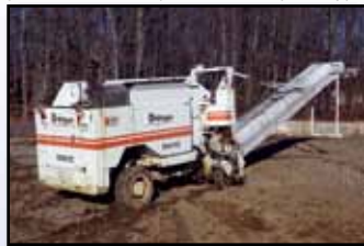
'90 WIRTGEN 1000VC

1990 WIRTGEN 1000VC Milling Machine , s/n 2.10.0337, Deutz dsl and hydraulic drive, 42" milling drum with carbide teeth, 16"x22" discharge conveyor, and solid tires. In fair condition with fair tires. (Purchased New)