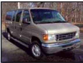
(1) OF (2) FORD E-350XL VANS

2007 FORD E-350XL 12-Passenger Van , 5.4L V-8 gas and auto trans, power windows and locks, curbside door, AC, CD player, and LT225/75R16 tires. In very good condition with good tires. (054,154 Original Miles)