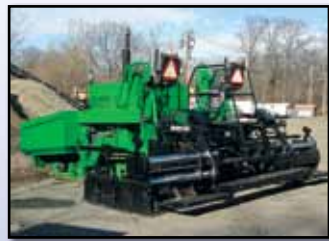
'97 BARBER GREENE BG225B