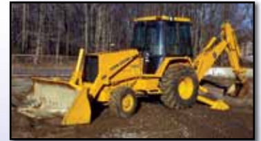
'87 JD 410C 4X4 EXTEND-A-HOE

1999 BOBCAT 863F , s/n 514429003, Deutz dsl and hydrostatic trans, 72" general purpose loader bucket, high flow auxiliary hydraulics, manual quick disconnect, and 12x16.5 tires. In good condition with good tires.