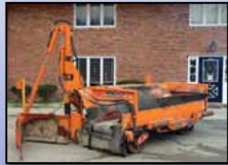
'99 MIDLAND WA

1997 BARBER GREENE BG225B Crawler Paver , s/n 6YK00594, Cat 3054 dsl and hydraulic drive, Extend-A-Mat 8-16B 8'-16" vibratory screed, s/n 3GL00252, 10'6" crawlers, and 14" street pads. In good condition with good undercarriage. (00,788 Original Hours) (Purchased New) BLAW KNOX PF-65 Rubber Tired Paver , s/n 0498016, Ford gas and direct drive, 8'-12" vibratory screed, and 14.00x20 tires. In poor condition with poor tires.