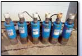
(6) OF (30) 3 INCH SUBMERSIBLE PUMPS

FLYHGT 3127180 , 4" Electric Submersible, starter box • (30) 3" & (1) 2" Electric Submersible, starter boxes. In good and very good condition • (2) 4" & (2) 3" Trash • (2) 3" & (1) 2" Centrifugal • 3" Pneumatic Diaphragm • Skid Mounted 8" Well Point, Detroit 2 cylinder dsl. In fair to poor condition • SYKES 6" Portable Water, Lister dsl • (50) PVC and Aluminum Well Point Transfer Pipe, with couplers and well points • (50) 12" and 15" Steel Dewatering Pipe • Suction and Discharge Hose