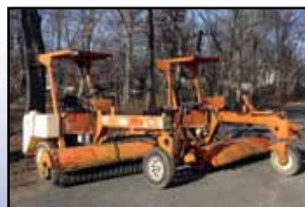
(2) LAYMOR BROOMS

1999 LAYMOR 8HC , s/n 26686-002, Kubota dsl and hydrostatic trans, 92" broom with power angle, water system, tow hitch, canopy with light package, and 205-75R14 tires. In good condition with good tires.