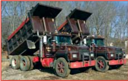
'00 AND '99 MACK RD688SX

'94 WIRTGEN 1900DC (2,784 ORIGINAL HOURS)