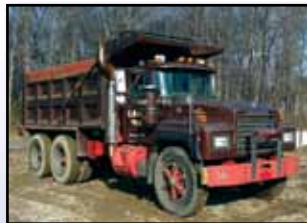
(1) OF (2) MACK RD688SX

1979 AUTOCAR DC9364B , Cat 3408 dsl and Fuller Roadranger RTO 9509, 9 spd trans, 15' aluminum dump body with manual gate, Hendrickson spring over walking beam suspension, 2-stage brake, 70,000# GVWR, and 11.00R22 tires. In fair condition with fair to good tires.