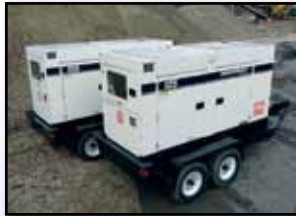
(2) '06 MQ 100KW

Screw Air Compressor, s/n 848-047, Detroit dsl. In fair condition.