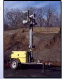
SPECIALTY LIGHTING BTK64MH

• (200) Safety Road Signs • (12) Sign Stands