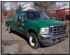
'04 FORD F-350XL

2004 FORD F-350XL Super Duty Extended Cab Utility Truck , 5.4L V-8 gas and auto trans, 9' open utility body, 50 gallon fuel tank with pump, tow package, cruise control, and AC. In good condition with good tires. (083,072 Original Miles) (Purchased New)