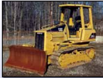
'04 CAT D3GXL

1985 CAT D6D , s/n 04X10589, Cat 3306 dsl and powershift trans, straight blade with tilt, ROPS canopy, and 24" SBG pads. In good condition with good undercarriage.