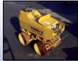
'06 RAMMAX P33-24