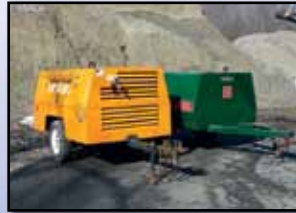
(2) OF (4) PORTABLE AIR COMPRESSORS