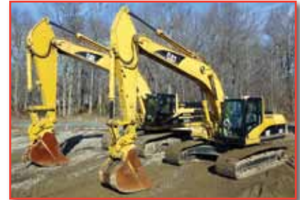
'02 CAT 345BL II AND '04 CAT 322CL