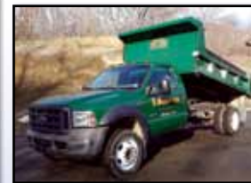
'06 FORD F-550

8' steel dump body, tow package, and 7.50x16LT tires. In fair to poor condition with fair to poor tires.