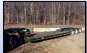
'03 ROGERS 55 TON