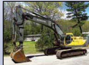
'02 VOLVO EC460LC

2005 VOLVO Model EC330BLC Hydraulic Excavator , s/n 10422, powered by Volvo D12CECE2 diesel engine and hydraulic drive, equipped with 10'6" dipper stick, Geith 54" digging bucket, hydraulic coupler, auxiliary hydraulics, enclosed cab with heat and air conditioning, and 31.5" TBG pads. In good condition with good undercarriage. (06,918 Hours)