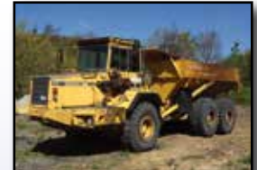
'93 VOLVO A30

1993 VOLVO Model A30, 30 Ton 6x6 End Dump , s/n A30V1249, powered by Volvo diesel engine and powershift transmission, equipped with heated dump body (not plumbed), air conditioning, and 23.5R25 tires. In fair to good condition with fair and poor tires.