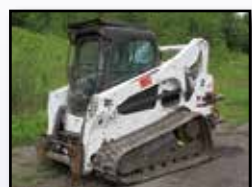
'14 BOBCAT T770

2014 BOBCAT Model T770 Crawler Skid Steer Loader , s/n AN8T13419, powered by 4 cylinder diesel engine and 2 speed hydrostatic transmission, equipped with high-flow auxiliary hydraulics, hydraulic coupler, Warn series 15, 15,000# rear mounted hydraulic winch, enclosed ROPS cab with air conditioning, and 18" rubber tracks. In good condition with good tracks. (1,681 Hours) (No Bucket) (SALES TAX) (PNC)