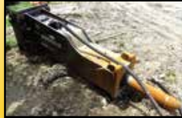
'14 DOOSAN DXB260H

2014 DOOSAN Model DXB260H Hydraulic Demo Hammer , s/n X260C50138. In good to very good condition. (Will Be Offered Separately and With 2014 Doosan DX350LC-5) (SALES TAX) (PNC)