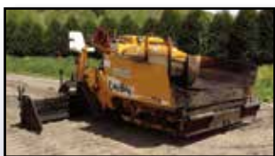
'03 LEEBOY L8500T

2003 LEEBOY L8500T High Deck Crawler Asphalt Paver , s/n 3115HD, powered by Cummins diesel engine and hydraulic drive, equipped with Legend 8' to 15' vibratory and heated screed. In fair condition. (983 Hours)