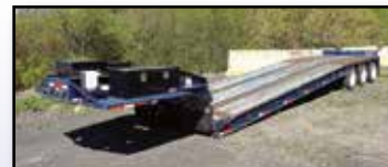
'94 ROGERS 40 TON

1994 ROGERS Model CR40SL-86/48/33/102/3XSP, 40 Ton Tri-Axle Paver Special Lowboy Trailer , equipped with non-ground bearing detachable gooseneck, gas pony motor, 8'6"x33' inclining deck, spring suspension, chain dogs, and 255/70R22.5 tires. In good condition with good tires.