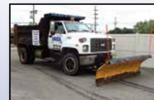
'95 CHEVY KODIAK

1999 FORD Model F-550 Super Duty 4x4 Dump Truck , powered by Powerstroke diesel engine and 6 speed transmission, equipped with 9' steel dump body with manual tarp and fold-down sides, Meyer 9' snowplow, 12,980# rear and 5,510# front axle, 17,500# GVWR, dual rear wheels, tow package, air conditioning, and 225/70R19.5 tires. In fair condition with good tires. (New Transmission-Zero Miles) (NINSA)