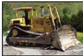
'87 CAT D8N

1987 CATERPILLAR Model D8N Crawler Tractor , s/n 9TC01679, powered by Cat 3406 diesel engine and powershift transmission, equipped with straight blade with tilt, drawbar, ROPS canopy, and 24" SBG pads. In good condition with good undercarriage. (Less Than 500 Hours on Engine Overhaul and New Torque Converter)