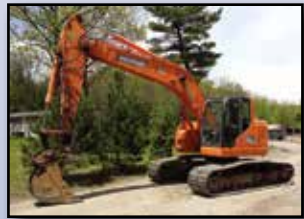
'11 DOOSAN DX235LCR

2013 DOOSAN Model DX350LC-3 Hydraulic Excavator , s/n 1010065, powered by Doosan diesel engine and hydraulic drive, equipped with 10'6" dipper stick, 36" digging bucket, Doosan hydraulic coupler, auxiliary hydraulics, rear view camera, enclosed cab with heat and air conditioning, and 31.5" TBG pads. In good condition with good undercarriage. (3,374 Hours)