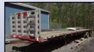
'04 GREAT DANE 48'

2004 GREAT DANE Model GPLWSAR249, 48' Spread Axle Flatbed Trailer , equipped with 96" width, 69,000# GVWR, aluminum bed/steel frame, air ride suspension, ratchet tie-downs, aluminum bulkhead, aluminum wheels, and 275/80R22.5 tires. In good condition with fair tires. (CE ANKIEWICZ)