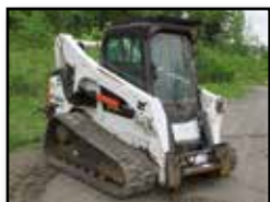
'14 BOBCAT T770

2014 BOBCAT Model T770 Crawler Skid Steer Loader , s/n AN8T13749, powered by 4 cylinder diesel engine and 2 speed hydrostatic transmission, equipped with high-flow auxiliary hydraulics, hydraulic coupler, Warn series 15, 15,000# rear mounted hydraulic winch, enclosed ROPS cab with air conditioning, and 18" rubber tracks. In good condition with good tracks. (1,503 Hours) (No Bucket) (SALES TAX) (PNC)