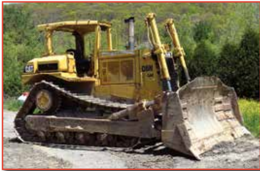
'87 CAT D8N

PRE-SORTED FIRST CLASS MAIL US POSTAGE PAID HAVERTOWN, PA PERMIT #45