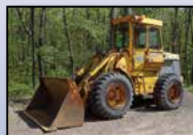
JOHN DEERE 544A

JOHN DEERE Model 544A Rubber Tired Loader , s/n 1293531, powered by JD diesel engine and powershift transmission, equipped with general purpose loader bucket with bolt-on cutting edge, enclosed ROPS cab with heat, and 17.5-25 tires. In good condition with good tires. (CE ANKIEWICZ)