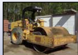
'98 CHAMPION SUPER PAC 840

1998 CHAMPION Model Super Pac 840 Vibratory Compactor , s/n 101284, powered by Cummins diesel engine and hydrostatic transmission, equipped with 84" smooth drum, ROPS canopy, and 23.1-26 tires. In fair to good condition with good tires.