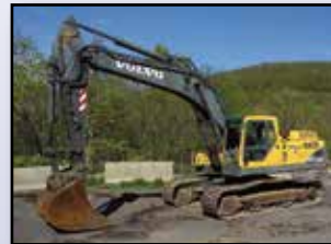
'05 VOLVO EC330BLC

2005 VOLVO Model EC330BLC Hydraulic Excavator , s/n 10422, powered by Volvo D12CECE2 diesel engine and hydraulic drive, equipped with 10'6" dipper stick, Geith 54" digging bucket, hydraulic coupler, auxiliary hydraulics, enclosed cab with heat and air conditioning, and 31.5" TBG pads. In good condition with good undercarriage. (06,918 Hours)