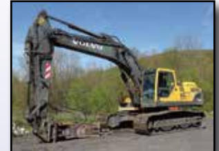
'06 VOLVO EC360BLC (HAMMER NOT IN AUCTION)

2006 VOLVO Model EC360BLC Hydraulic Excavator , s/n 80176, powered by Volvo D12DEB2 diesel engine and hydraulic drive, equipped with 11' dipper stick, 72" digging bucket, hydraulic coupler, auxiliary hydraulics, enclosed cab with heat and air conditioning, and 29.5" pads. In good condition with good undercarriage. (3,869 Hours) (Hammer In Photo-Not in Auction)