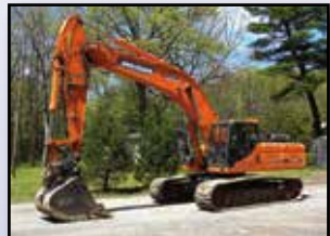
'13 DOOSAN DX350LC-3

2013 DOOSAN Model DX350LC-3 Hydraulic Excavator , s/n 1010065, powered by Doosan diesel engine and hydraulic drive, equipped with 10'6" dipper stick, 36" digging bucket, Doosan hydraulic coupler, auxiliary hydraulics, rear view camera, enclosed cab with heat and air conditioning, and 31.5" TBG pads. In good condition with good undercarriage. (3,374 Hours)