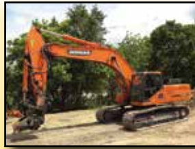
'14 DOOSAN DX350LC-5

2014 DOOSAN Model DX350LC-5 Hydraulic Excavator , s/n 1010046, powered by Scania diesel engine and hydraulic drive, equipped with 10'6" dipper stick, Rockland hydraulic coupler, auxiliary hydraulics, rear view camera, enclosed cab with heat and air conditioning, and 31.5" TBG pads. In good condition with good undercarriage. (4,547 Hours) (No Bucket) (Will Be Offered Separately and With Doosan DXB260H Hammer) (SALES TAX) (PNC)