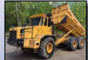
'99 BELL B25C

1999 BELL Model B25C, 25 Ton 6x6 End Dump , s/n 030032, powered by Cummins diesel engine and powershift transmission, equipped with air conditioning. In good condition with good to very good tires. (BARHITE)