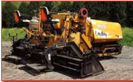
'03 LEEBOY L8500T

1440 COWPATH RD. • HATFIELD, PA 19440 215/361-9099 • Fax: 215/361-9212 www.hunyady.com