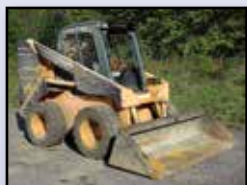
'05 MUSTANG 2086

2005 MUSTANG Model 2086 Skid Steer Loader , s/n 00002981, powered by 4 cylinder diesel engine and hydrostatic transmission, equipped with 83" general purpose loader bucket, auxiliary hydraulics, manual coupler, and 12-16.5 tires. In good condition with good tires. (0,953 Hours)