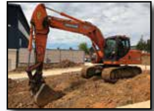
'12 DOOSAN DX180

2012 DOOSAN Model DX180 Hydraulic Excavator , s/n 0005422, powered by Doosan diesel engine and hydraulic drive, equipped with 8'3" dipper stick, Doosan 42" digging bucket, Geith hydraulic coupler, auxiliary hydraulics, rear view camera, enclosed cab with heat and air conditioning, and 24" TBG pads. In good condition with good undercarriage. (2,878 Hours)