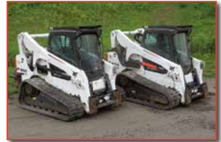
(2) '14 BOBCAT T770