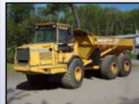
'96 VOLVO A25C

1996 VOLVO Model A25C, 25 Ton 6x6 End Dump , s/n 5350V60881, powered by Volvo diesel engine and powershift transmission, equipped with 23.5R25 tires. In good condition with good tires.