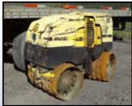
'04 WACKER RT

2004 WACKER Model RT Trench Compactor , s/n 102 5456128, powered by Lombardini diesel engine, equipped with 32" split padfoot drums, drum cleaners, and wireless remote. In good condition.