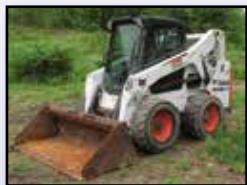
'13 BOBCAT S650

2013 BOBCAT Model S650 Skid Steer Loader , s/n A3NV23623, powered by Kubota V3307-DI-T-ET103, 4 cylinder diesel engine and 2 speed hydrostatic transmission, equipped with 80" general purpose loader bucket, auxiliary hydraulics, hydraulic coupler, enclosed ROPS cab with air conditioning, and 12-15.5 tires. In good condition with fair to good tires. (2,088 Hours) (SALES TAX) (PNC)