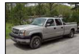
'04 CHEVY 2500HD 4X4

2004 CHEVROLET Model 2500HD LS 4x4 Crew Cab Pickup Truck , powered by Vortec 8.0L gas engine and automatic transmission, equipped with 8' bed, 100 gallon fuel tank with 12 volt pump, cross and side toolboxes, power windows, locks, mirrors, and seats, running boards, tow package, and 245/75R16 tires. In good condition with good tires.