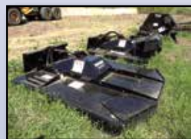
UNUSED ERSKINE ATTACHMENTS

• Dust Control Water Kit, with (2) 20 gallon poly tanks • 60" Concrete Bucket