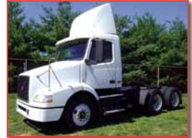
'07 VOLVO DAY CAB