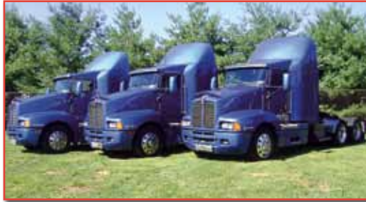
(3) OF (15) '07 KENWORTH T600