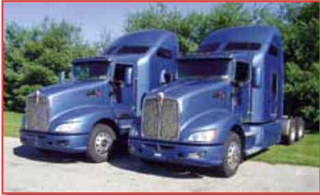
(2) OF (30) '09 KENWORTH T660