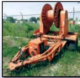
SINGLE DRUM PULLER

(2) CONDUX Fiber Optic Pullers, 30"x6" bull wheel, Briggs & Stratton 18HP gas, mounted on single axle trailer • CONDUX Fiber Optic Puller (Parts) • Single Drum Puller, Wisconsin gas • (4) CORNING SIECOR M90/Series 6000 Fusion Splicers • SIECOR 340 OTDR Plus Multi-Tester II • (2) AGILENT Wirescope 350 Cable Certifiers • Cable Pulling Guides and Stringing Blocks • Splicing Material, Tools, and Accessories