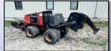
95 DITCH WITCH 410SXDD