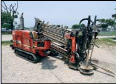
00 DITCH WITCH JT2720

2000 DITCH WITCH JT2720 , s/n J2T2209, JD dsl, (370') drill stem, auto stake down, fluid system, and 12" rubber tracks. In good condition with good undercarriage.