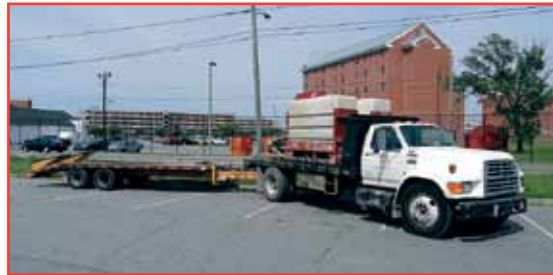
FORD F-700 FLUID MIXING WITH 6 TON TAG TRAILER