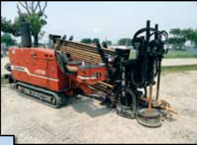
00 DITCH WITCH JT2720

2000 DITCH WITCH JT2720 , s/n 3J2T2704, Cummins dsl, (500') drill stem, auto stake down, fluid system, and 12" rubber tracks. In good condition with good undercarriage.