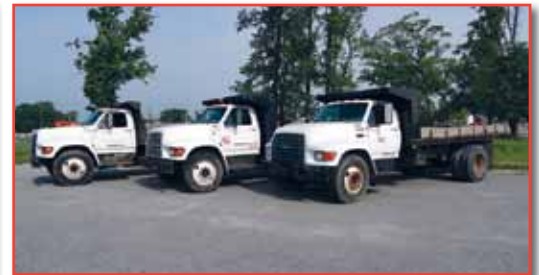
FORD F-800 FLAT DUMPS