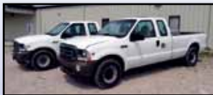
'02 FORD F-250 EXTENDED CABS

1999 FORD F-250XLT SD Extended Cab Utility Truck, Powerstroke 7.3L dsl and auto trans, Reading 8'6" utility body with ladder rack, IR gas powered air compressor with hose reel, cc, pw, pl, a.c. In fair to good condition with fair to good tires.