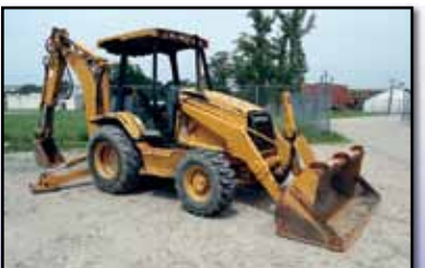
00 CAT 416C 4X4 EXTEND-A-HOE

2000 CATERPILLAR 416C, 4x4 Extend-A-Hoe , s/n 4ZN19777, dsl and shuttle trans, GP loader bucket, 16" digging bucket, ROPS canopy. In fair to good condition with fair front and poor rear tires.