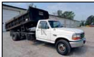
'97 FORD F-450 MASON DUMP

1997 FORD F-450 SD Mason Dump Truck, Powerstroke 7.3L dsl and 5 speed trans, Ox 14' dump body, tow package, dual rear wheels, a.c. In fair to good condition with good tires.