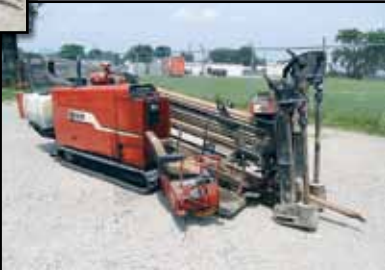
00 DITCH WITCH JT920L

1998 DITCH WITCH JT920E , s/n 2R3392, Lister dsl, auto stake down, fluid system, and 10" rubber tracks. (Not Running-Hydraulic Hoses Disconnected)