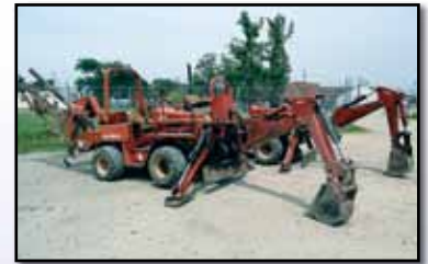
00 AND 96 DITCH WITCH 5110DD

1988 DITCH WITCH 4010DD Vibratory Cable Plow/Backhoe , s/n 6E0871, Deutz dsl, A321 backhoe attachment, A430 vibratory cable plow, 64" backfill blade, roll-bar. In fair condition with poor tires.