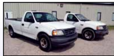
(2) OF (5) FORD F-150

(2) 2001 FORD F-150XL Pickup Trucks, 4.2L, V-6 gas and auto trans, 8' bed with liner, a.c. In fair to good condition with fair to good tires.