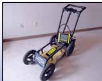
NOGGIN SMART CART GPR

(2) 4" Piercing Tools • (5) 3" Piercing Tools • (2) 2" Piercing Tools • (4) Duct Rodders