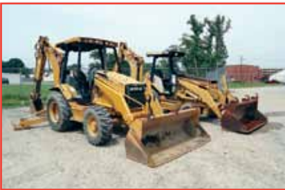
'00 CAT 416C AND '96 CAT 416B