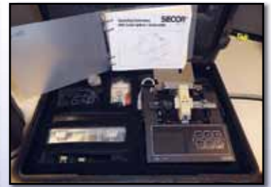
FIBER OPTIC SPLICERS

(2) CONDUX Fiber Optic Pullers, 30"x6" bull wheel, Briggs & Stratton 18HP gas, mounted on single axle trailer • CONDUX Fiber Optic Puller (Parts) • Single Drum Puller, Wisconsin gas • (4) CORNING SIECOR M90/Series 6000 Fusion Splicers • SIECOR 340 OTDR Plus Multi-Tester II • (2) AGILENT Wirescope 350 Cable Certifiers • Cable Pulling Guides and Stringing Blocks • Splicing Material, Tools, and Accessories