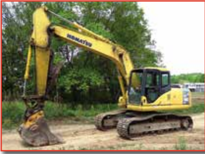
'03 KOMATSU PC160LC-7