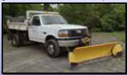
'96 FORD F-350XL 4X4

1996 FORD Model F-350XL, 4x4 Dump Truck , powered by V-8 gas engine and 4 speed transmission, equipped with Meyer 8' snowplow with side wings, light package, quick disconnect, Heil 8' steel dump body, central hydraulics, tow package, dual rear wheels, and 235/85R16 tires.