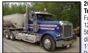
'03 FREIGHTLINER CLASSIC XL

2003 FREIGHTLINER Classic Tandem Axle Truck Tractor , powered by Cat C-15, 490HP diesel engine and Eaton Fuller 18 speed transmission, equipped with 40,000# rears, 12,000# front axle, wetline, engine brake, air ride suspension, air slide 5th wheel, aluminum headache rack, aluminum wheels, air conditioning, cruise control, heated mirrors, power windows, and 11R24.5 tires. In good condition with fair front and good rear tires. (Odometer Reads 226,281 Miles)