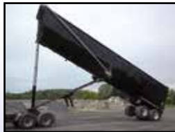
'13 MAC 44'

1990 LANDOLL Tandem Axle Traveling Axle Trailer , equipped with 8'6"x9'6" upper deck, 28" transition section, 33' lower deck, hydraulic winch, and 10R17.5 tires. In fair to good condition with very good tires.