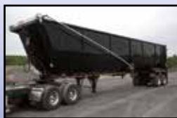
'13 MAC 44'