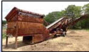
'89 EXTEC 5000

1989 EXTEC Model 5000 Portable Screening Plant , s/n 1298, powered by 4 cylinder diesel engine, equipped with 7'x12' feed hopper with grizzly and under hopper conveyor, 36"x33' feed conveyor, 5'x7' 2-deck screen, (2) 24"x25' side folding discharge conveyors, 46"x18' rear discharge conveyor, and 385/65R22.5 tires. In fair to good condition with fair tires. (Meter Reads 01,250 Hours)