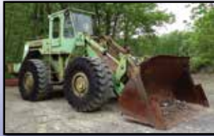
'80 TEREX 72-51B

1993 CATERPILLAR Model 950F Rubber Tired Loader , s/n 5SK00681, powered by Cat 3116 diesel engine and powershift transmission, equipped with 66" fork attachment, enclosed ROPS cab, and 23.5-25 tires. In fair condition with good tires.