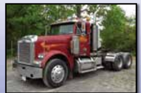
'03 FREIGHTLINER CLASSIC

2003 FREIGHTLINER Classic Tandem Axle Truck Tractor , powered by Cat C-15, 490HP diesel engine and Eaton Fuller 18 speed transmission, equipped with 40,000# rears, 12,000# front axle, wetline, engine brake, air ride suspension, air slide 5th wheel, aluminum headache rack, aluminum wheels, air conditioning, cruise control, heated mirrors, power windows, and 11R24.5 tires. In good condition with fair front and good rear tires. (Odometer Reads 226,281 Miles)