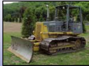
'99 KOMATSU D38P-1

1999 KOMATSU Model D38P-1 Crawler Tractor , s/n 4740004P085929, powered by 4 cylinder diesel engine and powershift transmission, equipped with 6-way straight blade, tow hitch, ROPS canopy, and 24" S&B pads. In good condition with good undercarriage. (Meter Reads 02,884 Hours)