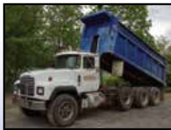
'96 MACK RD688S

1996 MACK Model RD688S Tri-Axle Dump Truck , powered by Mack E7-350, 350HP diesel engine and Eaton Fuller 8LL, 10 speed transmission, equipped with Heil 18' steel dump body, 44,000# rears, 18,000# front axle, and 20,000# airlift 3rd axle, spring suspension, Jacobs engine brake, 4.42 gear ratio, tow package with air, heated mirrors, air conditioning, 385/65R22.5 front and lift, and 11R24.5 rear tires. In good condition with fair tires. (Odometer Reads 270,399 Miles)