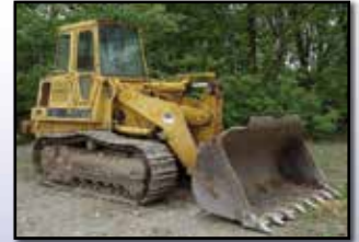
'94 CAT 963

1994 CATERPILLAR Model 963 Crawler Loader , s/n 21Z05210, powered by Cat 3304 diesel engine and hydrostatic transmission, equipped with general purpose loader bucket with teeth, enclosed ROPS cab with heat, and 22" DBG pads. In fair condition with fair to good undercarriage.