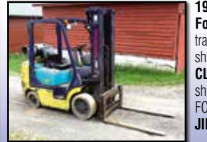
'96 KOMATSU 4,480#

1996 KOMATSU Model FG25ST-12, 4,480# Cushion Tired Forklift , s/n 10001A, powered by LP gas engine and shuttle transmission, equipped with 188" 3-stage mast, 45" forks, side shift, and FOPS canopy. In good condition with good tires.