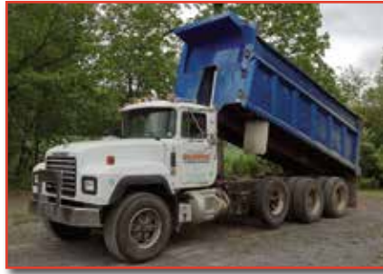
'96 MACK RD688S