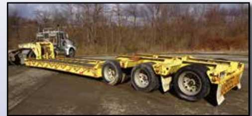
'01 TALBERT 55 TON

2001 TALBERT T30W55HRG-1-T1, 55 Ton Tri Axle Lowboy Trailer , non ground bearing hydraulic detachable goose neck, 23' level deck, 8'3" over tandems, flip-up airlift 3rd axle, 102" width, air ride suspension, aluminum wheels, chain dogs, outriggers, and 255/70R22.5 tires. In good condition with good tires.