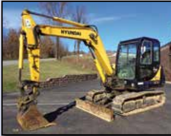
'08 HYUNDAI ROBEX 55-7A

2008 HYUNDAI Robex 55-7A Mini , s/n M80610099, Yanmar dsl, 5' dipper stick, manual coupler, auxiliary hydraulics, swing boom, WB 18" digging bucket with rock teeth, 76" backfill blade, and 16" TBG pads with bolt-on street pads. In good condition with good undercarriage. (Meter Reads 2,449 Hours)