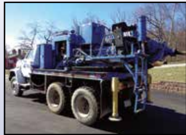
STERLING TD MARAUDER

STERLING HD Marauder , s/n 1409, Ford V-8 gas, with 3" Kelly bar, extending and rotating table, Braden hydraulic winch, 30' pole length, 12' digging depth, 1991 INTERNATIONAL 4900 T/A Production Digger, Int'l DT466 dsl and auto trans, spring/beam suspension, (4) hydraulic outriggers, 385/65R22.5 front and 11R22.5 rear tires. In good condition with good tires.