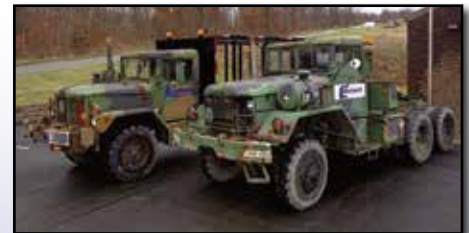
(2) OF (3) MILITARY 6X6 TRUCKS

1970 AM General M818, 5 Ton, 6x6 Military Truck Tractor , C12413244, Cummins dsl and 5 spd trans with 2 spd transfer case, front and rear glad hands, fixed 5th wheel, pintle hitch, spring suspension, 80,000 lb. GVWR, and 11.00R20 tires. In good condition with good tires.