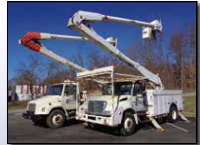
'03 ALTEC AA755L 55'

2003 ALTEC AA755L, 55' , s/n 1003BZ2584, insulated upper boom, lower boom insert, 600 lb. capacity double man basket, hydraulic tool outlets, material handling jib, mtd on 2004 INTERNATIONAL 4300 S/A Line Body Truck, Int'l DT466, 7.6L dsl and 6 spd trans, 14'4" full line body, cab protector, pintle hitch with air and electric, air brakes, (4) hydraulic outriggers, and 11R22.5 tires. In good condition with good tires.