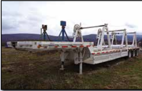
'83 AZTEC TRI-AXLE DROP DECK

1983 AZTEC Tri-Axle Drop Deck Reel Trailer, 9'6" upper deck, 29'6" lower deck, (3) hydraulic reel stands, hydraulic power pack with Robbins twin cyl gas, spring suspension, material baskets, (2) roller stands, 72,000 lb. GVWR, and 10R17.5 tires. In good condition with good tires.