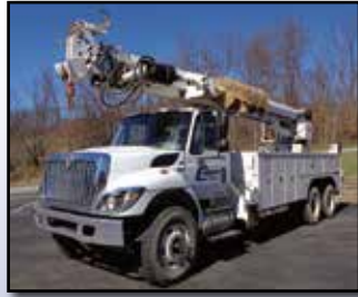
'11 ALTEC D4065ATR (34,171 MILES)

2011 ALTEC D4065ATR Rear Center Mtd Digger Derrick , s/n 0211DF0382, 15,000 lb. winch capacity, 25' to 65' 4-section hydraulic boom, insulated upper section, 2-spd digger head, pole grabs with tilt, 2011 INT'L 7400 Work Star T/A Line Body Truck, Int'l Maxxforce 6 cyl dsl and Allison auto trans, (4) hydraulic outriggers, 40,000 lb. rear and 16,000 lb. front axle, 17'6" full line body, 36" rear work platform, auxiliary hydraulics with self-winding hose reel, spring/beam suspension, pintle hitch with air and electric, CC, AC, 56,000 lb. GVWR, 315/80R22.5 front and 11R22.5 rear tires. In good condition with good tires. (Odometer Reads 34,171 Miles) (PTO Meter Reads 1,423 Hours)