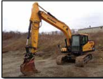
'16 HYUNDAI HX160L (451 HOURS)

2015 HYUNDAI Robex 160LC-9A , s/n 0193, Perkins dsl, 11'8" dipper stick, Geith hydraulic coupler, auxiliary hydraulics, AIM 14" digging bucket, rear view camera, EROPS w/heat and AC, and 23.5 TBG pads. In very good condition with good to very good undercarriage. (Meter Reads 1,212 Hours)