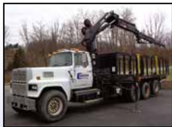
'86 FORD LTL9000 WITH HIAB KNUCKLEBOOM

1999 FORD F-800 S/A Derrick Truck , Cummins 5.9L dsl and auto trans, Pitman Polecat 12'3" to 18'6" 9,000 lb. hydraulic boom, with boom tip winch and (2) hydraulic stabilizers, 22'6" wooden flatbed with 15" steel sides and ratchet straps, AC, 26,000 lb. GVWR, and 295/75R22.5 tires. In good condition with good tires.