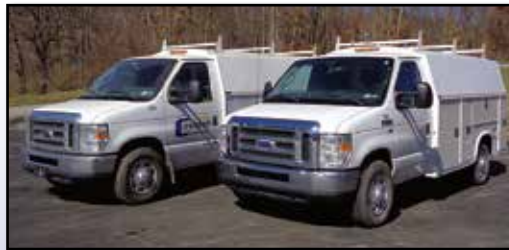
14 & 10 FORD E-350 UTILITY VANS

1996 FORD E-350, 13-Passenger Bus , 8 cyl dsl and auto trans, 225/75R16 tires. In fair to poor condition with good tires.