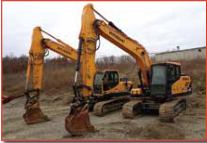
'16 & '15 HYUNDAI 160

PRE-SORTED FIRST CLASS MAIL US POSTAGE PAID HAVERTOWN, PA PERMIT #45