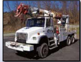
'01 ALTEC D4060TR, 6X6

2001 ALTEC D4060TR Rear Center Mtd Digger Derrick , s/n 0801CK0191, 10,200 lb. winch capacity, 25' to 50' 4-section hydraulic boom, insulated upper section, pole grabs with tilt, dual hydraulic tool outlets, 2002 FREIGHTLINER FL80, 6x6 Truck, Cat 3126 dsl and Allison auto trans, (4) hydraulic outriggers, 40,000 lb. rear and 18,000 lb. front axle, Altec 17'6" steel body, front bumper winch, capstan winch, pintle hitch with air and electric, spring/beam suspension, CC, AC, 58,000 lb. GVWR, 385/65R22.5 front and 11R22.5 rear tires.