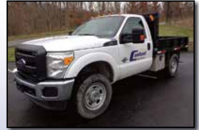
16 FORD F-350 SUPER DUTY 4X4

2016 FORD F-350 Super Duty 4x4 Stake Body , Power Stroke 6.7L dsl and auto trans, 8'10" steel flatbed with 12" solid metal sides, dual tow hitch with electric, PW, PL, CC, AC, and 275/70R18 tires. In good condition with fair to good tires. (Odometer Reads 15,367 Miles) (TITLE DELAY)