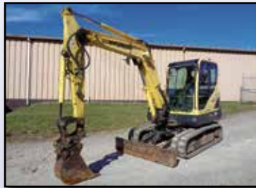
'10 HYUNDAI ROBEX 55-9

2010 HYUNDAI Robex 55-9 Mini , s/n 1409, Yanmar dsl, 6'3" dipper stick, manual coupler, auxiliary hydraulics, swing boom, WB 12" digging bucket, 75" backfill blade, EROPS w/heat and AC, and 16" rubber tracks. In good condition with good tracks. (Meter Reads 2,114 Hours)