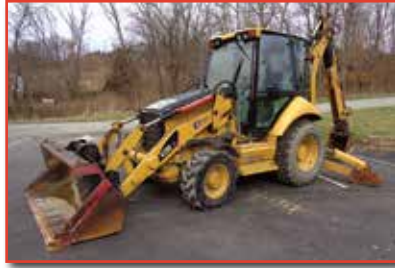
'11 CAT 420E IT 4X4 EXTEND-A-HOE

1440 COWPATH RD. • HATFIELD, PA 19440 215/361-9099 • Fax: 215/361-9212 www.hunyady.com