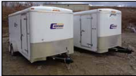
'16 HOMESTEADER 16'

(2) 2016 HOMESTEADER 716CT, 16' T/A Cargo Trailers, 16' aluminum cargo body, fold down rear and curbside door, 7,000 lb. GVWR, and 205/75D15 tires. In good condition with good tires.