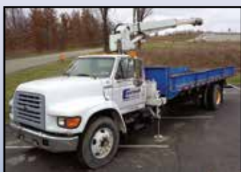
'99 FORD F-800 WITH PITMAN POLECAT

1986 FORD LTL9000 Tri-Axle Knuckleboom Truck , Cat 3406B dsl and Fuller 8LL, 10 spd trans, 1993 Hiab 260 AWV-91, 8-section, hydraulic Knuckleboom, s/n 5364, 22'3" steel flatbed, 23' reel carrier, air ride tag axle, double frame, spring suspension, pintle hitch with air and electric, (2) hydraulic extending outriggers, 57,900 lb. GVWR, 425/65R22.5 front, 11R24.5 rear, and 11R22.5 tag axle tires. In good condition with good tires. (Odometer Reads 045,620 Miles) (Meter Reads 5,554 Hours)