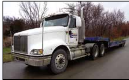
'02 INT'L 9400I & '98 LANDOLL 30 TON ROLLBACK

2002 INTERNATIONAL 9400i T/A Truck Tractor , Cummins 460HP dsl and Fuller 18 spd trans, wetline, double frame, aluminum wheels and headache rack, pintle hitch with air and electric, 3-stage engine brake, fixed 5th wheel, air ride suspension, 171" wheelbase, CC, AC, 80,000 lb. GVWR, and 11R24.5 tires. In good condition with good tires.