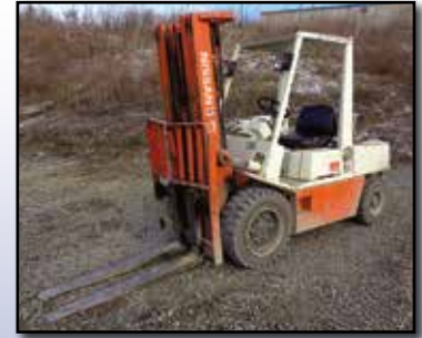
'90 NISSAN 5,600 LB

1990 NISSAN RGH02A30V, Type G, 5,600 lb Cushion Tired , s/n RGH02-920035, Nissan dual fuel gas and shuttle trans, 187" 3-stage mast, 48" forks, FOPS, 28x9-15 front and 6.50-10-500F rear tires. In good condition with good tires. (Operating on Propane)