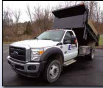
16 FORD F-550XL SUPER DUTY 4X4 (5,794 MILES)

2016 FORD F-550XL Super Duty 4x4 Dump , Power Stroke 6.7L dsl and auto trans, 11' steel mason dump body, frame mtd storage boxes, pintle and ball hitches, running boards, PW, PL, CC, AC, and 225/70R19.5 tires. In very good condition with very good tires. (Odometer Reads 5,794 Miles) (TITLE DELAY)