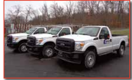
'16 FORD F-250XL 4X4 PICKUPS