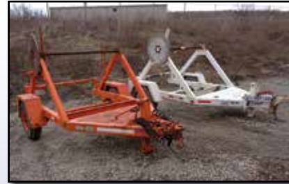
(2) OF (3) SINGLE AXLE REEL TRAILERS

2008 BROOKS BROTHERS SLR716 S/A Hydraulic Reel Trailer, 5-position reel carrier, 6,600 lb. GVWR, and 235/80R16 tires. In good condition with good tires.