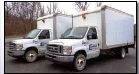
(2) 10 FORD E-350 SUPER DUTY CARGO VANS