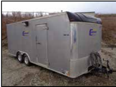
'16 UNITED 20'

2016 UNITED UXT-8.520TA35, 20' T/A Cargo Trailer, 20' aluminum cargo body with fold down rear and curbside door, electric outlets, electric heat, exterior work lighting, alloy wheels, 7,000 lb. GVWR, and 205/75R15 tires. In good to very good condition with very good tires.