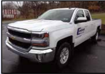
17 CHEVY SILVERADO 1500 LT 4X4

2017 CHEVROLET Silverado 1500 LT 4x4 Crew Cab Pickup , 5.3L gas and auto trans, 8' bed, PW, PL, CC, AC, tow package, and 255/70R17 tires. In very good condition with good to very good tires. (Odometer Reads 35,115 Miles) (TITLE DELAY)