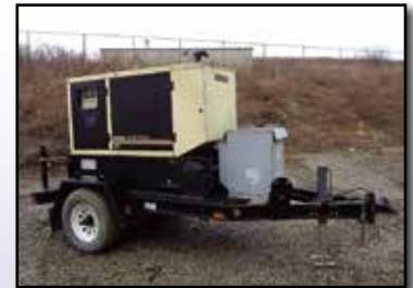
'10 KOHLER 40KW

2010 KOHLER 40KW Generator , Mitsubishi dsl, Leroy Somer generator, 25KVA transformer with switch gear, mtd on Felling S/A tag-a-long trailer, (3) manual stabilizers, 8,200 lb. GVWR, and 235/80R16 tires. In good condition with good tires.