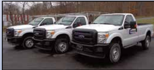
(3) 16 FORD F-250XL 4X4 PICKUPS

(3) 2016 FORD F-250XL Super Duty 4x4 Pickups , 6.2L gas and auto trans, 8' bed with spray-on liner, running boards, PW, PL, CC, AC, tow package, and 245/75R17 tires. In good condition with very good to excellent tires. (Odometers Read 40,395 Miles; 50,576 Miles, and 52,156 Miles) (2 With Material Racks) (TITLE DELAYS)