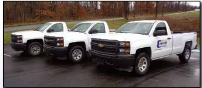
(3) 14 CHEVY SILVERADO 1500 4X4 PICKUPS

(3) 2014 CHEVROLET Silverado 1500, 4x4 Pickups , 5.3L gas and auto trans, 8' bed with spray-on liner, cross toolbox, tow package, PL, CC, AC, and 265/70R17 tires. In good condition with good tires.