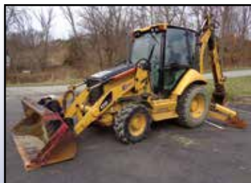
'11 CAT 420E IT 4X4 EXTEND-A-HOE

2011 CATERPILLAR 420E IT , 4x4, s/n DAN01179, Cat 3054 dsl and powershift trans, Cat GP loader bucket, hydraulic coupler, front and rear auxiliary hydraulics, EROPS with heat, 12.5/80-18 front and 19.5Lx24 rear tires. In good condition with good tires. (Meter Reads 4,190 Hours)