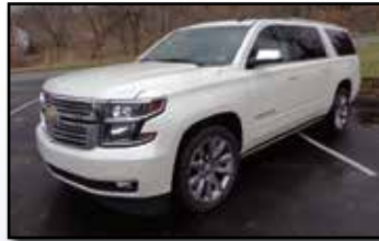
15 CHEVY SUBURBAN 1500 LTZ 4X4

2015 CHEVROLET Suburban 1500 LTZ 4x4 SUV , Vortec 5.3L gas and auto trans, 3rd row seating, power package, CC, drop down running boards, leather interior, alloy wheels, and 285/45R22 tires. In very good condition with very good tires. (Odometer Reads 65,056 Miles)