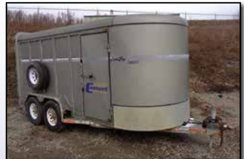
'02 CORNELIUS 16'

2002 CORNELIUS CornPro 16' T/A Cargo Trailer, 16'x7' steel cargo body with swing rear and curbside doors, spring suspension, 12,000 lb. GVWR, and 235/85R16 tires. In good condition with good tires.