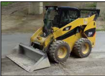
'12 CAT 262C

2012 CATERPILLAR Model 262C Skid Steer Loader , s/n MST05238, powered by Cat C3.4 diesel engine and 2 speed hydrostatic transmission, equipped with general purpose loader bucket, high flow auxiliary hydraulics, hydraulic coupler, enclosed cab with heat and air conditioning, and 12-16.5 tires. In good condition with good tires. (Meter Reads 2,710 Hours) (Purchased New)