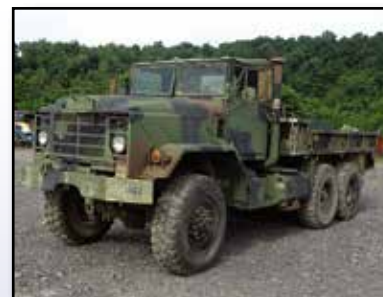
'92 BMY M923A2

5 Ton, 6x6 Flatbed Truck, powered by Cummins diesel engine and automatic transmission, equipped with 14' steel flatbed body, spring suspension, tow package with air, and 14.00R20 tires. In good condition with good tires. (No Title)