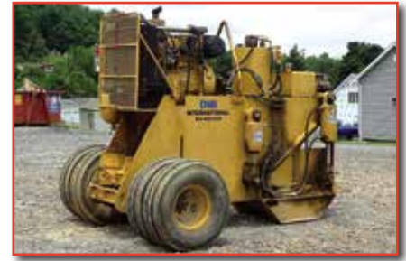
'10 DMI PBM 6" TO 20"