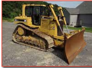
'06 CAT D6RXL III

1440 COWPATH RD. • HATFIELD, PA 19440 215/361-9099 • Fax: 215/361-9212 www.hunyady.com