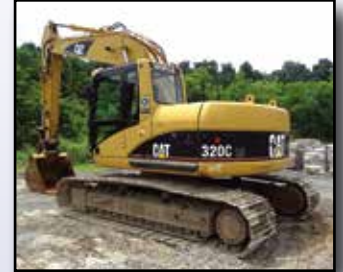
'05 CAT 320C LU

2005 CATERPILLAR Model 320C LU Hydraulic Excavator , s/n PAC00732, powered by Cat diesel engine and hydraulic drive, equipped with 9'6" dipper stick, digging bucket, hydraulic coupler, auxiliary hydraulics, enclosed cab with heat and air conditioning, and 31.5" TBG pads (with 1 built up grouser on alternating pads). In good condition with good undercarriage. (Meter Reads 07,320 Hours) (Purchased New)