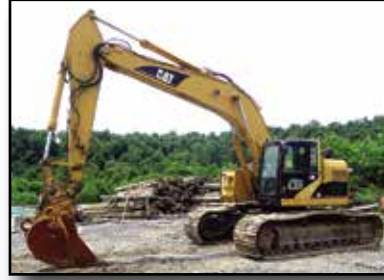
'06 CAT 325C LCR

2006 CATERPILLAR Model 330CL Hydraulic Excavator , s/n DKY04485, powered by Cat C-9 diesel engine and hydraulic drive, equipped with 11' dipper stick, digging bucket, hydraulic coupler, auxiliary hydraulics, enclosed cab with heat and air conditioning, and 31.5" SBG and 33.5" TBG alternating pads. In good condition with good undercarriage. (Meter Reads 06,776 Hours) (Purchased New)