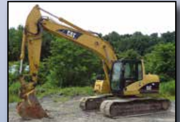
'03 CAT 320C LU

2003 CATERPILLAR Model 320C LU Hydraulic Excavator , s/n PAC00374, powered by Cat diesel engine and hydraulic drive, equipped with 9'6" dipper stick, digging bucket, hydraulic coupler, auxiliary hydraulics, enclosed cab with heat and air conditioning, and 31.5" TBG pads. In good condition with good undercarriage. (Meter Reads 09,186 Hours) (Purchased New)