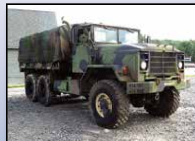
'91 BMY M923A2

5 Ton, 6x6 Flatbed Truck, powered by Cummins diesel engine and automatic transmission, equipped with 14' steel flatbed body with fold-down sides, tarp, tow package with air, onboard air compressor with air lines to tires, and 14.00R20 tires. In good condition with good tires. (Title)