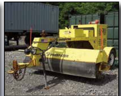
'08 SWEEPSTER 8'

MOROOKA Model MST-800 Crawler Dumper/Tack Wagon , s/n 2760, powered by Mitsubishi 4 cylinder diesel engine and hydrostatic transmission, equipped with 8'8" dump body with fold down sides, welding lead stands, tow hitch, and 23.5" rubber tracks. In fair to good condition with good tracks. (Meter Reads 4,429 Hours)