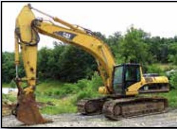
'04 CAT 330CL

2004 CATERPILLAR Model 330CL Hydraulic Excavator , s/n DKY01697, powered by Cat C-9 diesel engine and hydraulic drive, equipped with 11' dipper stick, digging bucket, hydraulic coupler, auxiliary hydraulics, enclosed cab with heat, and 31.5" SBG and 33.5" TBG alternating pads. In good condition with good undercarriage. (Meter Reads 10,492 Hours) (Purchased New)