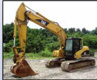
'05 CAT 320C LU

2004 CATERPILLAR Model 330CL Hydraulic Excavator , s/n DKY01697, powered by Cat C-9 diesel engine and hydraulic drive, equipped with 11' dipper stick, digging bucket, hydraulic coupler, auxiliary hydraulics, enclosed cab with heat, and 31.5" SBG and 33.5" TBG alternating pads. In good condition with good undercarriage. (Meter Reads 10,492 Hours) (Purchased New)