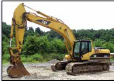
'05 CAT 330CL

2005 CATERPILLAR Model 330CL Hydraulic Excavator , s/n DKY03930, powered by Cat C-9 diesel engine and hydraulic drive, equipped with 11' dipper stick, digging bucket, hydraulic coupler, auxiliary hydraulics, enclosed cab with heat and air conditioning, and 31.5" SBG and 33.5" TBG alternating pads. In good condition with good undercarriage. (Meter Reads 07,019 Hours) (Purchased New)