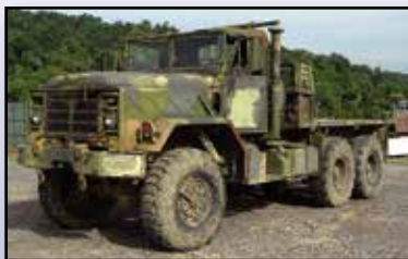
'92 BMY M923A2

5 Ton, 6x6 Flatbed Truck, powered by Cummins diesel engine and automatic transmission, equipped with 14' steel flatbed body, spring suspension, tow package with air, onboard air compressor with air lines to tires, and 14.00R20 tires. In good condition with good tires. (No Title)