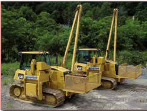
(2) CAT/MIDWESTERN PIPELAYERS

PRE-SORTED FIRST CLASS MAIL US POSTAGE PAID HAVERTOWN, PA PERMIT #45