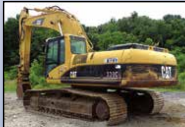
'03 CAT 330CL

2003 CATERPILLAR Model 330CL Hydraulic Excavator , s/n DKY00952, powered by Cat C-9 diesel engine and hydraulic drive, equipped with 11' dipper stick, digging bucket, hydraulic quick coupler, auxiliary hydraulics, enclosed cab with heat, and 33.5" TBG pads. In good condition with good undercarriage. (Meter Reads 07,906 Hours) (Purchased New)