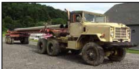
'90 BMY AND '12 MAGNOLIA 67'

M931A2 , 5 Ton, 6x6 Truck Tractor, powered by Cummins diesel engine and automatic transmission, equipped with stationary 5th wheel, tow package, spring suspension, onboard air compressor with air lines to tires, and 395/85R20 tires. In good condition with good tires. (Title)