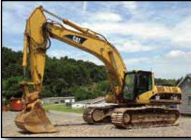
'06 CAT 330CL

2006 CATERPILLAR Model 330CL Hydraulic Excavator , s/n DKY04485, powered by Cat C-9 diesel engine and hydraulic drive, equipped with 11' dipper stick, digging bucket, hydraulic coupler, auxiliary hydraulics, enclosed cab with heat and air conditioning, and 31.5" SBG and 33.5" TBG alternating pads. In good condition with good undercarriage. (Meter Reads 06,776 Hours) (Purchased New)