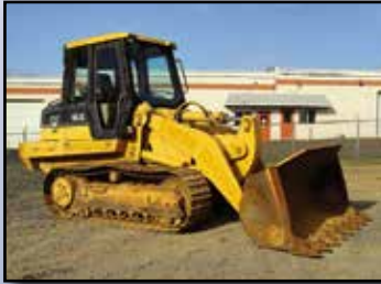
'99 CAT 953C

1999 CATERPILLAR Model 953C Crawler Loader , s/n 2ZN02363, powered by Cat 3116 diesel engine and hydrostatic transmission, equipped with GP bucket with teeth and segments, EROPS cab with air conditioning, and 19.5" DBG pads. In good condition with fair to good undercarriage. (Meter Reads 6,281 Hours)