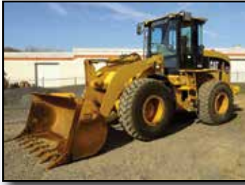
'04 CAT 928G

2004 CATERPILLAR Model 928G Rubber Tired Loader , s/n DJD00723, powered by Cat 3056E diesel engine and powershift transmission, equipped with 2.9 cu. yd. GP bucket with teeth and segments, ride control, EROPS cab with air conditioning, and 20.5R25 tires. In good condition with good tires. (Meter Reads 4,702 Hours) (Recent ECM Replaced and New Electronic Injection Pump)