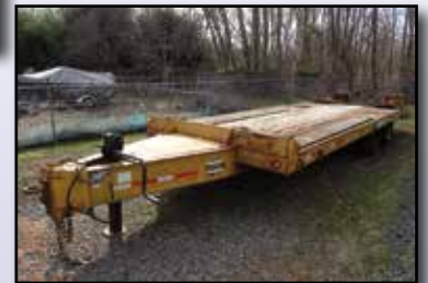
'98 EAGER BEAVER 20 TON

2005 CHEVROLET Model 1500 Silverado Pickup Truck , powered by V-6, 4.6L gas engine and automatic transmission, equipped with 8' bed with side boxes, air conditioning, and 245/70R17 tires. In good condition with good tires. (Odometer Reads 96,019 Miles)