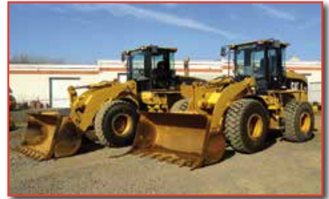
'04 AND '98 CAT 928G