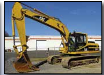
'99 CAT 320BL

1994 CASE Model 580 Super K, 4x4 Tractor Loader Extend-A-Hoe , s/n JJG0183304, powered by Case diesel engine and shuttle transmission, equipped with GP bucket, 24" digging bucket, 12" mechanical thumb, 4-stick control, EROPS cab with heat, and foam filled front tires. In good condition with good to very good tires. (Meter Reads 5,604 Hours)