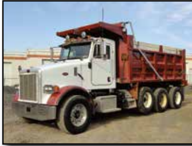
'05 PETERBILT 357

2005 PETERBILT Model 357 Tri Axle Dump Truck , powered by Cat C-13, 430HP diesel engine and Eaton Fuller 8LL, 10 speed transmission, equipped with Beau-Roc 16' steel dump body with 2-way air gate and power tarp, 46,000# rear and 18,740# front axles, 17,000# airlift 3rd axle, Hendrickson Haulmax block/bushing suspension, 3-stage engine brake, tow package with air, front aluminum wheels, cruise control, air conditioning, and 385/65R22.5 front and 11R22.5 rear tires. In good condition with good tires. (Odometer Reads 186,705 Miles)