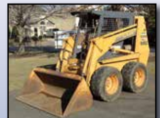
'98 CASE 1845C

Skid Steer Attachments: (2) BOBCAT Hydraulic Tilt-Tatch Bucket Couplers • (2) FFC 72" Soil Preparators • LOWE Trencher Attachment, 36" bar, with rock chain (New Chain 2016) • Hydraulic Posthole Auger, hex drive, with 15" and 9" bits • FFC 72" Hopper Broom • 72" GP Bucket, with welded hitch receiver • 48" Fork Attachment • (4) Used 12-16.5 Tires, foam-filled with rims, fair condition