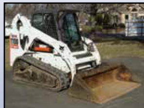
'11 BOBCAT T190

2011 BOBCAT Model T190 Crawler Skid Steer Loader , s/n A3LN38377, powered by Kubota diesel engine and 2 speed hydrostatic transmission, equipped with 72" GP bucket, Power Bob-Tach coupler, standard auxiliary hydraulics, 7-pin electric connector, joystick pattern selector, RC ready, EROPS cab with air conditioning, and 12" rubber tracks. In good condition with excellent undercarriage. (Meter Reads 1,554 Hours) (New Tracks With 10 Hours)