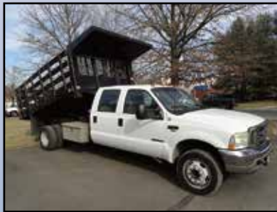
'03 FORD F-550 XL SD

2003 FORD Model F-550 XL SD Crew Cab Stake Body Dump Truck , powered by Powerstroke 7.3L diesel engine and automatic transmission, equipped with Knapheide 12' stake dump body with under body toolbox, dual rear wheels, tow package with electric, and 225/70R19.5 tires. In good condition with good tires. (Odometer Reads 175,830 Miles) (GVWR 17,500 Lb)