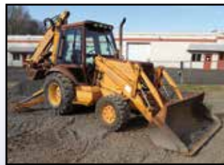
'94 CASE 580 SUPER K 4X4

1994 CASE Model 580 Super K, 4x4 Tractor Loader Extend-A-Hoe , s/n JJG0183304, powered by Case diesel engine and shuttle transmission, equipped with GP bucket, 24" digging bucket, 12" mechanical thumb, 4-stick control, EROPS cab with heat, and foam filled front tires. In good condition with good to very good tires. (Meter Reads 5,604 Hours)