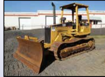
'01 CAT D5C XL SERIES II

2001 CATERPILLAR Model D5C XL Series III Hystat Crawler Tractor , s/n 7PS01494, powered by Cat 3046 diesel engine and hydrostatic transmission, equipped with 6-way blade, OROPS canopy, and 20" SBG pads. In good condition with fair undercarriage. (Meter Reads 3,993 Hours)