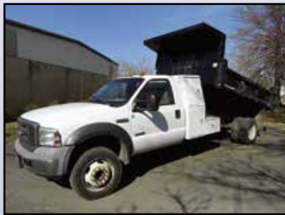
'05 FORD F-550

2003 FORD Model F-550 XL SD Crew Cab Stake Body Dump Truck , powered by Powerstroke 7.3L diesel engine and automatic transmission, equipped with Knapheide 12' stake dump body with under body toolbox, dual rear wheels, tow package with electric, and 225/70R19.5 tires. In good condition with good tires. (Odometer Reads 175,830 Miles) (GVWR 17,500 Lb)