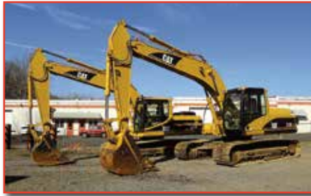
'02 CAT 320CL AND '99 CAT 320BL

1440 COWPATH RD. • HATFIELD, PA 19440 215/361-9099 • Fax: 215/361-9212 www.hunyady.com