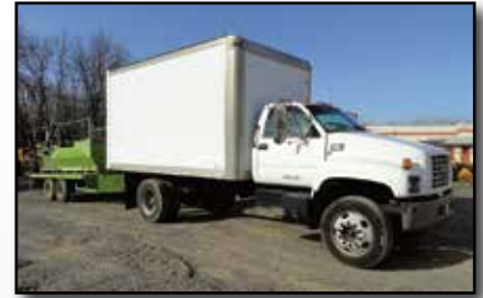
'98 GMC C6500

1998 GMC Model C6500 Single Axle Straight Truck , powered by V-8, 6.0L gas engine and 5 speed transmission with 2 speed rear, equipped with Morgan 14' van body with roll-up door, electric/hydraulic brakes, tow package with electric, dual rear wheels, air conditioning, and 245/75R22.5 tires. In good condition with good tires (Odometer Reads 099,545 Miles) (City Steering)