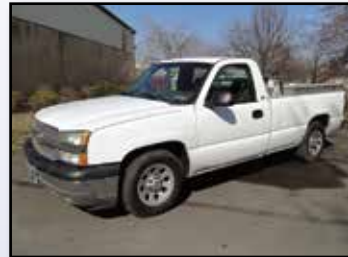
'05 CHEVY 1500 SILVERADO

2005 CHEVROLET Model 1500 Silverado Pickup Truck , powered by V-6, 4.6L gas engine and automatic transmission, equipped with 8' bed with side boxes, air conditioning, and 245/70R17 tires. In good condition with good tires. (Odometer Reads 96,019 Miles)