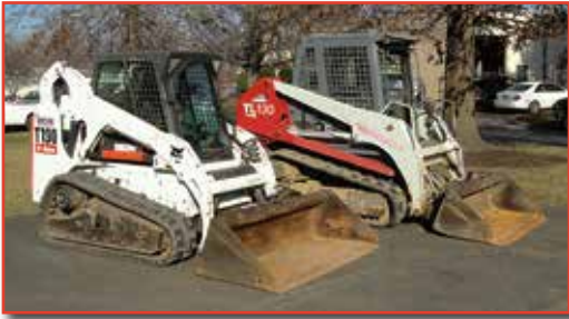
'11 BOBCAT T190 AND '07 TAKEUCHI TL130

PRE-SORTED FIRST CLASS MAIL US POSTAGE PAID HAVERTOWN, PA PERMIT #45