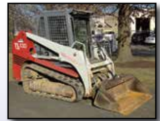
'07 TAKEUCHI TL130

2007 TAKEUCHI Model TL130 Crawler Skid Steer Loader , s/n 21310112, powered by Yanmar diesel engine and 2 speed hydrostatic transmission, equipped with 66" GP bucket, manual coupler, standard auxiliary hydraulics, EROPS cab with air conditioning, and 12" rubber tracks. In good condition with excellent undercarriage. (Meter Reads 03,975 Hours) (New Tracks & Sprockets With 20 Hours)