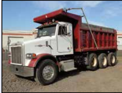
'00 PETERBILT 357