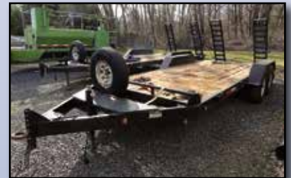
(2) '99 FOSTER 5 TON

1999 FOSTER 5 Ton Tandem Axle Tag-A-Long Trailer , equipped with 16'x82" wood deck with ramps, electric brakes, pintle tow, and 235/85R16 tires. In good condition with good tires. (H.D. Axles Rated 12,000 Lb)