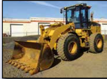
'98 CAT 928G

1999 CATERPILLAR Model 953C Crawler Loader , s/n 2ZN02363, powered by Cat 3116 diesel engine and hydrostatic transmission, equipped with GP bucket with teeth and segments, EROPS cab with air conditioning, and 19.5" DBG pads. In good condition with fair to good undercarriage. (Meter Reads 6,281 Hours)