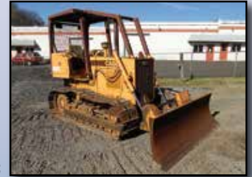
'89 CASE 450C

1989 CASE Model 450C Crawler Tractor , s/n JAK0012893, powered by Case diesel engine and powershift transmission, equipped with 6-way blade, OROPS canopy with sweeps, and 16" SBG pads. In fair to good condition with fair undercarriage. (Meter Reads 8,417 Hours)