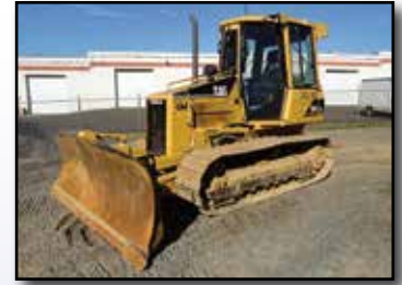
'05 CAT D5G XL

2005 CATERPILLAR Model D5G XL Crawler Tractor , s/n WGB02265, powered by Cat 3046 diesel engine and hydrostatic transmission, equipped with 6-way blade, EROPS cab with air conditioning, and 20" SBG pads. In good condition with good undercarriage. (Meter Reads 4,094 Hours)