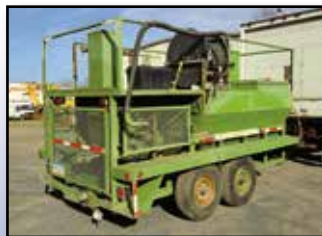
'97 BOWIE 1100

1997 BOWIE Model 1100 Portable Hydroseeder , s/n 110597981, powered by Kubota 4 cylinder water-cooled diesel engine and PTO, equipped with 1,100 gallon capacity, agitator, bale chopper, 150' of 1 1/4" hose, power reel, topside gun, and 255/90D16 tires. In good condition with good tires (Approx. 3,600 Hours)