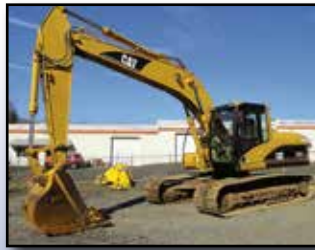
'02 CAT 320CL

40" Ripper Digging Bucket , with ripper shank (Case 1088/Poclair 160)