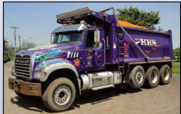
'13 MACK GU713

2016 KENWORTH T880 Tri-Axle , Cummins ISX15, 500HP diesel and Eaton Fuller 8LL, 10 spd trans, Beau-Roc 17'6" steel dump body with electric tarp and air tailgate, 46,000 lb rears, 18,740 lb front and 18,500 lb steerable lift axle, Chalmers 800 series walking beam suspension, 3-stage engine brake, full locking differentials, aluminum wheels, ac, cc, pw, pl, heated power mirrors, 385/65R22.5 front and lift, and 11R24.5 rear tires. In good to very good condition with fair and good tires. (Odometer Reads 233,427 Miles)