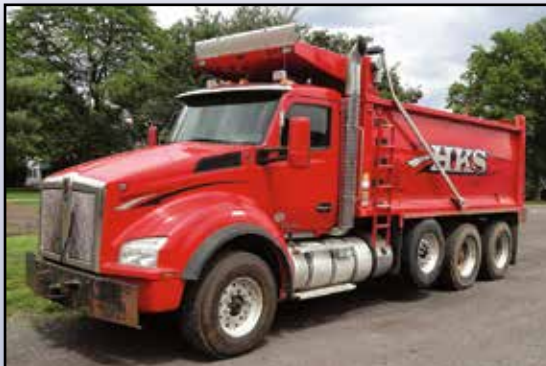
'16 KENWORTH T880

2014 MACK GU713 Tri-Axle , Mack MP8, 455HP diesel and Eaton Fuller 8LL trans, Beau-Roc 17'6" steel dump body with power tarp and air gate, 46,000 lb rears 18,000 lb front and 20,000 lb steerable lift axle, camelback suspension, 2-stage engine brake, inter axle lock, aluminum wheels, ac, cc, pw, pl, heated mirrors, 385/65R22.5 front and lift, and 12R24.5 rear tires. In good condition with fair to good tires. (Odometer Reads 298,014 Miles) (Transmission Issues-Currently Being Diagnosed @ Mack Dealer-Check Back for Details)