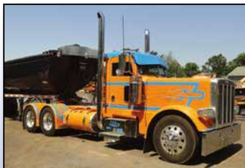
'11 PETERBILT 389

2011 PETERBILT 389 Tandem Axle , Cummins TSX525, 525HP diesel and Eaton Fuller RTL018918B, 18 spd trans, 46,000 lb rears and 12,000 lb front axle, double frame, Jost locking 5th wheel, air ride suspension, wetline, full locking differentials, 3-stage engine brake, heated mirrors, full fiberglass fenders, chrome deck plate, chrome stack extensions, aluminum wheels, LED lighting, cc, ac, pw, pl, Atlas Elite II air controlled seats, and 11R24.5 tires. In good to very good condition with very good tires. (Odometer Reads 246,025 Miles)