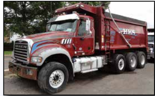
'14 MACK GU713

2016 MACK GU713 Granite Tri-Axle , Mack MP8, 455HP diesel and Maxitorque ES, T310M/MLR 10 spd trans, with multispeed reverse, Beau-Roc 17'6" steel dump body with air tailgate and power tarp, 46,000 lb rears, 18,000 lb front axle, central hydraulics, 2-stage engine brake, inter-axle lock, Mack M-Ride spring suspension, aluminum wheels, heated/power mirrors, cc, PW, PL, ac, 385/65R22.5 front and lift, and 11R24.5 rear tires. In good condition with fair and good tires. (Odometer Reads 142,168 Miles)