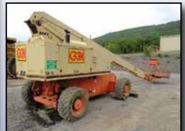
JLG 80HX 4X4

1998 JLG 80HX, 4x4 Aerial Lift , s/n 074863, Deutz diesel and hydrostatic trans, 80' platform height, 3-section straight boom, 1,000 lb platform capacity, platform level and rotate, electrical tool outlets, and 15-19.5 tires. In good condition with good tires.