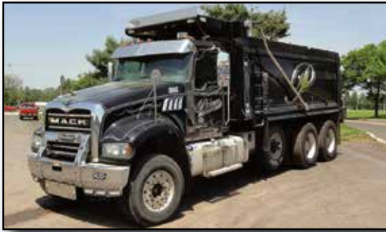
'16 MACK GU713

2016 MACK GU713 Granite Tri-Axle , Mack MP8, 455HP diesel and Maxitorque ES, T310M/MLR 10 spd trans, with multispeed reverse, Beau-Roc 17'6" steel dump body with air tailgate and power tarp, 46,000 lb rears, 18,000 lb front axle, central hydraulics, 2-stage engine brake, inter-axle lock, Mack M-Ride spring suspension, aluminum wheels, heated/power mirrors, cc, PW, PL, ac, 385/65R22.5 front and lift, and 11R24.5 rear tires. In good condition with fair and good tires. (Odometer Reads 142,168 Miles)