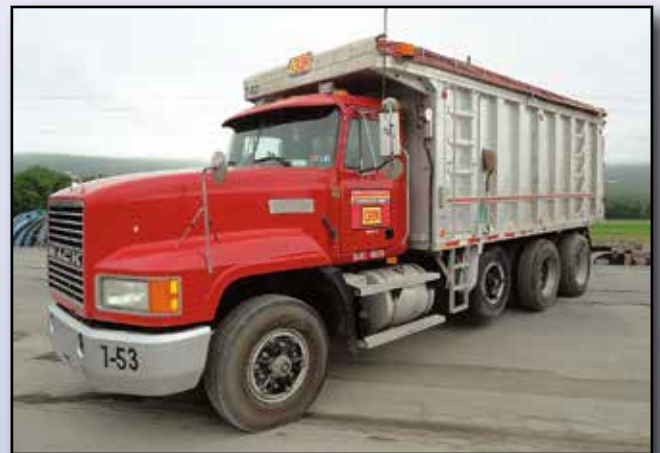
(1) OF (2) `95 MACK CL713

2000 MACK RD688S Tri-Axle , Mack E-7, 400HP diesel and Maxitorque T2130, 13 spd extended range splitter trans, J&J 17"6" aluminum box dump body with air tailgate (no tarp), 44,000 lb rears, 18,000 lb front and lift axles, 2-stage engine brake, Mack air ride suspension, aluminum wheels, ac, cc, heated mirrors, 315/80R22.5 front and lift, and 11R24.5 rear tires. In good condition with good tires.