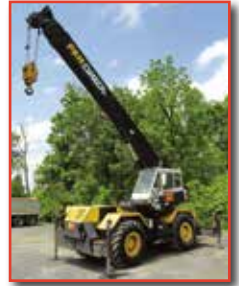
P&H OMEGA 18 TON

PRE-SORTED FIRST CLASS MAIL US POSTAGE PAID HAVERTOWN, PA PERMIT #45