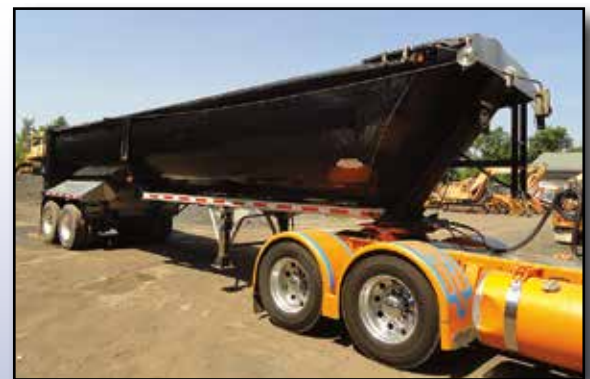
'10 MAC 34' FRAMELESS DUMP

2010 MAC 34' Frameless Half-Round Steel Dump Trailer , 2-way aluminum tailgate, power tarp, aluminum sub-frame, aluminum wheels, air ride suspension, 80,000 lb GVWR, and 11R24.5 tires. In good condition with very good tires.