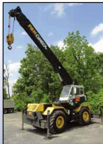
P&H OMEGA 18 TON

1998 JLG 80HX, 4x4 Aerial Lift , s/n 074863, Deutz diesel and hydrostatic trans, 80' platform height, 3-section straight boom, 1,000 lb platform capacity, platform level and rotate, electrical tool outlets, and 15-19.5 tires. In good condition with good tires.