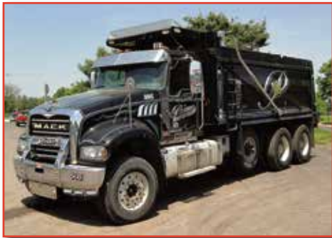
'16 MACK GU713

PRE-SORTED FIRST CLASS MAIL US POSTAGE PAID HAVERTOWN, PA PERMIT #45