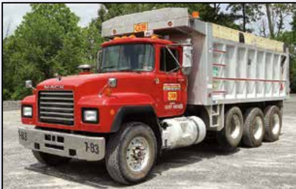
`00 MACK RD688S

1995 MACK RD688S Tri-Axle , Mack E-7, 350HP diesel and Eaton Fuller 8LL trans, Heil 17"6" steel dump body with air tailgate and power tarp, 44,000 lb rears and 18,000 lb front and lift axles, 2-stage engine brake, central hydraulics, (cab controls removed), camelback suspension, dual tires on lift axle, steel wheels, ac, 11R22.5 front and lift, and 11R24.5 rear tires. In good condition with good tires.