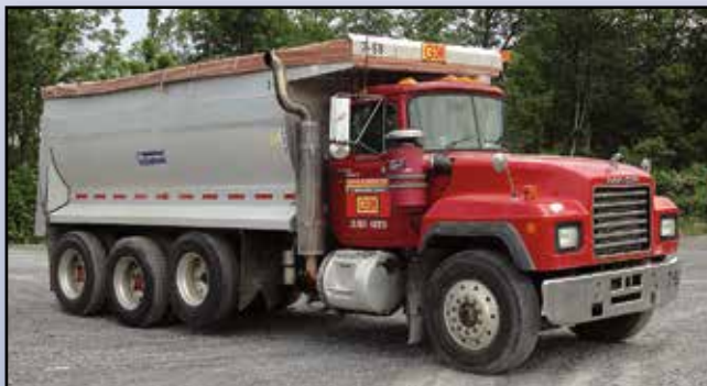
(1) OF (2) `97 MACK RD688S

1995 MACK CL713 Tri-Axle , Mack E-7, 427HP diesel and Eaton Fuller 8LL trans, Thiele 18'6" aluminum box dump body with split tailgate and power tarp, 44,000 lb rears, 20,000 lb lift and 14,060 lb front axle, 2-stage engine brake, power divider, Mack air ride suspension, steel wheels, ac, cc, heated mirrors, 315/80R22.5 front and lift, and 11R24.5 rear tires. In good condition with good to very good tires.