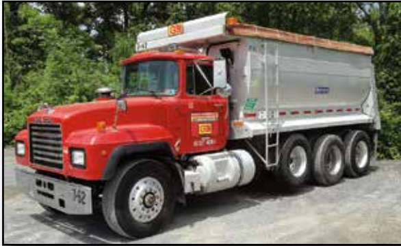
(1) OF (9) `00 MACK RD688S

(9) 2000 MACK RD688S Tri-Axles , Mack E-7, 350HP diesel and Mack T2130, 13 spd extended range splitter trans, Alumatech 17" aluminum half-round dump body with split tailgate and power tarp, 44,000 lb rears, 18,000 lb front and lift axles, 2-stage engine brake, Mack air ride suspension, aluminum wheels, ac, cc, heated mirrors, 315/80R22.5 front and lift, and 11R24.5 rear tires.