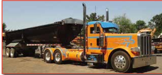
'11 PETERBILT 389 & '10 MAC 34' FRAMELESS DUMP

1440 COWPATH RD. • HATFIELD, PA 19440 215/361-9099 • Fax: 215/361-9212 www.hunyady.com