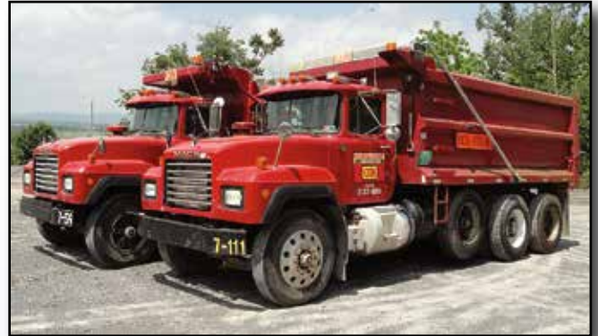
`99 & `95 MACK RD688S

(9) 2000 MACK RD688S Tri-Axles , Mack E-7, 350HP diesel and Mack T2130, 13 spd extended range splitter trans, Alumatech 17" aluminum half-round dump body with split tailgate and power tarp, 44,000 lb rears, 18,000 lb front and lift axles, 2-stage engine brake, Mack air ride suspension, aluminum wheels, ac, cc, heated mirrors, 315/80R22.5 front and lift, and 11R24.5 rear tires.