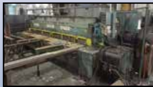
WYSONG PLATE SHEAR