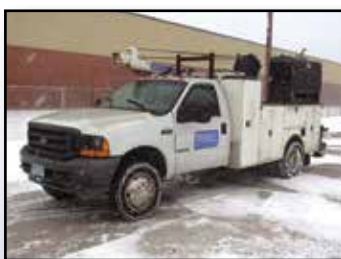
'00 FORD F-550 (WELDER SOLD SEPARATELY)

2006 FORD F-250XL Super Duty Crew Cab Utility Truck , Powerstroke 6.0L dsl and auto trans, e/w Knapheide 8' open utility body, tow package, ac, cruise control, and 245/75R17 tires. In fair condition with good tires.