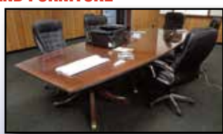
OFFICE EQUIPMENT AND FURNITURE

ASUS M32 Computer • (2) HP Pavilion Computers , with flat screen monitors • DELL Computer , with (2) flat screen monitors • (4) HP 110 Computers , with flat screen monitors • (4) Printer/Scanner/Copiers • DYNEX 32" TV • GW Video Recorder • (7) Wooden Desks , with return and chairs • (19) File Cabinets • Conference Table , with (6) chairs • Wooden Credenza • (4) Wooden Bookcases • Metal Plan Cabinet • (3) Wooden Picnic Tables • Refrigerator • Microwave • Dehumidifier • Assorted Chairs