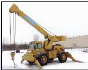
GROVE RT58, 15 TON

1986 CLARK C500YS300, 30,000# Pneumatic Tired , s/n Y1625-19-6585CB, Perkins dsl and powershift trans, e/w 92" hydraulic adjustable forks, 204" 2-stage mast, enclosed FOPS cab, and 11.00-20 tires. In fair to good condition with good and fair tires.