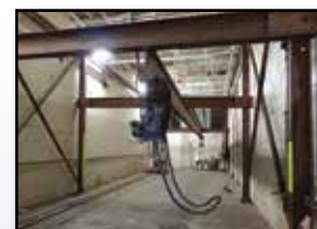
TANK ROTATING SYSTEM

(2 sets) PANDJIRIS IR10 , 16" Diameter Power Rolls, with (4) steel caster wheels and 8' of track • (1 set) PANDJIRIS 12" Diameter Tanker Rolls • (1 set) 20" Diameter Adjustable Power Rolls • (1 set) RANSOME 16" Diameter Power Rolls • (1 set) WEBB 12" Diameter Power Rolls • Assorted Sets of WEBB Power Rolls • (2 sets) 12" Diameter Pneumatic Power Rolls • (2 sets) 12" Diameter Power Rolls • (1 set) 16" Diameter Idler Rolls • (2 sets) WEBB 12" Diameter Idler Rolls • (2) 6'x3' Tank Cradles • Assorted WEBB Power Rolls • Portable Pneumatic Pressure Testing Unit • Stationary Pneumatic Pressure Testing Unit • (4) 55 Gallon Drums Corrosion ISO Resin • (18 Boxes) JUSHI Fiberglass