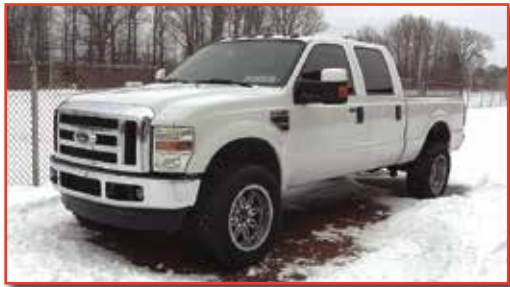
'08 FORD F-250 LARIAT 4X4

1440 COWPATH RD. • HATFIELD, PA 19440 215/361-9099 • Fax: 215/361-9212 www.hunyady.com