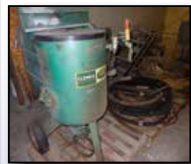
CLEMCO 2452 SANDBLAST POT