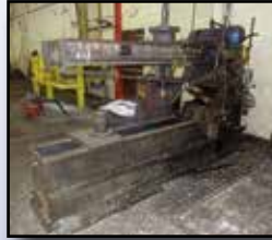
BLUE VALLEY 4-466

Plate Rolls, Flangers, and Bevelers: BERTSCH 11-1/2" x 10' Mechanical Plate Roll, s/n M-9985 • WEBB R3L-113, 5 3/4" x 8' Mechanical Plate Roll • BLUE VALLEY MACHINE & MANUFACTURING CO. 4-466 Flanger, 3/8" capacity • BLUE VALLEY MACHINE & MANUFACTURING CO. 2-786 Flanger, 10-gauge capacity • BLUE VALLEY MACHINE & MANUFACTURING CO.