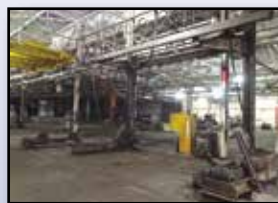
REED-WEBB TANK WELDER

DEUMA Type MBLR10S Large Tank Internal Welding and Clamping System , s/n 4012, e/w Lincoln DC600 electric welder, Lincoln NA-3N wire feeder, Lincoln Power Flux system, Invincible flux vacuum recovery system, 8'6"x32" adjustable roller cradle, 11' diameter hydraulic alignment clamp, 8'4" diameter hydraulic alignment clamp, Reeves clamp