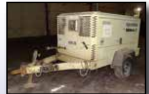
'02 IR 375CFM

2002 IR XP375WIR, 375 CFM Portable, s/n 330525UFM061, I-R 4IRB7TB dsl • IR P100, 100CFM Portable, s/n 109257-U79-901, gas • IR TS-5 Single Stage Vertical Shop Air Compressor • KOBALT Single Stage Vertical Shop, single phase electric • QUINCY 40HP Rotary Screw, with 40HP electric motor • QUINCY 50HP Rotary Screw • QUINCY 235 Rotary Screw, with 50HP electric motor • GARDNER-DENVER ADL1003, 2-Stage Horizontal Air / Gas, with 25HP electric motor • GARDNER-DENVER Single Stage Horizontal, with 10HP electric motor • RIDGID 3.5HP Portable, Honda gas • AIR TEK JW0200-C Air/Water Separator • AIR TEK Air / Water Filter • 2,000 Gallon Vertical Air Receiver Tank, 14'x5' diameter