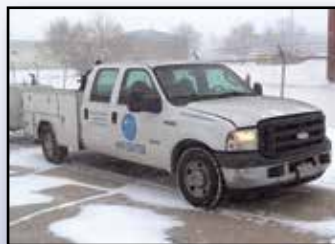
'06 FORD F-250XL

2000 FORD F-550 Service Truck , Powerstroke dsl and 5 speed trans, e/w 11' open service body, Auto Crane service crane, gas powered air compressor, work bumper with vise, dual rear wheels, and ac.