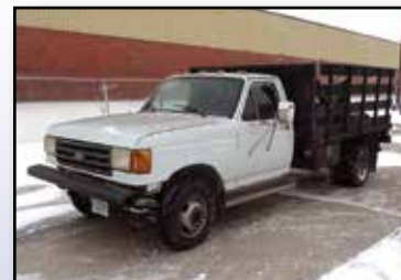
'90 FORD F-450

(2) 8'x20' Overseas Storage Containers. In good condition.