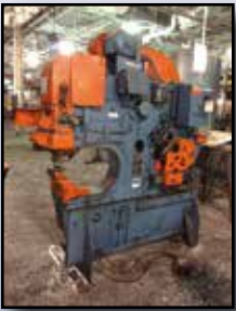
BUFFALO IRON WORKER

BUFFALO Universal 65U11905 Iron Worker, order no. 2800214, with 1 1/6" punch, 6x6x1/2" bar cutter, 3/4"x9 1/4" shear, V-notching and coping, and tooling • WYSONG 1238 Hydraulic Plate Shear, s/n P35-173, 12' width, for 3/8" plate, digital controls and shield • CINCINNATI 10' Press Brake, s/n 17830, with material scanner and manual controls (No Shields)