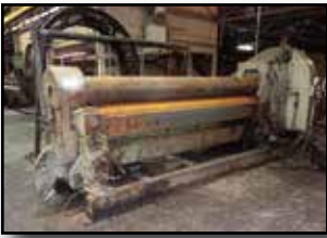
BERTSCH PLATE ROLL

45B-187 Beveler, 1/4" capacity • REED M2 Power Beveler, s/n 5692, 1/4" capacity and 6"x20" roll table • JANCY ENGINEERING CO. BM20 Beveling Machine, s/n 861090