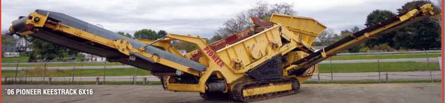
'06 PIONEER KEETRACK 6X16

Mt. Pleasant, Pennsylvania (Uniontown/Pittsburgh Area)