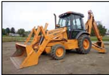
'98 CASE 580 SUPER L SERIES II 4X4

1998 CASE Model 580 Super L Series II, 4x4 Tractor Loader Extend-A-Hoe , s/n JYG0266176, Case diesel and shuttle trans, GP loader bucket, 24" digging bucket, ride control, EROPS with heat, 12x16.5NHS front and 19.5L028 rear tires. In good to very good condition with good tires.