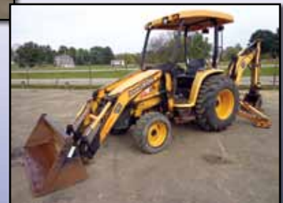
'06 JOHN DEERE 110 4X4

2006 JOHN DEERE Model 110, 4x4 Tractor Loader Backhoe , s/n 5111143, Yanmar diesel and hydrostatic trans, removable backhoe attachment, 72" GP loader bucket, 24" digging bucket, 3-point hitch, front and rear auxiliary hydraulics, manual quick coupler, light package, 10x16.5 front and 17.5x24 rear tires. In fair to good condition with good tires.