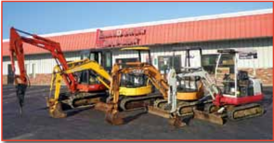
(4) OF (5) MINI EXCAVATORS