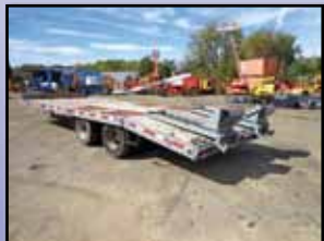
'07 VIKING 10 TON