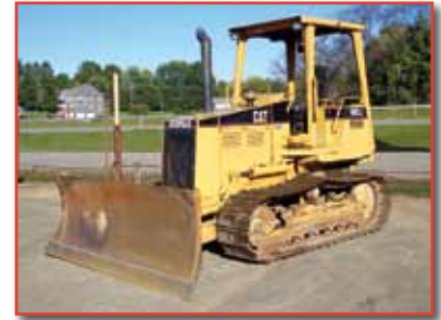
'94 CAT D4C XL III