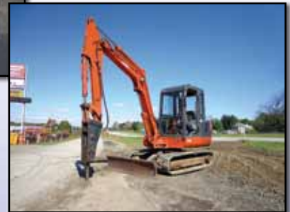
'99 THOMAS TS-45S

1999 THOMAS Model TS-45S Mini Excavator , s/n NS4520059, Isuzu diesel, 6'6" dipper stick with hydraulic beyond, 24" digging bucket, 6' backfill blade, enclosed cab and rubber tracks. In good to very good condition with good to very good undercarriage. (2,344 Hours) BODINE APWS-210 Stump Sheer Attachment • Hydraulic Auger Attachment (E70B) • Hammer (Thomas TS-45S)