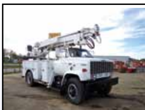
TELELECT C130 DIGGER DERRICK

1984 GMC Model 7000 Single Axle Digger Derrick, Cat 3208 diesel and 5 speed trans with 2 speed rear, Telelect C130 rear center mounted digger derrick, s/n C130-1273, 15,600# capacity, 3-section hydraulic boom with pole grabber and Braden winch, 18" auger, rear hydraulics, (4) hydraulic outriggers, and 11R22.5 tires. In good condition with good tires.