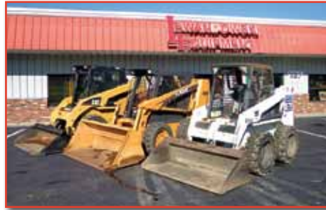
(3) OF (6) SKID STEERS