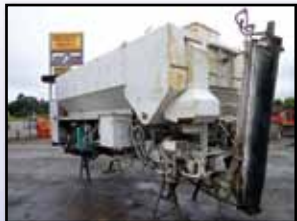
DAFFIN MOBILE CONCRETE MIXER

DAFFIN Mobile Concrete Mixer, Onan 2 cylinder diesel. In fair to good condition.