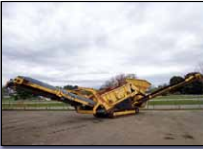
'06 PIONEER SCREENING PLANT

2006 PIONEER KEESTRACK 6x16 Crawler Screening Plant , s/n 2022618, Cummins diesel, 6'x16' double deck screen, 9' tapered hopper with hydraulic folding sides, 60" x 20' front discharge conveyor, hydraulic folding side discharge conveyor, 14'6" crawlers, and 18" TBG pads. In good to very good condition with good to very good undercarriage.