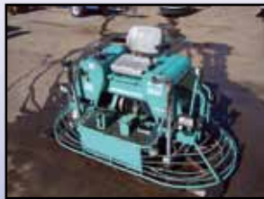
WHITEMAN POWER TROWEL

WHITEMAN Model HTH44TK Ride-On Power Trowel, s/n GH2000198, Kubota diesel and hydro-static trans. In very good condition. (118 Hours)