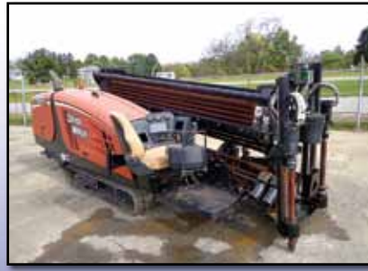
'05 DITCH WITCH JT1220 MACH 1

2005 DITCH WITCH Model JT1220 Mach 1 Horizontal Directional Drill , s/n 220247, Cummins B3.3 diesel, 12,000 lb. pullback, 10,000 lb. thrust, 1,400 ft. lb torque, 320' drill stem, auto stake down, fluid system, joystick controls, and 12" rubber tracks. In good to very good condition with good undercarriage. (532 Hours)