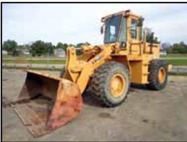
'91 KAWASAKI 70Z III

FORD Model FZ111V Rubber Tired Loader , s/n C456840, JD diesel and powershift trans, GP loader bucket, EROPS with AC, and 15.5-25 tires. In good condition with fair tires. FLECO 8' Root Rake . In good condition. (Fits Cat 955)