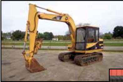
'90 CAT E70B

1990 CATERPILLAR Model E70B Hydraulic Excavator , s/n 7YF02807, Mitsubishi diesel, 7' dipper stick, 32" digging bucket, manual thumb, enclosed cab, 8'6" crawlers, and 21" TBG pads. In good condition with good undercarriage.