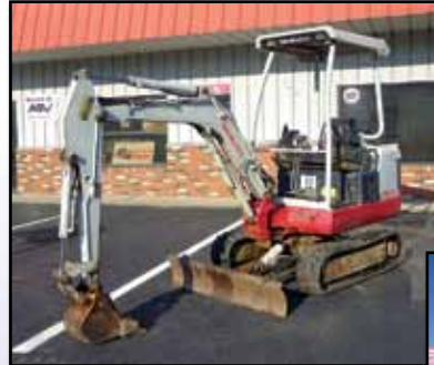
'99 TAKEUCHI TB016

1990 CATERPILLAR Model E70B Hydraulic Excavator , s/n 7YF02807, Mitsubishi diesel, 7' dipper stick, 32" digging bucket, manual thumb, enclosed cab, 8'6" crawlers, and 21" TBG pads. In good condition with good undercarriage.