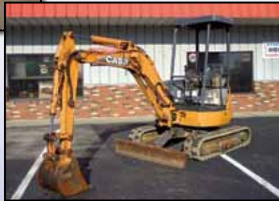
CASE CX25 ZTS

CASE Model CX25 ZTS Mini Excavator , s/n PV09-22100, Yanmar diesel, 3'9" dipper stick with hydraulic beyond, 18" digging bucket, 4'10" backfill blade, canopy, 12" rubber tracks. In good condition with good to very good undercarriage. (1,678 Hours)