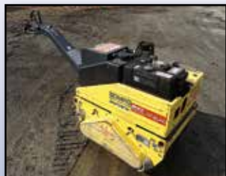
'12 BOMAG BW65H

1999 INGERSOLL RAND Model SD-70D Pro Pac Vibratory Compactor , s/n 158431, powered by Cummins 4B3.9 diesel engine and hydrostatic transmission, equipped with 66" smooth drum, drum drive, ROPS canopy, and 14.9x24 tires. In good condition with good to very good tires.