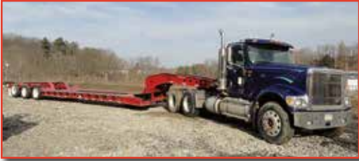
'00 INT'L 9900i EAGLE AND '15 FONTAINE 50 TON

PRE-SORTED FIRST CLASS MAIL US POSTAGE PAID HAVERTOWN, PA PERMIT #45