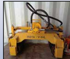
UNUSED ROTA-VIBE ATTACHMENT

(2) 25' Extendable Work Bridges • 12' Work Bridge Insert (Sold Separately)