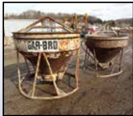
GARBRO CONCRETE BUCKETS

GARBRO 2 CY Concrete Bucket • GARBRO 1.25 CY Concrete Bucket • 1998 FASCUT FS600 Electric Rebar Bender/Cutter, s/n 7338 (Rebar Cap #6-3/4") • CORECUT CC6500 Walk Behind Concrete Saw, s/n 1258496, Wisconsin 4 cylinder gas (0,558 Hours) • 36" & 24" Concrete Saw Blades • TARGET Roll-O-Matic Electric Masonry Saw, 18" blade capacity • MORRISON 54" Hydraulic Screed, Wisconsin 1 cylinder gas, power travel • MAX RB655 Cordless Rebar Tier • (4) WACKER Electric Concrete Vibrators • (4) FORNEY Press Air Meters • (2) Slump Cones • FORNEY Roll-O-Meter • (2) Concrete Hoppers and (6) 4' Chutes • (2) 48" Bull Floats • 10' Bull Float • (4) Straight Edges • Float Handles • Approximately (20) Concrete Blankets • Small Quantity Rebar Chairs • (12 Boxes) 6" Plastic Concrete Test Cylinders