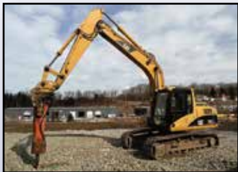
'03 CAT 315CL (HAMMER SOLD SEPARATELY)

2008 CATERPILLAR Model 324DL Hydraulic Excavator , s/n JJG00830, powered by Cat C-7 Acert diesel engine, equipped with 9'6" dipper stick with Cat hydraulic coupler and hydraulic beyond, Cat 48" digging bucket, enclosed cab with heat and air conditioning, and 32" TBG pads. In good condition with good undercarriage. (Meter Reads 3,334 Hours) (Purchased from Cleveland Bros. Thru Rental Conversion)