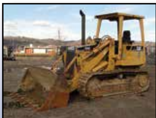
'98 CAT 939C

1998 CATERPILLAR Model 939C Crawler Loader , s/n 6DS00511, powered by Cat 3046 diesel engine and hydrostatic transmission, equipped with general purpose loader bucket with teeth, 4-piece rear counterweight with tow bar, ROPS canopy, and 16" DBG pads. In good condition with good undercarriage.