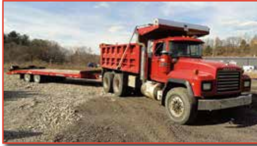
'00 MACK RD688S AND '15 ROGERS 21 TON

1440 COWPATH RD. • HATFIELD, PA 19440 215/361-9099 • Fax: 215/361-9212 www.hunyady.com