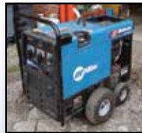
'05 MILLER WELDER

2005 MILLER Bobcat 225 Portable Welder, s/n LF265990, Kohler CH205 gas engine (0,319 Hours) (Purchased New) • (3) GORMAN RUPP 3" Electric Submersible Pumps (220 volt) • GORMAN RUPP 2" Electric Submersible Pump (110 volt) • WACKER 2" Electric Submersible Pump (110 volt) • 3" Trash Pump, Kubota gas • HONDA EM3800SX Portable Generator, 8HP gas • BOMAG T58 Gas Powered Foot Compactor • GROUND POUNDER GP3000 Plate Compactor, Kohler gas • (2) CHERNE 12" to 24" Pipe Plugs • (2) 60# Paving Breaker • THOR Size 38 Pneumatic Rock Drill • SULLAIR Chipping Hammer • (2) COFFING 3-Ton Chain Hoists • HITACHI NR90AE Pneumatic Framing Nailer • BOSTICH Pneumatic Finish Nailer • (2) HILTI DX36M Powder Actuated Tool • DEWALT 18 Volt Cordless Drill • DAYTON Electric Reciprocating Saw • WERNER 2732 Aluminum Pick Board • WERNER 40' Aluminum Extension Ladder • (3) MILLER Horizontal Life Line Systems (180' each) • (2) Retractable Safety Lines • Small Quantity Safety Harnesses • (4) Adjustable Scaffold Legs • (3) Sprayers (1 Unused)