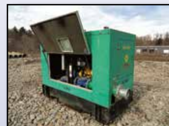
'00 GORMAN RUPP PRIME AIR 6" PUMP

(4 Sections) Discharge and (3 Sections) 6" Suction Hose