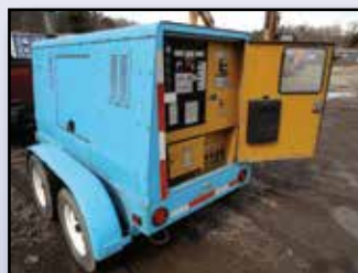
WACKER 25KW GENERATOR

WACKER Model G25T, 25KW Portable Generator , s/n 751701017, powered by Perkins diesel engine, equipped with 3-phase continuous rating of 20/25 KW/KVA, 240Y/480Y volt, 60/30 amp and single phase continuous rating of 14/14 KW/KVA, 120/240 volt, 60 amps, and 205/75R14 tires. In good condition with good tires.