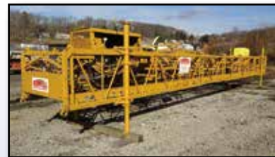
'98 BIDWELL 3600-364

1998 BIDWELL Model 3600-364 Bridge Deck Finisher , s/n 364-222-98, powered by Kohler 20HP gas engine, equipped with 30' basic machine, (3) 6' inserts for paving widths up to 48', 48" double roll finisher with augers and fog mist spray system, powered by Kohler 20HP gas engine, (42) 10'6" pieces of screed rail (441 LF), yokes and accessories. In good condition. (One Unused Spare Engine) (Purchased New)