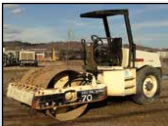
'99 IR SD-70D

1999 INGERSOLL RAND Model SD-70D Pro Pac Vibratory Compactor , s/n 158431, powered by Cummins 4B3.9 diesel engine and hydrostatic transmission, equipped with 66" smooth drum, drum drive, ROPS canopy, and 14.9x24 tires. In good condition with good to very good tires.