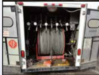
'00 THAWZALL 5A GROUND HEATER

2000 THAWZALL Model 5A Portable Ground Heater , s/n 090025, equipped with 280,000BTU diesel fired boiler, 5-zone heating loops with 500' hose per loop, 160 gallon diesel tank, 50 gallon poly glycol tank, 3,000' electric winding hose reel, and 225/75R16 tires. In good condition with good tires.