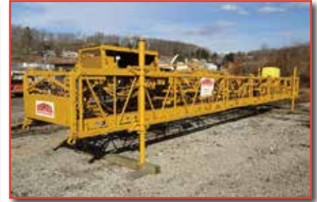
'98 BIDWELL 3600-364