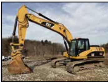
'08 CAT 324DL

2008 CATERPILLAR Model 324DL Hydraulic Excavator , s/n JJG00830, powered by Cat C-7 Acert diesel engine, equipped with 9'6" dipper stick with Cat hydraulic coupler and hydraulic beyond, Cat 48" digging bucket, enclosed cab with heat and air conditioning, and 32" TBG pads. In good condition with good undercarriage. (Meter Reads 3,334 Hours) (Purchased from Cleveland Bros. Thru Rental Conversion)