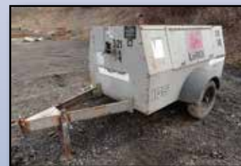
'99 LEROI 185CFM

1999 LEROI Model Q185DJ-E Portable Air Compressor , s/n 3449X527, powered by John Deere diesel engine, equipped with 205/75D15 tires. In good condition with good tires.