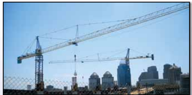
UNIT #2745 AND UNIT #2292

Unit #1977 1996 TEREX/PEINER Model SK315, 12.5 Metric Ton Hammer-head Tower Crane, s/n SK315-008, equipped with 8-piece 229'8" jib, 64' counter jib, (10) model TS212 19'4" tower sections, 2/4-part trolley, model SRWB66, 79KW hoist winch, hook block, and full set of counterweights. In good condition. (Disassembled In Maxim Yard) (Fontana, CA)