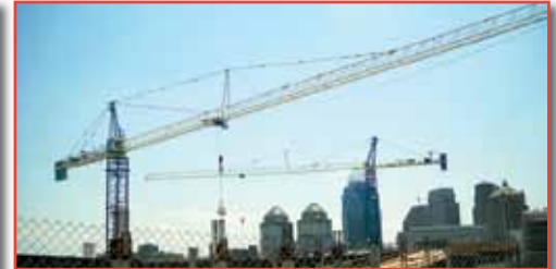
(2) OF (5) TEREX-PEINER TOWER CRANES