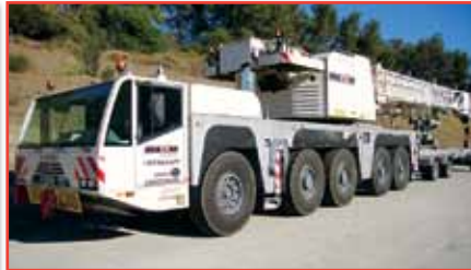
'05 DEMAG 170 TON