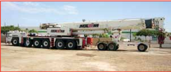
'98 LIEBHERR 300 TON

BID DEADLINE: TUESDAY, AUGUST 28, 2012 5:00 PM EDT