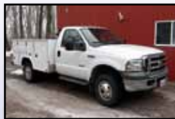
'05 FORD F-350XL 4X4

2000 FORD F-550XL Super Duty Service Truck , Powerstroke 7.3L dsl and 5 speed trans, 11' open service body, Miller Bobcat 225G welder/generator with Onan gas, PTO powered air compressor, dual rear wheels, AC, and 225/70R19.5 tires. In good condition with good tires. (AE&H)