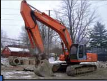
'98 HITACHI EX330LC-5

2005 CATERPILLAR M316C Rubber Tired , s/n BDX02163. Cat dsl and hydrostatic trans, 9' dipper stick with hydraulic beyond, 24" digging bucket, AC, (4) hydraulic outriggers, and 10.00x20 tires. In good condition with very good tires. (5,293 Hours)