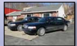
(2) '06 LINCOLN TOWN CARS

(2) 2006 LINCOLN Town Car Signature 4-Door Sedans , V-8 gas and automatic trans, keyless entry, leather interior, power windows and locks, cruise control, AC, and 225/65R17 tires. In good condition with good tires.