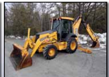
'04 JD 310SG