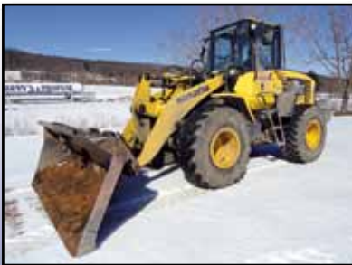
'05 KOMATSU WA250

2005 KOMATSU WA250-5 Rubber Tired Loader , s/n 70764, Komatsu dsl and ps trans, GP loader bucket, quick coupler with auxiliary hydraulics, and EROPS. In good condition with good tires. (5,801 Hours)