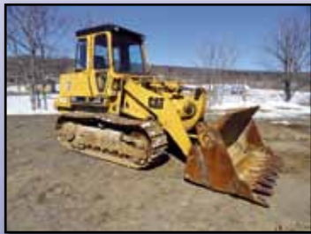
'95 CAT 953B

1987 CATERPILLAR 963 LGP Crawler Loader , s/n 21Z01564, Cat 3304 dsl and hydrostatic trans, GP loader bucket with teeth, hydraulic quick coupler, and 22" DBG pads. In good condition with fair undercarriage. (TRU-LINE)