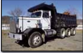
'87 AUTOCAR TRI-AXLE

1990 AUTOCAR WHITE GMC Tri-Axle Dump Truck , Cummins NTC400 dsl and Eaton Fuller RTOF14708LL, 8LL, 10 speed trans, J&J 17'6" steel dump body with air gate and power tarp, 46,000# rears, 3-stage Jake brake, spring suspension, heated mirrors, AC, 315/80R22.5 front and 11R24.5 rear tires. In good condition with good tires. (0087,421 Original Miles)