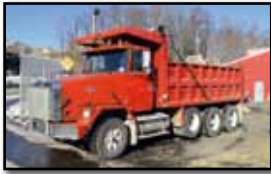
'90 AUTOCAR TRI-AXLE

1990 AUTOCAR WHITE GMC Tri-Axle Dump Truck , Cummins NTC400 dsl and Eaton Fuller RTOF14708LL, 8LL, 10 speed trans, J&J 17'6" steel dump body with air gate and power tarp, 46,000# rears, 3-stage Jake brake, spring suspension, heated mirrors, AC, 315/80R22.5 front and 11R24.5 rear tires. In good condition with good tires. (0087,421 Original Miles)