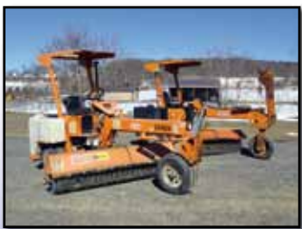
'07 LAY-MOR 8HC AND '93 6HB

175/80D13 rear tires. In good condition with good tires.