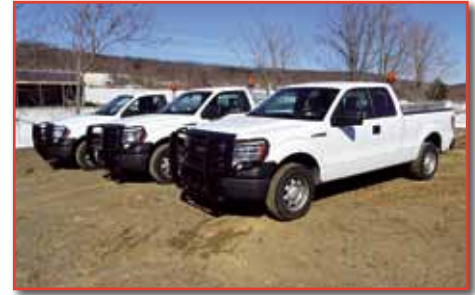
(3) OF (5) 2010 FORD F-150