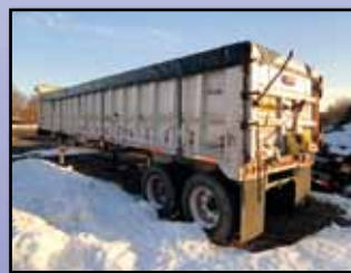
'94 TIBROOK 40' ALUMINUM DUMP

2006 TALBERT 55 Ton Tri-Axle Lowboy Trailer , non-ground bearing hydraulic detach, 24'5" x 8'6" load deck, 12' over axles, airlift 3rd axle, chain dogs, outriggers, and 275/70R22.5 tires. In good condition with good tires. (TRU-LINE)