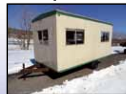
8X16 OFFICE TRAILER

Shopmade Single Axle Water Wagon, 525 gallon poly water tank and 10.00R20 tires. In fair to good condition with fair to good tires.