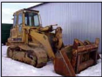
'87 CAT 963

2005 CATERPILLAR 953C Loader , s/n BBX01405, Cat 3126 dsl hydrostatic trans, GP loader bucket with teeth and cutting segments, Cat hydraulic quick coupler, and EROPS with AC. In good condition with good to very good undercarriage. (Approximately 2,000 Hours on DCF Undercarriage) (AE&H)