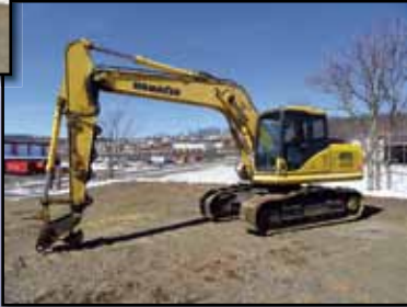
'06 KOMATSU PC160LC-7KA

2006 KOMATSU PC160LC-7KA , s/n K41107, Komatsu dsl, 9'6" dipper stick with hydraulic beyond and Wain Roy coupler, 30" digging bucket, manual quick coupler, thumb bracket, AC, 24" TBG and street pads. In good condition with good undercarriage. (0,3021 Hours)