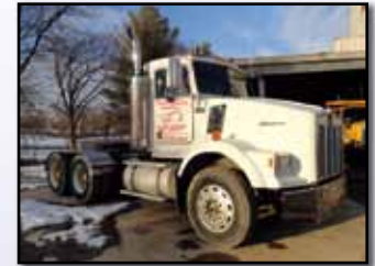
'88 KENWORTH T800

1996 PETERBILT 379 Tri-Axle Truck Tractor , Cat 3506E, 475HP dsl (turned up 525+ HP) and Eaton Fuller 18 speed trans, 46,000# rears, 12,000# front axle, Pete Low Air leaf suspension, 3-stage engine brake aluminum bulkhead, aluminum wheels, suspension dump valve, AC, and 11R24.5 tires. In good condition with good tires.