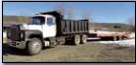
'88 MACK WITH '97 TOWMASTER 20 TON

1987 AUTOCAR VOLVO WHITE DK64 Tri-Axle Dump Truck , Cummins KTC300, 300HP dsl and Fuller 8LL, 10 speed trans, 17' steel dump body with manual tarp, 3-stage Jake brake, spring suspension, airlift 3rd axle, 218" wheelbase, 11R24.5 front and rear and 285/75R24.5 lift axle tires. In good condition with good tires.