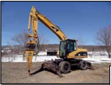
'05 CAT M316C

1998 HITACHI EX330LC-5 , s/n 1H1P020452, Isuzu dsl, 13' dipper stick, 42" digging bucket, AC, 31.5 TBG pads. In good condition with good undercarriage. (TRU-LINE)