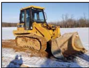
'05 CAT 953C

2005 JOHN DEERE 550J LGP Tractor , s/n 101783, JD dsl and hydrostatic trans, 6-way straight blade, multi-shank ripper, joystick steering, OROPS, and 24" SBG pads. In good condition with good undercarriage. (3,401 Hours) (A SCOTT)