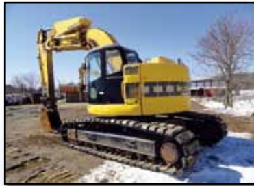
'96 KOMATSU PC228UU

1999 KOMATSU PC128UU-1E Articulated Boom , s/n 3817, Komatsu dsl, 7' dipper stick, 48" digging bucket with bolt-on cutting edge, 8' straight blade, 20" street pads. In good condition with good undercarriage.