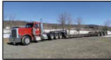
'96 PETE 379 WITH '08 FERREE 51 TON

1988 KENWORTH T800 Tandem Axle Truck Tractor , Cummins NTC350 Big Cam dsl and Eaton Fuller RT12609A, 9 speed trans, wetline kit, 38,000# rears and 12,000# front axle, air ride suspension, single frame, aluminum wheels, heated mirrors, AC, and 11R24.5 tires. In good condition with fair to good tires. (AE&H)