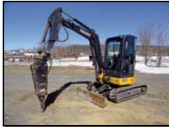
'11 JD 35D

2008 CATERPILLAR 301.8C Mini Excavator , s/n JSB03480, Mitsubishi dsl and hydraulic drive, 3' dipper stick with hydraulic beyond, WB 12" digging bucket, swing boom, 38.5" backfill blade, extendable tracks 38" to 52", OROPS, and 9" rubber tracks. In good to very good condition with good undercarriage. (952 Hours) (PENNINGTON)