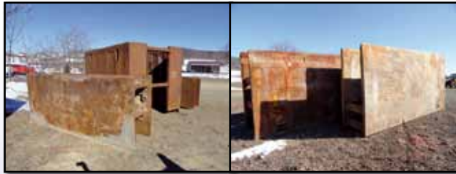
(13) TRENCH BOXES

Trench Boxes: 8'x20'x6" w/36" spreaders • 7'6"x25'x4" w/60" spreaders • 8'x20'x4" w/42" spreaders • 7'x18'x4" w/48" spreaders • 6'x20'x4" w/46" spreaders • 6'x18'x4" w/28" spreaders • 5'x15'x4" w/10' spreaders • 4'x14'x4" w/10" spreaders and 2' steel plate extension • 7'x9'x4" w/7" spreaders • 8'4"x18'x3" w/36" spreaders • 5'x12'x3" w/30" spreaders • 6'x8'x3" w/48" spreaders • 8'x10'8"x4" Manhole Box w/40" spreaders • (2) AMERICAN SHORING 48"x62" Aluminum , w/adjustable spreaders • (15) TREN-SHORE Aluminum Shoring Jacks , w/pumps • AMERICAN SHORING 6'x13'x48" Stone Box