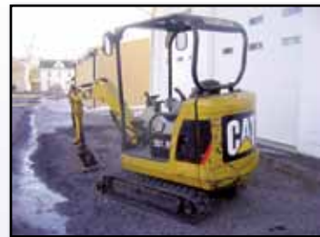
'08 CAT 301.8C

2011 JOHN DEERE 35D Mini Excavator , s/n 266036, Yanmar dsl and hydraulic drive, 52" dipper stick, 24" digging bucket, auxiliary hydraulics, manual coupler, 68" backfill blade, EROPS with AC, and 12" rubber crawlers. In very good condition with very good undercarriage. (1,213 Hours)