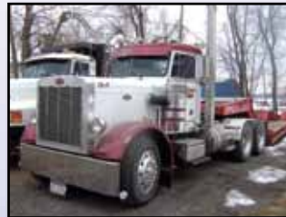
'85 PETE 359

1988 KENWORTH T800 Tandem Axle Truck Tractor , Cummins NTC350 Big Cam dsl and Eaton Fuller RT12609A, 9 speed trans, wetline kit, 38,000# rears and 12,000# front axle, air ride suspension, single frame, aluminum wheels, heated mirrors, AC, and 11R24.5 tires. In good condition with fair to good tires. (AE&H)