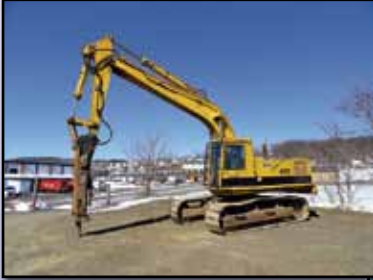
'04 CAT 235

CATERPILLAR 235 , s/n 22K03726, Cat 3306 dsl, 9'8" dipper stick with hydraulic beyond, 30" digging bucket, 30" TBG pads. In good condition with good undercarriage.