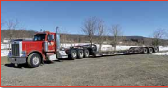
'96 PETE 379 AND '08 FERREE 51 TON