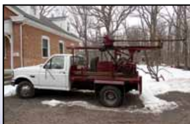
MOBILE B-40 TEST DRILL

Road Plate: 20'x8'x3/4" • 13'x5'x3/4" • 12'6"x5'x3/4" • 7'6"x9'x3/4" • 8'x3'x5/8" • 12'6"x1/2" • 10'x7'x1/2" • 10'x6'x1/2" • 9'x4'x1/2" • 8'x8'x1/2"