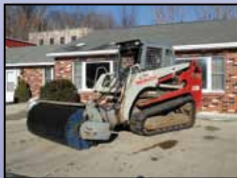
'09 TAKEUCHI TL250 (BROOM NOT IN AUCTION)

2005 JOHN DEERE 325 Skid Steer Loader , s/n 102950, JD dsl and hydrostatic trans, standard auxiliary hydraulics, foot operated bucket controls, rear pocket counterweights, OROPS, and 12-16.5 tires. In good condition with fair to good tires. (Sold Without Bucket) (SIKORA)