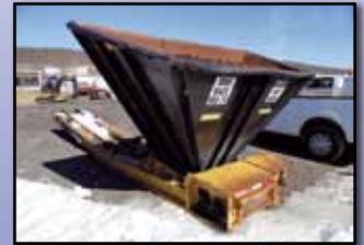
FELCO BEDDING CONVEYOR