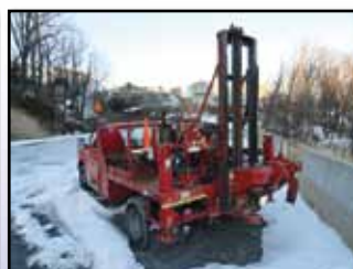
MOBILE DRILL B-31

1997 FORD F-350XL Single Axle Test Drill Truck , V-8 gas and 5 speed trans, Mobile B-40 test drill, s/n 4EX156, (4) 4'x5' and (1) 8'x5' auger flights, (2) rear hydraulic stabilizers, dual fuel tanks, dual rear wheels, AC, and 215/85R16 tires. In good condition with good tires. (TRU-LINE)