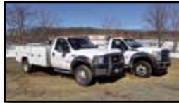
'07 FORD F550 SERVICE AND '12 FORD F-450 UTILITY

2007 FORD F-550XL Super Duty Service Truck , Powerstroke 6.0 DIT dsl and automatic trans, Reading 11' open utility body, Emglo gas power air compressor with hose reel, Miller Blue Star 6000, 180 amp/6000 watt gas powered welder generator (265 hours), tow package, dual rear wheels, chrome brush guard, AC, 19,000# GVWR, and 225/70R19.5 tires. In good condition with good tires.