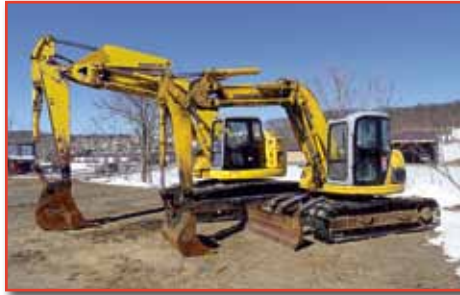
'96 PC228UU AND '99 PC128UU