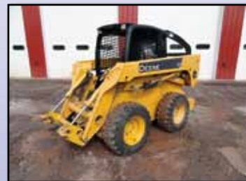
'05 JD 325

2013 BOBCAT S175 Skid Steer Loader , s/n A3L542232, Kubota dsl and hydrostatic trans, 66" GP loader bucket with teeth, auxiliary hydraulics, OROPS, and 10x16.5 tires. In very good to excellent condition with very good to excellent tires. (78 Hours) (ELEMENT)