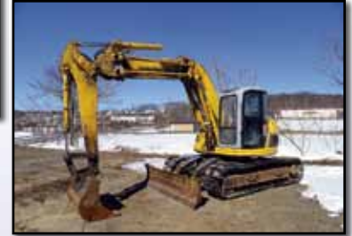
'99 KOMATSU PC128UU-1E

1996 KOMATSU PC228UU Articulated Boom , s/n 10072, Komatsu dsl, 9'6" dipper stick, CP 24" digging bucket, 24" street pads. In good condition with good undercarriage.