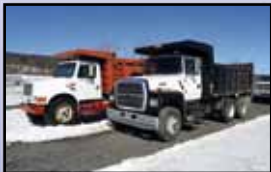
'95 FORD L8000 AND '93 INT'L 4900

1988 MACK R688ST Tandem Axle Dump Truck , Mack (reman-1998) 350HP dsl and Fuller Roadranger 9 speed trans, Galion 15' steel dump body, 38,000# rears, 12,000# front axle, tow package with air, AC, and 11R22.5 tires. In fair to good condition with good tires.