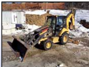
'06 CAT 420E IT

CAT 426: (2) STANLEY & ALLIED Hydraulic Plate Compactors • 48" and 30" Cleanup Buckets • 18" Digging Buckets