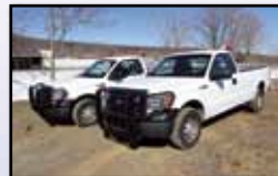
(2) OF (3) '10 F-150 PICKUPS

2010 FORD F-150XL Quad Cab Pickup Truck , Triton 4.6L V-6 gas and automatic trans with overdrive, 6'6" bed with side boxes, tow package, brush guard, AC, and 235/75R17 tires. In good to very good condition with good tires.