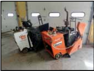
DIESEL AND GAS CONCRETE SAWS

2007 CORE CUT CC7100 Diesel Concrete Saw , s/n 1299557, Deutz 74HP dsl and hydrostatic trans, 36" blade and water system. In good condition.