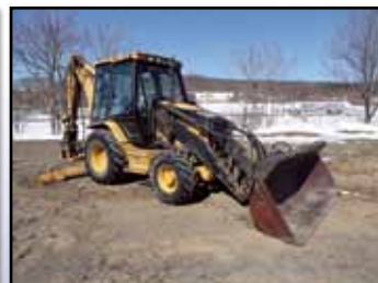
'02 CAT 420D IT