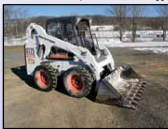
'13 BOBCAT S175

JD 50: 30" Cleanup • 24" and 18" Digging Buckets