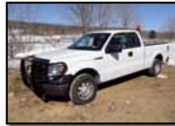
(1) OF (2) '10 F-150 QUAD CABS

2010 FORD F-150XL Quad Cab Pickup Truck , Triton 4.6L gas and automatic trans, 6'6" bed, side boxes, tow package, brush guard, AC, and 235/75R17 tires. In good to very good condition with good tires.