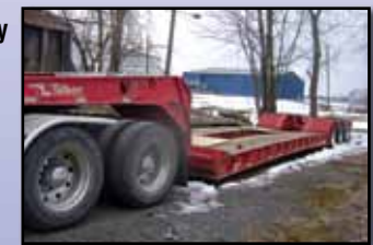
'06 TABLERT 55 TON

1985 PETERBILT 359 Tandem Axle Truck Tractor , Cat 400HP dsl and Fuller 13 speed trans, wetline kit, 40,000# rears and 12,000# front axle Peterbilt airlift suspension, air slide 5th wheel, aluminum headache rack, aluminum Budd wheels, 201" wheelbase, and 11R24.5 tires. In good condition with good tires. (TRU-LINE)