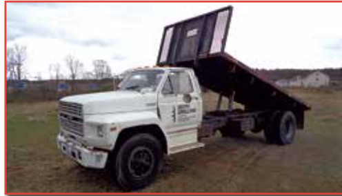
'85 FORD FLATBED DUMP