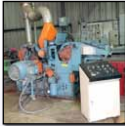
'01 NEWMAN EPR-24

1996 NEWMAN MACHINE CO. Model KF-24 Gang Rip Saw , s/n 15090, powered by 75HP electric motor, equipped with 24-1/2" arbor, (10) 14" diameter blade capacity, pneumatic and hydraulic controls, joystick console, and