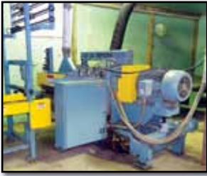
'96 NEWMAN KF-24