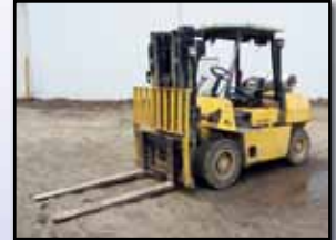
'96 HYSTER H80XL2 8,000#