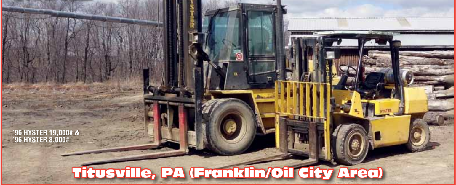
'96 HYSTER 19,000# & '96 HYSTER 8,000#