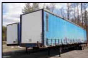
'98 NUVAN 53' AND '95 UTILITY 48'

1998 NUVAN Model VF-53102, 53' Tandem Axle Curtain Trailer , equipped with 102" width, sliding tandems, 66,000# GVWR, and 295/75R22.5 tires. In fair to good condition with good tires.