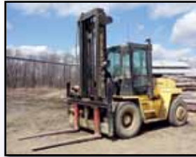
'96 HYSTER H190XL2 19,000#

1996 HYSTER Model H80XL2, 8,000# Solid Tired Forklift , s/n G005D08523T, powered by LP gas engine and powershift transmission, equipped with 172" 3-stage mast, 60" forks, side shift, FOPS canopy, work lights, 2.50x15 front and 7.00-12.5 rear tires. In good condition with poor tires.