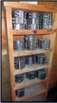
MOULDER CUTTER HEADS

Assorted Moulder Cutter Heads and Tooling