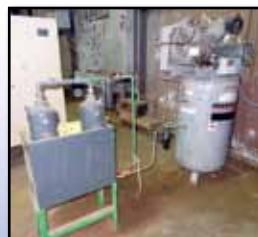
'00 IR T-30 AND '01 ZEKS AIR DRYER

250 Gallon Skid Mounted Fuel Tank, Fill-Rite manual pump • 275 Gallon Steel Fuel Tank • NORWESCO 500 Gallon Poly Tank • Shop Built Setup Stand, for knife setups • PRE-SET 25 Scale • (6) Banding Carts • (2) Electric Banding Shears • JET 6,000# Pallet Jack • DEWALT 12", 2HP Table Saw, 2'x3' table (Missing Guard) • Shop Built Cut-Off Saw, with 20" blade (No Motor) • 14" Pedestal Mounted Grinding Wheel • (2) Shop Fans