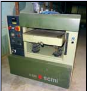
'95 SCMI S520

1995 SCMI Model S520, 20" Planer , s/n AB093924. In good condition.