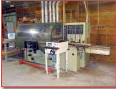
'96 SCMI SUPER SET 23