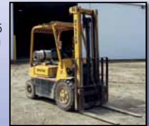
HYSTER H40H 5,200#