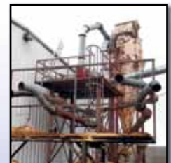
SAWDUST COLLECTION SYSTEM

RECKART Sawdust Blower Assembly , belt driven with 7.5HP electric motor. In fair condition. (Motor Poor) • 30'x12' Tapered Down to 16" Cyclone (Needs Patched) • 8'x8'x5'8" Steel Chip Bucket, with rear chains. In poor condition.