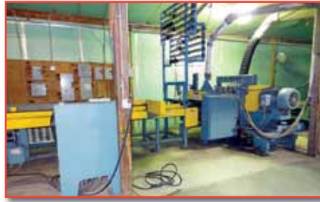
'96 NEWMAN KF-24 AND KF-100