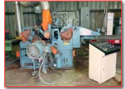
'01 NEWMAN EPR-24