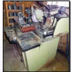
'96 SCMI 1746

1996 SCMI Model 1746, 12" Cutter Head Profile Grinder , s/n 69F74601185, 10" grinding wheel, 8" diamond tip carbide wheel, coolant system, E-Trac electric inverter. In good condition.