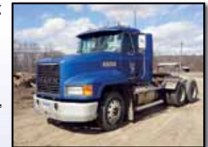
'98 MACK CH613

1998 MACK Model CH613 Tandem Axle Truck Tractor , powered by Mack E7-427, 427HP diesel engine and Fuller 10 speed transmission, equipped with 38,000# rears, 12,000# front axle, air ride suspension, Jake brake, sliding 5th wheel, 187" wheelbase, air conditioning, aluminum Budd wheels, and 11R22.5 tires. In fair condition with good tires.