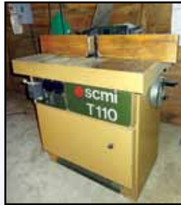
'86 SCMI T110

1995 SCMI Model S520, 20" Planer , s/n AB093924. In good condition.