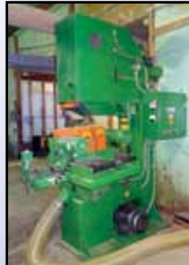
'95 TYLER XL 36"

1995 TYLER MACHINERY Model XL 36" Resaw , s/n 3850-95, (2) 8" feed belts, power feed, 15HP electric motor. In fair condition.