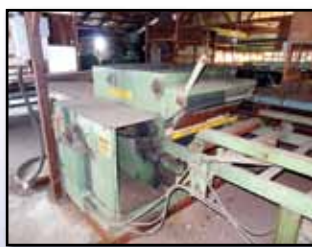
'89 RECKART R436

1989 RECKART Model R436, 36" Double Bladed Edger , s/n 006, equipped with belt feeder, 36"x7" in-feed table, 40HP electric motor with belt feed to operate saws, electric starter box, 5HP electric motor, hydraulic pump, 15 gallon hydraulic tank, and 36"x7" out-feed table. In good condition.