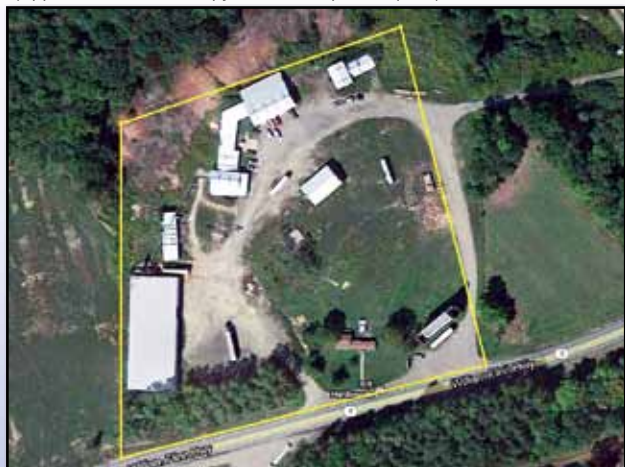
APPROXIMATE PROPERTY LINES

(9+/-) Acres, Zoned C-1 Commercial and Light Industrial, 404' of Frontage on State Route 8. Equipped with 80'x200' steel open span building with concrete floor, built in 2000, and several smaller buildings, including retail store with combined area of approximately 15,000SF. Site has a well, septic system, heavy power, and is generally level. (Appraisal and Deed Copy Available Upon Request)