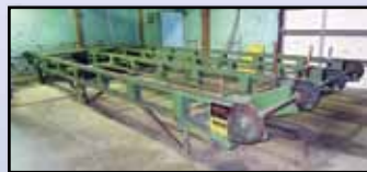
'96 RECKART 10'X25'

MELLOTT 24"x20' Feed Conveyor , nylon belt, 3HP electric motor and belt drive. In good condition.