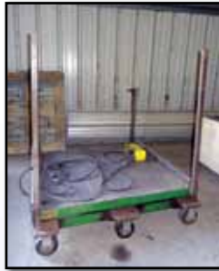
AMERICAN W2BA 8,000#

AMERICAN LIFTS Model T1-60-040, 4,000# Electric Scissor Lift Table , s/n 90529-1, 5'x10' platform. In good condition.