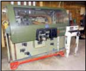
'96 SCMI SUPER SET 23