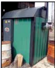
'09 CLASSIC CENTRAL BOILER

2009 CLASSIC CENTRAL Boiler , s/n 83091, with digital controls and gravity feed. In good condition.