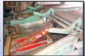
RECKART UNLOADER AND MELLOTT LOG TURNER

RECKART 10'x5' Log Deck Unloader , with 3-fingers, hydraulic operated with 30 gallon hydraulic tank, pump, foot control assembly. In good condition.