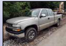
'01 CHEVY 1500 SILVERADO 4X4

2001 CHEVROLET 1500 Silverado 4x4 Extended Cab Pickup , Vortec 4.8L gas engine and automatic transmission, e/w 8' bed, power windows and locks, air conditioning, cruise control, and 245/75R16 tires. In fair to good condition with good tires.