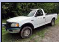
'00 FORD F-150 4X4

2000 FORD F-150, 4x4 Pickup , 4.2L, V-6 gas engine and 5 speed transmission, e/w 8' bed, 100 gallon fuel cell with pump, and air conditioning. In fair to good condition with good tires.