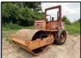
'90 CASE W602BD

1990 CASE W602BD , s/n JKC8403912, Case/Cummins diesel engine and hydrostatic transmission, e/w 69" smooth drum, roll post, and 18.6-28 tires. In fair to good condition with good tires.