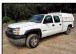
'05 CHEVY 2500 4X4

2005 CHEVROLET 2500, 4x4 Crew Cab Pickup , Vortec 6.0L gas engine and automatic transmission, e/w 8' bed with Knapheide utility cab, air conditioning, cruise control, and LT245/75R16 tires. In fair to good condition with fair to good tires.