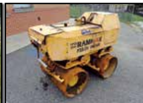
'08 RAMMAX P33/24 HHMR

1984 BOMAG BW142AD , s/n 510115923, e/w 56" smooth drum and 12.4-24 tires. (Engine Removed; Bad Crank Shaft; Will Sell With Machine)