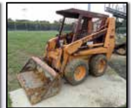
'93 CASE 1840

1993 CASE 1840 , s/n JAF0099868, Case diesel engine and hydrostatic transmission, e/w 64" general purpose loader bucket with bolt-on cutting edge, standard hydraulics, ROPS canopy, and 10-16.5 tires. In good condition with fair tires. (Reserved For Use During Loadout Thru 8/20/14)