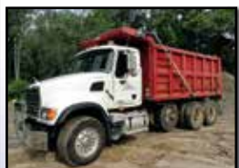
'06 MACK CV713 GRANITE

2006 MACK CV713 Granite Tri-Axle , AMI-370 diesel engine and Maxitorque T310M/MLR, 10 speed transmission with multi-speed reverse, e/w OX 16" steel dump body with air gate and power tarp, engine brake, heated mirrors, air conditioning, cruise control, 385/65R22.5 front and 11R22.5 rear and lift tires. In good condition with good tires. (All Axles New Drums and Brakes; Less Than 1,000 Miles)