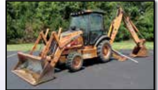
'02 CASE 580 SUPER M 4X4 E-HOE

2002 CASE 580 Super M , s/n JJG0374016, Case diesel engine and shuttle transmission, e/w general purpose loader bucket, 24" digging bucket, 2-stick controls, and enclosed ROPS cab. In good condition with fair to good tires.