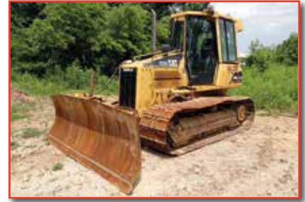
'03 CAT D5G LGP