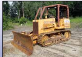
'03 CAT D5G LGP

2003 CATERPILLAR D5G LGP , s/n FDW01047, Cat 3046 diesel engine and hydrostatic transmission, e/w 6-way blade, Topcon grade control system, 3rd valve, enclosed ROPS cab with air conditioning, and 26" SBG pads. In good condition with fair to poor undercarriage.