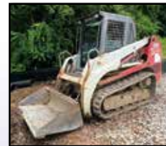
'03 TAKEUCHI TL140

2003 TAKEUCHI TL140 Crawler , s/n 21400154, diesel engine and hydrostatic transmission, e/w 66" general purpose loader bucket, standard hydraulics, and enclosed ROPS cab. In fair to good condition with fair undercarriage.