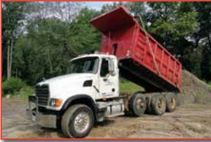
'06 MACK CV713 GRANITE