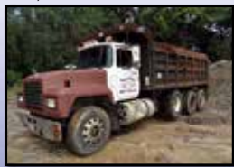
'99 MACK RD688S

1999 MACK RD688S Tri-Axle , Mack E7-350 diesel engine and Eaton Fuller 8LL transmission, e/w OX 17" steel dump body with air gate and power tarp, tow package with air, aluminum front wheels, air conditioning, cruise control, and 11R22.5 tires. In fair to good condition with fair to poor tires.