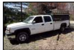
'04 CHEVY 2500HD 4X4

2004 CHEVROLET 2500HD, 4x4 Crew Cab Pickup , Vortec 6.0L gas engine and automatic transmission, e/w 8' bed with enclosed utility cap, side boxes, and air conditioning. In good condition with good tires.