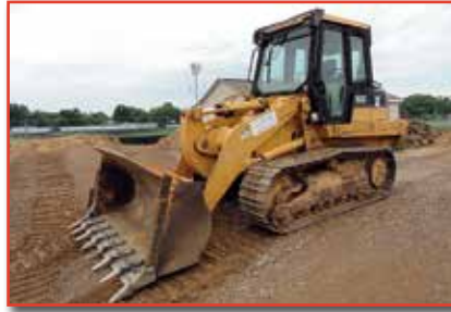
(1) OF (2) '02 CAT 953C