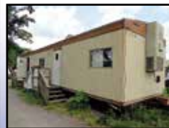
12'X50' OFFICE TRAILER

12'x50' Office Trailer , HVAC, lavatory. (Tires Need Replaced) (Reserved For Use As Settlement Office; Remove After 8/20/14)