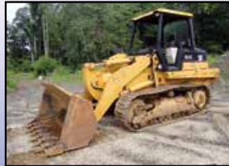
'02 CAT 953C

2002 CATERPILLAR 953C , s/n 2ZN04727, Cat 3116 diesel engine and hydrostatic transmission, e/w general purpose loader bucket with teeth and segments, enclosed ROPS cab with air conditioning, and 20" DBG pads. In good condition with good undercarriage.