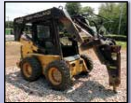
'99 NEW HOLLAND LX665 (HAMMER SOLD SEPARATELY)

1999 NEW HOLLAND LX665 , s/n 69463, diesel engine and hydrostatic transmission, e/w 60" general purpose loader bucket, standard hydraulics, ROPS canopy, and 10-16.5 tires. In fair to good condition with fair to good tires.