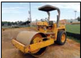
'96 BOMAG BW172D-2

1996 BOMAG BW172D-2 , s/n 109520120457T, Deutz diesel engine and hydrostatic transmission, e/w 66" smooth drum, drum drive, ROPS canopy, and 14.9-24 tires. In fair to good condition with fair to good tires.