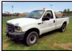
'03 FORD F-250XL 4X4

2000 CHEVROLET 3500HD Utility , automatic transmission, e/w Knapheide 11' open utility body, fuel cell with pump, dual rear wheels, and 225/70R19.5 tires. In fair to good condition with good tires. (Not Running; Diesel Removed; Replaced With Chevy 350 4-Bolt Main with Edelbrock Carb; Engine Good; Needs Driveshaft Cut and Replaced)