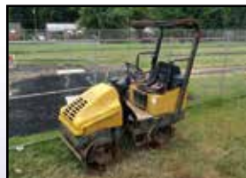
'99 WACKER RD11A

1999 WACKER RD11A Tandem Vibratory Roller , s/n 5045293, Honda GX610, 18HP gas engine and hydrostatic transmission, e/w 35" smooth drums and roll-bar. In fair to good condition.