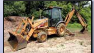
'94 CASE 580 SUPER K 4X4 E-HOE

1994 CASE 580 Super K , s/n JJG0183231, Case diesel engine and shuttle transmission, e/w general purpose loader bucket, 24" digging bucket, 2-stick controls, and enclosed ROPS cab. In fair condition with very good front and poor rear tires.