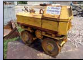
'01 RAMMAX P33/24 HMR