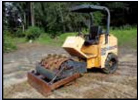
'00 STONE PDB43

2000 STONE PDB43 Padfoot , s/n 042006072, JD Powertech 2.9L diesel engine and hydrostatic transmission, e/w 44" padfoot drum, 57" leveling blade, ROPS canopy, and 9.50-16 tires. In good condition with good tires.