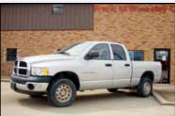
'04 DODGE 1500 4X4

2004 DODGE Model 1500, 4x4 Crew Cab Pickup Truck , powered by 4.7L gas engine and automatic transmission, equipped with 6'6" bed, tow package, air conditioning, and 245/70R17 tires. In good condition with good tires.