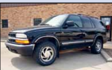
'01 CHEVY BLAZER 4X4

2001 CHEVROLET Model Blazer 4x4 Sport Utility Vehicle , powered by V-6 gas engine and automatic transmission, equipped with power package and 235/70R15 tires. In good to very good condition with good to very good tires.