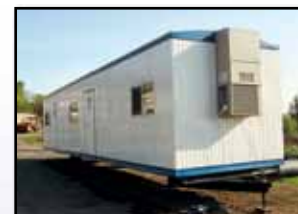
'08 MARKLINE 10'X50'

1969 FRUEHAUF Model FB28F240, 40' Storage Trailer • STRICK 40' Aluminum Storage Trailer • 8'x28' Stainless Steel Storage Trailer • KORY 6278 Tri-Axle Pole Trailer • Shopmade Pole Trailer . In fair condition with fair tires.