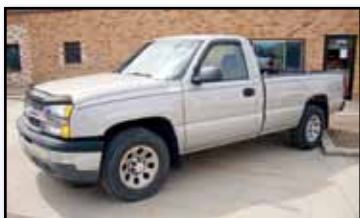
'05 CHEVY 1500 4X4

2006 FORD Model F-150 Extended Cab Pickup Truck , powered by 4.2L gas engine and automatic transmission, equipped with 6'6" bed, 36 gallon cross bed fuel tank, transfer pump, air conditioning, and 235/70R17 tires. In good condition with good tires.