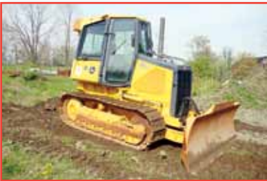
'05 JOHN DEERE 650JLT