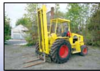
ALLIS CHALMERS 700D

ARROW 90CE60, 42"-139" 13,000#/3,000# Forklift Boom (NEW) • (2) WRIGHT Self-Dumping Hoppers