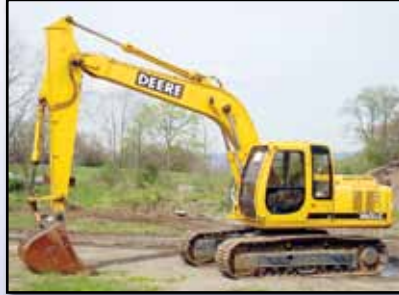
JOHN DEERE 160LC

1998 JOHN DEERE Model 160LC Hydraulic Excavator , s/n P00160X040233, powered by John Deere diesel engine and hydraulic drive, equipped with 10' dipper stick, 42" digging bucket, 12"7" crawlers, and 24" TBG pads. In good condition with good undercarriage.