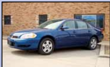
'06 CHEVY IMPALA

2006 CHEVROLET Model Impala LS 4-Door Sedan , powered by V-6 gas engine and automatic transmission, equipped with air conditioning, power windows and locks, CD player, and 225/60R16 tires. In good to very good condition with good to very good tires.