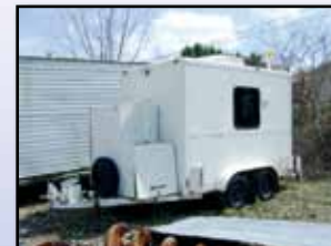
'04 CESCO 8'X10'