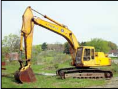
JOHN DEERE 790DLC

1990 JOHN DEERE Model 790DLC Hydraulic Excavator , s/n FF790DL008228, powered by John Deere diesel engine and hydraulic drive, equipped with 11'6" dipper stick, 46" digging bucket, 15'6" crawlers, and 32" TBG pads. In good condition with good undercarriage. (Weak Hydraulic Pump)