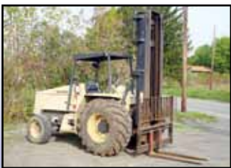
'03 I-R RT708H

2003 INGERSOLL-RAND Model RT708H, 8,000# Rough Terrain Forklift , s/n 174570, powered by Cummins B3.9 diesel engine and shuttle transmission, equipped with 3-stage mast, 48" forks, side shift, ROPS canopy, 18.4-24 front and 11L-16 rear tires. In good condition with good tires.