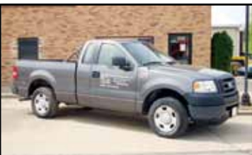
'06 FORD F-150

2005 CHEVROLET Model 1500, 4x4 Pickup Truck , powered by 5.3L gas engine and automatic transmission, equipped with 8' bed, spray-on liner, tow package, air conditioning, CD player, and 265/70R17 tires. In good condition with good tires.