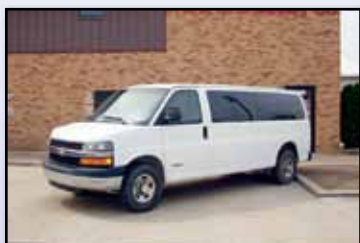
'03 CHEVY 3500

2003 CHEVROLET Model 3500, 15-Passenger Van , powered by 6.0L gas engine and automatic transmission, equipped with air conditioning 245/75R16 tires. In good condition with good tires.