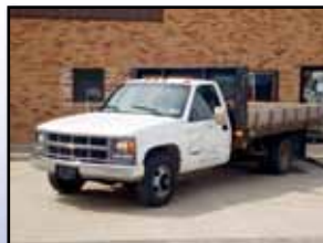
'00 CHEVY 3500

2000 CHEVROLET Model 3500 Flatbed Truck , powered by 5.7L gas engine and automatic transmission, equipped with Knapheide 12' steel flatbed, tow package, air conditioning, and 225/75R16 tires. In good condition with good tires.