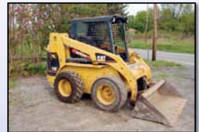
'02 CAT 236

2002 CATERPILLAR Model 236 Skid Steer Loader , s/n CAT00236V4YZ05054, powered by Perkins diesel engine and hydrostatic transmission, equipped with 66" bucket, ROPS canopy, pilot controls, light package, and 12-16.5 NHS tires. In good condition with poor and good tires.