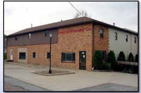
SHEESLEY REAL ESTATE

Contact Auction Company for Additional Information!