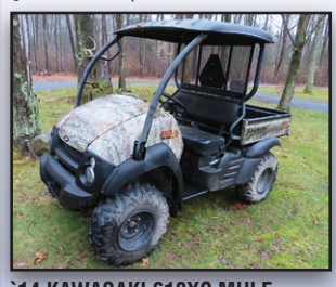
14 KAWASAKI 610XC MULE

NEW HOLLAND MX18H Zero Turn Mower, s/n T04ZC0334, Intek 18HP gas, 40" mower deck