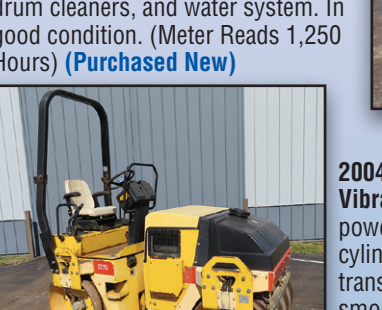
04 DYNAPAC CC122

2015 WACKER Model RD12A-90 Tandem Vibratory Roller, s/n 24235150, powered by Honda V-Twin gas engine and hydrostatic transmission, equipped with 36" smooth drums, dual drum drive, drum cleaners, and water system. In good condition. (Meter Reads 1,250 Hours) (Purchased New)