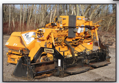
08 LEEBOY L1000T

2013 JCB Model VMT380-140 Tandem Vibratory Roller, s/n GATVT380L02804094, powered by Kohler KDW2204/G, 4 cylinder diesel engine and hydrostatic transmission, equipped with 55" smooth drums, dual drum drive, drum cleaners, dual frequency vibration, and water system. In very good condition. (Meter Reads 166 Hours) (Purchased New)