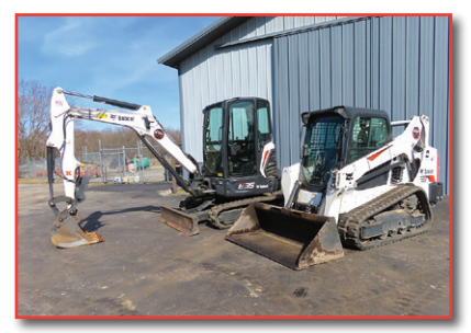
`20 BOBCAT E35i AND `19 T595