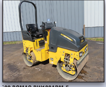
22 BOMAG BW100ADM-5

2015 WACKER Model RD12A-90 Tandem Vibratory Roller, s/n 24235150, powered by Honda V-Twin gas engine and hydrostatic transmission, equipped with 36" smooth drums, dual drum drive, drum cleaners, and water system. In good condition. (Meter Reads 1,250 Hours) (Purchased New)