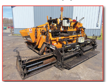
20 LEEBOY 8500D