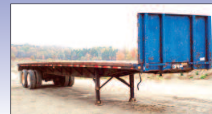
'93 FONTAINE 45'

5'x14' Rotary Scrubber with drive • TYLER 6'x14' Single Deck Vibrating Screen , s/n 1144 • TYLER 5'x14' 3-Deck Vibrating Screen , s/n 20491 • SIMPLICITY 3'x10' Vibrating Plate Feeder , s/n 3810-0FA5B-2605, with grizzly and structure • PULVOMATIC 44' Cage Mill • Miscellaneous Electric Motors • Starters • Disconnects, etc • JAEGER 6" Centrifugal Pump , with 40HP motor • MARLOW 4" Electric Pump • Miscellaneous Conveyor Belting • 6" Discharge Hose and Pipe • Electrical Conductor EAGLE Model BM-D15766 Sand Screw , s/n 9384, powered by 30HP electric motor, equipped with 54"x34" SSFM washer. In fair condition. EAGLE Model BM-D22609 Classifier , s/n 9284, equipped with 40', 3-cell WST with dial split. In fair condition.