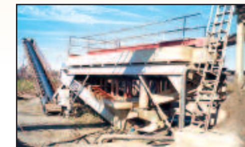
EAGLE DIALSPLIT CLASSIFIER