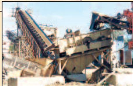
4'X10' SCREEN AND 120' CONVEYOR