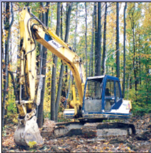
'93 KOBELCO SK120LC