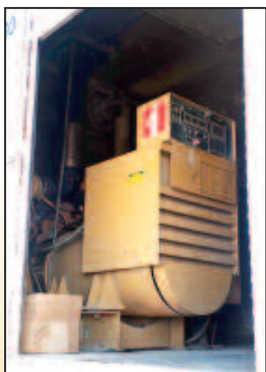
CAT 3412 @600KW

1990 CATERPILLAR Model 3412, 600KW Generator Set , s/n 81Z10806, powered by Cat 3412 diesel engine, equipped with 480 volt, skid mounted with radiator in a Comet 8'x27' single axle van trailer with 1,000 gallon fuel tank, dry transformer with 110 volt disconnect, roof mounted muffler, and 11R24.5 tires. In good condition with good tires. (Site #1) 1994 CATERPILLAR Model 3306, 250KW Portable Generator , s/n 85Z11314, powered by Cat 3306 diesel engine, equipped with 480 volt, skid mounted. In good condition. (Site #1)