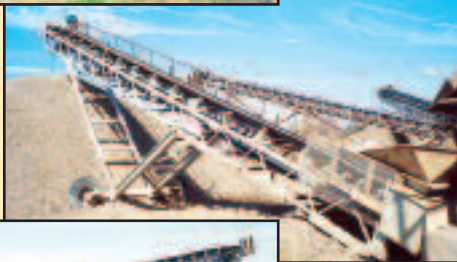
'97 LB SMITH 24"x60'