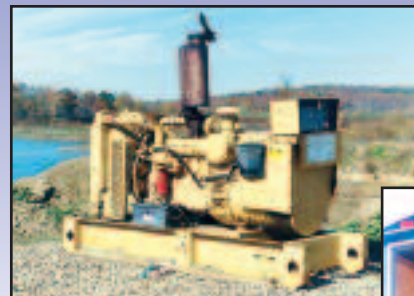
CAT 3306 @250KW

1999 SIEMANS Model MCC-1 Motor Control Center , equipped with 480 volt/3-phase, (19) 45 amp starters, (1) 135 amp starter, (2) 90 amp starters, (1) 200 amp main disconnect, Fuji feeder speed control, Radiomatic remote control mounted in Continental Model CC712TA2 (7'x12') tandem axle cargo trailer, with 7,000 GVWR, (2) rear doors, (1) side door, and 205/75R15 tires. In good condition with good tires. (Site #1) MILLER Model Bobcat 225NT Portable Welder/Generator , s/n KH407364, powered by Onan gas engine, mounted on single axle trailer with leads, multi-purpose series. In very good condition with fair to good tires. (Site #1)