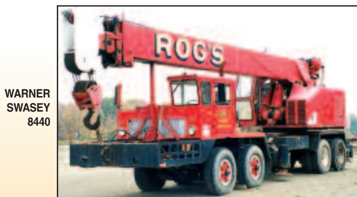
WARNER SWASEY 8440

WARNER SWASEY Model 8440, 40 Ton Hydraulic Truck Crane , s/n 10142, powered by V-8 gas engine, equipped with 32'-100' 4-section telescopic boom with manual fly, auxiliary hoist, and 40 ton hook block, mounted on CCC 4-axle carrier, powered by Detroit diesel engine and 5 speed transmission with hi/lo, equipped with hydraulic tugger winch and (4) hydraulic outriggers. In fair to good condition with fair to good tires. (Site #1) (Reserved For Use During Loadout For One Week After Auction)