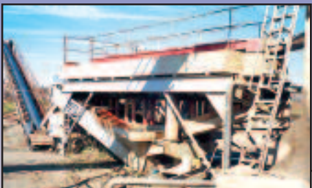
EAGLE DIALSPLIT CLASSIFIER