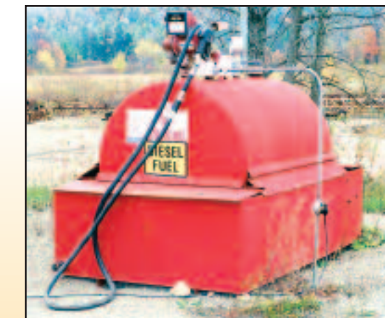
500 GALLON TANK

1958 FWD S750 Fire Truck • 1965 GMC Cab and Chassis • IHC 350 Hay Chopper • BALDERSON General Purpose Bucket • Spadenose Bucket with teeth • Approximately 30'x40' Steel Pole Building, with sheet metal siding and (1) door