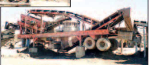
TELSMITH CONE PLANT