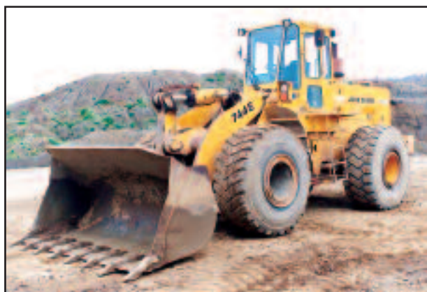
'90 JOHN DEERE 744E

CATERPILLAR Model 980C Rubber Tired Loader , s/n 63X04944, powered by Cat 3406 diesel engine and powershift transmission, equipped with general purpose loader bucket with teeth, enclosed ROPS cab with heat and air conditioning, light package, and 26.5x25 tires. In good condition with good tires. (Site #1) CATERPILLAR Model 980C Rubber Tired Loader , s/n 63X04651, powered by Cat 3406 diesel engine and powershift transmission, equipped with general purpose loader bucket with teeth, enclosed ROPS cab with heat, light package, and 26.5R25 tires. In good condition with good tires. (Site #1) 1990 JOHN DEERE Model 744E Rubber Tired Loader , s/nCK744EB000156, powered by John Deere diesel engine and powershift transmission, equipped with 4.7 cubic yard general purpose loader bucket with teeth, enclosed cab with heat, light package, and 26.5R25 tires. In good condition with good tires. (Site #1) FIAT ALLIS Model 645B Rubber Tired Loader , s/n 11Y03905, powered by Fiat Allis diesel engine and powershift transmission, equipped with general purpose loader bucket with bolt-on cutting edge, enclosed ROPS cab with heat, light package, and 20.5x25 tires. In fair to good condition with fair to good tires. (Site #1)