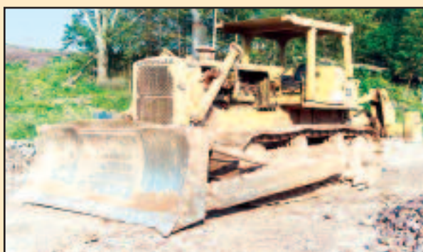
CAT D8H WITH RIPPER

1996 CATERPILLAR Model D5HXL Series II Crawler Tractor , s/n 8RJ05101, powered by Cat 3304 diesel engine and powershift transmission, equipped with 6-way blade, 3rd valve, enclosed ROPS cab, air conditioning, drawbar, light package, and 22" SBG pads. In good condition with good to very good undercarriage. (Low Hours on Undercarriage Rebuild)