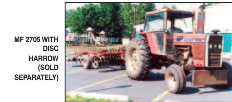
MF 2705 WITH DISC HARROW (SOLD SEPARATELY)