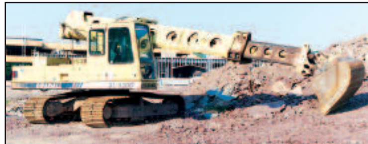
'93 GRADALL XL5200

Digging Buckets: 72" & 48" (Komatsu PC650LC-5) • 70" (JD 450LC • 48" (Gradall XL5200)