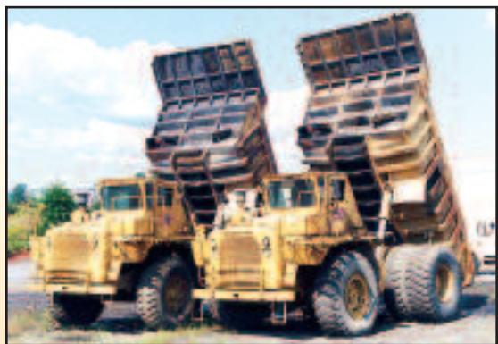
(2) OF (5) CAT 773A'S

CATERPILLAR Model 773A, 50 Ton End Dump , s/n 63G0426, equipped with heated body, cab protection, and 20.00R35 tires. (Engine and Transmission Missing) (Parts Only)