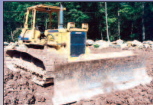
'99 KOMATSU D58P-1 LGP