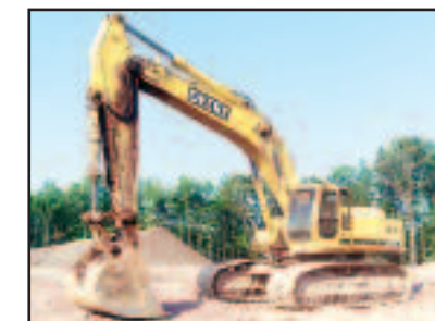
'98 JD 450LC