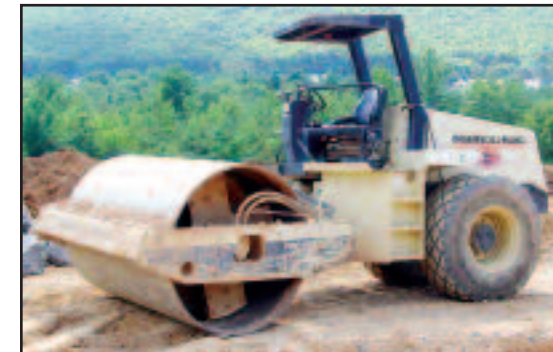
'98 IR SD100D

1988 RAMMAX Trench Compactor , s/n 5868, powered by Hatz diesel engine. In fair condition.