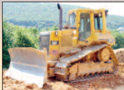
'96 CAT D5HXL SERIES II