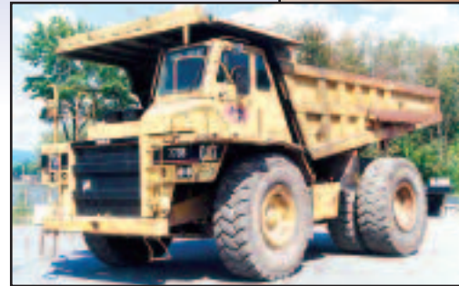
'89 CAT 773B S/N 63W02837

1990 CATERPILLAR Model 773B, 50 Ton End Dump , s/n 63W02839, powered by Cat 3412 diesel engine and 7 speed powershift transmission, equipped with retarder, supplemental steering, heated body, 3/4" bedliners, air conditioning, light package, and 24.00R35 tires. In good condition with good tires.