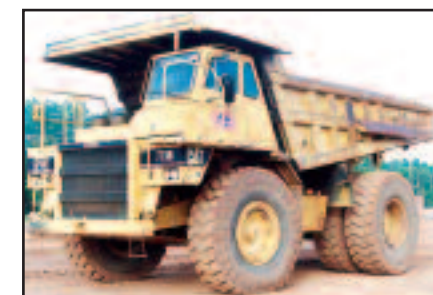
'90 CAT 773B