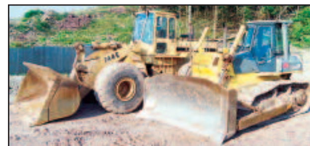
'99 KOMATSU D65 EX12 & '95 JD 744E