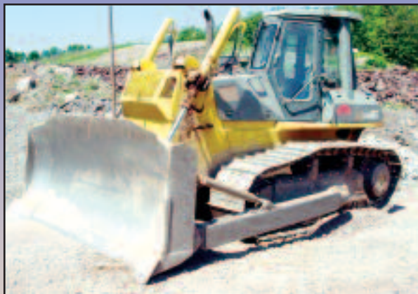
'99 KOMATSU D65EX-12