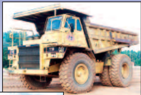
'90 CAT 773B S/N 63W02839