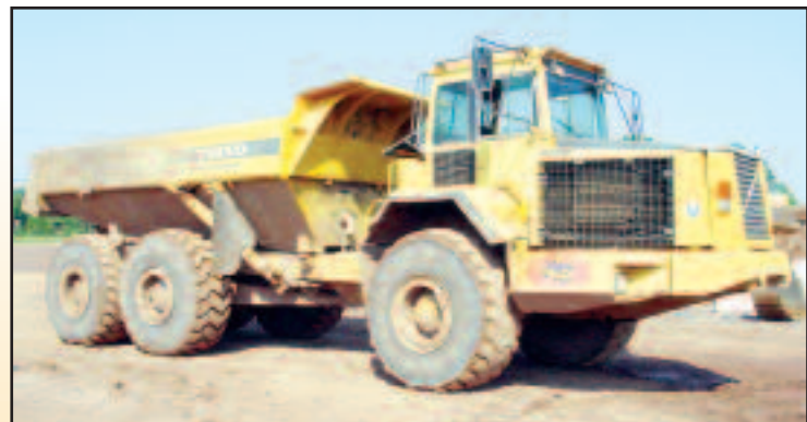
'97 VOLVO A35C

1997 VOLVO Model A35C, 35 Ton 6x6 Articulated End Dump , s/n A35CV4626, powered by Volvo TD121G diesel engine and powershift transmission, equipped with heated body, air conditioning, light package, and 26.5R25 tires. In good condition with fair to good tires.