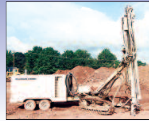
IR ECM350 WITH 750CFM (SOLD SEPARATELY)