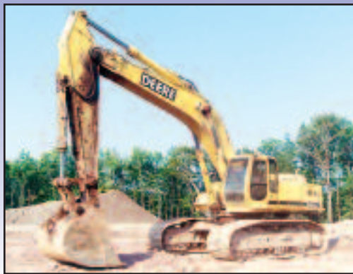
'98 JD 450LC