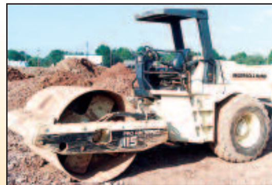
'97 IR SD115D