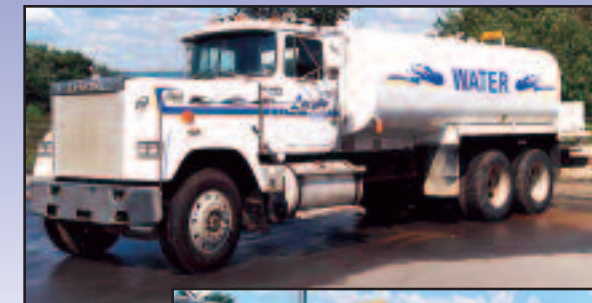
'89 MACK RW613 WATER TRUCK

MASSEY FERGUSON Model 2705 Utility Tractor , s/n 9R012532, powered by 6 cylinder diesel engine and 8 speed powershift transmission, equipped with 3-point hitch, rear PTO, rear auxiliary hydraulics, drawbar, enclosed ROPS cab with air conditioning, light package, 11.00x16 front and 18.4x38/15-38 rear tires. In good condition with good tires. SUNFLOWER Model 121113 Disc Harrow , s/n 1290255, equipped with 4-gang 6'x20" discs, hydraulic transport wheels, and 9.5L-15SL tires. In good condition with good tires.