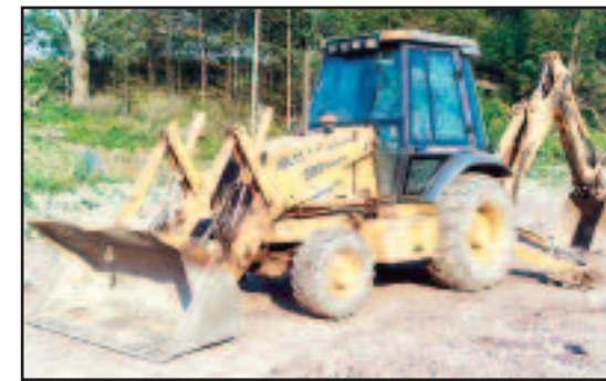
'95 CASE 580 4X4

INGERSOLL-RAND Model P-750-W-CU, 750CFM Portable Air Compressor , s/n UNKNOWN, powered by Cummins L-10 diesel engine, rated operating pressure 100PSI, trailer mounted with 8.75x16.5LT tires. In good condition with fair tires.