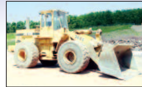
'95 JD 744E

Cat D348 Diesel Engine - Complete Rebuild - Original Cat Parts RUBBER TIRED AND CRAWLER TIRED LOADERS