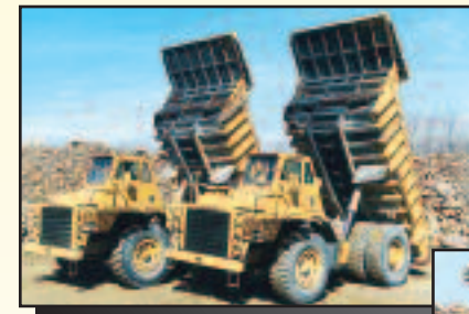
(2) CAT 773B'S

Parts: (2) 21.00x35 Tires & Rim • Rebuilt Strut & Suspension Cylinder