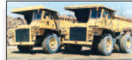
(2) CAT 773B'S