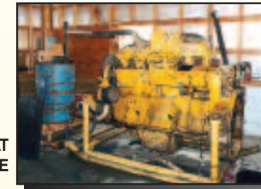
REBUILT CAT D353 ENGINE