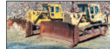
(2) CAT D9H'S