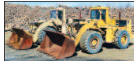
(2) CAT 988B'S