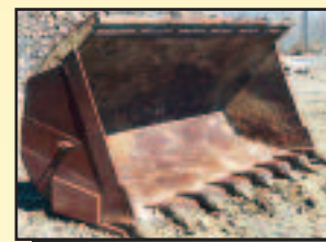
CAT 988B BUCKET