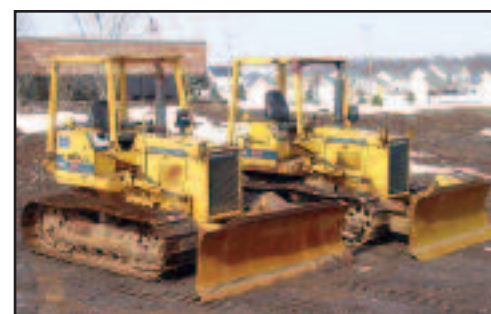
KOMATSU D37P-2 & D37E-2

Harleysville, Pennsylvania (Lansdale Area)