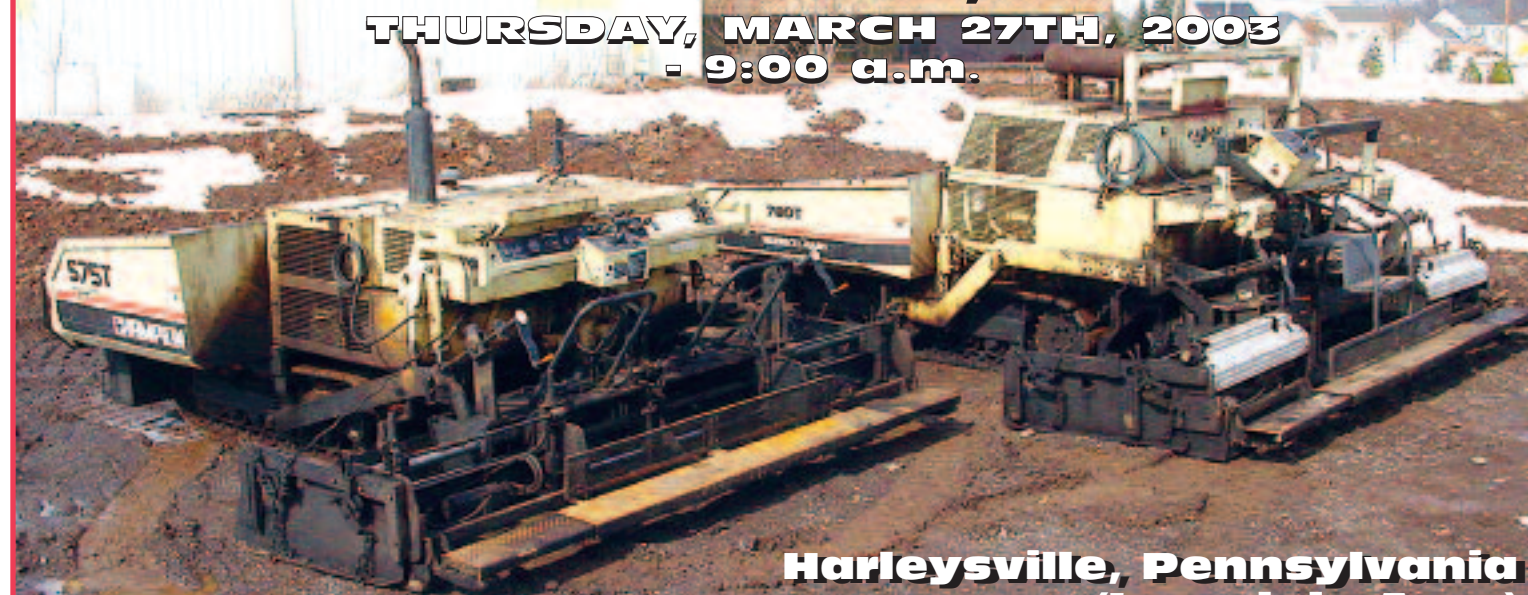
'96 CHAMPION 575T & '93 IR 780T

Harleysville, Pennsylvania (Lansdale Area)