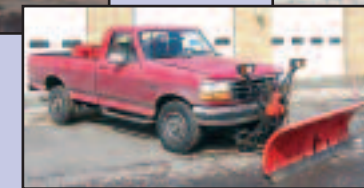
'94 FORD F-250 4X4