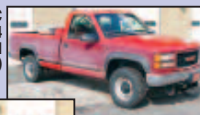
'97 GMC 2500 4X4 (SOLD WITH PLOW)