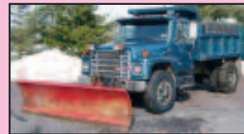
'87 INT'L SINGLE AXLE