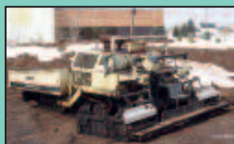
'93 IR 780T