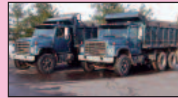
'89 INT'L TANDEM AXLE'S