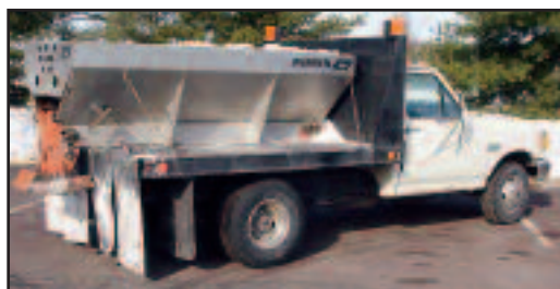
(1) OF (2) SALT SPREADERS