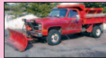
'84 CHEVY C20 4X4 DUMP (SPREADER SOLD SEPARATELY)