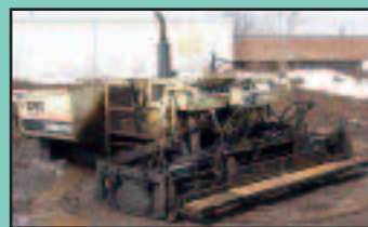
'96 CHAMPION 575T

1984 CHEVROLET Model P32 Step Van , powered by V-8 gas engine and automatic transmission, equipped with Grumman 12' aluminum body, wooden shelving, dual rear wheels, and 7.50x16 tires. In good condition with good tires.