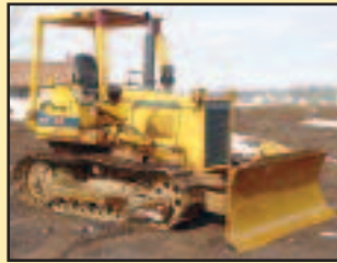
'87 KOMATSU D37E-2