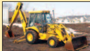
'94 JCB 215 4X4 EXTEND-A-HOE