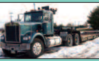
KENWORTH W900 & ROGERS 35 TON