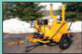
'99 LEEBOY L250 TACK TRAILER