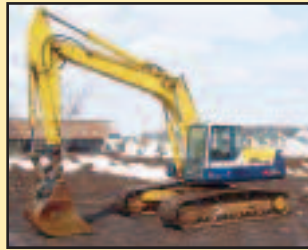
'90 KOMATSU PC220LC-5