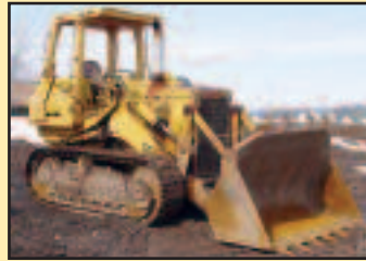
'87 KOMATSU D57S-1