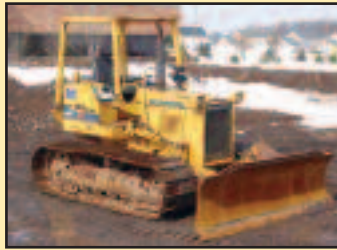
'89 KOMATSU D37P-2