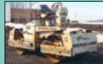
'88 IR DD65