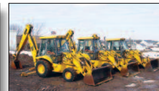
JCB 215 & 214 4X4 EXTEND-A-HOES