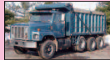
(1) OF (2) INT'L F-2674