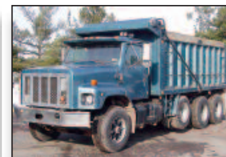
(1) OF (2) INT'L TRI-AXLES