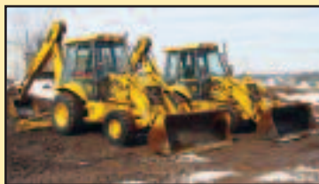
JCB 214 4X4 EXTEND-A-HOES