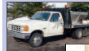
'91 FORD F-350 (SPREADER SOLD SEPARATELY)

Assorted NEXTEL Mobile Phones and base • (2) Cubicle Office Partitions with work stations • (2) Secretarial Work Stations with partitions and chairs • 8' Wood Conference Table with (6) chairs • Metal Cabinet • Wooden Desks • Assorted Chairs • 2-Drawer and 4-Drawer File Cabinets • Assorted Bookshelves • Blue Print Rack • Paper Shredder