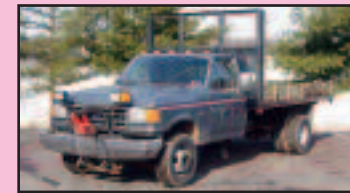
'89 FORD F-450 FLATBED DUMP (SOLD WITH PLOW)