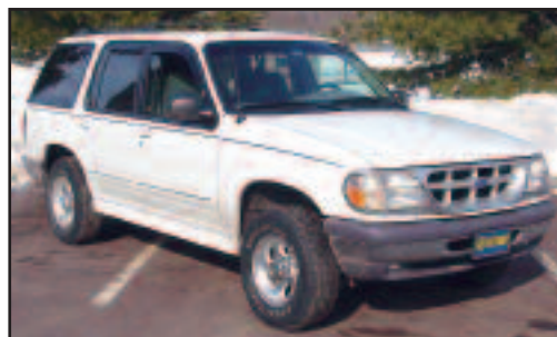
'96 FORD EXPLORER 4X4