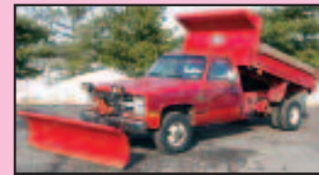
'85 CHEVY C30 4X4