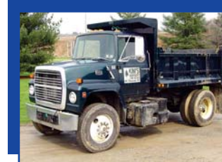
'86 Ford 9000