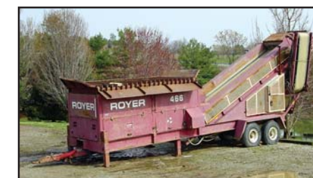
'96 Royer 466