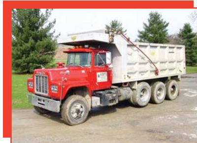
'77 Mack RD685S Tri-Axle