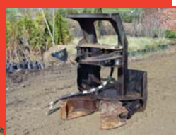
Hydraulic Feller Buncher