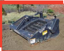
'99 Melroe LR6B