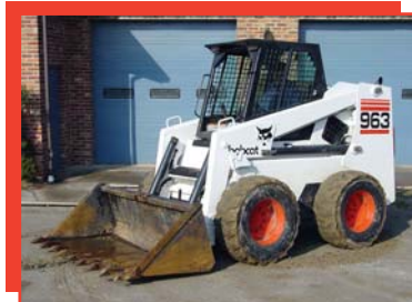
'99 Bobcat 963C