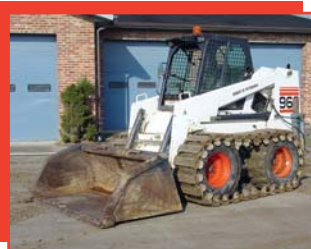
'97 Bobcat 963C