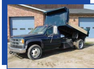
'94 Chevy 3500HD