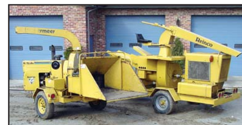
Vermeer Chipper & Reinco Straw Blower

While information is believed to be accurate, all items will be sold "As-Is, Where-Is" without guarantee or warranty. A physical inspection is suggested.