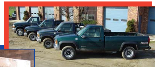
'99 - '93 4x4 Pickup Trucks

E-Z-GO Model H1886 Gas Powered Golf Cart , s/n 413739. In good condition. • JOHN DEERE Self-Propelled Push Mower powered by 4HP gas engine • HALE Hot Shot Model 7500 GE , 7500 Watt Gas Powered Generator, s/n E841615, powered by 16HP gas engine, equipped with (2) electric wire cable reels • STIHL 046 , 26" Gas Powered Chain Saw • HUSQVARNA 55 , 18" Gas Powered Chain Saw • (2) HUSQVARNA 45 , 16" Gas Powered Chain Saws • TSURUMI Model ETT2-80HA , 3" Gas Powered Trash Pump • WACKER Model PG2 , 2" Gas Powered Centrifugal Pump • Small Quantity Suction & Discharge Hose • DAVID WHITE 8830 Transit with tripod • TARGET Electric Wet Saw • Back Pack Pump Sprayer • (4) Walk Behind Broadcast Spreaders • (4) Wheel Barrows • Picks, Rakes, Shovels, Rooms, Digging Bars • Safety Barrels, Cones, Signs, and Sign Stands • 325 Gallon Poly Tank • 105 gallon fuel tank with 12-volt electric pump • CRAFTSMAN Tool Chest and contents • LINCOLN IdealArc 250 Amp Arc Welder , s/n AC-54844DCRAFTSMAN • 1.5HP Electric Air Compressor • K&F Model KF-13F , 5/8" Drill Press, s/n KS9504SS54 • 3/4" Socket Set • CRAFTSMAN Wet/Dry Shop Vac • Assorted PVC Irrigation Pipe and Fittings; Sprinkler Heads and Valves; RAINBIRD Pop-up Sprinkler Heads