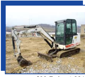
'99 Bobcat 331