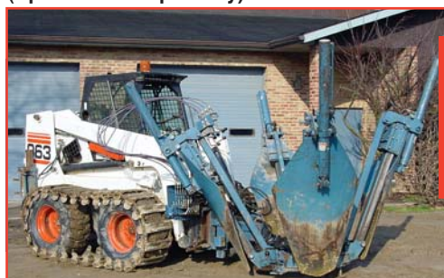
'97 Bobcat 963C (Spade Sold Separately)