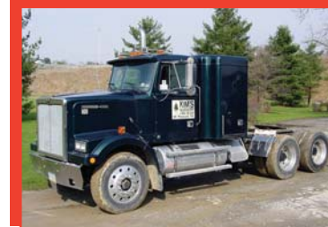
'91 Western Star 4864F