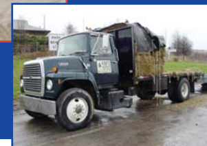
'86 Ford L9000 and Interstate 10 Ton