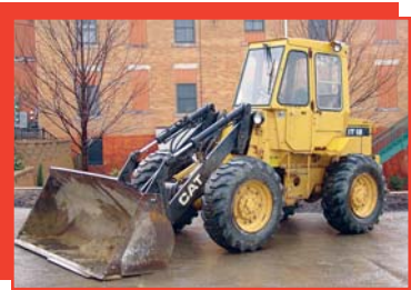
'88 CAT IT12