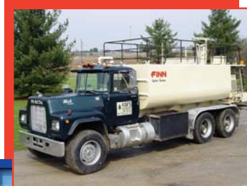
Finn 3,000 Gallon Hydro Seeder