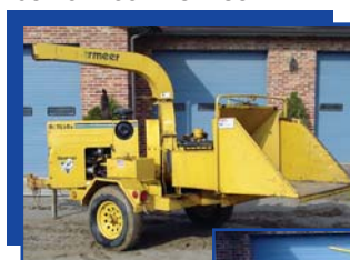
'98 Vermeer BC1230A

1977 MACK Model RD685S Tri Axle Dump Truck , powered by Mack ENDT675 diesel engine and 6 speed lo-hole transmission, equipped with Liberty 17" aluminum dump body with manual tarp kit, air controlled tailgate, Jacobs 2 speed engine brake, air conditioning, AM/FM cassette, and 11R22.5 front and 10.00-22 rear tires. In good condition with good tires. 1974 MACK Model R685ST Tandem Axle Dump Truck , with 5 speed transmission, equipped with 14' steel dump body and 12R22.5 tires. (Engine Removed – Will Sell With Truck) 1986 FORD Model 9000 Single Axle Dump Truck , powered by Cummins 270HP diesel engine and Spicer SST 7 speed transmission, equipped with Godwin 10' steel dump body, snowplow frame, air brakes, air plumbed to rear, pintle hitch, and 11R24.5 tires. In good condition with good tires. 1994 CHEVROLET Model 3500HD Single Axle Dump Truck , powered by V-8 gas engine and 5 speed transmission, equipped with Super City 10' steel dump body with removable sides, Western snowplow controls, plow mounting bracket, and 225/70R19.5 tires. In fair to good condition with good tires.