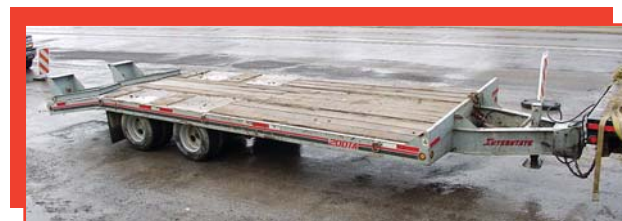
(1) of (2) Interstate 10 Ton