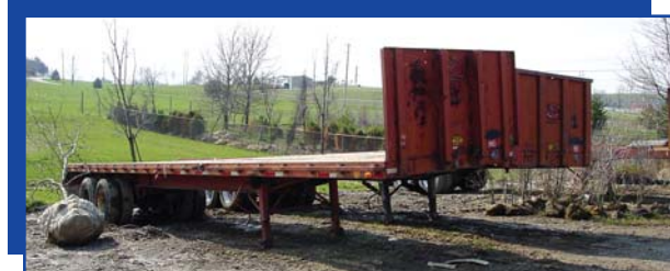
(2) of (3) Flatbed Trailers