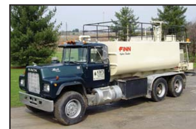
Finn 3,000 Gallon Hydro Seeder