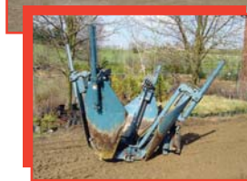
'97 Care Tree 748