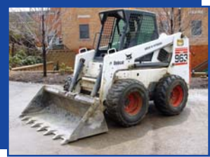
'01 Bobcat 963G