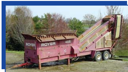
'96 Royer 466