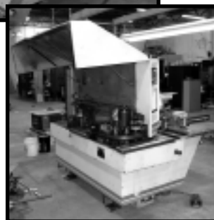
NEWBURY 25 TON