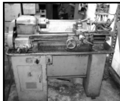
(1) OF (2) SOUTH BEND LATHES