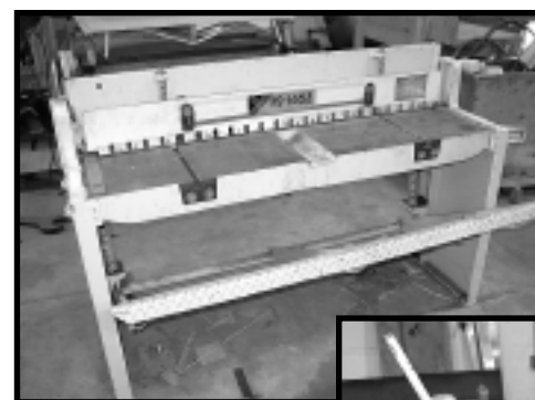
JET JUMP SHEAR

JET Model HN-16 Bench Type Hand Notcher , s/n 8154, equipped with 6" notching die and 16 gauge capacity. In good condition.