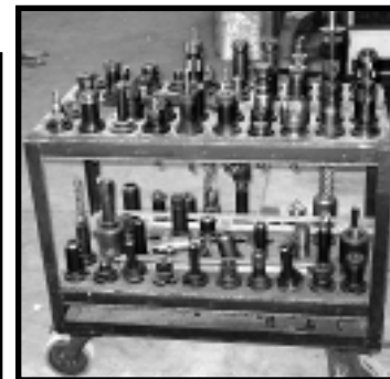
NO. 50 TAPER TOOLS