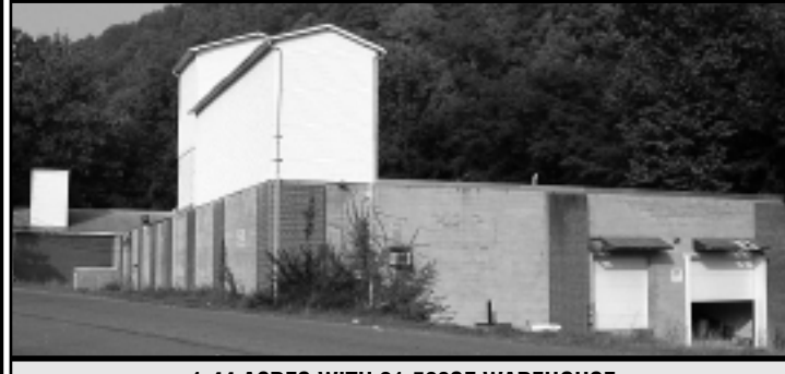
1.44 ACRES WITH 21,500SF WAREHOUSE