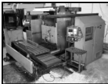
KEARNEY & TRECKER HB-4