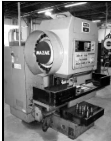
MAZAK MICRO CENTER V