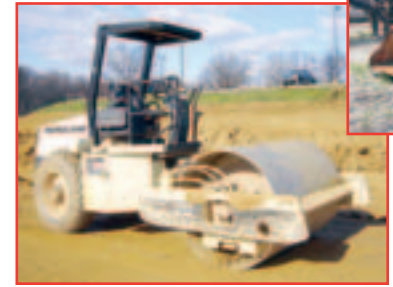
'00 IR SD70D