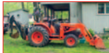
'04 KUBOTA L3830D (BACKHOE SOLD SEPARATELY)