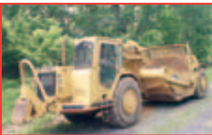
'88 CAT 627EPP