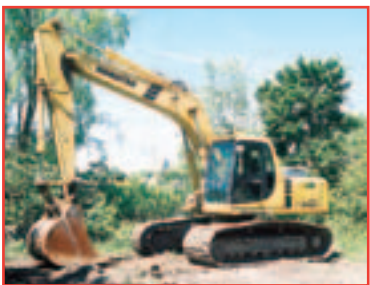
'00 KOMATSU PC200EL-6K