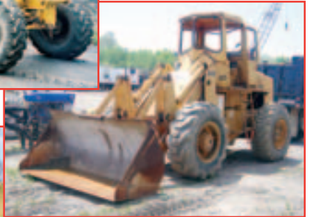
(1) OF (2) FIAT ALLIS 545B's