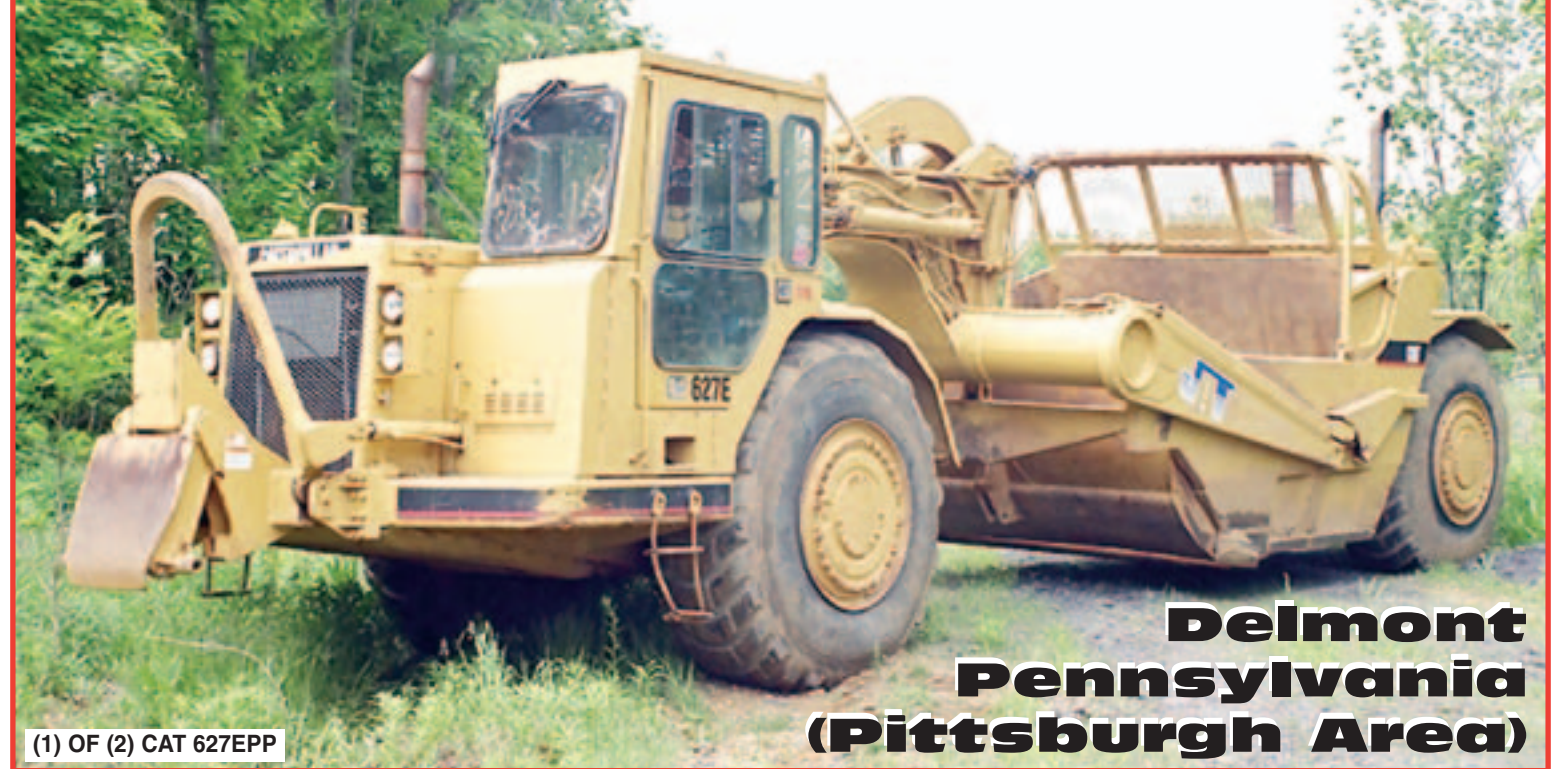
(1) OF (2) CAT 627EPP