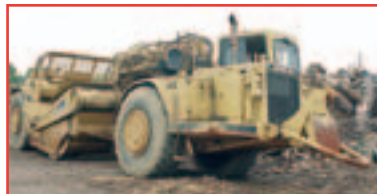
'86 CAT 627EPP