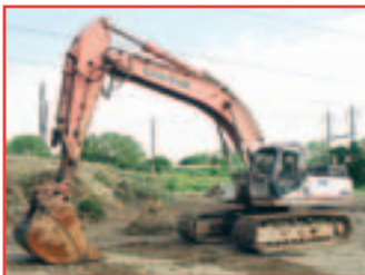
'96 LINK-BELT 4300Q

CATERPILLAR Model 12G Motor Grader , s/n 61M1024, powered by Cat 3306 diesel engine and powershift transmission, equipped with 12' hydraulic moldboard, front mounted scarifier, enclosed ROPS cab, light package, and 14.00-24 tires. In good condition with fair to good tires. (GOH) MACK Model M35X, 35 Ton End Dump , s/n 2654S, powered by Detroit V-8 diesel engine and direct drive transmission, equipped with 18.00R25 tires. In good condition with good tires. FIAT ALLIS Model 545B Rubber Tired Loader , s/n 2229, powered by Allis Chalmers 6 cylinder diesel engine and powershift transmission, equipped with general purpose loader bucket, enclosed cab (missing glass and doors), and 17.5x25 tires. In fair condition with fair tires. (Brayman) FIAT ALLIS Model 545B Rubber Tired Loader , s/n 1103, powered by Allis Chalmers 6 cylinder diesel engine and powershift transmission, equipped with general purpose loader bucket, enclosed cab (missing glass) and 17.5x25 tires. In fair condition with fair to good tires. (Brayman)