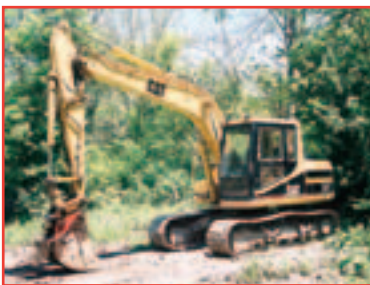
'96 CAT 312