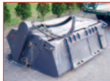
FFC 75 INCH PREPARATOR