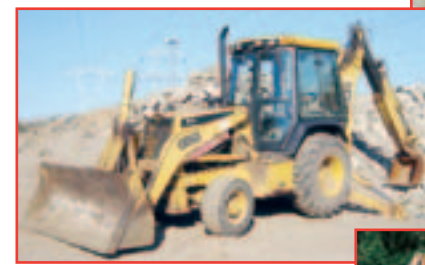
'97 JD 310E