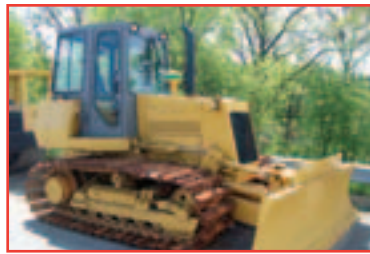
'97 DAEWOO DD80L