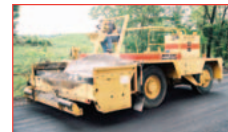
'97 MIDLAND SP