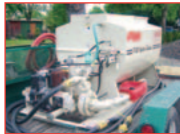
FINN T-30 HYDROSEEDER