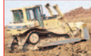
'02 CAT D6RXL