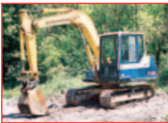
'91 KOMATSU PC60-6