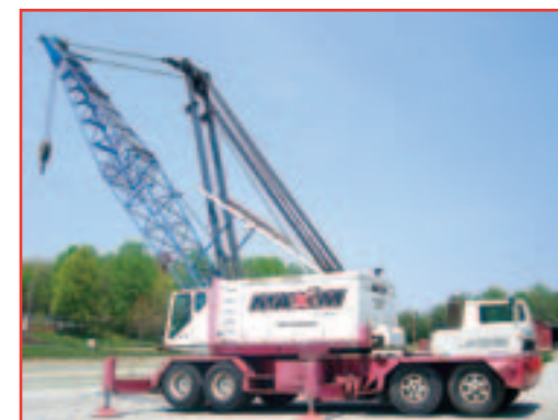
LINK-BELT HC238A, 140 TON

PRE-SORTED FIRST CLASS MAIL U.S. POSTAGE PAID HAVERTOWN, PA PERMIT #45