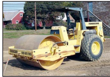
96 BOMAG BW212D-2

(Less Than 50 Hours on Deutz Engine Exchange)