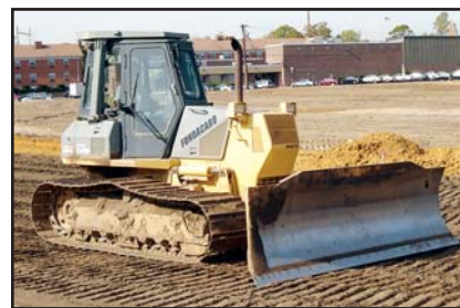
00 KOMATSU D41P-6A

2000 KOMATSU Model D41P-6 Crawler Tractor , s/n B21598, powered by Komatsu diesel engine and powershift transmission, equipped with 6-way straight blade, ROPS over enclosed cab, air conditioning, and 27.5" SBG pads. In good condition with very good undercarriage.