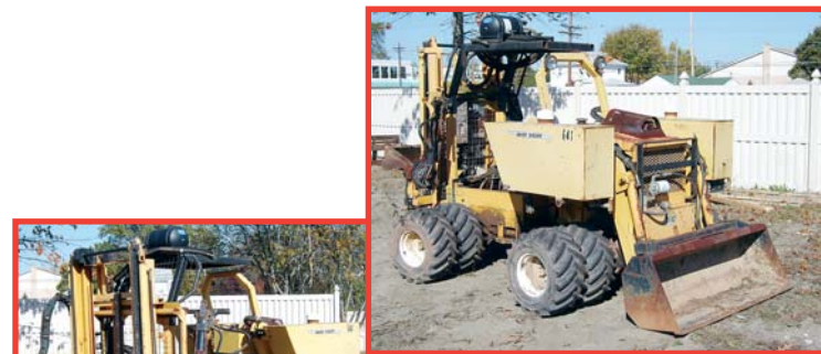
98 DANDY DIGGER DD2-25

1998 DANDY DIGGER Model DD2-25 Combination Post Hole Boring/Loader Tractor , s/n DD2598303, powered by Onan gas engine and hydrostatic transmission, equipped with Kohler 25HP gas powered hydraulic auger attachment with 6"; 8"; 10"; 12"; 18"; 24" auger bits, mounted on hydraulic retractable mast, heavy duty hydraulic breaker with post driver tooling, front loader attachment with quick disconnect 60" loader bucket and 48" fork attachment, articulated steering, and quick-tach dual wheel kit with 26x12.00 tires. Plus 1998 Tandem Axle Tilt Deck Tag-A-Long Trailer, equipped with 10' tilt deck, 5'6" stationary deck, 4' ramps, electric brakes, and 10,000# GVW. In good condition.