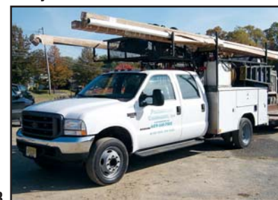
02 FORD F-550 CREW CAB

powered by Power Stroke V-8 diesel engine and automatic transmission, equipped with Reading 9' open mechanics body, ladder rack, dual rear wheels, air conditioning, cruise control, AM/FM stereo, and 225/70R19.5 tires. In good condition with good tires.