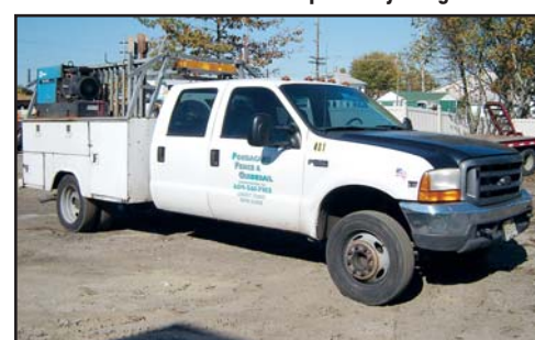
99 FORD F-450 CREW CAB

1999 FORD Model F-450 Super Duty Single Axle Crew Cab Mechanics Truck ,