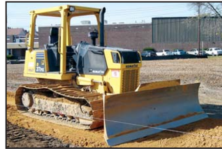
04 KOMATSU D37PX-21A

(580 Original Hours) (Balance of Komatsu 3 Year/5,000 Hour Power Train Warranty Remaining thru 10/04/07)