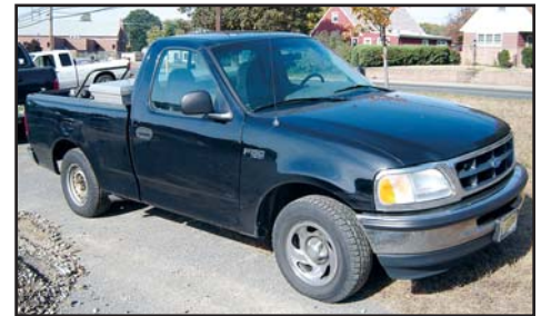
97 FORD F-150XL

1997 FORD Model F-150XL Pickup Truck , powered by 4.2 liter V-6 gas engine and automatic transmission, equipped with 6.5' bed with liner and cross toolbox, air conditioning, AM/FM cassette, and 235/70R16 tires. In good condition with good tires.