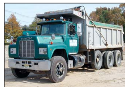
87 MACK RD686SX

1987 MACK Model RD686SX Tri Axle Dump Truck , powered by Mack