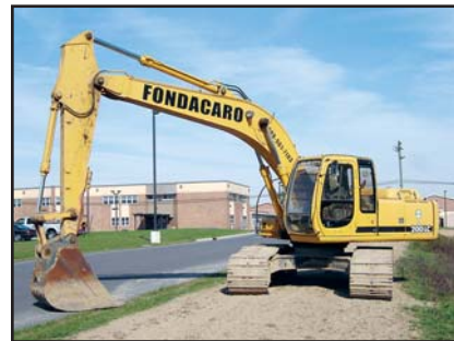
01 JOHN DEERE 200LC

s/n FF0200X501601, powered by John Deere diesel engine and hydraulic drive, equipped with 9'6" dipper stick, Geith 36" digging bucket with 18" thumb attachment, air conditioning, 14'6" crawlers, and 32" TBG pads. In good condition with good undercarriage.