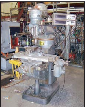
BRIDGEPORT MILLING MACHINE