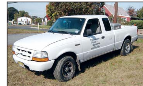
00 FORD RANGER

liter V-6 gas engine and automatic transmission, equipped with 6' bed with cross toolbox, air conditioning, AM/FM cassette, and 225/70R15 tires. In good condition with fair to good tires.