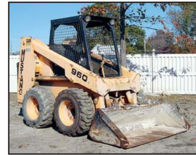
95 MUSTANG 960

s/n 5634203, powered by Isuzu 4 cylinder diesel engine and hydrostatic transmission, equipped with general purpose loader bucket, quick disconnect, 36" fork attachment, auxiliary hydraulics, ROPS canopy, and 12x16.5 tires. In fair to good condition with fair to good tires.