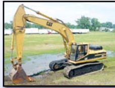
'95 CAT 330L

1997 CAT 345BL , s/n 4SS00366, Cat 3176 dsl engine and hydraulic drive, 12' dipper stick, 68" digging bucket, 17'9" crawlers, and 35.5" TBG pads. In good condition with good undercarriage.