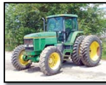
JOHN DEERE 7800

1990 JOHN DEERE 4955, 4x4 , s/n RW4955P004892, John Deere 6 cyl (202HP) dsl engine and shuttle trans, 3-point hitch, PTO, (2) hydraulic couplers, drawbar, dual rear wheels, and 16.9-30 front and 18.4R42 rear tires. In good condition with good tires.