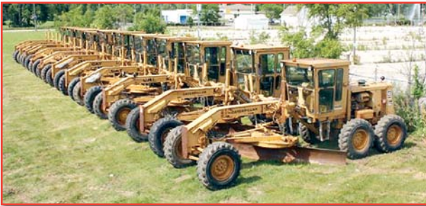
(12) CAT MOTOR GRADERS