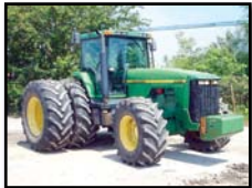
'97 JOHN DEERE 8400

1997 JOHN DEERE 8400, 4x4 , s/n RW8400P013007, John Deere 6 cyl (225HP) dsl engine and ps trans, 3-point hitch, PTO, drawbar, 4-spool hydraulic outlets, pocket-book weights, EROPS, ac, light package, dual rear wheels, 600/65R28 front and 710/70R38 rear tires. In good to very good condition with good to very good tires.