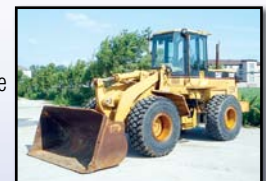
'95 CAT 938F

light package, and 20.5x25 tires. In fair to good condition with fair tires.