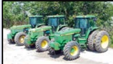
JOHN DEERE 4960'S

1991 JOHN DEERE 8760, 4x4 Articulated , s/n RW8760H002979, John Deere 6 cyl (256HP) dsl engine and 24 speed ps trans, 3-spool hydraulic outlets, drawbar, EROPS, ac, light package, dual front and rear wheels, and 20.8R42 tires. In good condition with good tires.