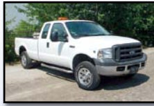
FORD PICKUP TRUCK

2006 FORD F-250XL Super Duty 4x4 Crew Cab , 5.4L gas engine and 6 speed trans, 7' bed, aluminum cross and side toolboxes, and 265/70R17 tires. In good condition with good tires.