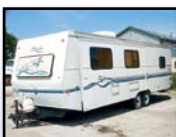
'97 FLEETWOOD PROWLER

1997 FLEETWOOD Prowler Tandem Axle Travel Trailer • 1984 MARATHON 28RLR , 28' 5th Wheel Travel Trailer • 1972 TRAILMOBILE A71A1AA-N , 24' Single Axle Van Trailer, 5,000 gallon 3-compartment oil tank • AMERICAN 40' Storage Trailer • 1960 FRUEHAUF 40' Van Trailer (No Tires Or Axles) • Shopmade Tandem Axle Van Trailer • 1970 TRAILMOBILE