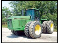
'91 JOHN DEERE 8760

1997 JOHN DEERE 8400, 4x4 , s/n RW8400P013007, John Deere 6 cyl (225HP) dsl engine and ps trans, 3-point hitch, PTO, drawbar, 4-spool hydraulic outlets, pocket-book weights, EROPS, ac, light package, dual rear wheels, 600/65R28 front and 710/70R38 rear tires. In good to very good condition with good to very good tires.