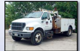
'00 FORD F-650

1985 INTERNATIONAL 1900 , International 7.3L dsl engine and 5 speed trans, 11' service body, Stahl 8000LX crane, 4' flatbed, fuel tanks, and 11R22.5 tires. In poor condition with poor tires. (Parts-Not Running)