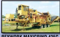
REXWORK MAXIGRIND 425G

REXWORK Maxigrind 425G Portable Wood Chipper , s/n G40604, Cat 3306B dsl engine, 13'x5' tub grinder, 5'x18' discharge conveyor, grapple, enclosed cab, and 215/70R17.5 tires. In good condition with good tires.