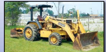
JOHN DEERE 210LE 4x4

1998 JOHN DEERE 210LE, 4x4 Skip Loader , s/n T210LE845035, John Deere 4.5L dsl engine and shuttle trans, gp bucket with bolt-on cutting edge, 3-point hitch, 7'6" box scraper with scarifier teeth, canopy, light package, 12x16.5 front and 16.9x24 rear tires. In good condition with good tires.