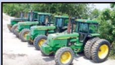
JOHN DEERE 4955'S

1994 JOHN DEERE 4960, 4x4 , s/n RW4960P008010, John Deere 6 cyl (200HP) dsl engine and shuttle trans, 3-point hitch, 3-spool hydraulic outlets, PTO, drawbar, EROPS with ac, light package, and 18.4R26 front and 18.4-42 rear tires. In good condition with fair to good tires.