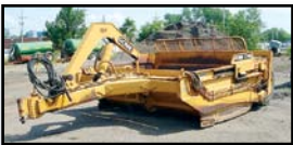
ROME PULL SCRAPER

ROME C14E105 Pull Type Scraper , s/n 29339, 17.5-25 tires. In good condition with good tires.