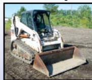
'06 BOBCAT T-190

2005 BOBCAT T190 Crawler , s/n 527717354, Kubota dsl engine and hydrostatic trans, auxiliary hydraulics, 72" gp bucket, power Bob-Tach, and ac. In good condition with good undercarriage.