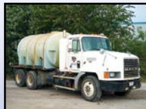
'93 MACK CH613

FORD F-800 Tandem Axle Fuel Truck , V-8 gas engine and 4 speed trans, Honda pump and 11.00x22.5 tires. (Poor-Parts)