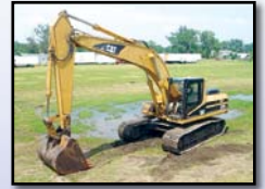
'97 CAT 325BL

2005 CAT 325CL , s/n CAT0325CABFE01644, Cat 3126 dsl engine and hydraulic drive, 10' 9" dipper stick, 44" gp bucket, 15'3" crawlers, and 31" TBG pads. In very good condition with very good undercarriage.