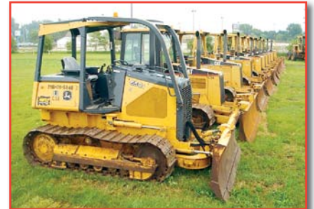
(22) CRAWLER TRACTORS