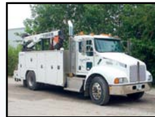
'08 KENWORTH T-300