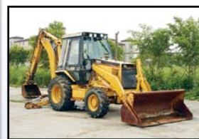
'95 CAT 426B 4x4

1995 CAT 426B, 4x4 Tractor Loader Extend-A-Hoe , s/n 6KL01529, Cat 3054 dsl engine and shuttle trans, gp loader bucket, 30" digging bucket, hydraulic beyond, EROPS, light package, 12.5/80-18 front and 19.5L-24 rear tires. In good condition with good tires. (Zero Hours on Rebuilt Engine)