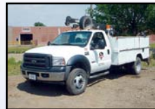
'07 FORD F-550 4X4

hydraulic air compressor, ac, and 10R22.5 tires. In good condition with good tires.