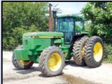
JOHN DEERE 4955

1994 JOHN DEERE 4960, 4x4 , s/n RW4960P009214, John Deere 6 cyl (200HP) dsl engine and ps trans, 3-spool hydraulic outlets, drawbar, ROPS canopy, ac, light package, dual rear wheels, 6.00-18.5R front and 18.4-42 rear tires. In good condition with good tires. (Tractor Rear Exchanged-(2) Serial Numbers)