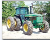
JOHN DEERE 4850

1993 JOHN DEERE 7800, 4x4 , s/n RW7800P003190, John Deere 6 cyl (145HP) dsl engine and ps trans, 3-point hitch, PTO, 2-spool hydraulic outlets, drawbar, EROPS, ac, light package, dual rear wheels, 14.9R30 front and 18.4R42 rear tires. In good condition with fair to good tires.