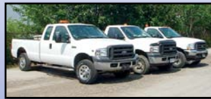
FORD PICKUP TRUCKS

2004 FORD F-250XL Super Duty 4x4 , 5.4L gas engine and automatic trans, tool boxes, fuel tank, and 235/85R16 tire. In good condition with good tires.