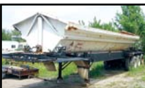
'99 CIRCLE R SS443

1999 CIRCLE R SS443 Tri-Axle Side Dump Trailer , spring suspension and 11R24.5 tires. In good condition with fair to good tires.