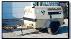
INGERSOLL RAND 185

1998 INGERSOLL-RAND P185WJD Portable Air Compressor , s/n 272362UAH221, JD 4 cyl dsl engine