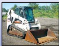
'05 BOBCAT T-190