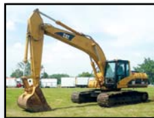
'05 CAT 325CL

1994 CAT 330L , s/n 5YM00347, Cat 3306 dsl engine and hydraulic drive, 10' dipper stick, 56" digging bucket, EROPS, light package, 16'4" crawlers, and 33" TBG pads. In fair to good condition with fair to good undercarriage. 1994 CAT 330L , s/n 5YM00417, Cat 3306B dsl engine and hydraulic drive, 12' dipper stick, 60" digging bucket, 16'6" crawlers, and 33.5" TBG pads. In fair to good condition with fair to good undercarriage.