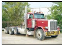
'95 PETERBILT 379