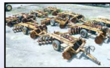
TOW BEHIND DISCS

MASTER Tow Behind Disc Harrow (Parts Missing)