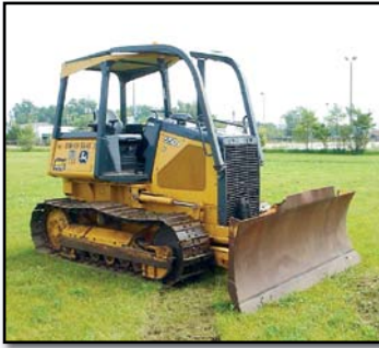
'05 JOHN DEERE 650JLT

2005 JOHN DEERE 650J LT , s/n T0650JX112290, John Deere 6 cyl dsl engine and hydrostatic trans, 6-way blade, ROPS canopy with sweeps, and 18" SBG pads. In good condition with good undercarriage.