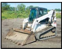
'07 BOBCAT T-300

2007 BOBCAT T-300 Crawler , s/n 532016642, Kubota 4 cyl dsl engine and hydraulic drive, 80" gp bucket with teeth and power Bob-Tach, hydraulic beyond, enclosed cab, heat and ac. In good condition with good undercarriage.