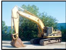
'97 CAT 345BL

1997 CAT 345BL , s/n 4SS00366, Cat 3176 dsl engine and hydraulic drive, 12' dipper stick, 68" digging bucket, 17'9" crawlers, and 35.5" TBG pads. In good condition with good undercarriage.