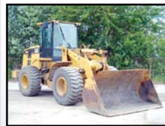
'06 CAT 938G

2006 CAT 938G Series II , s/n CAT0938GJRTB01872, Cat 3126 dsl engine and ps trans, gp loader bucket, Cat quick disconnect, EROPS, ac, light package, and 20.5x25 tires. In good condition with good tires. (Pemberton PF 1167, 72" Fork Attachments To Be Sold Separately)