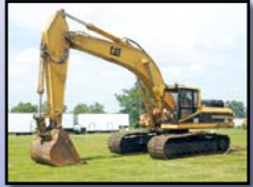
'94 CAT 330L

1995 CAT 330L , s/n 5YM00922, Cat 3306B dsl engine and hydraulic drive, EROPS, 16'6" crawlers, and 33" TBG pads. In fair condition with fair undercarriage. (Stick Broken and Boom Removed)