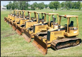
CAT D4C'S AND D5C'S