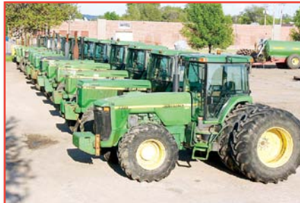
(18) JOHN DEERE TRACTORS