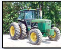
JOHN DEERE 4450

JOHN DEERE 4850, 4x4 , s/n RW4850P002609, John Deere 6 cyl (193HP) dsl engine and ps trans, 3-point hitch, PTO, 3-spool hydraulic outlets, drawbar, EROPS, ac, light package, dual rear wheels, 16.9-28 front and 18.4-42 rear tires. In good condition with fair to good tires.