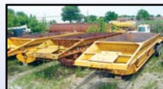
LOAD KING 2030'S

1979 LOAD KING 2030, 20 Cubic Yard Bottom Dump Trailer , 74,370# GVWR and 11R22.5 tires. In fair to good condition with fair to good tires.