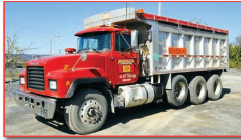
(1) OF (8) ALUMINUM BOX

1440 COWPATH RD. • HATFIELD, PA 19440 215/361-9099 • Fax: 215/361-9212 www.hunyady.com