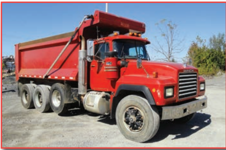
(1) OF (3) STEEL BODY

PRE-SORTED FIRST CLASS MAIL US POSTAGE PAID UPPER DARBY, PA PERMIT #45