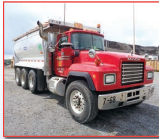
(1) OF (10) ALUMINUM TUB

(2) 2000 MACK RD688S, Mack E7-400, 400HP diesel engine and Fuller 8LL, 10 spd trans, 44,000# rears, 18,000# front and lift axles, Everlite Alumatech 16'9" aluminum tub style dump body with 2-piece tailgate with chute and power sliding tarp, air ride suspension, Jacobs 2-stage engine brake, aluminum wheels, heated mirrors, cruise control, ac, 315/80R22.5 front and lift, and 11R24.5 rear tires. In good condition with good tires.