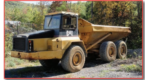
'96 CAT D250E