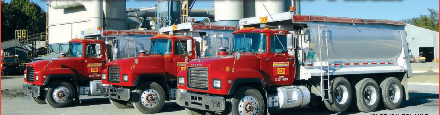
(3) OF (21) TRI-AXLE DUMP TRUCKS