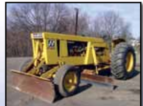
(1) OF (3) HUBER MAINTAINERS

HUBER Road Maintainer , s/n CM3597, Ford gas and Fuller 5 speed trans, 9' all hydraulic moldboard, 6' front knockdown blade, 7.50-16 front and 13.6x38 rear tires. In fair condition with fair tires.