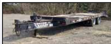
'01 CUSTOM 15 TON

2001 CUSTOM Model 15T262ADLP, 15 Ton Tandem Axle Tag-A-Long Trailer , 20'x8' load deck with 6' beavertail and ramps, anti-lock brake system, air brakes, max load 22,500#, 31,200# GVWR, and 215/75R17.5 tires. In good condition with good tires.