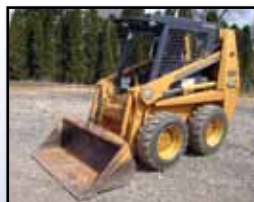
98 CASE 1840

SWEEPSTER HB60, 60" Hopper Broom , with gutter broom (skid steer)