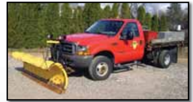
'01 FORD F-350 XL 4X4

2001 FORD Model F-350 XL Super Duty 4x4 Flatbed Truck , Powerstroke 7.3L diesel and 6 speed trans, Fisher 9' Minute Mount snowplow, 9'6" wooden flatbed with side boxes, cross box, dual rear wheels, tow package, and 235/85R16 tires. In good condition with very good tires.