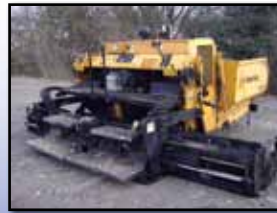
03 IR PF875L

2003 INGERSOLL-RAND/BLAW-KNOX Model PF875L Crawler Paver , s/n 120241-CFN, Kubota 3.3L diesel and hydrostatic trans, Liberty 8'-15' vibratory, heated, full matt screed, wash down system and hose, and 12" steel pads. In good condition with good undercarriage.