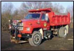
'93 FORD F-800

1993 FORD Model F-800 Single Axle Dump Truck , Cummins/Ford 8.3L diesel and 5 speed trans with 2 speed rear, 10' steel dump body with single chute and asphalt apron, Good Roads 10' hydraulic angle snow plow, spring suspension, and 11R22.5 tires. In good condition with good tires.