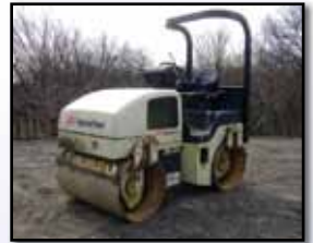
01 IR DD24