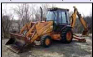
94 CASE 580SK 4X4 EXTEND-A-HOE

1997 CASE Model 580 Super L, 4x4 Tractor Loader Extend-A-Hoe , s/n JJG0202344, Case diesel and shuttle trans, GP bucket, 24" digging bucket, EROPS, 12-16.5 front and 19.5L24 rear tires. In good condition with good to very good tires.