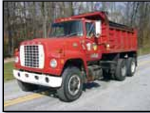
'82 FORD 8000

1982 FORD Model 8000 Tandem Axle Dump Truck , Cat 3208 (reman) diesel and Roadranger RT6613, 13 speed trans, 12'6" steel dump body with 14" asphalt apron, 44,000# rears and 16,000# front axle, spring beam suspension, 315/80R22.5 front and 10.00R20 rear tires. In fair to good condition with good tires.