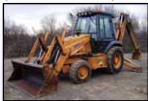
99 CASE 580 SUPER L 4X4 EXTEND-A-HOE

2002 CASE Model 580M, 4x4 Tractor Loader Extend-A-Hoe , s/n JJG0312897, Case diesel and shuttle trans, GP bucket, 36" digging bucket, enclosed ROPS cab, 12-16.5 front and 19.5L24 rear tires. In good condition with fair to good tires.