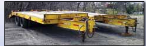
'71 & '73 GENERAL 18 TON

1999 TOWMASTER Model QT-10DD, 5 Ton Tag-A-Long Trailer , 16'6"x6'10" load deck with 5'6" ramps, electric brakes, chain dogs, and 225/75R15 tires. In good condition with good to very good tires.