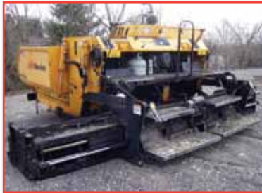
'03 IR PF875L