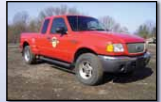
'01 FORD RANGER XLT 4X4

2001 FORD Model Ranger XLT, 4x4 Quad Cab Pickup Truck , 4.0L, 6 cylinder gas and automatic trans, 6' bed, sliding rear window, power windows, locks, and mirrors, running boards, cruise control, air conditioning, and 245/70R16 tires. In good condition with good tires.