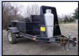
01 MARATHON KEB170

2001 MARATHON Model KEB170 Single Axle Tack Trailer , 170 gallon capacity, propane heat, 3,500GVWR, and 225/75R15 tires. In good condition with very good tires.