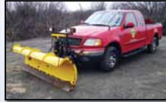
'01 FORD F-150 XLT 4X4

1986 FORD Model F-350 Flatbed Truck , 5.8L, V-8 gas and 4 speed trans, 9' flatbed with wooden stake sides, dual rear wheels, tow package with electric, and 235/85R16 tires.