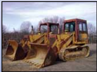
(2) 91 CASE 1155E

1991 CASE Model 1155E Crawler Loader , s/n JAK0009852, Case diesel and powershift trans, general purpose loader bucket with teeth, enclosed ROPS cab with heat, and 16" DBG pads. In fair to good condition with fair undercarriage.