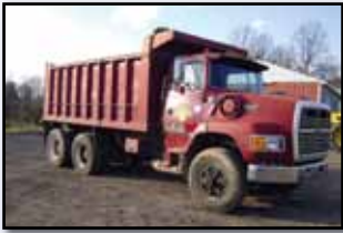
'91 FORD L8000

1991 FORD Model L8000 Tandem Axle Dump Truck , Ford 7.8L, 270HP (reman) diesel and Roadranger RT-760 8LL 10 speed trans, J&J 15' steel dump body with single chute, spring and beam suspension, exhaust brake, and 11R22.5 tires. In good condition with fair to good tires.