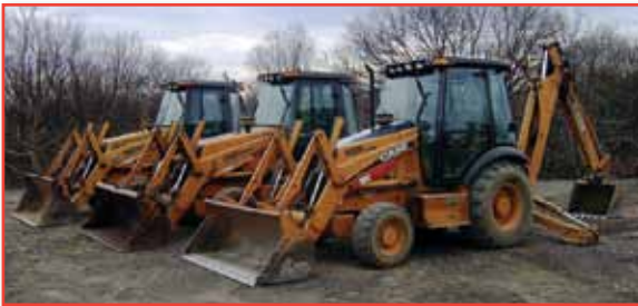
(3) OF (5) CASE 4X4 EXTEND-A-HOES