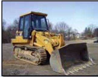
05 CAT 953C

1991 CASE Model 1155E Crawler Loader , s/n JAK0009815, Case diesel and powershift trans, general purpose loader bucket with teeth, ROPS canopy, and 16" DBG pads. In fair to good condition with fair to poor undercarriage.