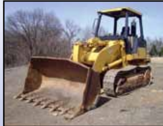
98 CAT 953C

1991 CASE Model 1155E Crawler Loader , s/n JAK0009852, Case diesel and powershift trans, general purpose loader bucket with teeth, enclosed ROPS cab with heat, and 16" DBG pads. In fair to good condition with fair undercarriage.