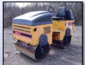
97 STONE WOLF PAC 3100