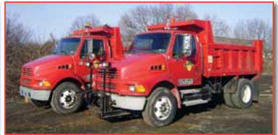
(2) '03 STERLING M7500