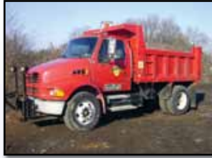
'03 STERLING M7500 W/PLOW

2003 STERLING Model M7500 Acterra Single Axle Dump Truck , Cat 3126, 275HP diesel and Eaton Fuller Roadranger 9 speed trans, Thiele 10'6" steel dump body, Good Roads 10' hydraulic angle snow plow, 21,000# rear axle and 12,000# front axle, tow package with air, spring suspension, air brakes, cruise control, air conditioning, and 11R22.5 tires. In good condition with good tires.