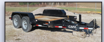
'19 CAM SUPERLINE TILT

2019 CAM SUPERLINE Model P35C Tandem Axle Tilt Trailer , equipped with 12' x 75" wood deck, deck shock absorber, adjustable height ball hitch, spring suspension, electric brakes, 8,050# GVWR, and 225/75R15 tires. In good condition with very good tires. (Purchased New)