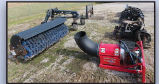
SKID LOADER ATTACHMENTS

• PALADIN 24" Hydraulic Milling Attachment , s/n 435521, with tilt and side shift (Purchased New) • BOBCAT 18" Milling Attachment , s/n 910300469 • 2019 BOBCAT 80" 6-Way Straight Blade , s/n 232115297 (Purchased New) • BOBCAT 68 Hydraulic Angle Broom , s/n 231311175 (Purchased New) • BUFFALO Turbine Hydraulic Debris Blower • 48" Fork Attachment • 66" Bolt-On Bucket Teeth (Skid Steer)