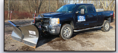
'12 CHEVY 2500HD 4X4

2012 CHEVROLET Model 2500HD Silverado LT, 4x4 Quad Cab Pickup Truck , powered by Vortec 6.0L gas engine and automatic transmission, equipped with 7' bed with spray on liner, Western MVP3, 8'6" stainless steel V-plow with Ultra Mount 2, cross toolbox, tow package, running boards, alloy wheels, power window, locks, mirrors, and seats, cruise control, air conditioning, and 265/70R18 tires. In good condition with good tires. (Odometer Reads 151,384 Miles) (Purchased New)