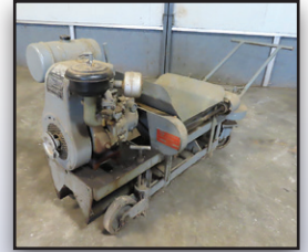
POWER CURBER 55A

POWER CURBER 55A Curb Machine , s/n 641229, Wisconsin 1 cylinder gas SEAL MASTER Model R20, 10' Truck Mount Aggregate Chip Spreader , s/n H2330-154, equipped with transport tires. In good condition with good tires. (Purchased New) CONCORD 9' Chip Spreader • 8' Chip Spreader