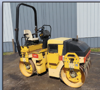
04 DYNAPAC CC122

2004 DYNAPAC Model CC122 Tandem Vibratory Roller , s/n 60117526, powered by Deutz air cooled, 2 cylinder diesel engine and hydrostatic transmission, equipped with 47" smooth drum, dual drum drive, drum cleaners, dual frequency vibration, and water system. In good condition. (Meter Reads 2,611 Hours) (Purchased New)