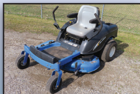
NEW HOLLAND MX18H

NEW HOLLAND MX18H Zero Turn Mower , s/n T04ZC0334, Intek 18HP gas, 40" mower deck