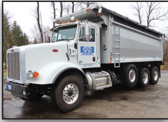
'16 PETERBILT 365

2016 PETERBILT Model 365 Tri-Axle Dump Truck , powered by Cummins ISX450 diesel engine and automatic transmission, equipped with Beau-Roc 18'6" steel dump body with chute, electric tarp, and air gate, 46,000# rears, 20,000# front axle, 20,000# steerable lift axle, 86,000# GVWR, spring suspension, aluminum wheels, power windows and locks, heated mirrors, cruise control, air conditioning, 315/80R22.5 front and lift tires, and 11R22.5 rear tires. In good to very good condition with very good tires. (Odometer Reads 145,412 Miles) (Meter Reads 8,614 Hours) (Purchased New)