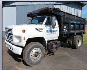
'94 FORD F-800

1994 FORD Model F-800 Single Axle Dump Truck , powered by Cummins 6 cylinder diesel engine and 5 speed transmission with 2 speed rear, equipped with 10' steel dump body with chute, manual sliding tarp, and cab protector, 8" apron, air gate, pintle hitch with air and electric, spring suspension, 33,000# GVWR, and 11R22.5 tires. In good condition with very good tires. (Odometer Reads 213,256 Miles) (Purchased New)