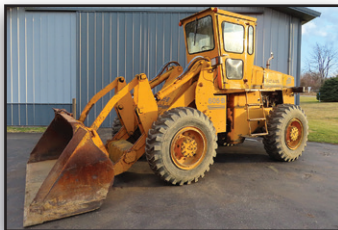
FIAT ALLIS 605B/545H

1969 FIAT ALLIS Model 605B/545H Rubber Tired Loader , s/n 2883, powered by Fiat 6 cylinder diesel engine and powershift transmission, equipped with general purpose loader bucket with bolt-on cutting edge, enclosed ROPS cab with heat, and 17.5x25 tires. In good condition with good tires. (Meter Reads 3,679 Hours)