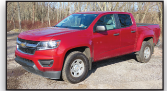
'16 CHEVY COLORADO 4X4

2016 CHEVROLET Model Colorado 4x4 Crew Cab Pickup Truck , powered by 3.6L, V-6 gas engine and automatic transmission, equipped with 5' bed with spray on liner, tow package, power windows, locks, mirrors, and seats, cruise control, air conditioning, and 265/70R16 tires. In good condition with good tires. (Odometer Reads 157,055 Miles) (Purchased New)