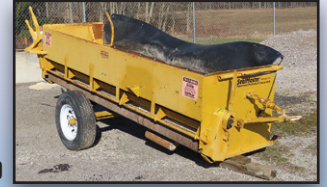
SEAL MASTER R20

(1) BLAW KNOX and (1) NEIL 550 Gallon Tow Behind Sealant Tanks , powered by Vanguard 16HP, V-Twin gas engine, mounted on tandem axle trailer with hydraulic pump and agitator, spring suspension, and 225/75D15 tires. (Neil Tank Has No Pump or Plumbing)