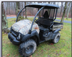
'14 KAWASAKI 610XC MULE

2014 KAWASAKI Model 610XC, 4x4 Mule , powered by Kawasaki gas engine and high low reverse transmission, equipped with manual dump bed, tow package, ROPS canopy, and 26x9.00R12 tires. In good condition with good tires. (Meter Reads 170 Hours) (Purchased New)