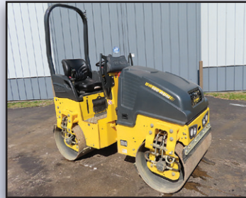
22 BOMAG BW100ADM-5

2022 BOMAG Model BW100 ADM-5 Tandem Vibratory Roller , s/n 101462122065, powered by Kubota 3 cylinder diesel engine and hydrostatic transmission, equipped with 39.5" smooth drums, dual drum drive, drum cleaners, dual frequency vibration, water system, and rollbar. In good condition. (Meter Reads 360 Hours) (Purchased New)