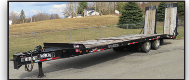
'21 ROGERS 21 TON

2021 ROGERS Model TAG21-30/102/2XSP, 21 Ton Tandem Axle Tag-A-Long Trailer , equipped with 24' level deck, 6' beavertail, 8' pneumatic ramps, 102" width, adjustable height pintle hitch, spring suspension, 52,140# GVWR, aluminum wheels, chain dogs, air brakes, and 235/75R17.5 tires. In good to very good condition with very good tires. (Purchased New)