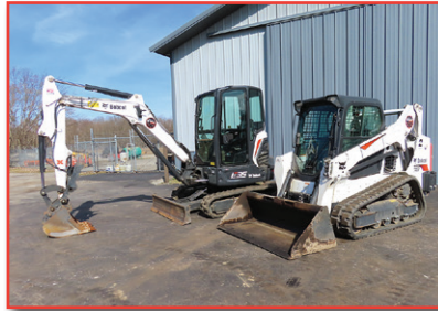
'20 BOBCAT E35i AND '19 T595

1440 COWPATH RD. • HATFIELD, PA 19440 215/361-9099 • Fax: 215/361-9212 www.hunyady.com