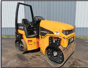
13 JCB VMT380-140

2013 JCB Model VMT380-140 Tandem Vibratory Roller , s/n GATVT380L02804094, powered by Kohler KDW2204/G, 4 cylinder diesel engine and hydrostatic transmission, equipped with 55" smooth drums, dual drum drive, drum cleaners, dual frequency vibration, and water system. In very good condition. (Meter Reads 166 Hours) (Purchased New)