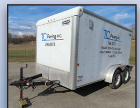
'12 CARMATE 12'

2012 CARMATE Sportster 12' Tandem Axle Cargo Trailer , equipped with aluminum cargo body, fold down rear door, curbside door, ball hitch, spring suspension, 7,000# GVWR, electric brakes, and 205/75R15 tires. In good condition with good tires. (Purchased New)