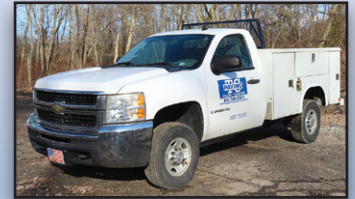
'09 CHEVY 2500HD 4X4

2009 CHEVROLET Model 2500HD, 4x4 Utility Truck , powered by Vortec 6.0L gas engine and automatic transmission, equipped with Reading 8' utility body, tow package, rear window guard, air conditioning, and 245/75R16 tires. In good condition with good tires. (Odometer Reads 143,971 Miles) (Purchased New)