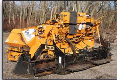
08 LEEBOY L1000T

2008 LEEBOY Model L1000T Crawler Paver , s/n 49495, powered by Hatz 2 cylinder diesel engine and hydraulic drive, equipped with 8' to 12' propane heated vibratory screed, washdown system, and 14" smooth pads. In good condition with good undercarriage. (Meter Reads 1,071 Hours) (Purchased New)