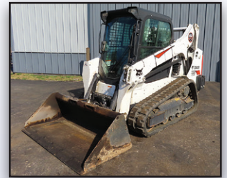
19 BOBCAT T595

2019 BOBCAT Model T595 Crawler Skid Steer Loader , s/n B3NK30196, powered by Bobcat 4 cylinder diesel engine and 2 speed hydrostatic transmission, equipped with 67" general purpose loader bucket with bolt-on cutting edge, hydraulic coupler, high flow auxiliary hydraulics, rear side counterweights, selectable joystick controls, enclosed ROPS cab with heat and air conditioning, and 12.5" rubber tracks. In good to very good condition with good tracks. (Meter Reads 1,355 Hours) (Purchased New)