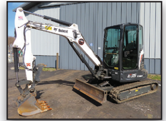
20 BOBCAT E35i

2020 BOBCAT Model E35i Mini Hydraulic Excavator , s/n B3Y215874, powered by Kubota 3 cylinder diesel engine and hydraulic drive, equipped with 5'6" dipper stick, Bobcat 24" digging bucket, swing boom, manual coupler, auxiliary hydraulics, 13" hydraulic thumb, pattern changer, 69" backfill blade, enclosed ROPS cab with heat and air conditioning, and 12" rubber tracks. In very good condition with good tracks. (Meter Reads 476 Hours) (5 Year Extended Warranty Good Until December 2024) (Purchased New) BOBCAT 36" Cleanup Bucket , with bolt-on cutting edge (E35i)