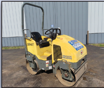
15 WACKER RD12A-90

2015 WACKER Model RD12A-90 Tandem Vibratory Roller , s/n 24235150, powered by Honda V-Twin gas engine and hydrostatic transmission, equipped with 36" smooth drums, dual drum drive, drum cleaners, and water system. In good condition. (Meter Reads 1,250 Hours) (Purchased New)