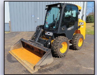
16 JCB 260

2016 JCB Model 260 Skid Steer Loader , s/n 2428700, powered by JCB 4 cylinder diesel engine and 2 speed hydrostatic transmission, equipped with JCB 78" general purpose loader bucket with bolt-on cutting edge, hydraulic coupler, high flow auxiliary hydraulics, power boom, enclosed ROPS cab with heat and air conditioning, and 12x16.5 tires. In good to very good condition with very good tires. (Meter Reads 803 Hours) (Purchased New)