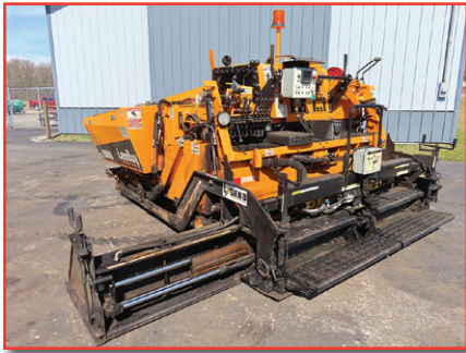
'20 LEEBOY 8500D

PRE-SORTED FIRST CLASS MAIL US POSTAGE PAID UPPER DARBY, PA PERMIT #45