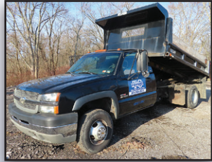
'03 CHEVY 3500

2003 CHEVROLET Model 3500 Silverado Single Axle Dump Truck , powered by Duramax 6.6L diesel engine and automatic transmission, equipped with Zoresco 10' steel dump body with electric/hydraulic hoist, tow package, dual rear wheels, cruise control, air conditioning, and 215/85R16 tires. In good condition with good tires. (Odometer Reads 86,740 Miles) (Purchased New)