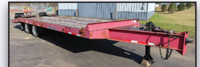
'08 ROGERS 20 TON

2008 ROGERS Model TAG20-28/102/2XSP, 20 Ton Tandem Axle Tag-A-Long Trailer , equipped with 22' level deck, 6' beavertail, (3) 7' ramps, 101.5" width, adjustable height pintle hitch, spring suspension, 48,810# GVWR, chain dogs, air brakes, and 215/75R17.5 tires. In good condition with good tires. (Purchased New)