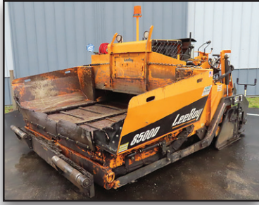
20 LEEBOY 8500D

2020 LEEBOY Model 8500D Crawler Paver , s/n 230081, powered by Kubota 2.6L diesel engine and hydraulic drive, equipped with Legend 8' to 15' electric heated vibratory screed, wash down system, and 12" smooth pads. In good to very good condition with good undercarriage. (Meter Reads 1,140 Hours) (Purchased New)