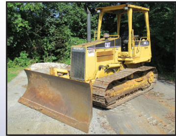
00 CAT D4CXL SERIES III

s/n 8CS00996, powered by Cat 3046 diesel engine and hydrostatic transmission, equipped with 6-way straight blade, ROPS canopy with heat, tow pin, and 18" SBG pads. In good condition with good undercarriage. (Meter Reads 06,093 Hours) (Purchased New)