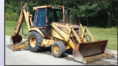
90 CASE 580K 4X4 E-HOE

s/n JG0029810, powered by Case diesel engine and shuttle transmission, equipped with general purpose loader bucket with bolt-on cutting edge, 24" digging bucket, enclosed ROPS cab with heat, 12-16.5 front and 19.5-24 rear tires. In good condition with fair front and very good rear tires. (Meter Reads 8,837 Hours) (Purchased New) 36" and 18" Digging Buckets (Cat 420) • 36", 18", and 12" Digging Buckets (Case 580K)