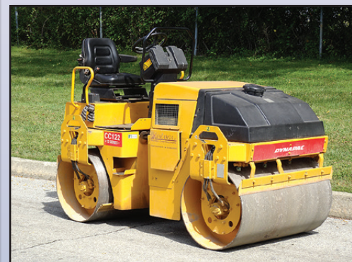
'98 DYNAPAC CC122 12 SERIES

ROSCO Model Roll Pac III Tandem Static Roller , s/n unknown, powered by Kohler 1 cylinder gas engine and hydrostatic chain drive, equipped with 27.5" split front drum, 33" rear smooth drum, and water system. In good condition. (Meter Reads 1,629 Hours) (Purchased New)