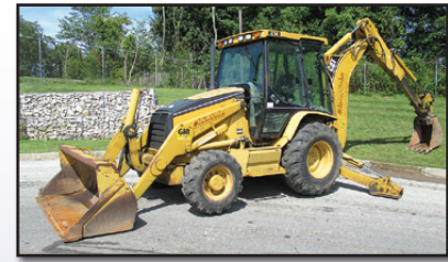
04 CAT 420D 4X4 E-HOE

s/n FDP20589, powered by Cat diesel engine and shuttle transmission, equipped with general purpose loader bucket with bolt-on cutting edge, 24" digging bucket, manual rear coupler, rear joystick controls, enclosed ROPS cab with air conditioning, 12.5/80-18 front and 19.5L-24 rear tires. In good condition with fair to good tires. (Meter Reads 3,767 Hours – Charged @ 3,112 Hours) (Purchased New)