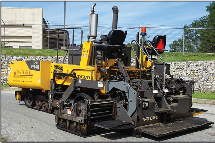
'17 VOLVO PF4410

2017 VOLVO Model PF4410 Crawler Asphalt Paver , s/n 6378085, powered by Deutz TCD-2013, 158HP diesel engine and hydraulic drive, equipped with Ultimat 8/16, 8' – 16' electric heated vibratory screed, s/n 1123, (4) 1' heated extensions, power crown controls, Topcon ready, rear work lights, and (2) screed extension remote control sets. In very good condition with good undercarriage. (Meter Reads 01,085 Hours) (Purchased New)