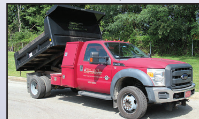
'12 FORD F-550XL SUPER DUTY 4X4

2012 FORD Model F-550XL Super Duty 4x4 Dump Truck , powered by Powerstroke 6.7L diesel engine and automatic transmission, equipped with Marauder 9' dump body with electric hoist, manual tarp, and 2-way tailgate, Boss 9'2" Power-V XT plow package, behind cab utility box, dual rear wheels, tow package, power windows, locks, and mirrors, cruise control, air conditioning, and 225/70R19.5 tires. In good condition with good tires. (Odometer Reads 42,398 Miles) (Purchased New)