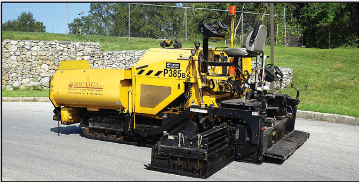
'19 WEILER P385B

2017 VOLVO Model PF4410 Crawler Asphalt Paver , s/n 6378085, powered by Deutz TCD-2013, 158HP diesel engine and hydraulic drive, equipped with Ultimat 8/16, 8' – 16' electric heated vibratory screed, s/n 1123, (4) 1' heated extensions, power crown controls, Topcon ready, rear work lights, and (2) screed extension remote control sets. In very good condition with good undercarriage. (Meter Reads 01,085 Hours) (Purchased New)