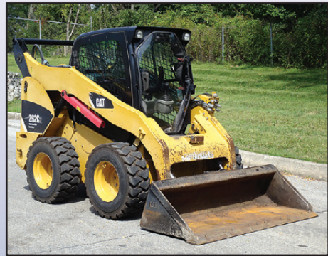
12 CAT 262C2

2011 CATERPILLAR Model PC210, 38" Milling Attachment, s/n GDR00643, with hydraulic side shift. (Skid Steer) 48" Fork Attachment (Skid Steer) • (4) 12-16.5 Tires, on rims (Used)