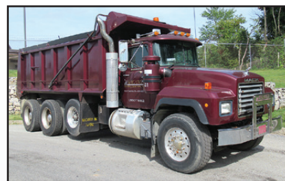
'99 MACK RD688S

1999 MACK Model RD688S Tri-Axle Dump Truck , powered by Mack E7-400, 400HP diesel engine and Eaton Fuller 8LL, 10 speed transmission, equipped with BiBeau 17'6" steel dump body with bed vibrator, electric tarp, and single chute, 44,000# rears, 18,000# front axle, 18,000# lift axle, Mack camelback