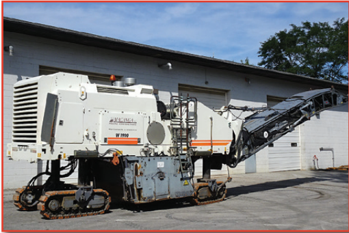
'05 WIRTGEN W1900

PRE-SORTED FIRST CLASS MAIL US POSTAGE PAID UPPER DARBY, PA PERMIT #45