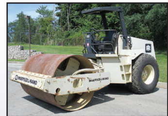
95 IR SD100D PRO PAC

s/n 142375, powered by Cummins 4BTA3.9-C diesel engine and hydrostatic transmission, equipped with 84" smooth drum, variable speed vibration, ROPS canopy, and 23.1-26 tires. In good condition with good tires. (Meter Reads 04,166 Hours)