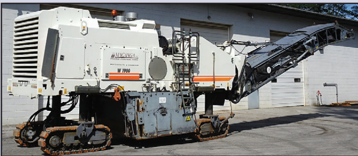
'05 WIRTGEN W1900

2019 WEILER Model P385B Crawler Asphalt Paver , s/n HJB002701, powered by Cat C3.4B diesel engine and 3 speed hydrostatic transmission, equipped with 8' – 15' 8" electric heated vibratory screed, dual operator positions, Topcon grade control ready, and manual crown control. In good to very good condition with good undercarriage. (Meter Reads 1,545 Hours) (Purchased New)