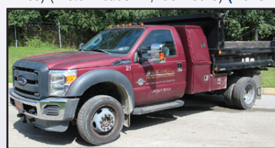
'16 FORD F-550 SUPER DUTY 4X4

suspension, double frame, tow package with air, Jacobs 2-stage engine brake, aluminum front and lift wheels, steel rear, Good Roads 11' snow plow, with manual angle, plow and spreader controls, aluminum wheels, heated mirrors, cruise control, air conditioning, 385/65R22.5 front and lift tires, and 11R24.5 rear tires. In good condition with fair and good tires. (Odometer Reads 270,549 Miles) (Meter Reads 21,296 Hours) (Purchased New)