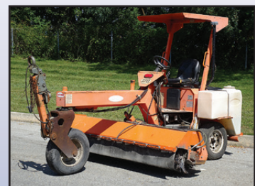
07 LAY-MOR 8HC

s/n 32070, powered by Kubota 4 cylinder diesel engine and hydrostatic transmission, equipped with 8' power angle broom with water spray system, tow package with surge brakes, ROPS post with canopy, and 205/75R14 tires. In good condition with fair tires. (Meter Reads 1,197 Hours) (Purchased New)