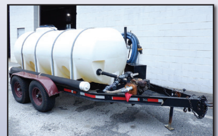
CLARK 1,000 GALLON

CLARK Tandem Axle Water Trailer , s/n T60100210D, equipped with 1,000 gallon poly tank, 2" gas powered centrifugal pump with suction hose, spring suspension, and 31x10.50R15 tires. In good condition with good tires. (Purchased New)