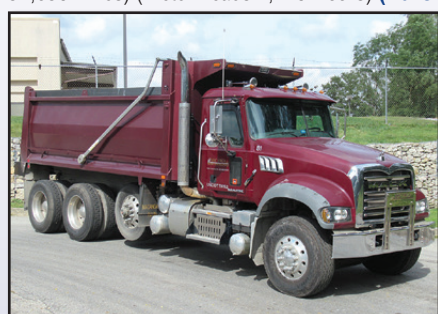
'15 MACK GRANITE GU713

camelback suspension, aluminum wheels, power windows and locks, power heated mirrors, cruise control, air conditioning, 315/80R22.5 front and lift tires, and 11R24.5 rear tires. In very good condition with good tires. (Odometer Reads 57,653 Miles) (Meter Reads 4,743 Hours) (Purchased New)