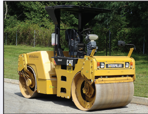
'11 CAT CB434D

2015 CATERPILLAR Model CB34B Vibratory Tandem Roller , s/n 42300278, powered by Cat C2.2 diesel engine and hydrostatic transmission, equipped with 50.5" smooth drums, drum selector, water system, and folding ROPS post. In good condition. (Meter Reads 2,988 Hours) (Purchased New)