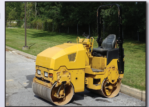
'08 CAT CB14

2008 CATERPILLAR Model CB14 Vibratory Tandem Roller , s/n DST00230, powered by Cat C1.1 diesel engine and hydrostatic transmission, equipped with 35" front and 31" rear smooth drums, water system, and folding ROPS post. In good condition. (Meter Reads 874 Hours – Replaced @ 2,597 Hours) (Purchased New)