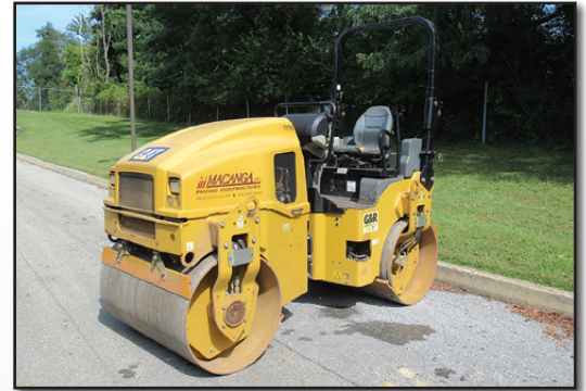
'15 CAT CB34B

2015 CATERPILLAR Model CB34B Vibratory Tandem Roller , s/n 42300278, powered by Cat C2.2 diesel engine and hydrostatic transmission, equipped with 50.5" smooth drums, drum selector, water system, and folding ROPS post. In good condition. (Meter Reads 2,988 Hours) (Purchased New)