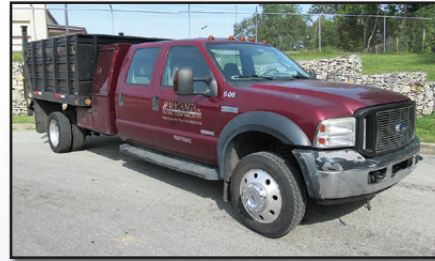
'06 FORD F-550XL

12 volt pump, 24" behind cab utility box, tow package, dual rear wheels, power windows, locks, and mirrors, cruise control, air conditioning, and 225/70R19.5 tires. In good condition with good tires. (Odometer Reads 120,327 Miles) (New Engine Installed @ 119,963 Miles 3/29/23 – Warranty 2 Year/24,000 Miles - Remainder Transferrable) (Purchased New)