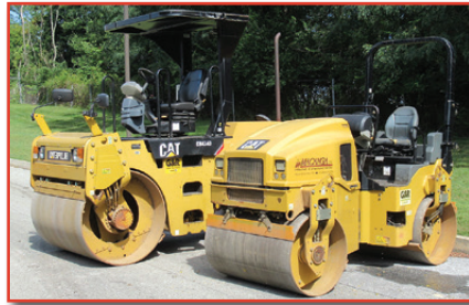
'15 CAT CB34B AND '11 CAT CB434D

1440 COWPATH RD. • HATFIELD, PA 19440 215/361-9099 • Fax: 215/361-9212 www.hunyady.com