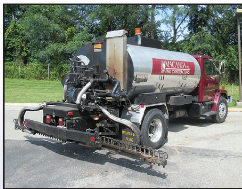
02 ROSCO MAXIMIZER ON FREIGHTLINER FL70

powered by Cummins 5.9L, 205HP diesel engine and 5 speed transmission with 2 speed rear, equipped with 2002 ROSCO Maximizer 1,900 gallon hydrostatic distributor body, s/n 38127, upper and lower burners, 8' – 16' hydraulic positioning rear spray bar, Roscoe EZ-3S cab controls, spring suspension, aluminum wheels, 23,000 lb rear and 10,000 lb front axles, 33,000# GVWR, power and heated mirrors, cruise control, air conditioning, and 11R22.5 tires. In good condition with good tires. (Odometer Reads 28,322 Miles) (Meter Reads 3,419 Hours) (Purchased New)