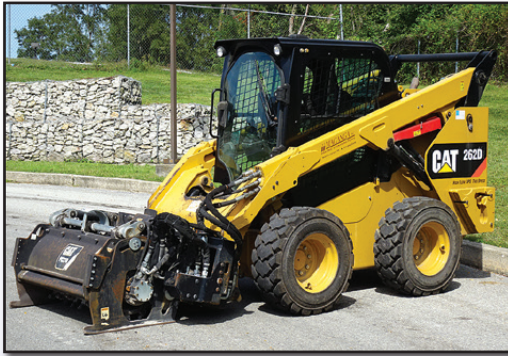
16 CAT 262D (MILLING ATTACHMENT SOLD SEPARATELY)

s/n DTB04840, powered by Cat 3.3B diesel engine and 2 speed hydrostatic transmission, equipped with Cat 74" general purpose loader bucket with bolt-on cutting edge, hydraulic coupler, high flow XPS auxiliary hydraulics, 9-pin electrics, enclosed ROPS cab with air conditioning, and 12x16.5 tires. In good condition with very good tires. (Meter Reads 2,302 Hours) (Purchased New)