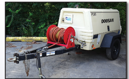
'16 DOOSAN 185CFM

2016 DOOSAN Model P185WD0T4F, 185CFM Portable Air Compressor , s/n 477828UHAAF63, powered by Doosan 4 cylinder diesel engine, equipped with front mounted hose reel and 205/75R15 tires. In very good condition with good tires. (Meter Reads 469 Hours)