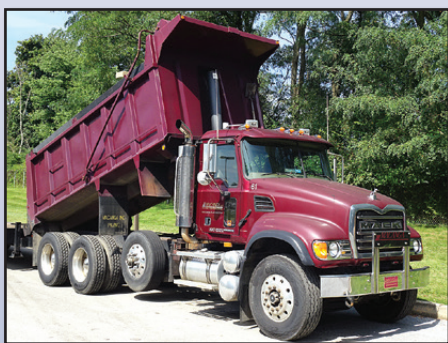
'06 MACK GRANITE CV713

2006 MACK Model Granite CV713 Tri-Axle Dump Truck , powered by Mack AI-427, 427HP diesel engine and Allison automatic transmission, equipped with Beau-Roc 17'6" heated steel dump body with bed vibrator, electric tarp, and single chute, 46,000# rears, 18,000# front axle, 20,000# lift axle, double frame, 2-stage engine brake, tow package with air, washdown hose, Mack camelback suspension, aluminum wheels, power locks, heated mirrors, cruise control, air conditioning, 315/80R22.5 front and lift tires, and 11R24.5 rear tires. In good condition with good to very good tires. (Odometer Reads 183,266 Miles) (Meter Reads 13,754 Hours) (Reconstructed Title) (Purchased New)