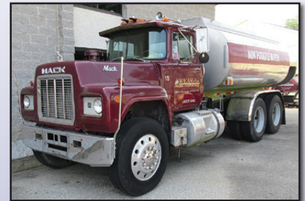
'79 MACK R686ST

1979 MACK Model R686ST Tandem Axle Water Truck , powered by Mack ENDT-676, 283HP diesel engine and 5 speed transmission, equipped with 2,900 gallon aluminum tank, Honda 2" centrifugal pump, hose reel, Mack camelback suspension, Jacobs engine brake, aluminum front wheels, and