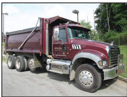
'18 MACK GRANITE GU713

2018 MACK Model Granite GU713 Tri-Axle Dump Truck , powered by Mack MP8-425, 425HP diesel engine and Allison automatic transmission, equipped with Beau-Roc 17'6" heated steel dump body with bed vibrator, electric tarp, and single chute, 46,000# rears, 18,000# front axle, 20,000# lift axle, double frame, 2-stage engine brake, washdown hose, Mack