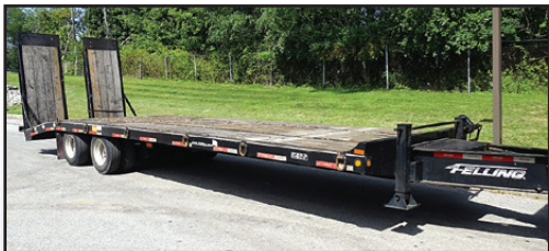
'17 FELLING 22.5 TON

2017 FELLING Model FT-45-2 LP Plus 22.5 Ton Tandem Axle Tag-A-Long Trailer , equipped with 8'6" x 24' level deck, 6' beavertail, 7'6" air powered ramps, spring