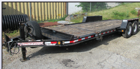
(1) OF (2) TOWMASTER 7 TON TILT DECKS

2016 TOWMASTER Model T-12DT, 7 Ton Tandem Axle Tilt Deck Tag-A-Long Trailer , equipped with 81" x 48" stationary front deck, 18' tilting deck, 16,320# GVWR, electric brakes, chain dogs, and 235/85R16 tires. In good condition with good tires. (Purchased New)