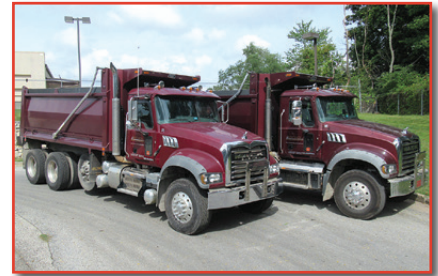
'18 AND '15 MACK GRANITE GU713

PRE-SORTED FIRST CLASS MAIL US POSTAGE PAID UPPER DARBY, PA PERMIT #45