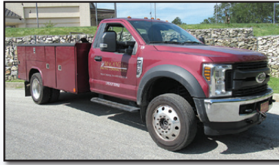
'19 FORD F-450XL 4X4

2019 FORD Model F-450XL, 4x4 Utility Truck , powered by 6.8L gas engine and automatic transmission, equipped with Reading 11' open utility body with spray-on liner, Boss 9'2" Power-V plow package, tow package, dual rear wheels, aluminum wheels, power windows, locks, and mirrors, cruise control, air conditioning, and 225/70R19.5 tires. In very good condition with very good tires. (Odometer Reads 018,173 Miles) (Purchased New)