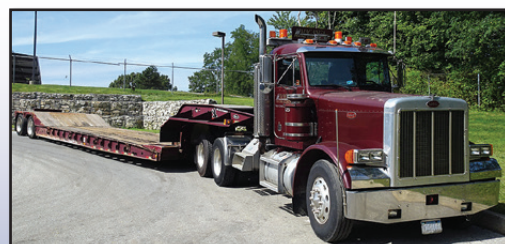
'93 PETERBILT 379 AND '06 ETNYRE 35 TON

2006 ETNYRE Model Blackhawk PRTN35TD-PS, 35 Ton Tandem Axle Lowboy Trailer , equipped with non ground bearing hydraulic detachable gooseneck, air ride suspension, 102" x 24'6" level deck, 58" transition, 7'6" deck over axles, aluminum wheels, chain dogs, and 255/70R22.5 tires. In good condition with good tires. (Purchased New)