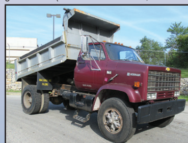
'86 CHEVY KODIAK 70

1986 CHEVROLET Kodiak 70 Single Axle Dump Truck , powered by Cat 3208 diesel engine and 5 speed transmission with 2 speed rear, equipped with 10' steel dump body with manual tarp and single chute, spring suspension, 29,900# GVWR, tow package with air, and 10.00R20 tires. In fair to good condition with fair to good tires. (Odometer Reads 073,327 Miles) (Purchased New)