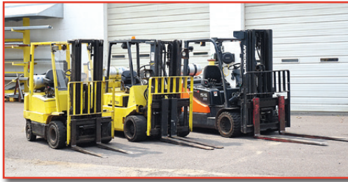
(3) OF (4) FORKLIFTS

1440 COWPATH RD. • HATFIELD, PA 19440 215/361-9099 • Fax: 215/361-9212 www.hunyady.com