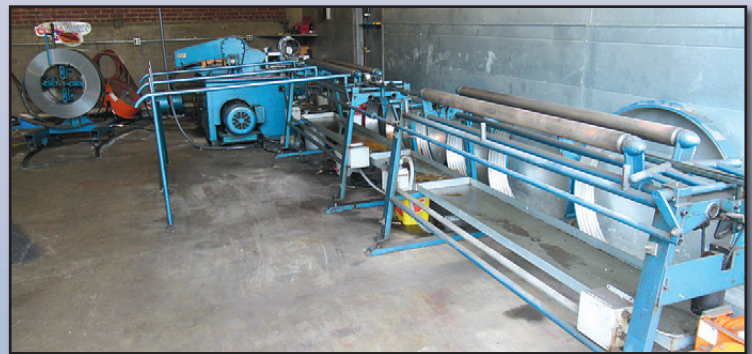
02 SPIRAL HELIX 200L SPIRAL DUCT FORMING MACHINE

DURO DYNE MFPT Compact Pinspotter , 220V, inserter gun, bench mount. (PA)