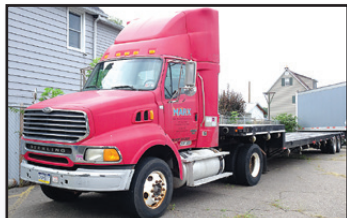
'05 STERLING A9500 AND STEP DECK

2005 STERLING A9500 Single Axle Truck Tractor , powered by Mercedes OM460, 450HP diesel engine and Eaton Fuller 10 speed transmission, 22,700# rear and 12,000 front axles, air ride suspension, cab fairings, A/C, cc, and 295/75R22.5 tires. In good condition. (PA)