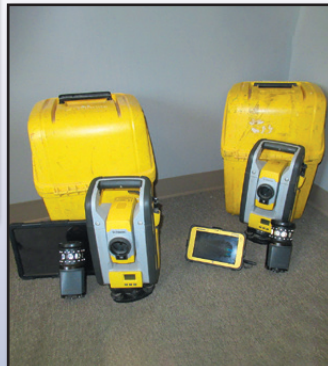
TRIMBLE ROBOTIC TOTAL STATIONS

TRIMBLE RTS673 Robotic Total Station, with data tablet and prism target. (PA) 2015 TRIMBLE RTS873 Robotic Total Station, with data tablet and prism target. (PA)