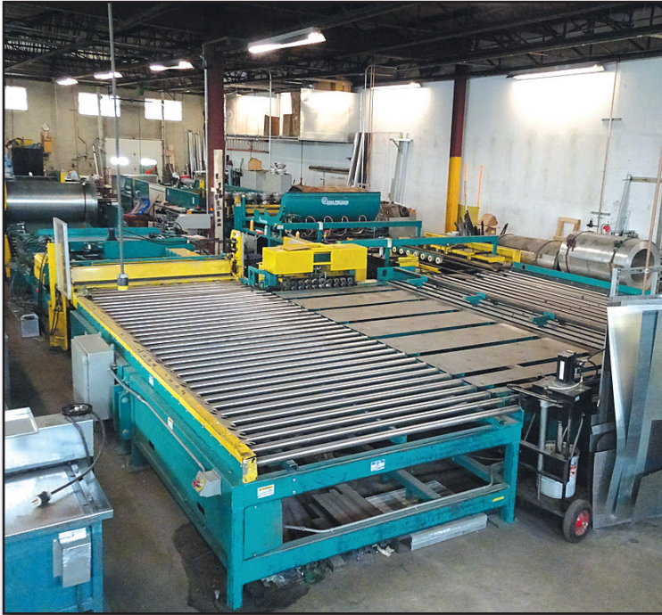
2012 Iowa Precision Pro-Fabriduct HVAC Full Coil Line System consisting of:

6-Reel Uncoiling System: 72" width reel capacity and individual feeder paths • Pro-Ductomatic Processing System, 14 GA capacity with beader, notching units, cleat roller, sheer/brake head • Left Hand 90° Transfer Table Station • Single Side Seam Roll Former Station with (2) sets of forming rolls, transfer table • TDC Flange Roll Forming System, 96" transfer table, 90-degree transfer, dual side TDC flange forming station, umbilical remote operation • Insulation and Pinning System, gluing system, single insulation roll, squaring arm, insulation knife, Dura Dyne FGMH multihead pin spotter with (6) VPF-2 vibratory parts feeder heads • Wrap Brake Station • Pedestal Mounted CNC Programmable Controls with display screen, (2) control cabinets, 480V, 3 phase. (Rigging Fee) (NJ)