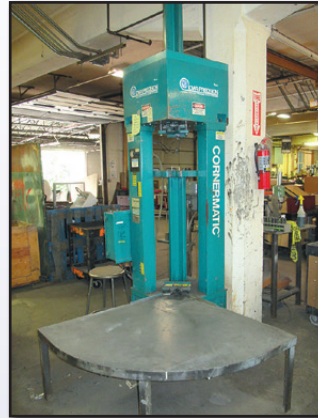
00 IOWA PRECISION CORNERMATIC

2009 IOWA PRECISION FAH-1672-VP, Pro-XVI, Whisper-Loc Seam Closing Machine , 16 GA capacity, 18" to 72" adjustable height and 32.5"x35" in floor opening. (Rigging Fee) (NJ)