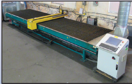
LOCKFORMER 20' X 5' PLASMA CUTTING SYSTEM