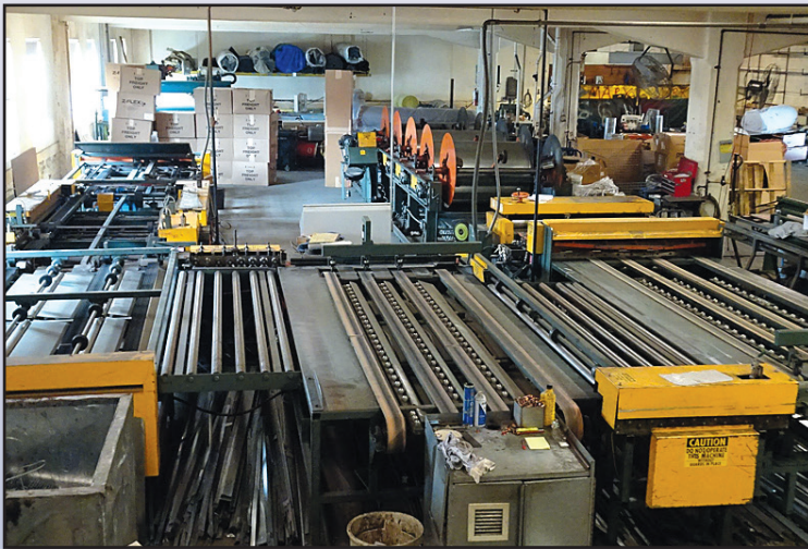
2000 Engel Compact II Coiline HVAC Duct Manufacturing System consisting of:

6-Reel Uncoiling System: 72" width reel capacity and individual feeder paths • Pro-Ductomatic Processing System, 14 GA capacity with beader, notching units, cleat roller, sheer/brake head • Left Hand 90° Transfer Table Station • Single Side Seam Roll Former Station with (2) sets of forming rolls, transfer table • TDC Flange Roll Forming System, 96" transfer table, 90-degree transfer, dual side TDC flange forming station, umbilical remote operation • Insulation and Pinning System, gluing system, single insulation roll, squaring arm, insulation knife, Dura Dyne FGMH multihead pin spotter with (6) VPF-2 vibratory parts feeder heads • Wrap Brake Station • Pedestal Mounted CNC Programmable Controls with display screen, (2) control cabinets, 480V, 3 phase. (Rigging Fee) (NJ)