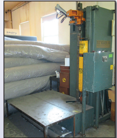
00 ENGEL PITTSBURGH SEAM CLOSER

2000 IOWA PRECISION CM-F-HD Dual Head Cornermatic Corner Insertion Machine , 55"x18 GA capacity and 48" radius table. (Rigging Fee) (PA)