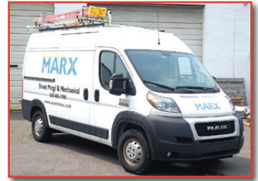
'21 RAM 2500 PROMASTER