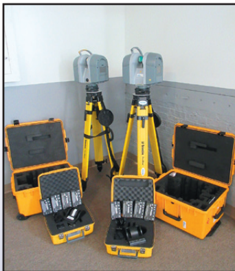
TRIMBLE 3D LASER SCANNERS

TRIMBLE RTS673 Robotic Total Station, with data tablet and prism target. (PA) 2015 TRIMBLE RTS873 Robotic Total Station, with data tablet and prism target. (PA)