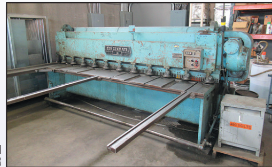
CINCINNATI MECHANICAL SHEAR

CINCINNATI 1010, 10'x10 GA Mechanical Shear, 120" squaring arm, 20"x10 feed table, (2) front 54" support arms, power back gauge, and foot bar control. (Rigging Fee) (NJ)