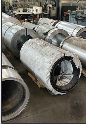
SHEET METAL COILS

(2) 60" Coils, 18 Gauge and 20 Gauge, 304 Stainless Steel (NJ) • 60" Coil, 24 Gauge, Galvanized (NJ) • (2) 60" Coils, 16 Gauge and 24 Gauge, Cold Rolled Mild Steel (NJ) • 56" x 250' Coil, 16 Gauge, Galvanized (NJ) • (2) 48" Coils, 16 Gauge, Galvanized (NJ) • (3) 60" Coils, 22 Gauge, Carbon Coated Galvanized 3/32 Round Punched (PA) • 4' x 8' Sheets of Stainless, Galvanneal, Galvanized, and Aluminum (NJ and PA)