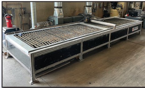
EAST COAST PLASMA CUTTING SYSTEM

LOCKFORMER Vulcan Plus 10 Plasma Cutting System, 20'x5' burn table, Hypertherm Powermax 65 plasma cutting system, single torch, exhaust system, and Mestek CNC controls. (Rigging Fee) (PA)