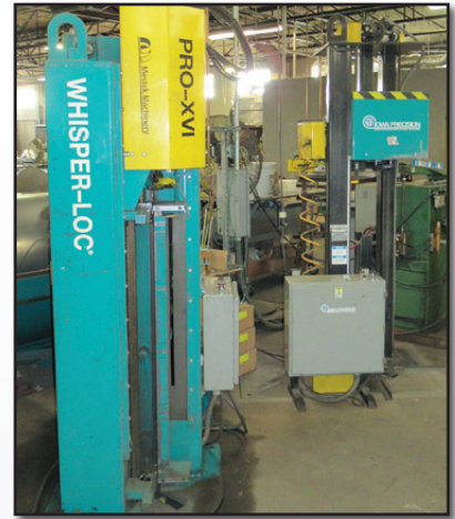
09 IOWA PRECISION CORNERMATIC AND WHISPER-LOC

2000 IOWA PRECISION CM-F-HD Dual Head Cornermatic Corner Insertion Machine , 55"x18 GA capacity and 48" radius table. (Rigging Fee) (PA)