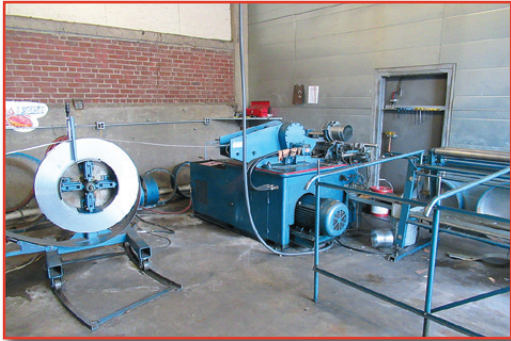
'02 SPIRAL HELIX 200L SPIRAL DUCT FORMING MACHINE

PRE-SORTED FIRST CLASS MAIL US POSTAGE PAID UPPER DARBY, PA PERMIT #45