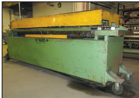
ENGEL M1640 ROLL FORMER

• PEXTO 30"x2" Pyramid Roll, 1/2HP, foot pedal control, table mounted. (NJ) • PEXTO 381D, 36"x22 GA Pyramid Roll, stand mounted. (PA) • Pneumatic C-Frame Punch, 5" center, table mounted. (PA)