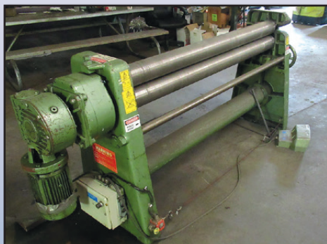
ROUND0 60 INCH PYRAMID ROLL