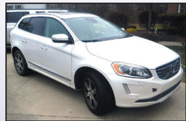
'15 VOLVO XC60 AWD

2015 VOLVO XC60, T6 Platinum AWD Sport Utility Vehicle , powered by 3.0L turbo gas engine and automatic transmission, sunroof, leather interior, interior power package, cc, A/C, and alloy wheels. In good condition. (PA)