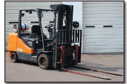
'15 DOOSAN GC55C-5

2015 DOOSAN GC55C-5 , 10,450# Cushion Tired Forklift, powered by LP gas engine and powershift transmission, 3-stage mast, 180" lift height, hydraulic side shift, 72" forks, and FOPS canopy. In good condition. (PA)