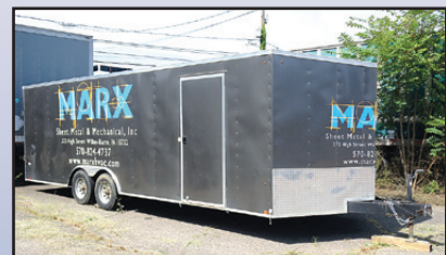
(1) OF (3) LGS 24' ENCLOSED TRAILERS

(4) WABASH and PINES 28' x 102" Single Axle Aluminum Pup Van Trailers – (1) with Maxon 2,500 lb lift gate. In good condition. (PA) (5) 48' and 45' Tandem Axle Van Trailers . In fair to good condition. (NJ)