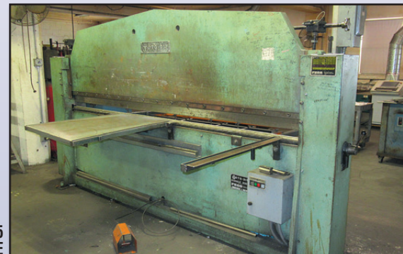
ROTO-DIE 15 PRESS BRAKE

FECO / ROTO-DIE 15, 10'x14 GA Hydraulic Press Brake, 15HP, rear operated back gauge, (3) 39" front and (2) rear support arms, and foot pedal control. (Rigging Fee) (PA)