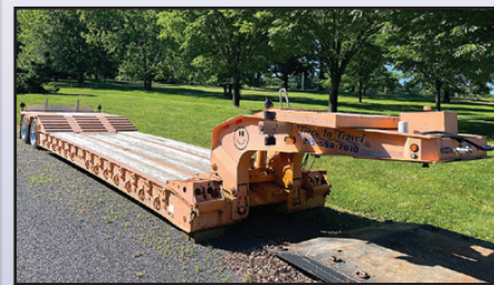
'11 KAUFMAN 35 TON

2011 KAUFMAN 35 Ton Tandem Axle Lowboy Trailer, equipped with non ground bearing detachable gooseneck, 8'6" x 22' level deck, 3'6" transition, 8' deck over axles, Honda GX390 pony motor,