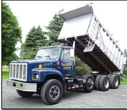
'96 INTERNATIONAL 2674

1996 INTERNATIONAL Model 2674 Tri-Axle Dump Truck , powered by Cummins 455A diesel engine and Fuller 10 speed transmission, equipped with J&J 16'6" steel heated dump body with chute, 2-way gate, and electric tarp, spring/walking beam suspension, double frame, tow package with air, Jacobs engine brake, 315/80R22.5 front and 11R22.5 rear and lift tires. In good condition with fair tires. (144,632 Miles) (009,380 Hours)