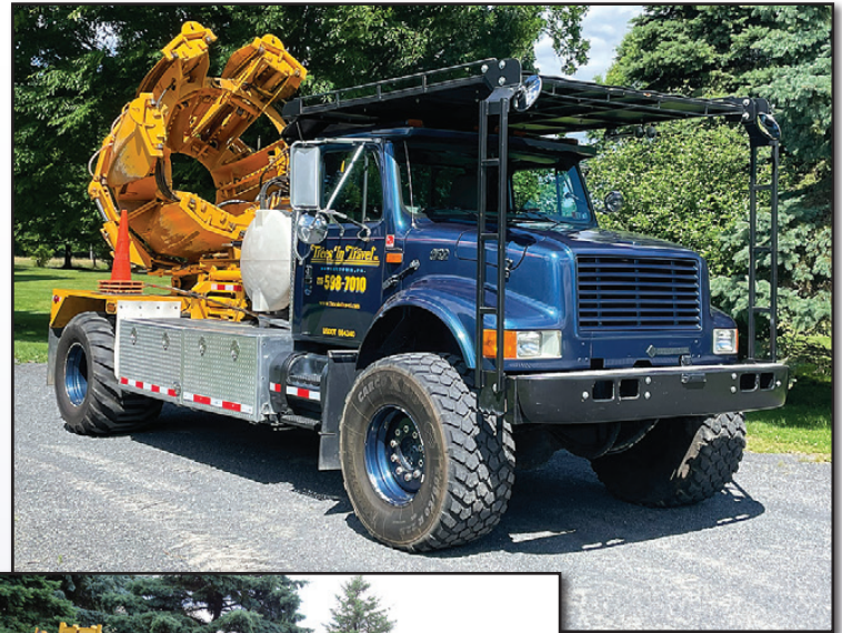
STOCKER 60" ON '95 INT'L 4800

(2) 85" Portable Pods (Purchased New) • VERMEER 44" Tree Spade , with truck frame (Parts)