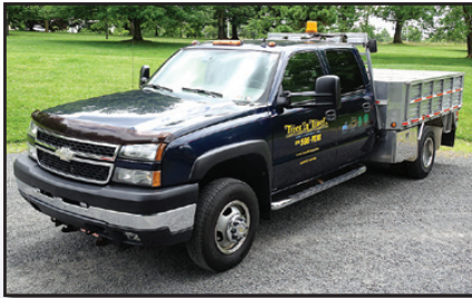
'06 CHEVY 3500 4X4

2006 CHEVROLET Model 3500, 4x4 Crew Cab Flatbed Truck , powered by 6.6L diesel engine and automatic transmission, equipped with 9' aluminum flatbed body with 19" removable sides, 8' width, Boss 9'2" Power-V snow plow, tow package, dual rear wheels, running boards, power windows, locks, mirrors, and seats, heated seats, cruise control, air conditioning, and 215/85R16 tires. In good condition with good tires. (184,079 Miles)