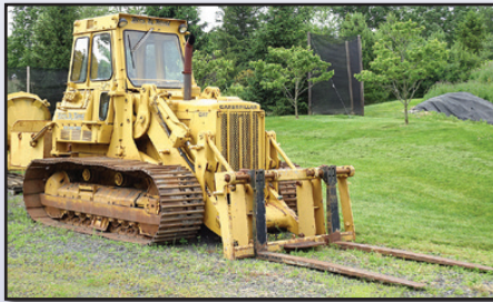
'80 CAT 977L

1980 CATERPILLAR Model 977L Crawler Loader, s/n 14X1821, powered by Cat 3306 diesel engine and powershift transmission, equipped with general purpose loader bucket with teeth, rear counterweight tray, auxiliary hydraulics, enclosed ROPS cab, and 27" TBG pads. In good condition with good undercarriage.