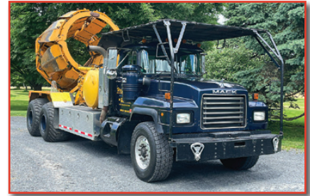
STOCKER 85" ON '00 MACK RD688S

PRE-SORTED FIRST CLASS MAIL US POSTAGE PAID UPPER DARBY, PA PERMIT #45