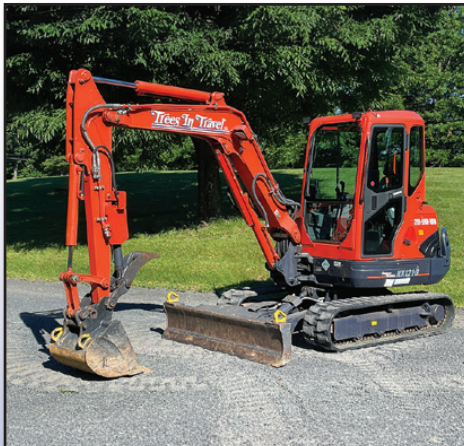
'11 KUBOTA KX121-3

2011 KUBOTA Model KX121-3 Mini Hydraulic Excavator , s/n 72437, powered by Kubota 4 cylinder diesel engine and hydraulic drive, equipped with swing boom, 5' dipper stick, 24" digging bucket, hydraulic thumb, manual coupler, auxiliary hydraulics, 70" 6-way hydraulic backfill blade, and enclosed ROPS cab with air conditioning. In very good condition with good tracks. (1,748 Hours) (Purchased New)