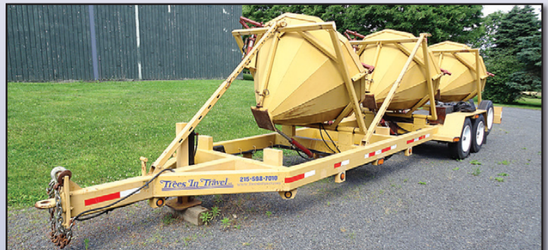
STOCKER 60" 3-POD

powered by DT466 diesel engine and Fuller 6 speed transmission with hi-lo, equipped with cab protector/brush rack, 200 gallon poly water tank, under frame utility boxes, cab controls, spring suspension, heated mirrors, air conditioning, and 500/60R22.5 flotation tires. In good condition with good tires. (050,239 Miles) (005,330 Hours) (All Hydraulic Blade Cylinders Recently Rebuilt) (Plus Extra Set of 4 Michelin 445/65R22.5 High Speed Flotation Tires) (Truck is Fully Equipped with Tools and Rigging Needed For Jobsites)