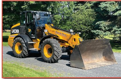
'13 JCB TM320

1440 COWPATH RD. • HATFIELD, PA 19440 215/361-9099 • Fax: 215/361-9212 www.hunyady.com