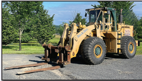
'86 KAWASAKI 95Z

1986 KAWASAKI Model 95Z Rubber Tired Loader, s/n 95Z2C3150, powered by Cummins NTA855C diesel engine and powershift transmission, equipped with general purpose loader bucket with bolt-on cutting edge, detachable extra rear counterweight, ROPS over enclosed cab, and 26.5-25 tires. In good condition with fair to good tires. (10" x 8' Fork Attachment, with 7'6" Carriage)