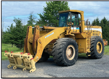
'96 KAWASAKI 115Z IV

1996 KAWASAKI Model 115Z IV Rubber Tired Loader, s/n 11C25008, powered by Cummins diesel engine and powershift transmission, equipped with general purpose loader bucket with teeth, ROPS over enclosed cab with heat and air conditioning, and 35/65-33 tires. In fair to good condition with fair tires. (7'6" Fork Carriage)