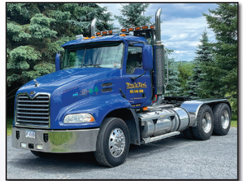
'04 MACK VISION CX613

2004 MACK Model Vision CX613 Tandem Axle Truck Tractor, powered by Mack AC-460P, 460HP diesel engine and Maxitorque T310, 10 speed transmission, equipped with wetline, 40,000# rears, 12,000# front axle, air ride suspension, 2-position engine brake, rear pintle hitch with air, air slide 5th wheel, aluminum wheels, cruise control, air conditioning, and 275/80R22.5 tires. In very good condition with very good tires. (47,145 Miles) (2,695 Hours)