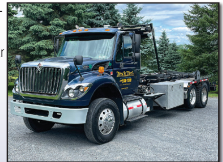
'11 INTERNATIONAL 7400 WITH STELLAR HOOK LIFT

2011 INTERNATIONAL Model 7400 Pusher Axle Hook Lift Truck, powered by 2010 Navistar Maxx Force GDT285S, 285HP diesel engine and Allison automatic transmission, equipped with Stellar 174-20-40 hook lift body, s/n LWW14ZK90, with 17' rail, Pioneer hydraulic automatic tarp system, 21,000# front axle, 12,000# lift axle, 53,000# GVWR, spring suspension, tow package with air, aluminum wheels, cruise control, and 11R22.5 tires. In very good condition with good tires. (51,624 Miles) (2,368 Hours) (Purchased New)