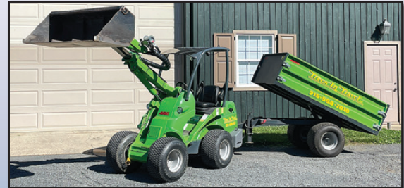
'14 AVANT M635UIPCG (DUMP SOLD SEPARATELY)

2014 AVANT Model M635UIPCG Articulated Rubber Tired Loader , s/n 713501349, powered by Kubota diesel engine and hydrostatic transmission, equipped with telescopic boom, 65" general purpose loader bucket, manual coupler, front auxiliary hydraulics, rear auxiliary hydraulics, removable suitcase weights, ROPS canopy, heated seat, and 26x12.00-12 turf tires. In very good condition with very good tires. (00,938 Hours) (Purchased New)