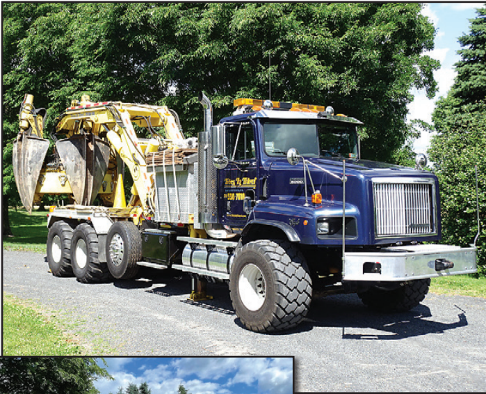
'98 OPTIMAL-OPITZ 2500, 98" ON '99 INT'L 5000

1998 OPTIMAL-OPITZ Model 2500, 98" Hydraulic Tree Spade , s/n 982503, equipped with (5) blades and auto lube system, mounted on