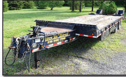
'96 EAGER BEAVER 20 TON

1996 EAGER BEAVER Model 20XPT, 20 Ton Tandem Axle Tag-A-Long Trailer , equipped with 8'6" x 19' level deck, 6' beavertail, 6' ramps, chain dogs, 48,100# GVWR, and air brakes. In good condition with good tires.