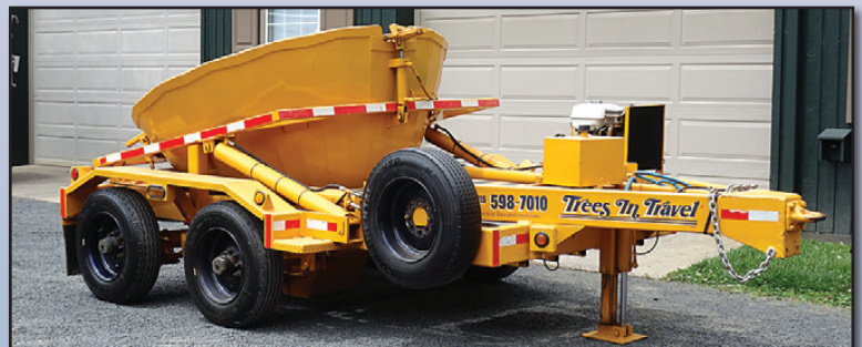
MIDWEST PT1-85, 85" SINGLE POD