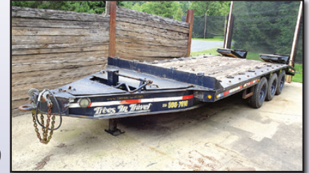
'83 EAGER BEAVER 9 TON

1983 EAGER BEAVER 9 Ton Tri-Axle Tag-A-Long Trailer , equipped with 8' x 14'6" level deck, 42" beavertail, 54" ramps, and electric brakes. In good condition with very good tires. (New Tires, LED Lights, and Wiring)