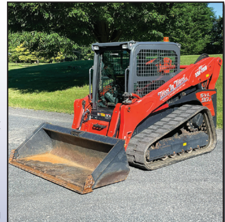
'14 KUBOTA SVL90-2

Skid Steer Attachments: 60" Forks • Pintle Hitch