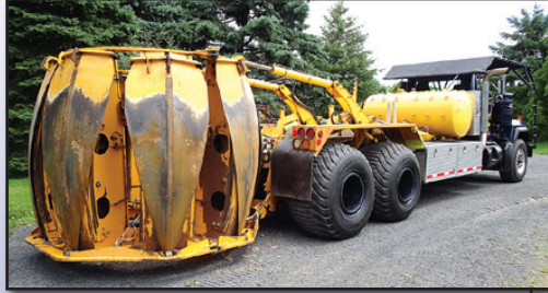
STOCKER 85" ON '00 MACK RD688S