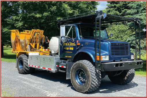
STOCKER 60" ON '95 INT'L 4800

PRE-SORTED FIRST CLASS MAIL US POSTAGE PAID UPPER DARBY, PA PERMIT #45