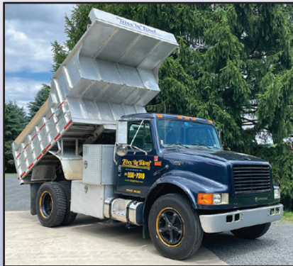
'96 INTERNATIONAL 4700

1996 INTERNATIONAL Model 4700 Single Axle Dump Truck , powered by Int'l T444E diesel engine and Spicer 5 speed transmission, equipped with 9' aluminum dump body plus 2'3" over utility boxes, with coal chute and manual tarp, manual upper body mulch divider, behind cab utility box, tow package, spring suspension, hydraulic brakes, 25,500# GVWR, air conditioning, and 10R22.5 tires. In good condition with good tires. (167,271 Miles)