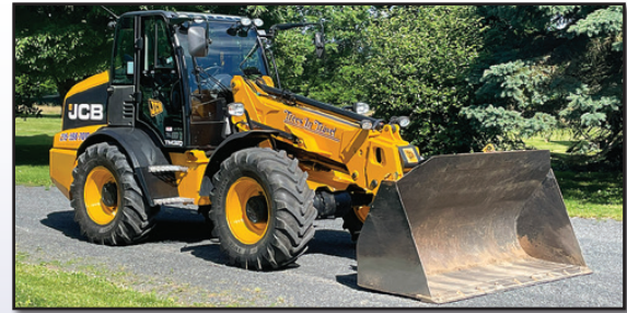
'13 JCB TM320

2014 AVANT Model M635UIPCG Articulated Rubber Tired Loader , s/n 713501349, powered by Kubota diesel engine and hydrostatic transmission, equipped with telescopic boom, 65" general purpose loader bucket, manual coupler, front auxiliary hydraulics, rear auxiliary hydraulics, removable suitcase weights, ROPS canopy, heated seat, and 26x12.00-12 turf tires. In very good condition with very good tires. (00,938 Hours) (Purchased New)