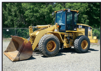
'98 CAT 938G

1998 CATERPILLAR 938G , s/n 6WS00541, Cat 3126 DITA diesel engine and powershift transmission, Cat general purpose loader bucket with bolt-on cutting edge, Cat/Balderson hydraulic coupler, auxiliary hydraulics, EROPS with heat and ac, and 20.5R25 tires. In very good condition with very good tires. (Meter Reads 2,870 Hours)