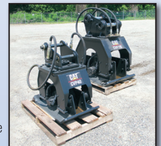
UNUSED CAT PLATE COMPACTORS

Excavator Attachments: CATERPILLAR H140S Hydraulic Hammer (Cat 330BL) • CATERPILLAR H130S Hydraulic Hammer (Cat 320CL) • TRAMAC 400S Hydraulic Hammer • KUBOTA KXB500N Hydraulic Hammer (Kubota Mini) • UNUSED CATERPILLAR CVP110 Hydraulic Plate Compactor (Cat 320CL) • JRB 5-Tine Grapple (Cat 330) • LEMAC Concrete Pulverizer (Cat 330) • MCMILLEN Hydraulic Auger, with 30", 12", and 8" augers (Kubota KX101) • GEITH 36" QC Digging Bucket (Cat 330) • CATERPILLAR 30" QC Digging Bucket (Cat 330) • UNUSED CATERPILLAR 24" QC Digging Bucket (Cat 320)