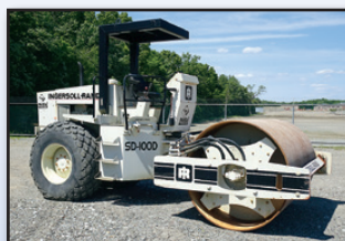
'86 IR SD-100D

BALDERSON 8' QC Dozer Blade , with Balderson mounting attachment (Cat 120)