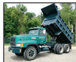
'99 MACK CL713 (47,093 MILES)

1999 MACK CL713 Tandem Axle Dump, Mack E7-460, 460HP diesel engine and Maxitorque T2180, 18 speed transmission, 58,000 lb rears, 20,000 lb front axle, Bristol Donald 15' heated steel dump body with (4) 10 ton hoist cylinders and subframe, power tarp, air gate, 2-stage engine brake, power divider, camelback suspension, air ride cab and seat, cruise control, ac, and 12.00R24 tires. In very good condition with good tires. (Odometer Reads 047,093 Miles) (Meter Reads 03,982 Hours)