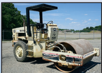
'95 IR SD-70D

1986 INGERSOLL RAND SD-100D , s/n 5084S, Cummins 4BTA-3.9 diesel engine and hydrostatic transmission, 84" smooth drum, variable speed vibration, ROPS canopy, and 23.1-26 tires. In good to very good condition with good to very good tires. (Meter Reads 01,524 Hours)