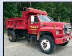
'89 FORD F-800

1989 FORD F-800 Single Axle Dump, Ford 210HP diesel engine and 5 speed transmission with 2 speed rear, 10' steel dump body with single chute and power tarp, air brakes, tow package with air, spring suspension, and 11R22.5 tires. In good condition with good tires. (Odometer Reads 173,697 Miles)