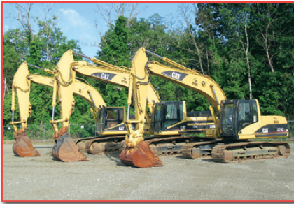
CAT 320CL, 330BL, AND 330L

PRE-SORTED FIRST CLASS MAIL US POSTAGE PAID UPPER DARBY, PA PERMIT #45