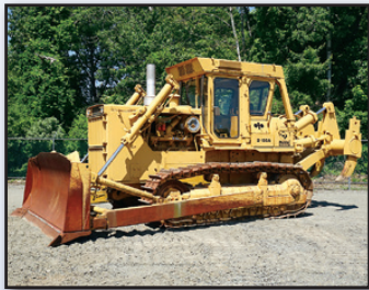
'86 KOMATSU D155A (1,543 HOURS)

1992 KOMATSU D68E-1 , s/n 01246, Cummins diesel engine and powershift transmission, straight blade with tilt drawbar, ROPS canopy, and 24" SBG pads. In good condition with good undercarriage. (Meter Reads 4,938 Hours)