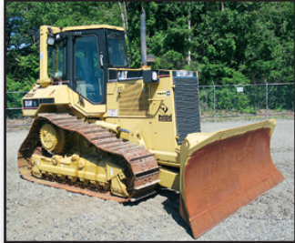
'97 CAT D5M XL (167 HOURS)

2005 CATERPILLAR D3G XL , s/n JMH01371, Cat 3046 diesel engine and hydrostatic transmission, 6-way straight blade, EROPS with ac, and 16" SBG pads. In excellent condition with excellent undercarriage. (Meter Reads 0,025 Hours)