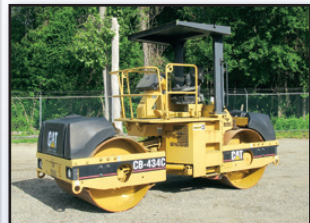
'97 CAT CB-434C (108 HOURS)

1994 INGERSOLL RAND DD-90 Tandem Vibratory Roller , s/n 6343, Cummins diesel engine and hydrostatic transmission, 66" smooth drums, dual frequency vibration, vibratory drum selector, and front and rear drum spray. In good condition. (Meter Reads 00,162 Hours)