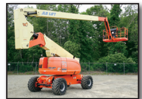
'06 JLG 800AJ, 80' (483 HOURS)

2006 JLG 800AJ, 80', 4x4 Aerial Lift , s/n 0300098473, Cat diesel engine, articulated boom, 36"x8", 500 lb capacity man/material basket, Sky Power package to include: Miller CST280, 280 amp stick welder, Miller Spectrum 375 DC plasma cutter, Sky Air with on-board air compressor, and 445/55D19.5 foam filled tires. In very good condition with very good tires. (Meter Reads 0,483 Hours)