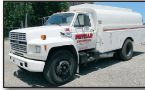
'88 FORD F-800 FUEL TRUCK, WITH APPROX 1,400 GALLON ON-ROAD DIESEL

1988 FORD F-800 Single Axle Fuel Truck , Ford model 185F, 7.8L, 185HP diesel engine and 5 speed transmission with 2 speed rear, Oilmans 1,800 gallon steel 2-compartment fuel tank (1,000/800 gallon) (2) hose reels and meters, air hose reel, air brakes, 30,000 lb GVWR, and 11R22.5 tires. In good to very good condition with good to very good tires. (Odometer Reads 049,316 Miles) (Full 1,000 Gallon Compartment and Partial 800 Gallon Compartment - On-Road Diesel Fuel Purchased March 2022)