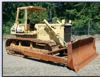
'92 KOMATSU D68E-1

1992 KOMATSU D68E-1 , s/n 01246, Cummins diesel engine and powershift transmission, straight blade with tilt drawbar, ROPS canopy, and 24" SBG pads. In good condition with good undercarriage. (Meter Reads 4,938 Hours)