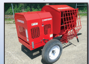
UNUSED WHITEMAN MORTAR MIXER

1995 MORBARK 17 Portable Drum Chipper , s/n 4S8SZ1511SW002408, John Deere 6068T diesel engine and Twin Disc PTO, auto feed system, rotating discharge chute, and 12-16.5 tires. In good to very good condition with good to very good tires. (Meter Reads 00,550 Hours)