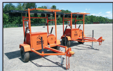
(2) '95 DIETZ D2000 ARROW BOARDS

1996 INGERSOLL RAND L6-4MH Portable Light Plant, s/n 259595UIG823, Kubota D905-E diesel engine, (4) removable/stowable lights, manual raise and lower, and 185/80R13 tires. In very good condition with good tires. (Meter Reads 01,203 Hours)