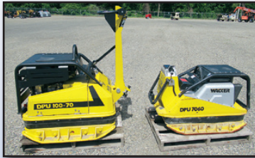
WACKER REVERSIBLE PLATE COMPACTORS