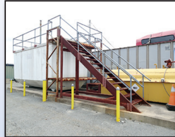
ARMOR CAST 6,000 GALLON TANK AND 6,000 GALLON ON-ROAD DIESEL

1,000 Gallon Fuel Tank, with containment and electric pump • (2) UNUSED 500 Gallon Fuel Tanks, with containment and 120 volt pumps