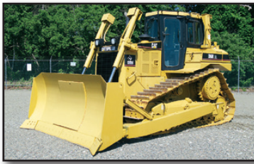
'05 CAT D6R XL SERIES II (54 HOURS)

2005 CATERPILLAR D6R XL Series II , s/n AAX01161, Cat C-9 diesel engine and powershift transmission, semi-U blade with tilt, differential steering, rear counterweight, EROPS with ac, and 24" SBG pads. In excellent condition with excellent undercarriage. (Meter Reads 0,054 Hours)