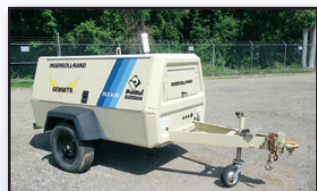
'94 IR 50KW

1987 INGERSOLL RAND P-185A-A-JD, 185CFM, s/n 163642U87957, John Deere 4239DF diesel engine, 215/75R15 tires. In good condition with good tires. (Meter Reads 03,219 Hours)