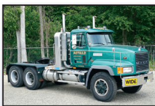
'98 MACK CL713 (38,149 MILES)

1998 MACK CL713 Tandem Axle Truck Tractor , Mack E7-454 diesel engine and Maxitorque T2180, 18 speed transmission, 58,000 lb rears, 20,000 lb front axle, wetline system, double frame, stationary 5th wheel, Merritt aluminum headache rack with rigging boxes, camelback suspension, 2-stage engine brake, twin aluminum fuel tanks, air ride cab, cruise control, ac, and 12.00R24 tires. In very good condition with very good tires. (Odometer Reads 038,149 Miles) (Meter Reads 02,011 Hours)