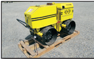
UNUSED WACKER RT820CC

WACKER W75 Double Drum Walk Behind Roller , s/n 291900316, 1 cylinder diesel engine and hydrostatic transmission, 29.5" smooth drums, water system, and manual crank start. In good condition.