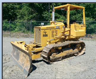
'80 KOMATSU D31-16

1980 KOMATSU D31-16 , s/n 28171, diesel engine and powershift transmission, 6-way straight blade, 3rd valve, tow hitch, ROPS canopy, and 16" SBG pads. In good to very good condition with very good undercarriage. (Meter Reads 3,128 Hours)