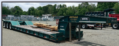
'97 ROGERS 50 TON

1997 ROGERS SPCR50PL98/54/24/102/3XSP, 50-Ton Tri-Axle Lowboy, non-ground bearing hydraulic detachable gooseneck, 24'x102" load deck, 10'6" deck over wheels, spring/beam suspension, outriggers, chain dogs, and 255/70R22.5 tires. In good condition with very good tires. (Some Decking To Be Replaced)