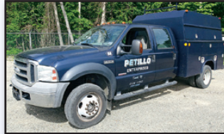
'06 FORD F-550XLT, 4X4

2006 FORD F-550XLT SD 4x4 Crew Cab Utility Truck , Power Stroke 6.0L diesel engine and automatic transmission, Reading 9' enclosed walk-in utility body, 100 gallon fuel tank with 12 volt pump, dual rear wheels, tow package, running boards, power windows and locks, cruise control, ac, and 225/70R19.5 tires. In good condition with good tires. (Odometer Reads 061,090 Miles)