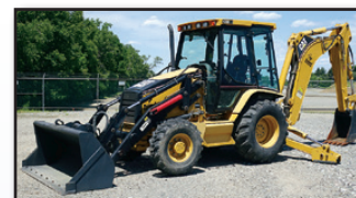
'05 CAT 430D IT 4X4 (70 HOURS)

2005 CATERPILLAR 430D IT, 4x4 , s/n BML05169, Cat 3054 diesel engine and shuttle transmission, general purpose loader bucket with bolt-on cutting edge, hydraulic coupler, front auxiliary hydraulics, 24" digging bucket, rear auxiliary hydraulics, backhoe pilot controls with pattern changer, Lincoln auto lube system, EROPS with ac, 340/80R18 front and 19.5L-24 rear tires. In excellent condition with excellent tires. (Meter Reads 0,070 Hours)