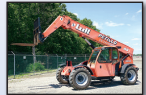
'06 LULL 944E-42, 9,000 LB

2006 LULL 944E-42, 9,000 lb Telescopic Rough Terrain Forklift , s/n 0160016861, Cummins QSB4.5 diesel engine and powershift transmission, 42' lift height, 3-section telescopic boom, 48" forks, fork rotation, manual coupler, enclosed cab with heat and ac, and 15.5-25 foam filled tires. In good to very good condition with good tires. (Meter Reads 01,792 Hours) (Reserved For Use During Loadout)