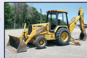
'95 JD 410D 4X4 E-HOE

1995 JOHN DEERE 410D, 4x4 Extend-A-Hoe , s/n 809076, JD diesel engine and shuttle transmission, general purpose loader bucket, 24" digging bucket, 2-stick backhoe controls, EROPS, 14-17.5 front and 18.4-28 rear tires. In good condition with very good rear and fair front tires. (Meter Reads 6,496 Hours)