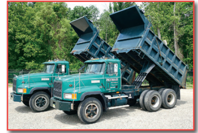
MACK CL713 DUMPS (LOW MILEAGE)

PRE-SORTED FIRST CLASS MAIL US POSTAGE PAID UPPER DARBY, PA PERMIT #45