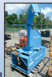
GOOSEN BALE CHOPPER

Skid Steer Attachments: UNUSED BRADCO 100981 Stump Grinder • ALITEC CP16A, 16" Cold Planer • QUICK ATTACH 6' Hydraulic Brush Cutter • ALITEC RW18, 48" Rock Saw, with hydraulic positioner and 18" dig depth • UNUSED QUICK ATTACH 84" Root Rake, with grapple • UNUSED QUICK ATTACH 84" Skeletal Bucket, with grapple 3-Point Attachments: GOOSEN Bale Chopper, with rotating chute • 8' York Rake, with 6' scarifier and 8' back grade blade, transport wheels