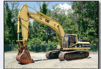
'95 CAT 330L

1995 CATERPILLAR 330L , s/n 5TM01490, Cat 3306B diesel engine, 10'8" dipper stick with JRB hydraulic coupler, Geith 54" digging bucket, stiff arm bracket, EROPS with front demolition screen, and 33.5" TBG pads. In good condition with good undercarriage. (Meter Reads 5,473 Hours)