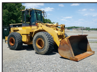
'96 CAT 950F SERIES II

1996 CATERPILLAR 950F Series II , s/n 5SK02317, Cat 3116 diesel engine and powershift transmission, Balderson general purpose loader bucket with bolt-on cutting edge, Balderson hydraulic coupler, front auxiliary hydraulics, EROPS with ac, and 23.5R25 tires. In good condition with good tires. (Meter Reads 5,160 Hours) (Reserved For Use During Loadout with 60" Forks)