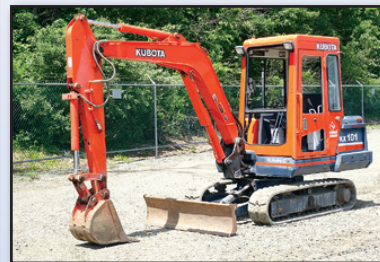
'96 KUBOTA KX101 (570 HOURS)

1996 KUBOTA KX101 Mini , s/n 12170, Kubota diesel engine, 5'3" dipper stick, swing boom, 18" digging bucket, auxiliary hydraulics, 60" backfill blade, pattern changer, EROPS, and rubber tracks. In good condition with good tracks. (Meter Reads 0,570 Hours) (No Glass in Cab)