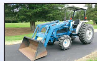
'95 FORD-NEW HOLLAND 2120 4X4 (530 HOURS)

1995 FORD/NEW HOLLAND 2120, 4x4 , s/n UV28045, 42HP diesel engine and hydraulic shuttle shift transmission with 12 forward and 4 reverse gears, New Holland 7309 loader attachment, general purpose bucket, 3-point hitch, rear PTO, rear auxiliary hydraulics, drawbar, ROPS canopy, 9.5-16 front and 14.9-26 rear tires. In good to very good condition with good to very good tires. (Meter Reads 0,530 Hours)