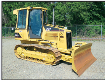
'05 CAT D3G XL (25 HOURS)

2005 CATERPILLAR D3G XL , s/n JMH01371, Cat 3046 diesel engine and hydrostatic transmission, 6-way straight blade, EROPS with ac, and 16" SBG pads. In excellent condition with excellent undercarriage. (Meter Reads 0,025 Hours)