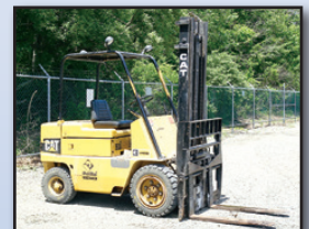
CAT V60B, 6,000 LB

Lull Attachments: UNUSED GAR-BRO 1/2 Cubic Yard Concrete Bucket , with hydraulic gate • UNUSED 10' Boom , with hydraulic winch, 2,000 lb capacity • 48" Block Fork Attachment , with hydraulic tilt • UNUSED 48" Fork Attachment , with hydraulic fork positioner • UNUSED 96" General Purpose Bucket CATERPILLAR V60B, 6,000 lb Pneumatic Tired Forklift , s/n 52J438, diesel engine and hydrostatic transmission, 156" 2-stage mast (103" retracted height), side shift, 42" forks, and FOPS canopy. In good condition in good tires. (Meter Reads 01,254 Hours) (Reserved For Use During Loadout)