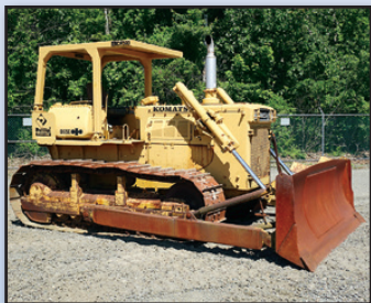
'79 KOMATSU D65E-6

1980 KOMATSU D31-16 , s/n 28171, diesel engine and powershift transmission, 6-way straight blade, 3rd valve, tow hitch, ROPS canopy, and 16" SBG pads. In good to very good condition with very good undercarriage. (Meter Reads 3,128 Hours)