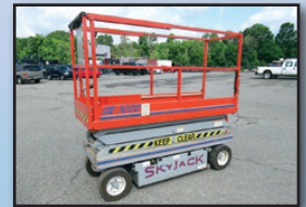
'95 SKYJACK SJ-3220

WESCO JibRig Extendable Forklift Boom • Man Basket, with fork pockets