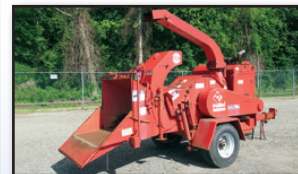
'95 MORBARK 17 (550 HOURS)

UNUSED MQ WHITEMAN WM-90SH8 Portable Mortar Mixer , s/n AD757382, Honda 8HP gas engine, B78-13 tires. In excellent condition.