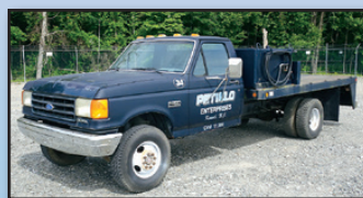
'88 FORD F-350, 4X4

1996 FORD F-350XLT, 4x4 Utility Truck , Powerstroke 7.3L diesel engine and automatic transmission, Reading 11' open utility body, 100 gallon fuel tank with 12 volt pump, Western 8'6" snow plow package, tow package, dual rear wheels, dual fuel tanks, power windows and locks, cruise control, ac, and LT235/85R16 tires. In good condition with good tires. (Odometer Reads 103,244 Miles)