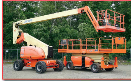
JLG 800AJ AND 4394RT (LOW HOUR)

1440 COWPATH RD. • HATFIELD, PA 19440 215/361-9099 • Fax: 215/361-9212 www.hunyady.com