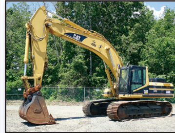
'99 CAT 330BL

1995 CATERPILLAR 330L , s/n 5TM01490, Cat 3306B diesel engine, 10'8" dipper stick with JRB hydraulic coupler, Geith 54" digging bucket, stiff arm bracket, EROPS with front demolition screen, and 33.5" TBG pads. In good condition with good undercarriage. (Meter Reads 5,473 Hours)