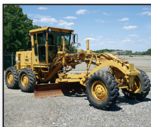
'87 CAT 120G

1987 CATERPILLAR 120G , s/n 87V08201, Cat 3304 diesel engine and powershift transmission, 12' offsetable fully hydraulic moldboard, Spectra Physics laser plane control ready (no instruments), front scarifier (no shanks), EROPS, and 13.00-24 tires. In good condition with good tires. (Meter Reads 00,424 Hours)