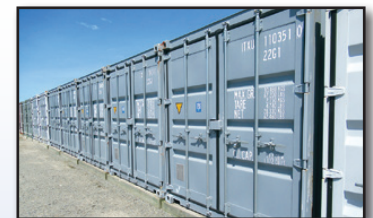
(27) 8'X20' SEA CONTAINERS

(27) 8'x20' Sea Containers: (5) 2018; (4) 2014; (2) 2013; (2) 2006; (2) 2005; (2) 2004; (4) 2003; (1) 1993; (1) 1992; (3) 1991; and (1) 1987 (Conditions Range From Excellent to Good) • (1) 40'x8'x9.5'H Aluminum Storage Container