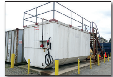
ARMOR CAST 6,000 GALLON TANK AND 6,000 GALLON ON-ROAD DIESEL

1997 ARMOR CAST 6,000 Gallon Concrete Encased Steel Above Ground Fuel Tank , with steel access stairway, full (6,000 gallon) on-road diesel fuel (sold separately). Tank dimensions 18'6" L x 9'10" W x 9'11" H, approximate empty weight = 33.9 ton. Armor Cast engineer drawings available – contact auction company. Buyer responsible for tank removal.