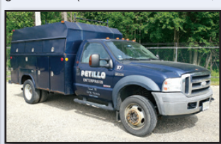
'06 FORD F-550XLT, 4X4

2006 FORD F-550XLT SD, 4x4 Utility Truck , Powerstroke 6.0L diesel engine and automatic transmission, Reading 11' enclosed walk-in utility body, 100 gallon fuel tank with 12 volt pump, dual rear wheels, tow package, running boards, power windows and locks, cruise control, ac, and 255/70R19 tires. In good condition with very good tires. (Odometer Reads 193,301 Miles)