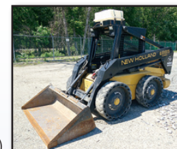
'96 NEW HOLLAND LX885 (813 HOURS)

1996 NEW HOLLAND LX885 , s/n 898604, New Holland diesel engine and hydrostatic transmission, 72" general purpose loader bucket, Super Boom, manual coupler, high flow auxiliary hydraulics, water system with roof mounted poly tank, and Air Boss wheels with bolt-on rubber segments. In good to very good condition with good to very good tires. (Meter Reads 0,813 Hours)