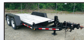
'95 TOWMASTER TILT DECK

1995 TOWMASTER Tandem Axle Tilt Deck Tag-A-Long, 73"x14' deck, chain dogs, and 9.50-16.5 tires. In very good condition with good tires.