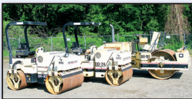
(3) IR VIBRATORY ROLLERS

1995 WACKER RD880V Vibratory Roller , s/n 673602591, B&S Vanguard 16HP V-twin gas engine and hydrostatic transmission, 35.5" smooth drums and front and rear drum spray. In very good condition. (Meter Reads 0,238 Hours)