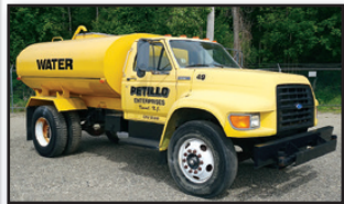
'97 FORD F-800 (3,080 MILES)

1997 FORD F-800 Single Axle Water Truck , Cummins B5.9-175, 175HP diesel engine and 6 speed transmission, 2,000 gallon steel water body with rear, side, and front cable controlled spray heads, rear hose reel, electric/hydraulic brakes, 30,000 lb GVWR, and 11R22.5 tires. In good condition with very good tires. (Odometer Reads 003,080 Miles) (Meter Reads 1,050 Hours)