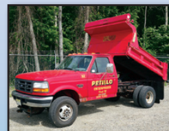
'97 FORD F-350XL, 4X4

1997 FORD F-350XL, 4x4 Single Axle Dump, Powerstroke 7.3L diesel engine and automatic transmission, Heil 8' steel landscape dump body with tarp, Western 8'6" plow package, Hi-Way Super P-8 stainless steel V-box salt spreader with gas engine and cab controls, dual rear wheels, dual fuel tanks, and 235/85R16 tires. In good condition with very good front and good rear tires. (Odometer Reads 70,119 Miles) (Fender and Bed Rust)