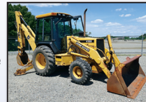
'95 JD 410D 4X4 E-HOE

1995 JOHN DEERE 410D, 4x4 Extend-A-Hoe , s/n 814228, JD diesel engine and shuttle transmission, general purpose loader bucket with bolt-on cutting edge, 24" digging bucket, 2-stick backhoe controls, EROPS, 14-17.5 front and 18.4-28 rear tires. In good condition with good tires. (Meter Reads 5,803 Hours)