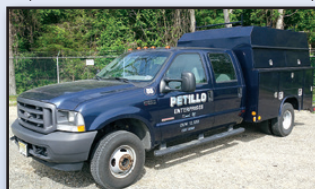
'04 FORD F-350XL, 4X4

2004 FORD F-350XL SD, 4x4 Crew Cab Utility Truck , Powerstroke 6.0L diesel engine and automatic transmission, Reading 9' enclosed walk-in utility body, 100 gallon fuel tank with 12 volt pump, tow package, dual rear wheels, running boards, and 235/85R16 tires. In good to very good condition with very good tires. (Odometer Reads 019,915 Miles)