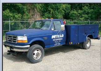
'96 FORD F-350XLT, 4X4

1996 FORD F-350XLT, 4x4 Utility Truck , Powerstroke 7.3L diesel engine and automatic transmission, Reading 11' open utility body, 100 gallon fuel tank with 12 volt pump, Western 8'6" snow plow package, tow package, dual rear wheels, dual fuel tanks, power windows and locks, cruise control, ac, and LT235/85R16 tires. In good condition with good tires. (Odometer Reads 103,244 Miles)