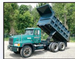
'99 MACK CL713 (57,994 MILES)

1999 MACK CL713 Tandem Axle Dump, Mack E7-460, 460HP diesel engine and Maxitorque T2180, 18 speed transmission, 58,000 lb rears, 20,000 lb front axle, Bristol Donald 15' heated steel dump body with (4) 10 ton hoist cylinders and subframe, power tarp, air gate, 2-stage engine brake, power divider, camelback suspension, air ride cab and seat, cruise control, ac, and 12.00R24 tires. In very good condition with good tires. (Odometer Reads 057,994 Miles) (Meter Reads 04,390 Hours)