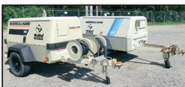
'98 AND '87 IR 185CFM

1998 INGERSOLL RAND P185WJD, 185CFM, s/n 294953UJ1221, John Deere diesel engine, dual hose reels, water separator, folding tongue, and 215/75R15 tires. In very good condition with good tires. (Meter Reads 00,282 Hours)