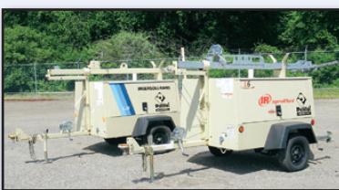
'07 AND '96 IR L6-4MH LIGHT PLANTS

1994 INGERSOLL RAND E50XWCU, 50KW Generator, s/n 233534UED811, Cummins 4BT3.9-G1 diesel engine, single/3-phase, 120/240 volt plugs, sound suppression, and 215/75R15 tires. In very good condition with good tires. (Meter Reads 2,520 Hours)