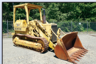
'69 CAT 955K

1969 CATERPILLAR 955K Crawler , s/n 85J2554, Cat diesel engine and powershift transmission, general purpose loader bucket with teeth and cutting segments, pedal steer, ROPS canopy, and 15" TBG pads. In good condition with good undercarriage. (Meter Reads 5,775 Hours)