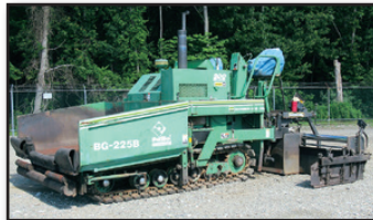
'94 BARBER GREENE BG-225B (1,598 HOURS)

1994 BARBER GREENE BG-225B Crawler Asphalt Paver , s/n 6YK00494, Cat 3054T diesel engine and hydrostatic transmission, Extend-A-Mat 8-16B, 8'-16" heated, vibratory screed, sonic controls for auto feeder, slope and grade controls, dual operator stations, and 14" rubber bolt-on pads. In good condition with good pads. (Meter Reads 01,598 Hours)