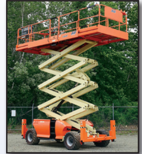
'07 JLG 4394RT, 43' (7 HOURS)

2007 JLG 4394RT, 43', 4x4 Rough Terrain Scissor Lift , s/n 0200161561, Deutz diesel engine, 84"x13" platform with (2) 4' hydraulic extensions to 21', 1,250 lb capacity, (4) hydraulic stabilizers, and 33x15.50-16.5 foam filled tires. In excellent condition with very good tires. (Meter Reads 0,007 Hours)