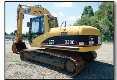
'04 CAT 320CL (712 HOURS)

2004 CATERPILLAR 320CL , s/n PAB01552, Cat 3066 diesel engine, 9'6" dipper stick with Cat hydraulic coupler, auxiliary hydraulics, Cat 48" digging bucket, pattern changer, EROPS with front demolition screen and ac, and 31.5 TBG pads. In very good condition with very good undercarriage. (Meter Reads 0,712 Hours)