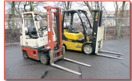
NISSAN AND YALE FORKLIFTS