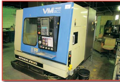
(1) OF (2) HITACHI SEIKI VM40H

1440 COWPATH RD. • HATFIELD, PA 19440 215/361-9099 • Fax: 215/361-9212 www.hunyady.com