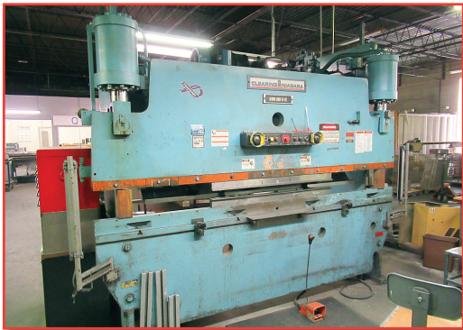
(1) OF (4) PRESS BRAKES

PRE-SORTED FIRST CLASS MAIL US POSTAGE PAID UPPER DARBY, PA PERMIT #45