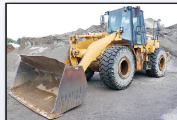
98 CAT 950G

1998 CATERPILLAR 950G , s/n 3JW00748, Cat 3126 diesel and ps trans, general purpose loader bucket with bolt-on cutting edge, high reach configuration, EROPS with heat, and 23.5R25 tires. In good condition with good to very good tires.