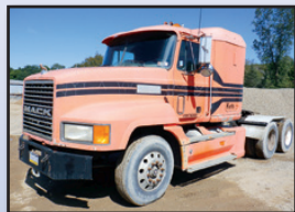
'96 MACK CH613

1996 MACK CH613 Tandem Axle, Mack E7-350 diesel and Maxitorque T2090, 9 speed trans, 42" step-in sleeper, wetline, PTO driven bulk blower, air ride suspension, 2-stage engine brake, air slide 5th wheel, 198" wheelbase, aluminum front wheels, cruise control, a/c, and 11R22.5 tires. In fair to good condition with good tires.