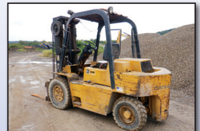
'84 CAT V80E 8,000#

1984 CATERPILLAR V80E, 8,000# Pneumatic Tired Forklift, s/n 37W3738, Perkins 4 cyl diesel and shuttle trans, 162" 3-stage mast, side shift, 46" forks, ROPS canopy, 8.25x13 front and 7.00x12 rear tires. In good condition with good tires.