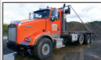
'06 KENWORTH T-800