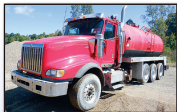
13 INT'L PAYSTAR

2013 INTERNATIONAL Paystar Tri-Axle Water Truck , International Maxx Force 475HP diesel and Fuller 13 speed trans, J&J vac body with Fruitland vac pump, 46,000# rears, 20,000# front and lift axles, 86,000# GVWR, block/beam suspension, 3-stage engine brake, aluminum wheels, power windows, locks, and mirrors, cruise control, a/c, 385/65R22.5 front and lift, and 11R22.5 rear tires. In good condition with good tires.