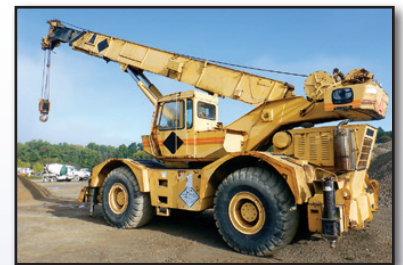
GROVE RT65S, 35 TON

GROVE RT65S, 35 Ton Rough Terrain Crane, s/n 42139, Cat 3208 diesel and ps trans, 33' to 81', 3-section hydraulic boom and power pin fly to 104', 32' swing away lattice jib, main and auxiliary hoists, anti-two block alarm, boom angle indicator, Johnson 4-sheave hook block, (4) hydraulic outriggers, and 26.5x25 tires. In fair condition with fair to good tires. (Left Front Outrigger Not Extending)