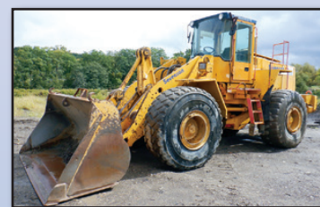
94 VOLVO L150

1994 VOLVO L150 , s/n 60340, Volvo 6 cyl diesel and ps trans, general purpose loader bucket with weld-on cutting edge, high lift configuration, EROPS with heat and a/c, and 26.5R25 tires. In good condition with fair tires.