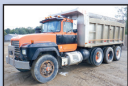
'98 MACK RD688S

1998 MACK RD688S Quad Axle , Mack E7-400 diesel and Fuller 8LL, 10 speed trans, 18' aluminum dump body, 44,000# rears, 12,860# front and (2) 12,000# steerable lift axles, spring/beam suspension, Jacobs 2-stage engine brake, aluminum front wheels, heated mirrors, cruise control, a/c, 11R24.5 front and rear tires, and 255/70R22.5 lift tires. In good condition with good tires.