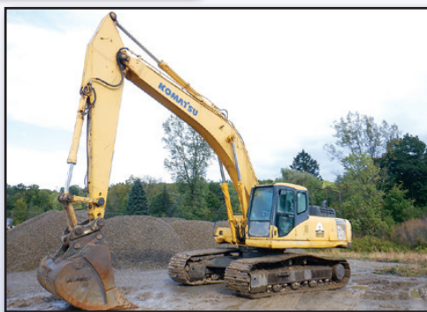
'03 KOMATSU PC300LC-7L

2003 KOMATSU PC300LC-7L, s/n A85676, Komatsu 6 cyl diesel and hydraulic drive, 13'9" dipper stick, Escó 56" digging bucket, JRB hydraulic coupler, EROPS with heat and a/c, and 31.5" TBG pads. In good condition with fair undercarriage.