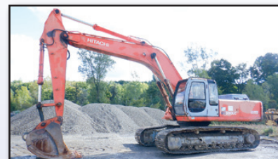
'98 HITACHI EX330LC-5