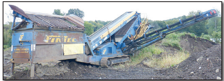
04 FINTEC 540

2004 FINTEC 540 Crawler Screening Plant, s/n 2004540215, Deutz 4 cyl diesel and hydraulic drive, 6'x12' dump hopper with hydraulic dumping grizzly, hydraulic shredder, 48" screen feed conveyor, 5'x12' double deck vibrating incline screen, (2) 30" side discharge conveyor, 48" front discharge conveyor, and 20" TBG pads. In good condition with good undercarriage. (150+/- Hours On In House Engine Rebuild)