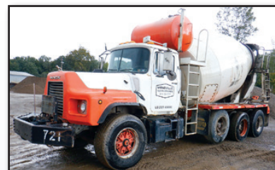
00 MACK DM690S

(2) 2000 MACK DM690S Tri-Axle Rear Discharge , Mack EM7, 300HP diesel and Maxitorque T2080, 8 speed extended range trans, Smith 10.5 cubic yard hydraulic mixer, s/n 906132P with 300 gallon pressurized water tank, camelback suspension, 2-stage engine brake, ATC, heated mirrors, cruise control, a/c, 425/65R22.5 front, 11R22.5 rear, and 385/65R22.5 lift tires. In good condition with good tires.