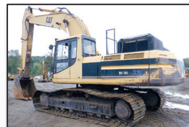
'93 CAT 330L

1992 CATERPILLAR EL200B, s/n 7DF02064, Cat 3116T diesel and hydraulic drive, 8' dipper stick, 52" digging bucket, auxiliary hydraulics, attachment bracket, EROPS with heat, and 31.5" TBG pads. In fair condition with fair to poor undercarriage. LARGE Quantity of Demolition Hammers; Plate Compactors; Digging and Cleanup Buckets; Grapples; Plus More! (Please See Online Photo Library for Complete Descriptions)