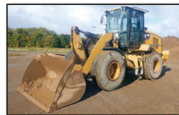
13 CAT 930K

2013 CATERPILLAR 930K , s/n RHN01971, Cat 6 cyl diesel and ps trans, general purpose loader bucket with bolt-on cutting edge, EROPS with heat, and 525/80R25 tires. In good condition with good tires.