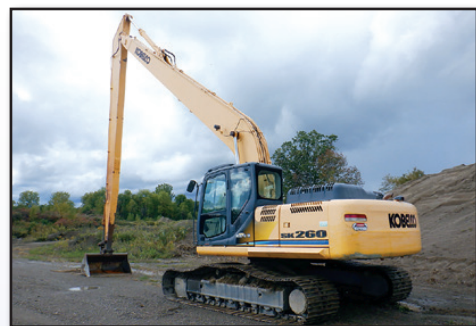
'11 KOBELCO SK260-9

2011 KOBELCO SK260-9, Mark 9 Long Reach, s/n LL14U1710, 6 cyl diesel and hydraulic drive, 30' dipper stick, 30' boom, SEC 64" perforated cleanup bucket, Intelligent Total Control System, DEF system, EROPS with heat and a/c, and 32" TBG pads. In good condition with good undercarriage.