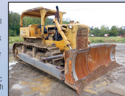
66 CAT D8H

1985 CATERPILLAR D4E , s/n 51X01273, Cat 3304 diesel and ps trans, Balderson 6-way straight blade, Hyster rear hydraulic winch, ROPS canopy, and 18" SBG pads. In good condition with fair to poor undercarriage (pads good).