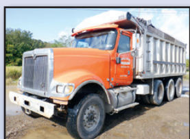
'00 INT'L 9900i