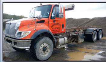
'03 INT'L 7500

2006 KENWORTH T-800 Tri-Axle Roll-Off Truck , Cat C-13 Acert, 335HP diesel and Fuller 8LL, 10 speed trans, 24' roll-off body with power tarp, spring/beam suspension, 2-stage engine brake, aluminum front wheels, heated mirrors, cruise control, a/c, 425/65R22.5 front, 11R24.5 rear, and 315/80R22 lift tires. In good condition with good tires.