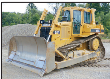
94 CAT D6HXL

1994 CATERPILLAR D6HXL , s/n 9KJ00781, Cat 3306 diesel and ps trans, semi-U blade with tilt, drawbar, ROPS over enclosed cab, and 24" SBG pads. In good condition with good undercarriage. (100+/- Hours on Rebuilt Engine by IB Diesel)