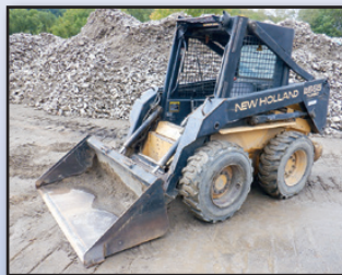
'95 NEW HOLLAND LX665

1995 NEW HOLLAND LX665 Skid Steer Loader, s/n 864561, 4 cyl diesel and hydrostatic trans, Super Boom, general purpose loader bucket, auxiliary hydraulics, manual coupler, rear side counter weights, and 10x16.5 tires. In good condition with excellent tires.