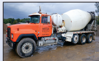
99 MACK RD688S

1999 VOLVO WG64 Tri-Axle Rear Discharge , Cummins ISM, 370HP diesel and Fuller 8LL, 10 speed trans, Smith 11 cubic yard hydraulic mixer with 300 gallon pressurized water tank, spring/beam suspension, 2-stage engine brake, cruise control, a/c, 425/65R22.5 front and lift tires, and 11R24.5 rear tires. In good condition with good tires.