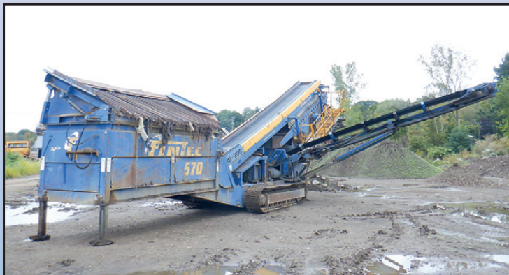
07 FINTEC 570

2007 FINTEC 570 Crawler Screening Plant, s/n 2007570450, Cat 4 cyl diesel and hydraulic drive, 48" screen feed conveyor, 5'x18' double deck vibrating incline screen, 32" side rejects conveyor, 30" side discharge conveyor, 48" front discharge conveyor, 6'x14' dump hopper with hydraulic dumping grizzly, and 20" TBG pads. In good condition with good undercarriage.