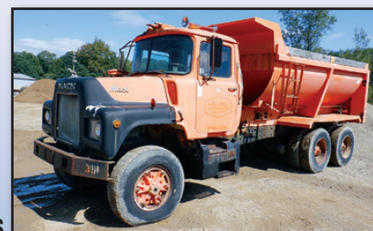
84 MACK DM690S

1984 MACK DM690S Tandem Axle Salt Truck , Mack 6 cyl diesel and 13 speed trans, 14' tub style body with hydraulic discharge conveyor, hydraulic spreader, camelback suspension, 13/80R20 front and 11R22.5 rear tires. In fair condition with fair to poor tires.