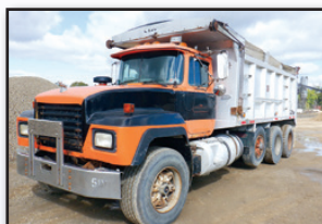
'97 MACK RD688S