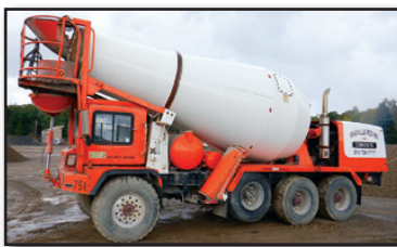
97 MACK 6X6

1997 MACK 6x6 Tri-Axle Front Discharge , Mack EM7-300 diesel and automatic trans, 11 cubic yard hydraulic front discharge mixer, s/n 136668FDM, with 200 gallon pressurized water tank, beam suspension, aluminum wheels, heated mirrors, 445/65R22.5 front and rear, and 425/65R22.5 lift tires. In good condition with good tires.