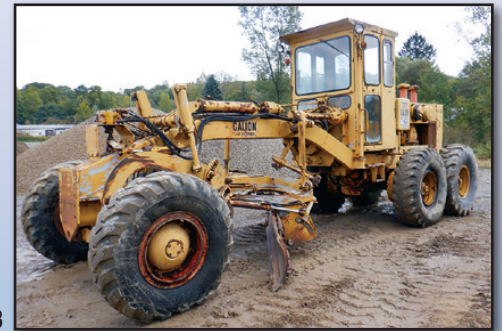
'71 GALION T600B

1971 GALION T600B Motor Grader, s/n GC-01984, Detroit 6 cyl diesel and ps trans, 12' moldboard, front scarifier, and 16.00x24 tires. In fair condition with fair tires.