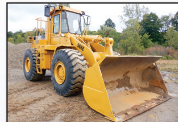
88 CAT 966E

1988 CATERPILLAR 966E , s/n 99Y05975, Cat 3306 diesel and ps trans, general purpose loader bucket with bolt-on cutting edge, ROPS over enclosed cab with heat, and 26.5x25 tires. In good condition with very good tires.