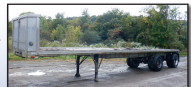
'79 RAVENS FLATBED

2005 CHEVROLET 2500HD LS Quad Cab Utility • 2000 CHEVROLET 3500HD Utility • 1999 FORD F-450XL Super Duty Utility PLUS: Flatbed, Tag-A-Long, and 50 Ton Scraper Trailer • Tar Spreader, Air Compressors, Generators, and Pumps • Parts Machines • Equipment Attachments and Miscellaneous • PLUS MUCH MORE!