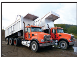
(2) '07 MACK CV713 GRANITE DUMPS

1998 MACK RD688S Tri-Axle , Mack E7-350 diesel and 10 speed trans, 16' aluminum dump body, camelback suspension, Jacobs 2-stage engine brake, a/c, 11R24.5 front and rear, and 285/75R24.5 lift tires. In fair to good condition with fair tires.