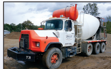
00 MACK DM690S

2005 MACK CV713 Granite Tri-Axle Rear Discharge , Mack 6 cyl diesel and Fuller 9LL, 11 speed trans, Challenge 10.5 cubic yard hydraulic mixer with 300 gallon pressurized water tank, 46,000# rears and 20,000# front axle, block/beam suspension, heated mirrors, cruise control, a/c, 425/65R22.5 front, 11R22.5 rear, and 275/80R24.5 lift tires. In good condition with good tires.