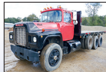
89 MACK RD690S

1987 FORD F-800 Single Axle Boom Truck , Detroit 8.2L diesel and 5 speed trans with 2 speed rear, National model 455, 8 ton, 22' to 55' 3-section hydraulic boom, s/n 18800, 18' wood flatbed with stake pockets, (4) hydraulic outriggers, 11R22.5 front and 10.00x20 rear tires. In fair condition with good tires.