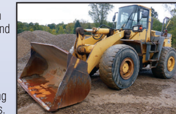
98 KOMATSU WA450-3

1998 KOMATSU WA450-3 , s/n 53130, Komatsu diesel and ps trans, general purpose loader bucket with bolt-on cutting edge, high lift configuration, EROPS with heat and a/c, and 26.5R25 tires. In good condition with fair to poor tires.