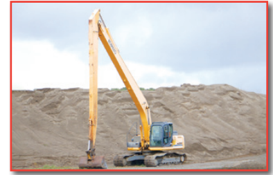
'11 KOBELCO SK260-9