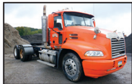
'03 MACK CX613 VISION

2003 MACK CX613 Vision Tandem Axle, Mack AC-400 diesel and Maxitorque T313L/L21/LR/LR2, 13 speed trans, double frame, PTO bulk blower, 2-stage engine brake, aluminum front wheels, 219" wheelbase, cruise control, and a/c. In good condition with good tires.