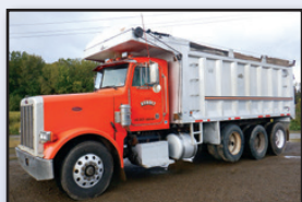
'00 PETERBILT 357