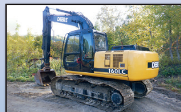
'00 JOHN DEERE 160LC