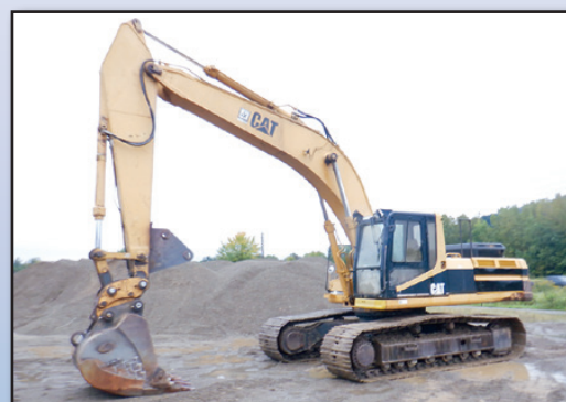
'95 CAT 330L

1995 CATERPILLAR 330L, s/n 5YM01746, Cat 3306B diesel and hydraulic drive, 13' dipper stick, Escó 60" digging bucket, Cat hydraulic coupler, shop made attachment bracket, EROPS with heat and a/c, and 33.5" TBG pads. In good condition with good undercarriage.