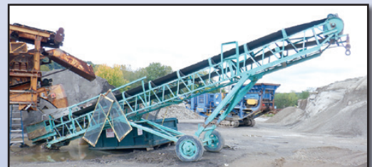
30" X 40' STACKING CONVEYOR

28"x60' Hydraulic Stacking Conveyor • 30" x 40' Stacking Conveyor • 24" x 60' Stacking Conveyor • (2) 24" x 100' x 34" Truss Radial Stacking Conveyors