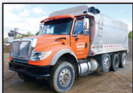
'06 INT'L 7600