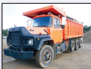
'94 MACK DM690S