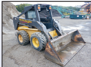
'02 NEW HOLLAND LS180

2002 NEW HOLLAND LS180 Skid Steer Loader, s/n 191358, CNH 332 diesel and hydrostatic trans, super boom, general purpose loader bucket with bolt-on cutting edge, hi-flow hydraulics, manual coupler, rear side counterweights, and 12x16.5 tires. In good condition with good tires.