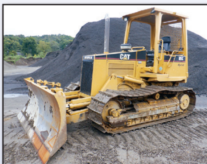
97 CAT D5C SERIES III

1966 CATERPILLAR D6C , s/n 76A4438, Cat 6 cyl diesel and ps trans, straight blade with tilt, Hyster rear hydraulic winch with drawbar, ROPS canopy with sweeps, and 24" SBG pads. In good condition with good undercarriage.