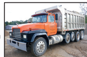
'98 MACK RD688S

AM GENERAL/CCC 8x6 Tri-Axle , VIN# N/A, 6 cyl diesel and automatic trans, 16' steel dump body, airlift 3rd axle, spring/beam suspension, 3-stage engine brake, and 11.00R24 tires. In fair to good condition with fair tires. (No Lift Tires: (2) Holes in Bed) 12' Aluminum Dump Body, with chute • BENSON 16' Aluminum Dump Body • BENSON 19' Aluminum Dump body, with electric tarp • 14' Steel Dump Body • 18' Aluminum Dump Body, with chute