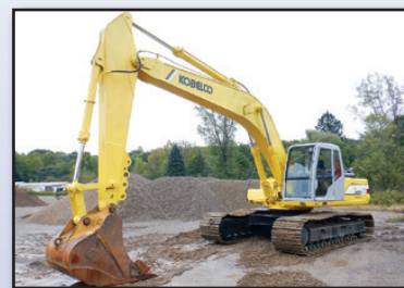
'99 KOBELCO SK220LC