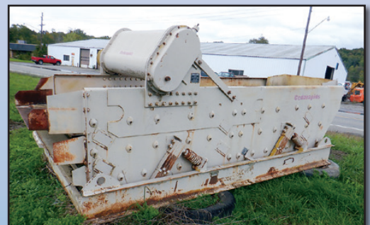
CEDARAPIDS 4' X 12' SCREEN

CEDARAPIDS 4'x12' 3-Deck Vibrating Screen, s/n S-22072 (No Motor or Decking) • 12' x 5' Material Hopper, for conveyor • Screens and Parts (Wash Plant) • Screens and Parts (Fintec 540 and 570) • Miscellaneous Parts (Cedarapids 543 Pit Commander Crusher)