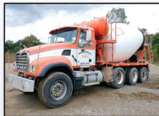
05 MACK CV713 GRANITE

2005 MACK CV713 Granite Tri-Axle Rear Discharge , Mack 6 cyl diesel and Fuller 9LL, 11 speed trans, Challenge 10.5 cubic yard hydraulic mixer with 300 gallon pressurized water tank, 46,000# rears and 20,000# front axle, block/beam suspension, heated mirrors, cruise control, a/c, 425/65R22.5 front, 11R22.5 rear, and 275/80R24.5 lift tires. In good condition with good tires.