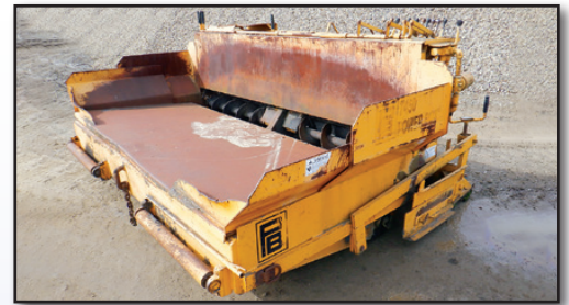
'80 PUCKETT BROTHERS T450

1980 PUCKETT BROTHERS T450 Power Box Asphalt Paver, s/n 80D1921, 16HP gas, 9' propane heated screed with 2' strike offs. In good condition. (New Engine)