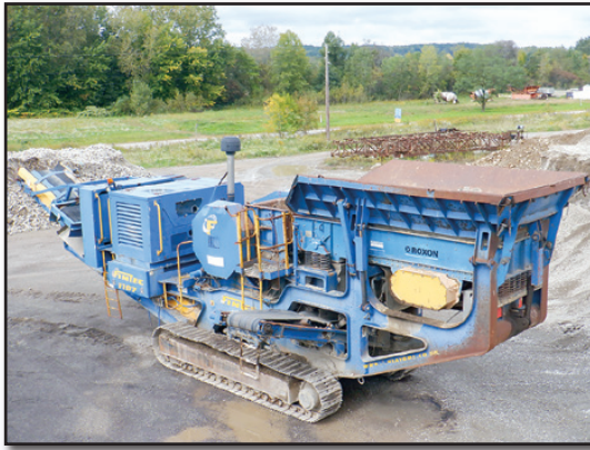
06 FINTEC 1107

2006 FINTEC 1107 Crawler Jaw Crusher, s/n 061107237, Cat C-9, 350HP diesel and hydraulic drive, Sandvik 6'x13' vibrating feeder with hydraulic folding wings, Sandvik type J11:1 jaw crusher, 42" enclosed discharge conveyor, Eriez 28"x6' hanging belt magnet, 26" side discharge conveyor, umbilical cord remote control, wireless remote travel, and 20" TBG pads. In good condition with good undercarriage.