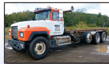
'99 MACK RD688S

Roll-Off Containers: (8) 40 Yard • (10) 30 Yard • (1) 25 Yard • (2) 23 Yard • (4) 20 Yard • (2) 12 Yard • (2) 11 Yard • (1) 10 Yard • (2) 22' Roll-Off Storage Containers, with swing doors • 24' Roll-Off Container, with steel sides and expanded metal ends