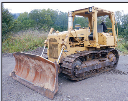
85 CAT D4E

1997 CATERPILLAR D5C Series III , s/n 7PS00428, Cat 3046 diesel and hydrostatic trans, 6-way straight blade, rock guards, tow pin, ROPS canopy, and 20" SBG pads. In good to very good condition with good to very good undercarriage.