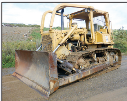
80 CAT D6D

1980 CATERPILLAR D6D , s/n 4X06031, Cat 3306 diesel and ps trans, straight blade with tilt, rear hydraulic winch with drawbar, ROPS canopy with sweeps, and 22" SBG pads. In good condition with fair to good undercarriage.