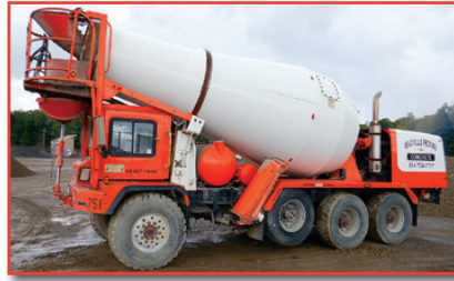
'97 MACK 6X6

1440 COWPATH RD. • HATFIELD, PA 19440 215/361-9099 • Fax: 215/361-9212 www.hunyady.com