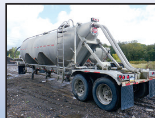
'06 VANTAGE 1,000CF

Cement Bulk Trailers: 2006 VANTAGE P-42-1000, 1,000 Cubic Foot Tandem Axle Aluminum • 1987 HEIL S3M7B, 1,040 Cubic Foot Tandem Axle Aluminum • 1986 HEIL S3M7B, 1,040 Cubic Foot Tandem Axle Aluminum • 1977 BUTLER 1,050 Cubic Foot Tandem Axle Steel