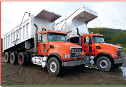
'07 MACK CV713 GRANITE DUMPS

PRE-SORTED FIRST CLASS MAIL US POSTAGE PAID UPPER DARBY, PA PERMIT #45