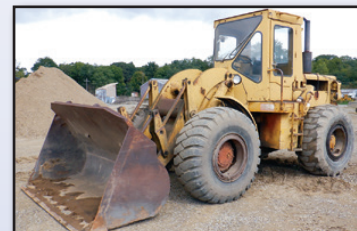
73 CAT 950

1973 CATERPILLAR 950 , s/n 81J6079, Cat 3304DT diesel and ps trans, general purpose loader bucket with bolt-on cutting edge, EROPS with heat, and 20.5x25 tires. In fair condition with fair tires.