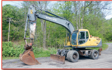
'02 VOLVO EW170

1440 COWPATH RD. • HATFIELD, PA 19440 215/361-9099 • Fax: 215/361-9212 www.hunyady.com