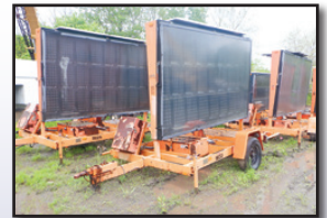
(8) PSI MESSAGE BOARDS

(8) 2007-2004 PSI Portable Solar Message Boards , model CPU-2M computer, model PCU8300 battery controller, (3) 8-character rows, electric raise, and 235/75R15 tires. In good condition with good tires.