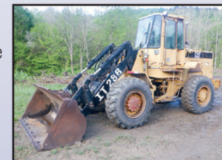
'87 CAT IT28B

1987 CATERPILLAR IT28B Rubber Tired Loader , s/n 5SD00562, Cat 4 cylinder diesel engine and powershift transmission, general purpose loader bucket with bolt-on cutting edge, hydraulic coupler, auxiliary hydraulics, enclosed ROPS cab with heat and air conditioning, and 17.5R25 tires. In good condition with good tires.