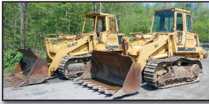
(2) CAT 963'S

1990 CATERPILLAR 963 Crawler Loader , s/n 21Z03023, Cat 3304 diesel engine and hydrostatic transmission, general purpose loader bucket with teeth, enclosed ROPS cab with heat, and 18" DBG pads. In fair to good condition with good undercarriage. (Engine Knock/Bad Wrist Pin)