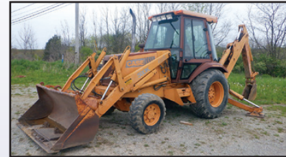
'90 CASE 580K 4X4

1990 CASE 580K, 4x4 Tractor Loader Backhoe , s/n JGG0023814, Case 4 cylinder diesel engine and shuttle transmission, general purpose loader bucket with bolt-on cutting edge, 24" digging bucket, enclosed ROPS cab with heat, 12x16.5 front and 19.5Lx24 rear tires. In good condition with good tires.