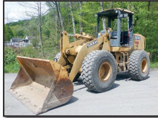
'02 JOHN DEERE 544H

2002 JOHN DEERE 544H Rubber Tired Loader , s/n 583885, JD diesel engine and powershift transmission, general purpose loader bucket with bolt-on cutting edge, WB hydraulic coupler, ROPS canopy, and 20.5R25 tires. In good condition with good tires.