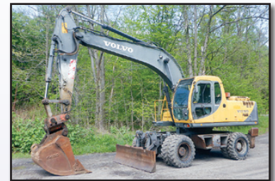
'02 VOLVO EW170