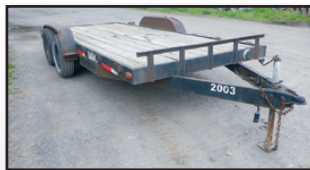
(1) OF (2) '96 JJJ TAG-A-LONGS

(2) 1996 JJJ Tandem Axle Tag-A-Long Trailers , 16' wood deck, 77" deck width, 96" overall width, spring suspension, stake pockets, 7,000# GVWR, and 235/75R15 tires. In good condition with good tires.