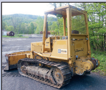
'85 CAT D3B

Tractor , s/n 27Y02934, Cat 4 cylinder diesel engine and powershift transmission, 6 way straight blade, rear hydraulic winch, ROPS canopy, and 16" SBG pads. In good condition with fair to poor undercarriage.