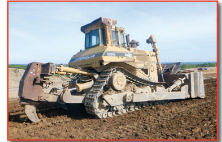
'88 CAT D9N

PRE-SORTED FIRST CLASS MAIL US POSTAGE PAID UPPER DARBY, PA PERMIT #45