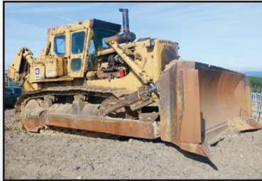
'77 CAT D9H