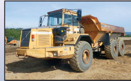
'97 VOLVO A35C

1997 VOLVO A35C, 35 Ton 6x6 Articulated End Dump , s/n A35CV60047, Volvo 6 cylinder diesel engine and 4 speed automatic transmission, lined bed, enclosed ROPS cab with heat and air conditioning, and 26.5R25 tires. In good condition with good tires.