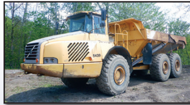
'01 VOLVO A35D

2001 VOLVO A35D, 35 Ton 6x6 Articulated End Dump , s/n A35DV61056, Volvo D12CABE2 diesel engine and 4 speed automatic transmission, lined bed, enclosed ROPS cab with heat and air conditioning, and 26.5R25 tires. In good condition with good tires. (Tailgate Will Be Removed)