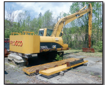
'01 CAT-FROGCO 320CL