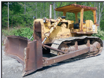
'74 CAT D7F

Tractor , s/n 94N8777, Cat 3306 engine and powershift transmission, U-blade with tilt, draw bar, ROPS canopy, and 22" SBG pads. In good condition with good undercarriage.