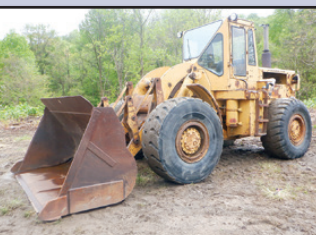
'70 CAT 966C

1970 CATERPILLAR 966C Rubber Tired Loader , s/n 76J4004, Cat 6 cylinder diesel engine and powershift transmission, general purpose loader bucket with weld-on cutting edge, enclosed ROPS cab with heat, and 20.5x25 tires. In good condition with good tires.