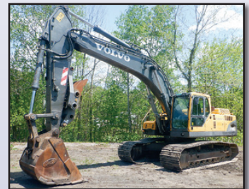
'05 VOLVO EC330BLC