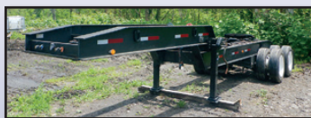
WYNNS WELDING 27' JEEP

WYNNS WELDING 27' Tandem Axle Trailer Jeep , air slide 5th wheel, air ride suspension, and 255/70R22.5 tires. In good condition with good to very good tires.