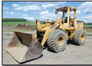
'02 JOHN DEERE 544H

2002 JOHN DEERE 544H Rubber Tired Loader , s/n 585251, JD 6068 diesel engine and powershift transmission, general purpose loader bucket with bolt-on cutting edge, WB hydraulic coupler, ROPS canopy, and 20.5x25 tires. In good condition with very good tires.