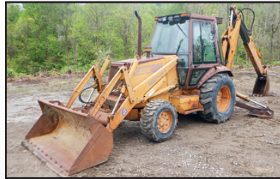
'93 CASE 580SK 4X4

1993 CASE 580 Super K, 4x4 Tractor Loader Extend-A-Hoe , s/n JGG0172613, Case 4 cylinder diesel engine and shuttle transmission, general purpose loader bucket with bolt-on cutting edge, 16" digging bucket, enclosed ROPS cab with heat, 12x16.5 front and 19.5x24 rear tires. In good condition with good tires.