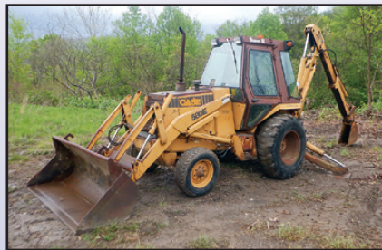
'85 CASE 580SE

1985 CASE 580 Super E Tractor Loader Extend-A-Hoe , s/n 17030942, Case 4 cylinder diesel engine and shuttle transmission, general purpose loader bucket with weld-on cutting edge, 12" digging bucket, removable extend-a-hoe, enclosed ROPS cab with heat, 17.5Lx24 front and 11Lx16 rear tires. In fair condition with good front and poor rear tires.