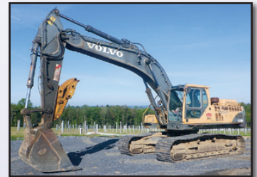
'07 VOLVO EC330BLC