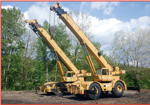
(2) GROVE 50 TON

PRE-SORTED FIRST CLASS MAIL US POSTAGE PAID UPPER DARBY, PA PERMIT #45