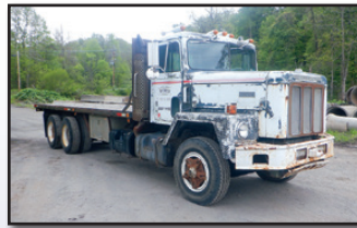
1979 INTERNATIONAL F-5070

1979 INTERNATIONAL F-5070 Tandem Axle Flatbed Truck , Detroit 8V-71 diesel engine and Fuller RTO-12513, 13 speed transmission, 24' wooden flatbed, spring/beam suspension, and 11R24.5 tires. In fair condition with good tires.