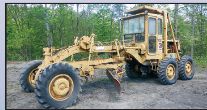
'69 CAT 120

1969 CATERPILLAR 120 Motor Grader , s/n 14K1627, Cat 6 cylinder diesel engine and direct drive transmission, 10' moldboard, front scarifier, ROPS over enclosed cab, and 13.00x24 tires. In fair to good condition with good tires. (Needs New Fuel Tank)