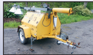
(1) OF (4) WACKER LIGHT PLANTS

(4) WACKER Portable Light Plant , diesel engine, manual raise, (4) lights, and 205/75R16 tires. In good condition with good tires.