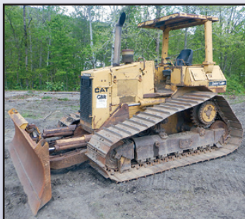
'87 CAT D4H LGP