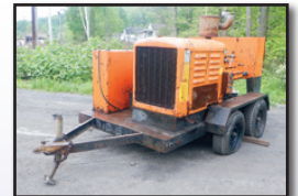
NATIONAL LIQUID 10,000PSI

NATIONAL LIQUID 10150D1 1/4, 10,000PSI Portable Pressure Blaster , s/n 984050, Detroit 8.2L diesel engine and Rockford PTO, 7.00x15 tires. In good condition with poor tires.