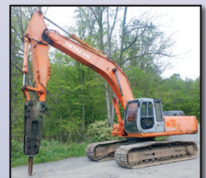
'01 HITACHI EX330LC-5 (HAMMER SOLD SEPARATELY)