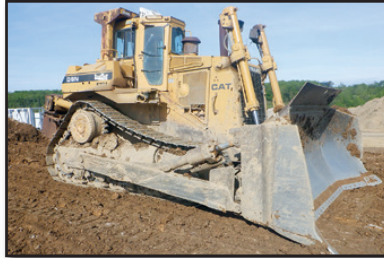
'88 CAT D9N

Crawler Tractor , s/n 1JD01411, Cat diesel engine and powershift transmission, U-blade with left tilt, 4-barrel single shank ripper, s/n 1P800730, with hydraulic pin puller, ROPS over enclosed cab with heat and air conditioning, and 24.5" SBG pads. In good condition with fair undercarriage.