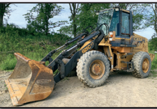
'99 CASE 621CXT

1999 CASE 621CXT Rubber Tired Loader , s/n JEE0093410, Cummins diesel engine and powershift transmission, Bingham general purpose loader bucket with bolt-on cutting edge, ACS hydraulic coupler, enclosed ROPS cab with heat, and 17.5R25 tires. In good condition with good tires.