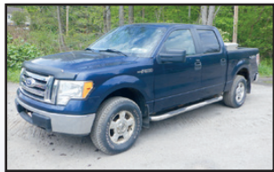
10 FORD F-150XL 4X4

2010 FORD F-150XLT Super Duty 4x4 Crew Cab Pickup Truck , 4.6L gas engine and automatic transmission, 6' bed with liner, cross toolbox, running boards, power windows, locks, mirrors, and seats, leather seats, push button keyless entry, alloy wheels, cruise control, air conditioning, and 265/70R17 tires. In good condition with good tires.