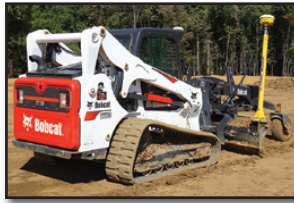
'20 BOBCAT T770 (GPS SOLD SEPARATELY)

2020 BOBCAT Model T770 Crawler Skid Steer Loader , s/n AT6325487, powered by Bobcat diesel engine and 2-speed hydrostatic transmission, equipped with general purpose loader bucket, hydraulic coupler, wired for Trimble GPS, selectable joystick controls, and enclosed ROPS cab with air conditioning. In very good condition with very good tracks. (473 Hours) (GPS Sold Separately)