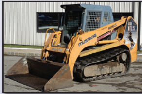
'06 MUSTANG MTL25

2006 MUSTANG Model MTL25 Crawler Skid Steer Loader , s/n 21502653, powered by Yanmar diesel engine and hydrostatic transmission, equipped with general purpose loader bucket, high flow auxiliary hydraulics, hydraulic coupler, and 17.5" rubber tracks. In good condition with very good tracks.