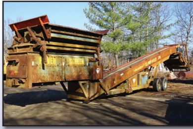
'00 POWERSCREEN COMMANDER 510

2000 POWERSCREEN Model Commander 510 Portable Screening Plant , s/n 5707327, powered by Deutz air cooled diesel engine, equipped with feed hopper with vibrating hydraulic dumping grizzly, under hopper feed conveyor, main feed conveyor, 5' x 10' 2-deck vibrating screen, and (1) 36" x 50' hydraulic radial stacking conveyor, s/n 900003, (1) 24" x 38' hydraulic stacking conveyor, s/n 2409407. In fair to good condition.