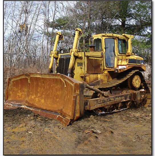
'92 CAT D8N

1992 CATERPILLAR Model D8N Crawler Tractor , s/n 9TC06152, powered by Cat 3406 diesel engine and powershift transmission, equipped with Young semi-U blade with right tilt, rear counterweight with drawbar, enclosed ROPS cab with air conditioning, and 24" SBG pads. In good condition with good undercarriage (sprockets sharp).