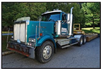
'01 WESTERN STAR 4964EX AND '99 EAGER BEAVER 50 TON

1999 EAGER BEAVER Model 50GSL/3, 50 Ton Tri-Axle Lowboy Trailer , equipped with non-ground bearing detachable gooseneck, wetline, 8'6" x 24' level deck, 11'6" over axles, air ride suspension, 121,000# GVWR, chain dogs, outriggers, and 255/70R22.5 tires. In good condition with fair tires.