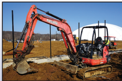
'13 KUBOTA KX040-4

USA 36" Cleanup Bucket (Kubota Mini) • 12" Digging Bucket (Kubota Mini) • ROCKHOUND Brushhound 40EX, 40" Flail Mower (Mini Excavator) • 24" and 12" Digging Buckets (Mini Excavator)