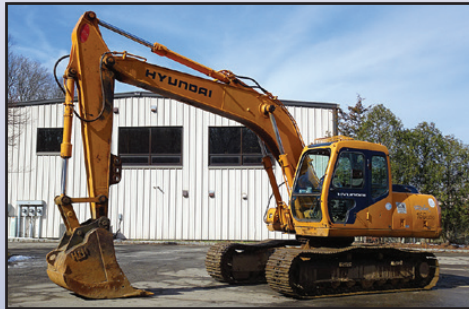
'03 HYUNDAI ROBEX 160LC-3

GEITH Concrete Muncher • LABOUNTY HDR50, 5-Tine Grapple , s/n 50040 • H&H 36" Digging Bucket (Hyundai R160LC-3) • H&H 24" Digging Bucket (Hyundai R160LC-3) • 50" Digging Bucket • 46" Digging Bucket • 36" Digging Bucket • FELCO 24" Digging Bucket (Cat 325C) • BALDERSON 22" Digging Bucket • CF 62" Cleanup Bucket (Cat 325)