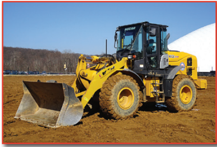
16 KCM 6227