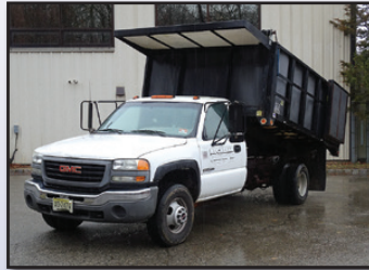
'07 GMC 3500

2007 GMC Model 3500 Dump Truck , powered by Vortec 6.0L gas engine and automatic transmission, equipped with ABC 12' steel/poly dump body with manual tarp, rear swing gate, tow package, dual rear wheels, air conditioning, and 215/85R16 tires. In good condition with good tires. (29,243 Miles) (Cross Braces Under Dump Body Severely Rusted)