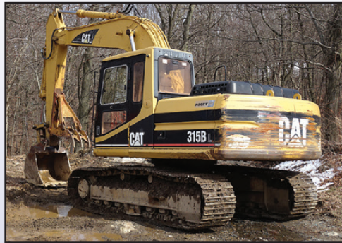
'98 CAT 315BL

1998 CATERPILLAR Model 315BL Hydraulic Excavator , s/n 3AW00887, powered by Cat 3046 diesel engine and hydraulic drive, equipped with 8'6" dipper stick, Cat 48" digging bucket, mechanical thumb, and 23.5" TBG pads. In fair to good condition with good undercarriage.