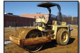
'99 BOMAG BW172D-2

1999 BOMAG Model BW172D-2 Vibratory Compactor , s/n 109520120768, powered by Deutz diesel engine and hydrostatic transmission, equipped with 66" smooth drum, ROPS canopy, and 13-24 tires. In good condition with fair to good tires.