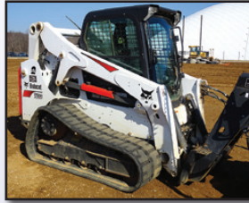
'17 BOBCAT T650

2017 BOBCAT Model T650 Crawler Skid Steer Loader , s/n ALJG20875, powered by Bobcat diesel engine and 2-speed hydrostatic transmission, equipped with hydraulic coupler, auxiliary hydraulics, selectable joystick controls, enclosed ROPS cab with air conditioning, and 18" rubber tracks. In good condition with fair to good tracks. (1,810 Hours)