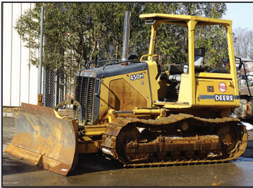
'01 JOHN DEERE 450H LT

2001 JOHN DEERE Model 450H LT Crawler Tractor , s/n 901182, powered by JD diesel engine and hydrostatic transmission, equipped with 6-way straight blade, tow hitch, ROPS canopy, and 16" SBG pads. In good condition with good undercarriage. (03,784 Hours)