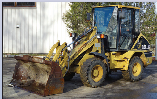
'99 CAT 902

1999 CATERPILLAR Model 902 Rubber Tired Loader , s/n 7ES00306, powered by Cat diesel engine and hydrostatic transmission, equipped with hydraulic right side dump bucket, hydraulic coupler, auxiliary hydraulics, enclosed ROPS cab, and 12.5-18 tires. In fair condition with fair tires.