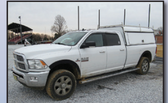
'18 RAM BIG HORN 2500 HD 4X4

2018 RAM Model Big Horn 2500 Heavy Duty 4x4 Crew Cab Pickup Truck , powered by Cummins Turbo diesel engine and automatic transmission, equipped with 8' bed, Leer aluminum utility truck cap, tow package, power package, running boards, air conditioning, and 285/60R20 tires. In good condition with good tires. (80,659 Miles)