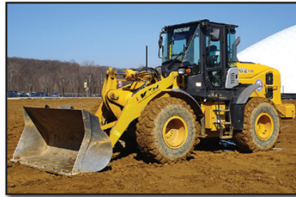
'16 KCM 6227

2005 HYUNDAI Model HL740TM-7 Rubber Tired Loader , s/n LF0210154, powered by Cummins diesel engine and powershift transmission, equipped with general purpose loader bucket with bolt-on cutting edge, hydraulic coupler, enclosed ROPS cab with air conditioning, and 20.5-25 tires. In good condition with good tires. (4,743 Hours)