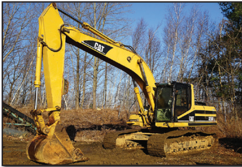
'99 CAT 325BL

1999 CATERPILLAR Model 325BL Hydraulic Excavator , s/n 2JR02280, powered by Cat 3116 diesel engine and hydraulic drive, equipped with 10'6" dipper stick, Cat 48" digging bucket, thumb bracket, enclosed ROPS cab with air conditioning, and 31.5" TBG pads. In fair to good condition with fair to good undercarriage.