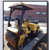
'03 CAT CB-334D

2003 CATERPILLAR Model CB-334D Vibratory Roller , s/n DCZ00219, powered by Cat diesel engine and hydrostatic transmission, equipped with 49.5" smooth drums, drum cleaner, water system, and ROPS post with canopy. In good condition. (04,073 Hours)