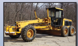
JOHN DEERE 770

JOHN DEERE Model 770 Articulated Motor Grader , s/n 003795T, powered by JD diesel engine and powershift transmission, equipped with 12' hydraulic moldboard, front scarifier (no shanks), enclosed ROPS cab (missing door), and 14.00-24 tires. In fair condition with good tires.