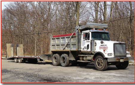
02 WESTERN STAR AND 20 CAM SUPERLINE

1440 COWPATH RD. • HATFIELD, PA 19440 215/361-9099 • Fax: 215/361-9212 www.hunyady.com