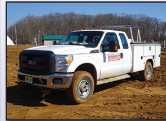
'15 FORD F-350 SD 4X4

2015 FORD Model F-350 Super Duty 4x4 Extended Cab Utility Truck , powered by 6.2L gas engine and automatic transmission, equipped with Knapheide 9' open utility body, plow frame, ladder rack, fuel tank with pump, tow package, running boards, CD player, cruise control, air conditioning, and 275/70R18 tires. In good condition with good tires. (73,256 Miles)