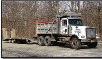
'02 WESTERN STAR AND '20 CAM SUPERLINE

2002 WESTERN STAR Tandem Axle Dump Truck , powered by Cat C-15, 475HP diesel engine and Eaton Fuller 8LL, 10 speed transmission, equipped with 52,000# rears and 14,600# front axle, Beau-Roc 14'6" steel dump body with electric tarp, spring/walking beam suspension, 3-stage engine brake, tow package with air, power passenger window, heated mirrors, cruise control, air conditioning, and 12R24.5 tires. In good condition with good tires. (311,293 Miles) (Dump Body Floor Rough)