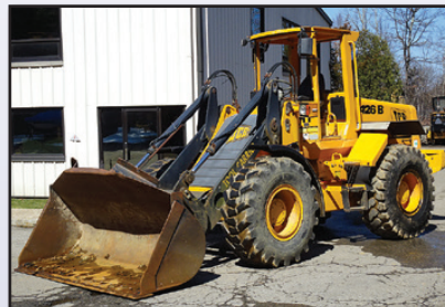
'98 JCB 426B

1998 JCB Model 426B Rubber Tired Loader/Tool Carrier , s/n 0531531, powered by Perkins diesel engine and powershift transmission, equipped with general purpose loader bucket, hydraulic coupler, auxiliary hydraulics, ROPS canopy, and 20.5-25 tires. In fair to good condition with (2) very good and (2) fair tires.