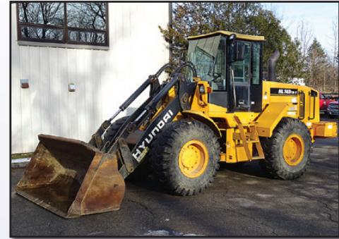
'05 HYUNDAI HL740TM-7

2005 HYUNDAI Model HL740TM-7 Rubber Tired Loader , s/n LF0210154, powered by Cummins diesel engine and powershift transmission, equipped with general purpose loader bucket with bolt-on cutting edge, hydraulic coupler, enclosed ROPS cab with air conditioning, and 20.5-25 tires. In good condition with good tires. (4,743 Hours)