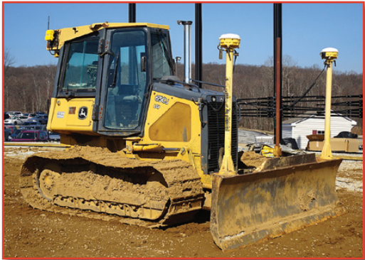
05 JOHN DEERE 650J LGP (GPS SOLD SEPARATELY)

PRE-SORTED FIRST CLASS MAIL US POSTAGE PAID UPPER DARBY, PA PERMIT #45