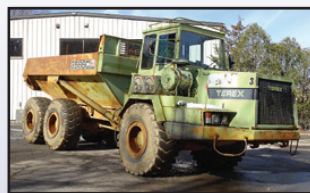
'96 TEREX 2566C

1996 TEREX Model 2566C, 25 Ton, 6x6 End Dump , s/n A5361006, powered by Cummins diesel engine and powershift transmission, equipped with supplemental steering, air conditioning, and 23.5-25 tires. In fair condition with fair tires.