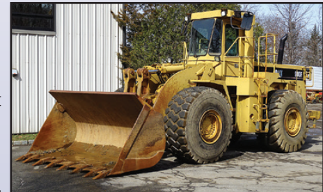
'94 CAT 980F

1994 CATERPILLAR Model 980F Rubber Tired Loader , s/n 8CJ01381, powered by Cat 3406 diesel engine and powershift transmission, equipped with general purpose loader bucket with teeth, ROPS over enclosed cab, and 29.5R25 tires. In good condition with very good front and good rear tires.