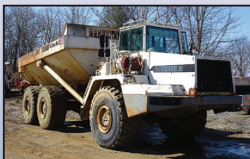
'98 TEREX 4066C

1998 TEREX Model 4066C, 40 Ton, 6x6 End Dump , s/n A7221004, powered by Detroit Series 60 diesel engine and powershift transmission, equipped with 26.5R25 tires. In fair condition with fair to good and (2) very good tires.