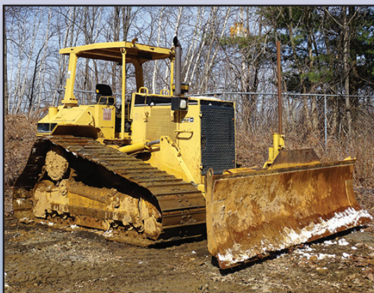
'99 CAT D6M LGP

1999 CATERPILLAR Model D6M LGP Crawler Tractor , s/n 4JN01572, powered by Cat 3116 diesel engine and powershift transmission, equipped with 6-way straight blade, drawbar, fingertip controls, ROPS canopy, and 34" SBG pads. In good condition with good undercarriage.