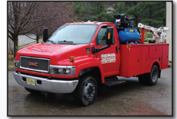
'05 GMC C4500

2005 GMC Model C4500 Single Axle Service Truck , powered by Duramax diesel engine and automatic transmission, equipped with 11' open service body, Liftmoore 2700AR, 2,700# service crane with manual extension, Miller Legend NT welder, s/n LA348997 (0,335 hours), fuel tank with pump and reel, Emglo gas air compressor with hose reel, 13,500# rear and 7,000# front axle, dual rear wheels, tow package, air conditioning, and 225/70R19.5 tires. In good condition with good tires. (80,101 Miles)