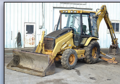
'98 CAT 416C, 4X4 E-HOE

1998 CATERPILLAR 416C, 4x4 Tractor Loader Extend-A-Hoe , s/n 5YN03822, Cat diesel engine and shuttle transmission, equipped with general purpose loader bucket with bolt-on cutting edge, 24" digging bucket, Wain Roy rear manual coupler, enclosed ROPS cab with heat and air conditioning, 12.5/80-18 front and 19.5Lx24 rear tires. In fair to good condition with good tires.