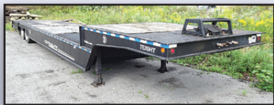
'15 DAKOTA TRAIL-EZE 40 TON

2015 DAKOTA TRAIL-EZE TE80HT, 40 Ton Tandem Axle Hydraulic Tail Trailer , equipped with 9'9" upper deck, 30" stationary deck, 8' hydraulic tail section with 4' flip tail, 102" width, 96,540 lb GVWR, 12,000 lb hydraulic winch, air ride suspension, chain dogs, and 255/70R22.5 tires. In good condition with good tires. (Reconstructed Title)