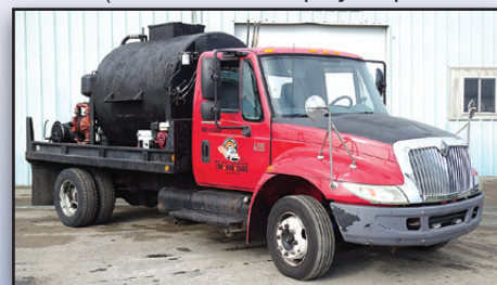
'08 INTERNATIONAL 4300 WITH SEAL RITE TANK

2008 INTERNATIONAL 4300 Seal Truck , International DT466 diesel engine and automatic transmission, equipped with Seal Rite 1,000 gallon seal tank with agitator, Wilden 2" double diaphragm pump, manual hose reel, gas air compressor, worker platform, 23,500# GVWR, power windows and locks, power heated mirrors, air conditioning, and 245/70R19.5 tires. In good condition with good tires.