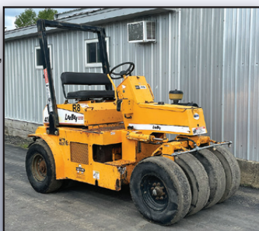
'05 LEEBOY 420

Tandem Vibratory Roller , s/n 49418, Deutz air cooled diesel engine and hydrostatic transmission, equipped with 47" smooth drums, variable frequency vibration, and water system. In good condition. (02,771 Hours)