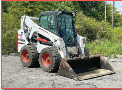
'17 BOBCAT S650

1440 COWPATH RD. • HATFIELD, PA 19440 215/361-9099 • Fax: 215/361-9212 www.hunyady.com