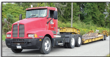
'03 KENWORTH T600 & '88 EAGER BEAVER 25 TON (SOLD SEPARATELY)

2003 KENWORTH T600 Tandem Axle Truck Tractor , Cat C-12, 425HP diesel engine and Fuller 10 speed transmission, equipped with wetline, 38,000 lb rears, 10,000 lb front axle, 48,008 lb GVWR, 169" wheelbase, air slide 5th wheel, single frame, tailboard ramp, air ride suspension, power windows, power heated mirrors, cruise control, and 295/75R22.5 tires. In good condition with good tires.