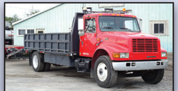
'98 INTERNATIONAL 4900

1998 INTERNATIONAL 4900 Single Axle Flatbed Dump Truck , IHC DT466E, 250HP diesel engine and 6 speed transmission, equipped with 15' x 8.6" steel dump body with removable sides, (2) telescopic lift hoists, 8' custom built removeable dovetail with ramps, double frame, 75 gallon off road diesel tank with electric pump, air brakes, 33,000# GVWR, toolboxes, 11R22.5 front and 275/70R22.5 rear tires. In good condition with very good tires. (Reconstructed Title)