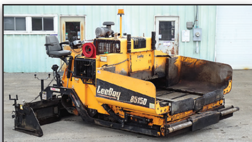
'16 LEEBOY 8515D

2016 LEEBOY 8515D Crawler Paver , s/n 149708, Kubota diesel engine and hydraulic drive, equipped with 8' to 15' electric heated vibratory screed, auto slope and grade and wash down system. In good condition with good undercarriage. (2,599 Hours)