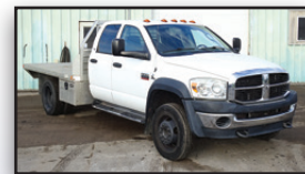
'08 RAM 5500HD SLT

SALT DOGG 8' Stainless Steel V-Box Salt Spreader , 1 cylinder gas • SNOW DOGG VX85 V-Plow , with mount (No Truck Bracket) • SALT DOGG Electric Receiver Mount Poly Salt Spreader