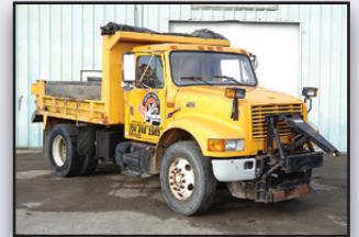
'00 INTERNATIONAL 4900

2000 INTERNATIONAL 4900 Single Axle Dump Truck , International DT466E diesel engine and automatic transmission, equipped with 9' steel landscape dump body with wooden sideboards, 10" apron, aluminum tailgate, and manual tarp, tow package with electric, front plow frame, cruise control, and 11R22.5 tires. In good condition with good tires.