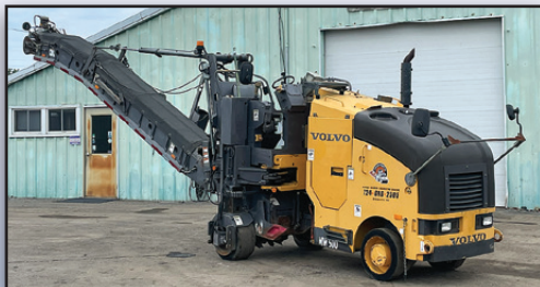
'09 VOLVO MW500

2009 VOLVO MW500 Milling Machine , s/n 22948, Deutz liquid cooled, 127HP diesel engine and hydraulic drive, equipped with 19.5" cutting drum, enclosed hydraulic raise and swing discharge conveyor, all wheel drive, and 560/410-270 solid tires. In good condition with good tires. (748 Hours)