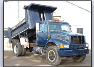
'99 INTERNATIONAL 4700

1999 INTERNATIONAL 4700 Single Axle Dump Truck , International DT466E diesel engine and Allison automatic transmission, equipped with Lanau 9'6" steel dump body with chute and manual tarp, air gate, 35,000# GVWR, single stage engine brake, cruise control, and 11R22.5 tires. In good condition with good front and poor rear tires.