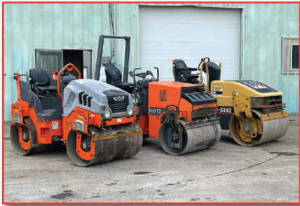
(3) VIBRATORY ROLLERS

PRE-SORTED FIRST CLASS MAIL US POSTAGE PAID UPPER DARBY, PA PERMIT #45