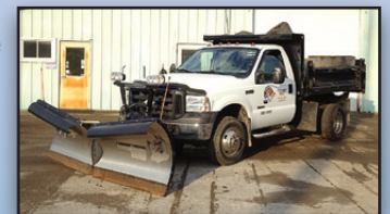
'07 FORD F-350XL 4X4

2007 FORD F-350XL Super Duty 4x4 Dump Truck , Powerstroke diesel engine and automatic transmission, equipped with Air Flo 9' steel mason dump body with drop down sideboards, Snow Dogg VXF95II V-plow, dual rear wheels, tow package, air conditioning, and 245/75R17 tires. In good condition with good tires.