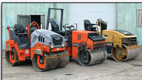
(3) VIBRATORY ROLLERS

2016 HAMM HD12VV Tandem Vibratory Roller , s/n H2300608, Kubota D1703 diesel engine and hydrostatic transmission, equipped with 47" smooth drums, variable frequency vibration, and water system. In good condition. (1,989 Hours)