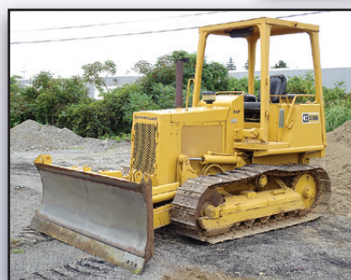
'83 CAT D3B

1983 CATERPILLAR D3B Crawler Tractor , s/n 27Y01964, Cat 3204 diesel engine and powershift transmission, equipped with 6-way blade with root rake ears, ROPS canopy, and 16" SBG pads. In good condition with good undercarriage.