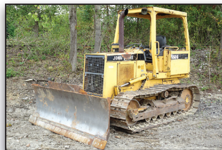
'95 JOHN DEERE 650G SERIES IV

1995 JOHN DEERE 650G Series IV Crawler Tractor , s/n 811535, JD diesel engine and powershift transmission, equipped with 6-way straight blade, tow pin, ROPS canopy, and 18" SBG pads. In good condition with poor undercarriage (pads good).