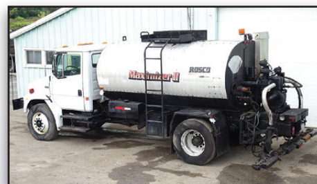
'99 FREIGHTLINER FL70 WITH ROSCO MAXIMIZER II

1999 FREIGHTLINER FL70 Single Axle Asphalt Distributor Truck , Cummins diesel engine and 5 speed transmission with 2 speed rear, equipped with Rosco Maximizer II, 1,900 gallon hydrostatic distributor body, s/n 35662, 8' spray bar with 2" hydraulic folding wings to 12', dual burners, and 11R22.5 tires. In good condition with good tires. (Rebuilt Tack Pump by Stephenson Equipment)