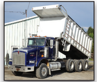
'06 KENWORTH T800

2006 KENWORTH T800 Tri-Axle Dump Truck , Cat C-15, 475HP diesel engine and Fuller 13 speed transmission, equipped with J&J 19'6" aluminum dump body with chute and electric tarp, 46,000 lb rears, 20,000 lb front axle, 20,000 lb lift axle, 86,000 lb GVWR, aluminum wheels, 3-stage engine brake, power heated mirrors, cruise control, air conditioning, 385/65R22.5 front and lift, and 11R24.5 rear tires. In good condition with good tires. (7,000 Miles on Rebuilt Transmission)