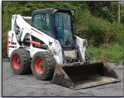
'17 BOBCAT S650

2017 BOBCAT S650 Skid Steer Loader , s/n ALJ819110, Bobcat 4 cylinder diesel engine and 2 speed hydrostatic transmission, equipped with 73" general purpose loader bucket with bolt-on cutting edge, Bob-Tach hydraulic coupler, high flow auxiliary hydraulics, selectable joysticks, RC ready, enclosed ROPS cab, and 12x16.5 tires. In good condition with good tires. (Meter Reads 2,306 Hours)