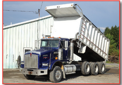
'06 KENWORTH T800

PRE-SORTED FIRST CLASS MAIL US POSTAGE PAID UPPER DARBY, PA PERMIT #45