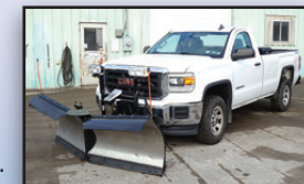
'15 GMC SIERRA 1500 4X4